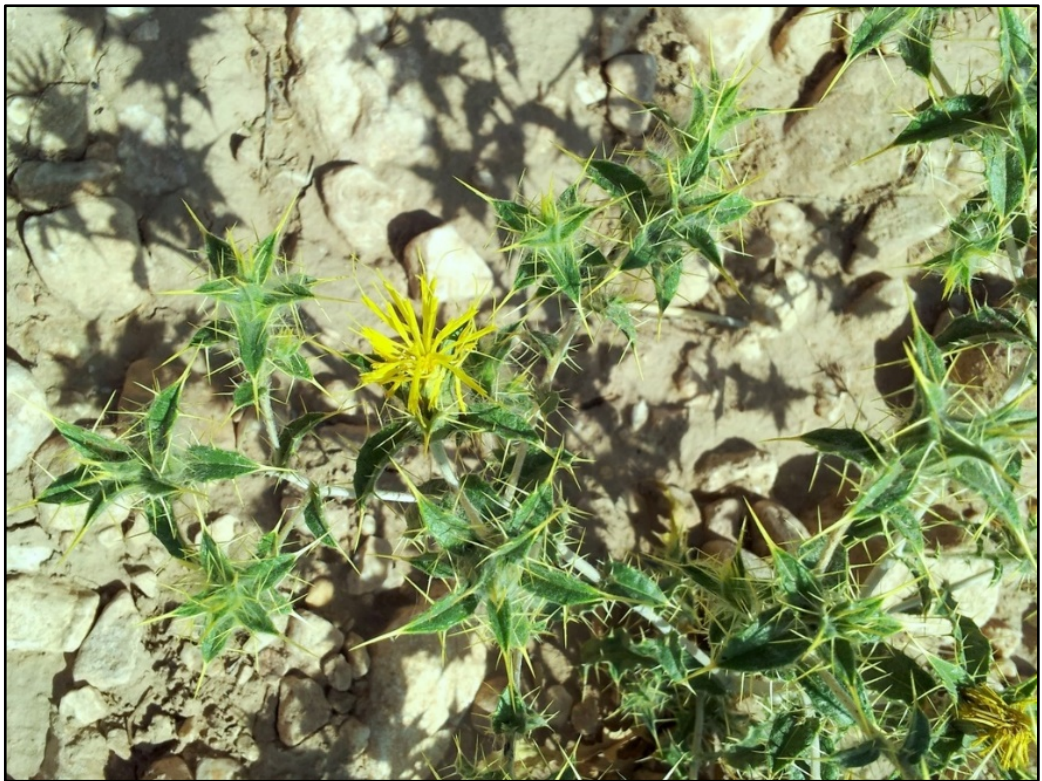
Carthamus oxyacantha