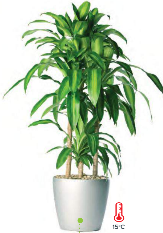
Dracaena fragrans "Massangeana" (Touffe)