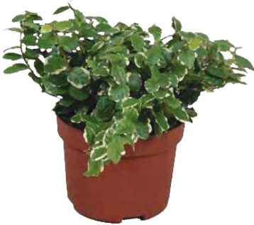
Ficus pumila "White Sunny"