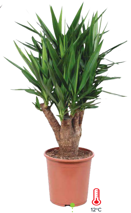
Yucca elephantipes (Branched)