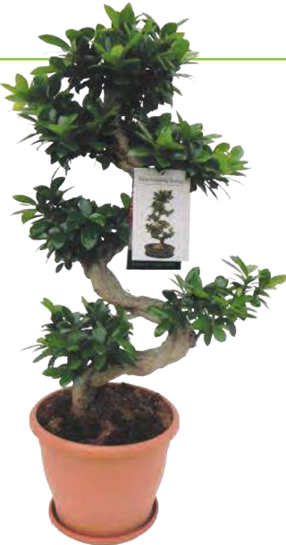
Ficus Microcarpa Ginseng