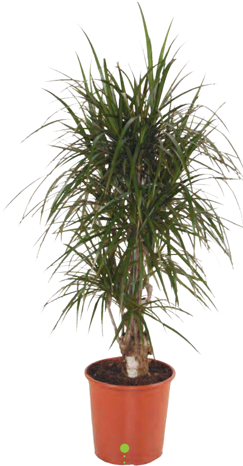
Dracaena marginata (Branched)

Dracaena is a genus of forty species of subtropical, evergreen, woody plants grown for their statuesque form and ornamental foliage. Sometimes mistakenly identified as palms they are more closely related to lilies. The name Dracaena is derived from the Greek word "drakaina", a female dragon. The link being the resinous red gum produced when the stem is cut which, when thickened, resembles dragon's blood.