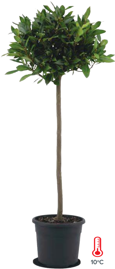
Laurus nobillis April-June