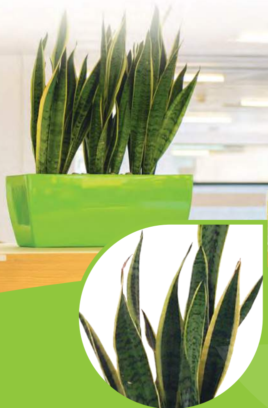
Sansevieria trifasciata "Laurentii"