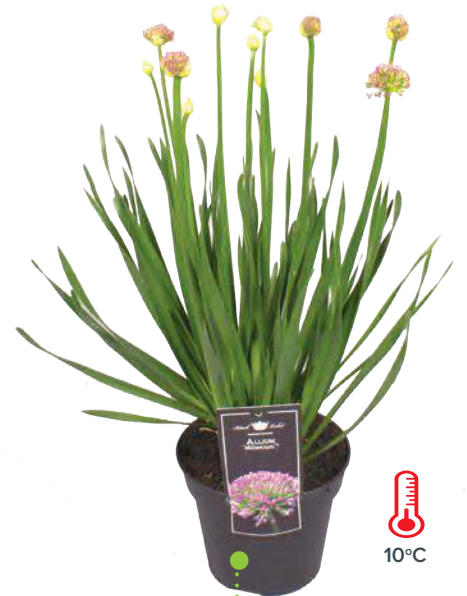
Allium angulosum (Onion grass) April-June