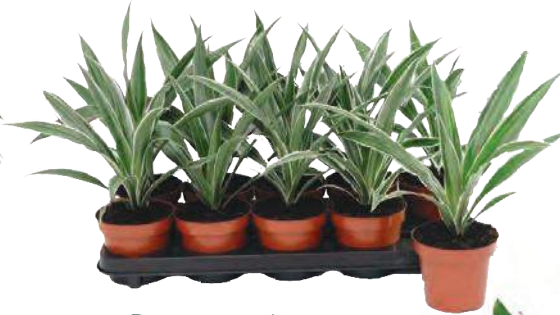
Dracaena deremensis "Warneckeii"