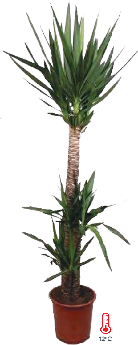
Yucca elephantipes (Touffe)