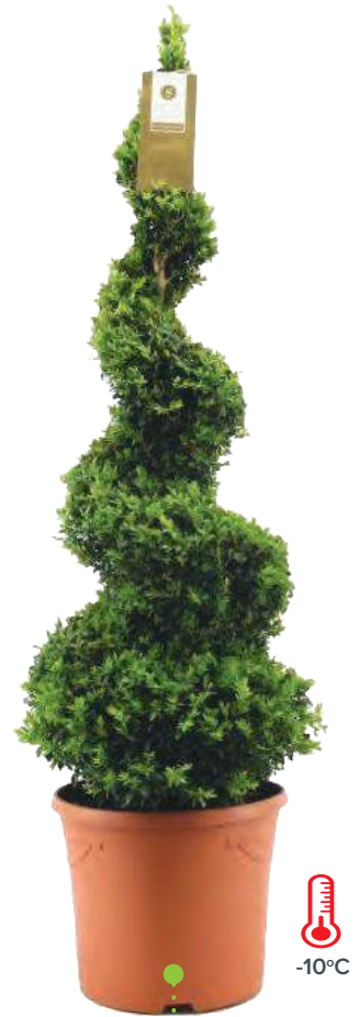
Buxus sempervirens "Spiral"