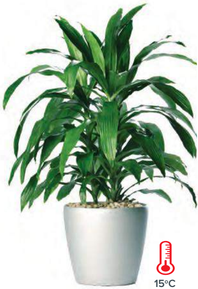
Dracaena deremensis "Janet Craig" (Branched)