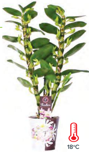
Dendrobium nobile "Star Class Sea Mary"