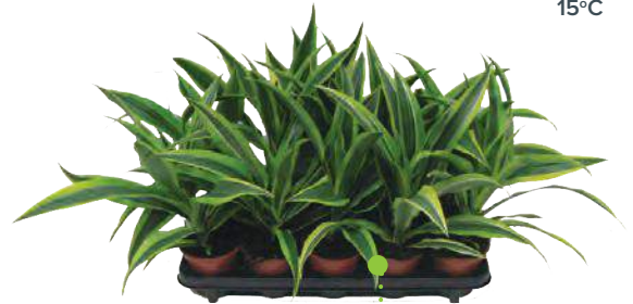
Dracaena fragrans "Lemon Lime" (Tipped)