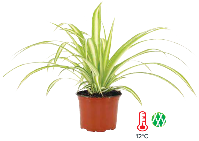
Chlorophytum comosum vittatum (Spider plant)