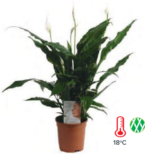
Spathiphyllum "Sweet Chico"