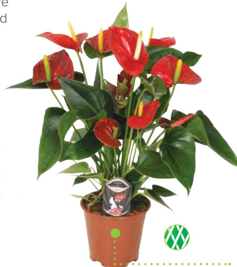
Anthurium andreaeanum “Diamond Red”