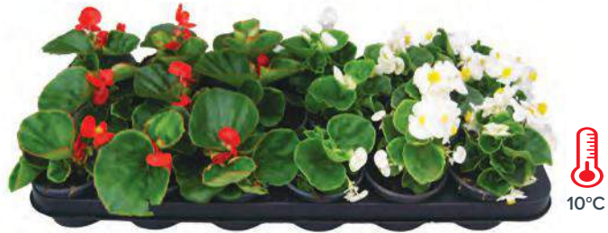
Begonia tuberhybrida April-June

First impressions count. So make a strong, positive statement about your business and make your premises look inviting from the outside. Ambius isn't only limited to designing inspiring interior spaces. We specialise in exterior planting designs too. So whether it's built in beds or window boxes at your front entrance or a large open space, using a range of colourful and seasonal planting, we can help you to welcome colleagues and customers inside.