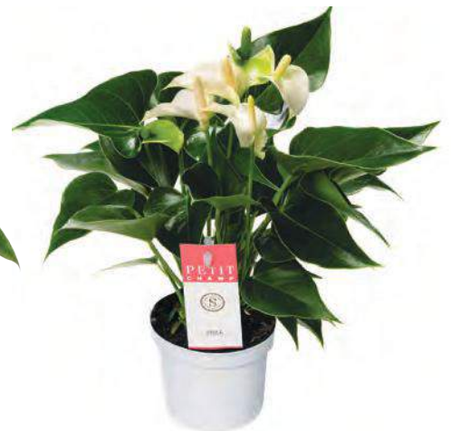
Anthurium andreaeanum “White Champion”