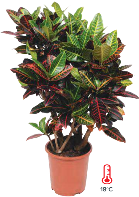
Codiaeum variegatum "Petra"