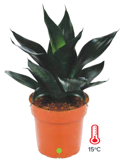
Sansevieria "Black Dragon"