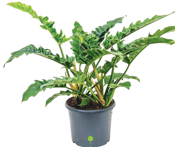
Philodendron "Narrow Escape"