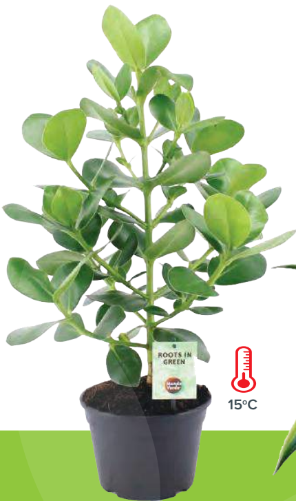
Clusia rosea "Princess"