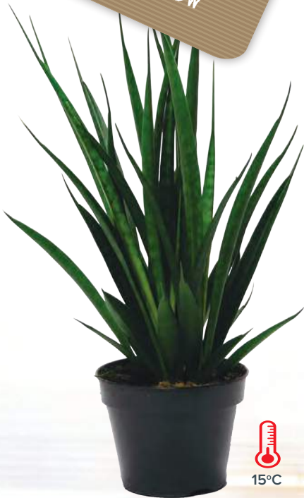
S. kirkii "Friends"