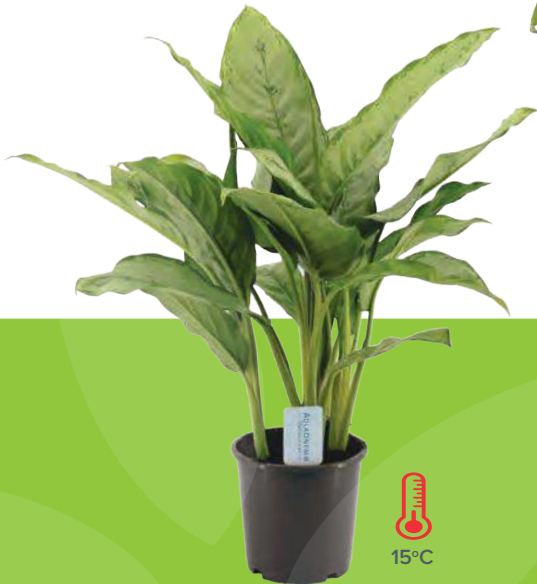
Aglonema "BJ Freeman"