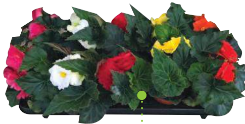
Begonia semperflorens April-June