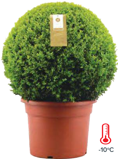
Buxus sempervirens "Ball"

Buxus, commonly known as Box or Boxwood, is a slow-growing evergreen shrub, compact with small, leathery, opposite leaves, and small, yellowish flowers. Native to Europe, Asia, South America, Central America and Africa, Buxus is a genus of approx 70 species and commonly grown for hedges and topiary. Only the European, and some Asian species, are tolerant of frost.