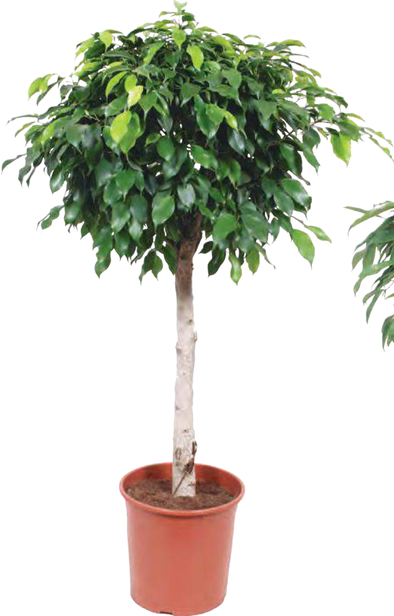
Ficus benjamina (columnar)