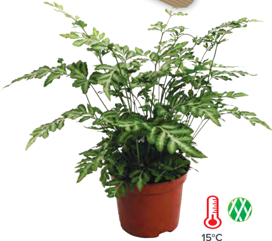
Pteris ensiformis "Evergemeiensis"