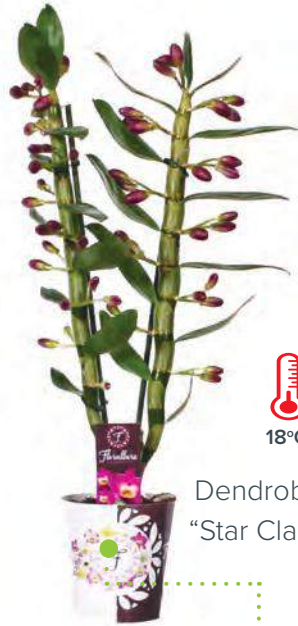
Dendrobium nobile "Star Class Akatsuk"