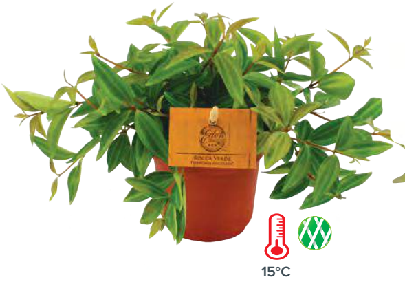
Peperomia angulata "Rocca Verde"