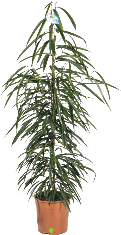
Ficus binnendijkii "Alii"