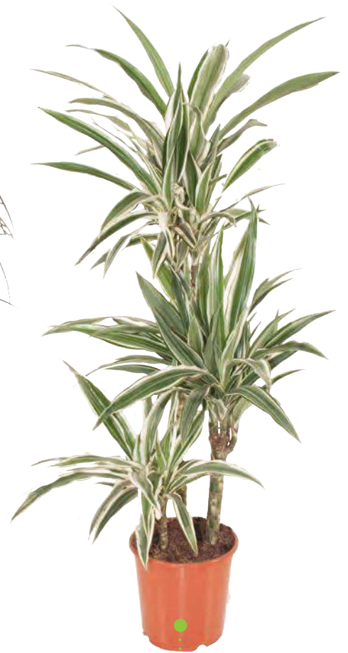
Dracaena fragrans White Stripe