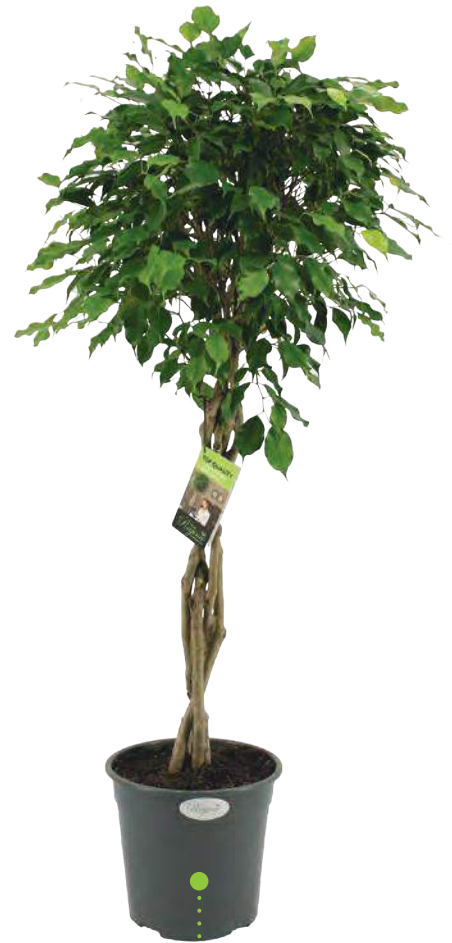
Ficus benjamina (Braided Stem)