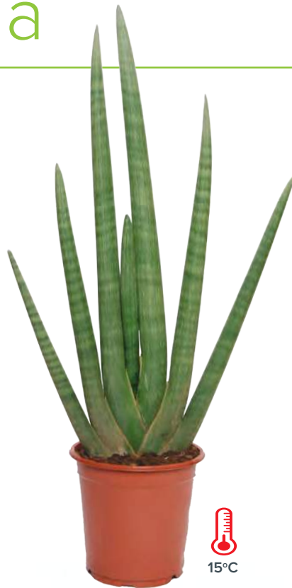
Sansevieria cylindrica "Handshake"