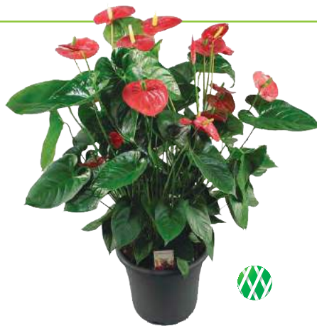
Anthurium andreaeanum “Turenza”

Also known as the Flamingo flower, Anthuriums grow wild in the tropical rain forests of Central and South America. The exotic flowers, with their large waxy “palettes” and coloured “tails”, have given rise to the word “Anthurium”, which is derived from the Greek “anthos”, a flower and “oura”, a tail. The link with flamingos is rather more tenuous, referring as it does to the “curved neck” and appearance of the spadix.