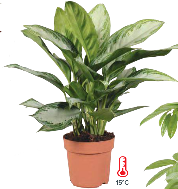
Aglonema "Silver Bay"