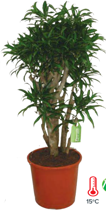
Dracaena reflexa "Song of Jamaica"