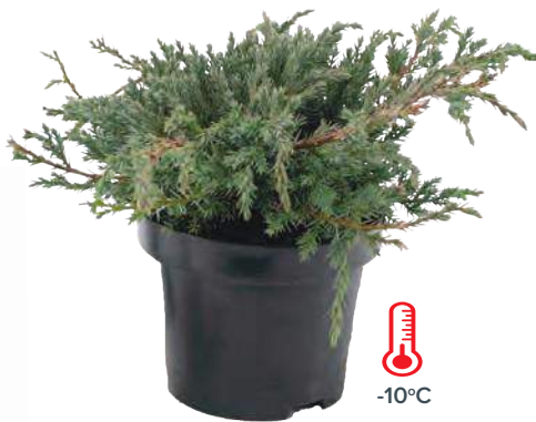
Juniperus squamata "Blue Carpet"