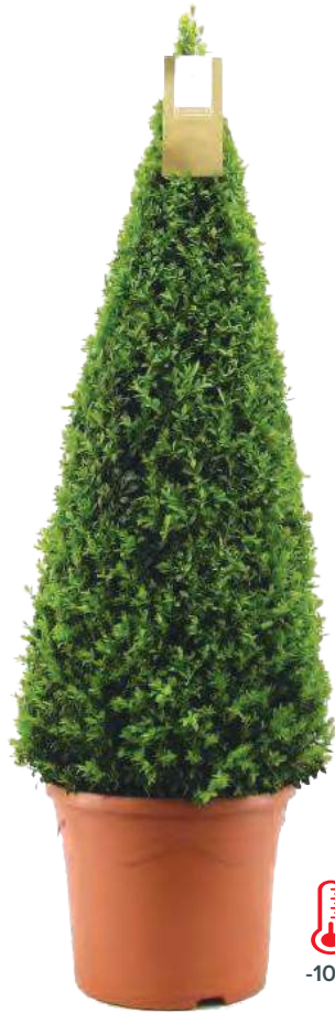
Buxus Sempervirens "Pyramid"