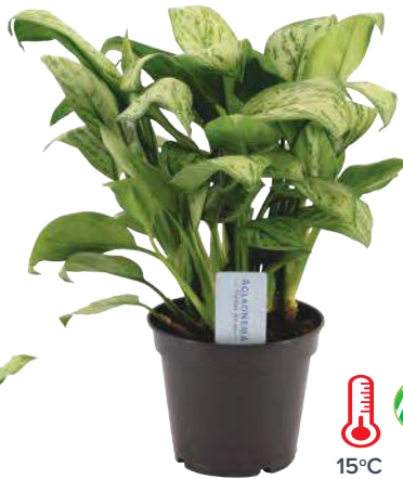
Aglonema "Maria Christina"