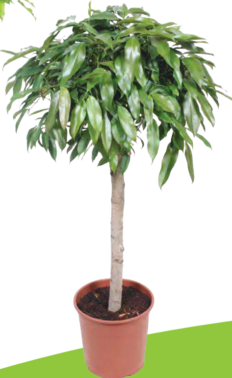
Ficus binnendijkii "Amstel King"