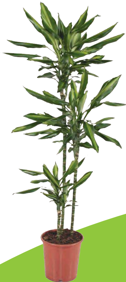
Dracaena fragrans "Cintha"