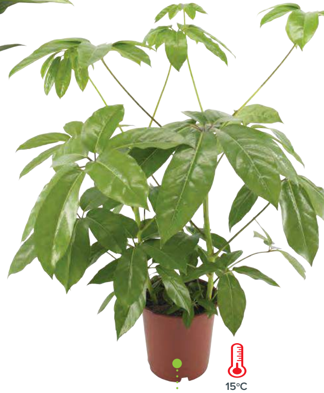
Schefflera actinophylla "Emerald Green"