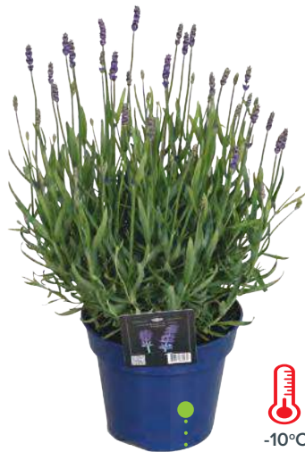
Lavandula angustifolia "Elegance Purple"