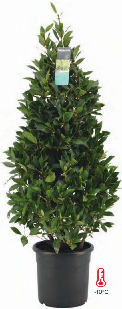
Laurus nobilis "Pyramid"