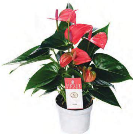
Anthurium andreaeanum “Pink Champion”