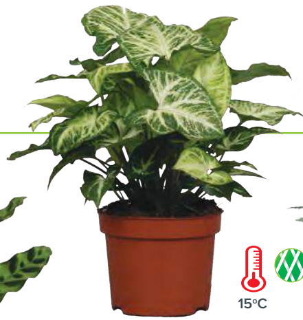
Syngonium podophyllum "Arrow"