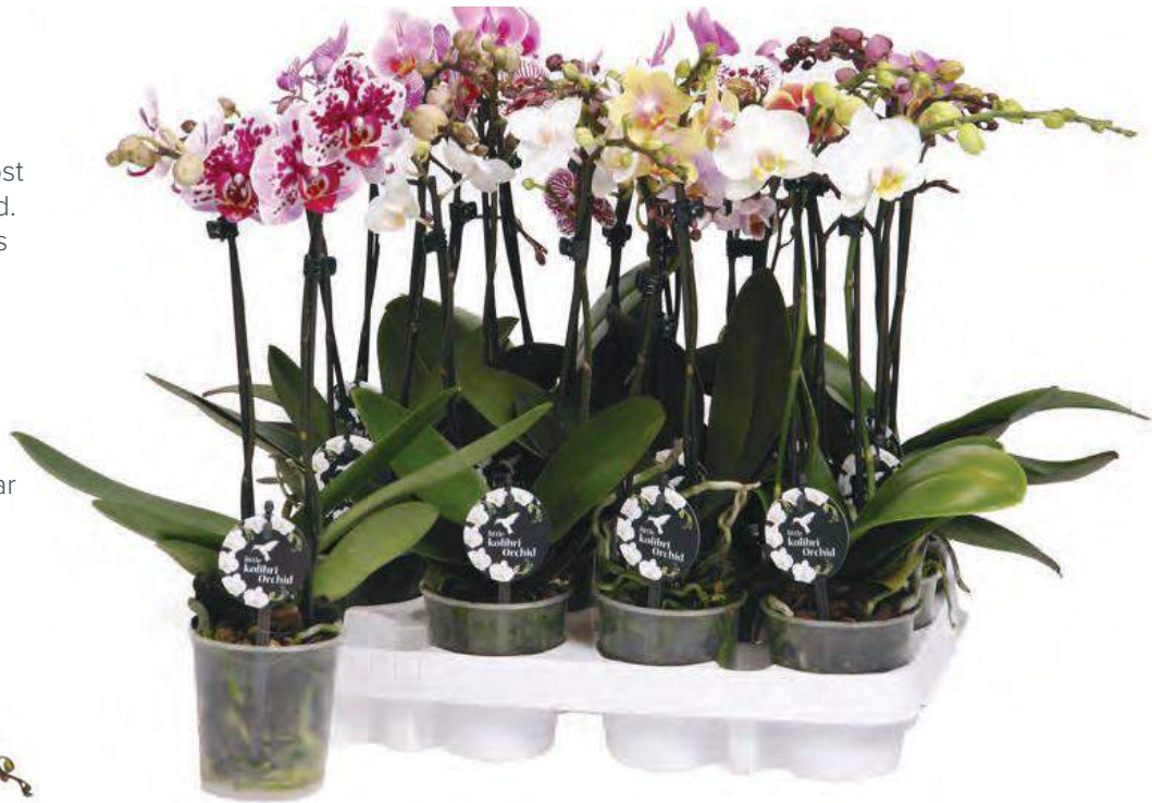
Phalaenopsis Orchid Kolibri Mix

The orchid family is the largest, most diverse group of plants in the world. Species are found on all continents except Antarctica, they range in habitat from fields to tree-tops, from the temperate climates of Northern Europe to the tropical heat of the Malaysian rainforests. Recent advances in tissue culture techniques has made some popular ornamental species, such as Phalaenopsis and Dendrobium very easy to grow and care for.