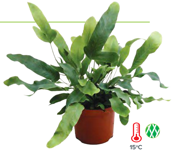
Phlebodium Aureum Blue Star