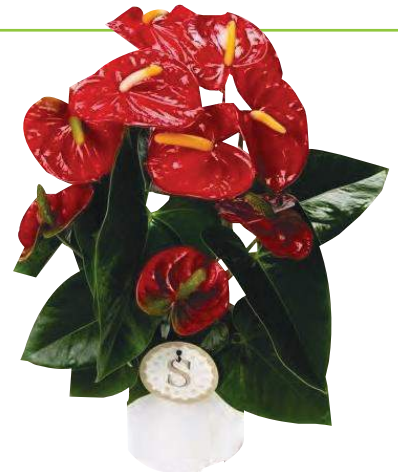
Anthurium andreaeanum “Royal Champion”