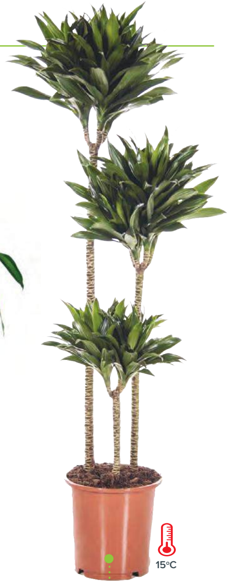
Dracaena deremensis "Janet Craig Compacta"