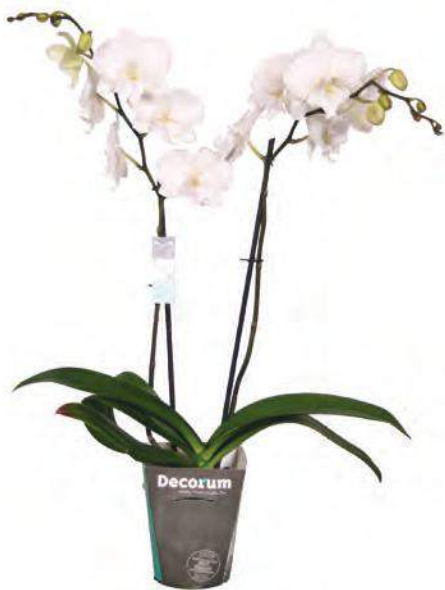
Phalaenopsis Orchid Grandiflora