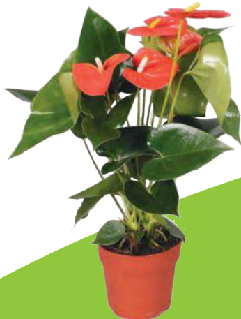
Anthurium andreaeanum “Orange Champion”