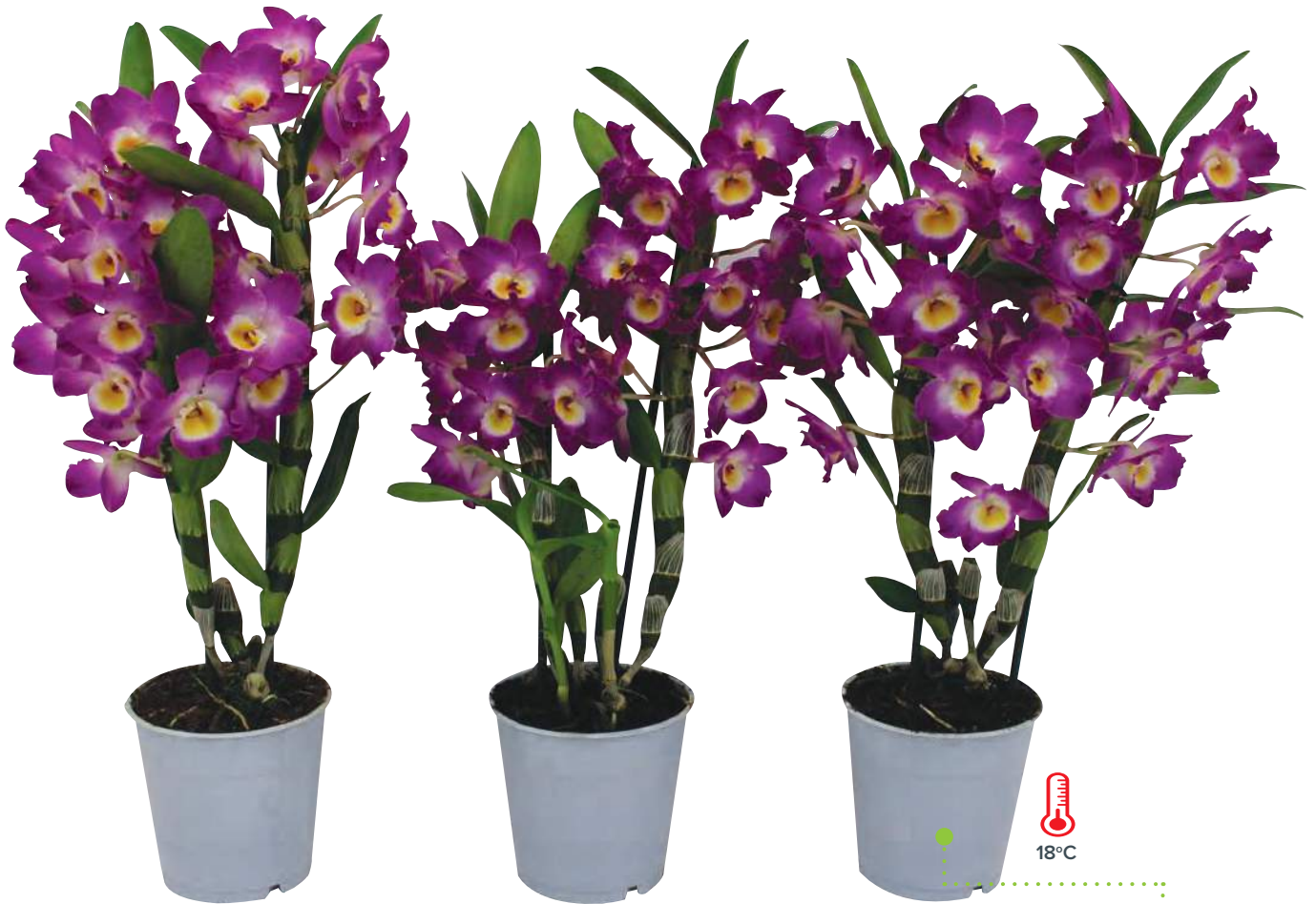
Dendrobium nobile "Apollon"