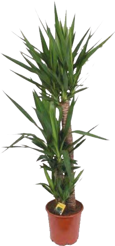
Yucca elephantipes (Touffe)