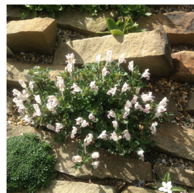
Armeria juniperifolia 'Bevans variety'

So the work began to lay the rock in place. I had asked Yorkstone to provide rock no more than 2" thick, to save me having to spend many hours with hammer and bolster chisel. Because I was building the garden on a raised wall I secured the perimeter rocks with a coloured cement. The rock in each row is more or less the same width along its length, but the width of rock in each row varies. Because of the economy described earlier, the rock is only 6" to 9" deep, but it looked okay, and when plants grow over it serves the purpose well enough.