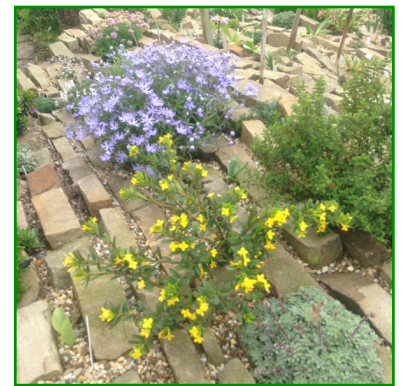
Daphne calcicola and phlox

for the space I had allowed it. (Had to take some of it out). As has Hypericum olympicum (grown from seed) - its far too big really but I think I will cut it down to its base and hope it grows less vigorously in future. A Daphne calcicola is doing well. Several dianthus put on a good display last summer, and will need to be contained within their allotted space. Gentian acaulis group are difficult for us, and they take time to settle in, but they are looking promising for now. Zauschneria 'Pumilio' was a good trailing plant throughout last Summer with its showy bright red tubular flowers. We are particularly pleased with the success of porphyry section saxifrages and the hybrids, and silver saxifrages are fairly easy. Several Lewisia cotyledons have survived a couple of winters.