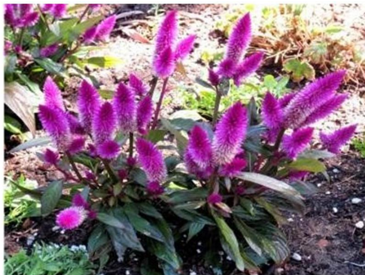
Figure 5. Celosia spicata L.

This specie is a tall, upright plant with reddish purple foliage and eye-catching dark-pink, soft-pink terminal flower spikes that turn to white as they mature. It grows up to 81.3 cm in height and is considered a weed in some regions of the world, but eaten as a vegetable in Africa. C. spicata L. is known as a leafy vegetable in south western part of Nigeria [59], and is one of the most popular cut flowers for dried, everlasting floral arrangements. It occurs in tropical Africa and humid areas. Its common names include wheat straw, Flamingo feather in English, Sufaid murghu in Hindi.