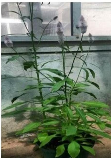
Figure 4. Celosia isertii L. Source: grown in Botany department greenhouse, University of Fort Hare, South Africa.

C. isertii L. is found in Senegal, Cameroun across central Africa to Tanganyika, Southern part of Nigeria, Fernando Po, Angola and Zambia. Common names are Celosia laxa , Fula-Fulfulde, bukan gida in Nigeria (Adamawa), Manding-Mandinka furaynamo in Gambia, Mende gimbei in Sierra Leone.