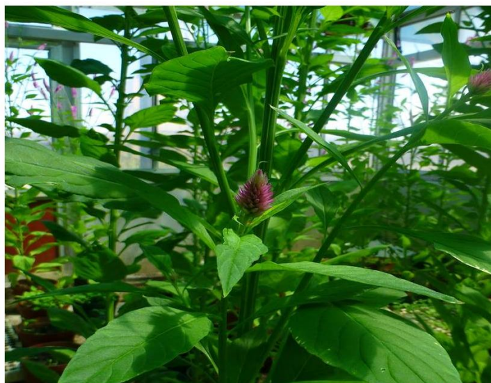
Figure 2. Celosia argentea L.