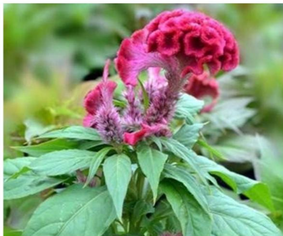
Figure 3. Celosia cristata L.