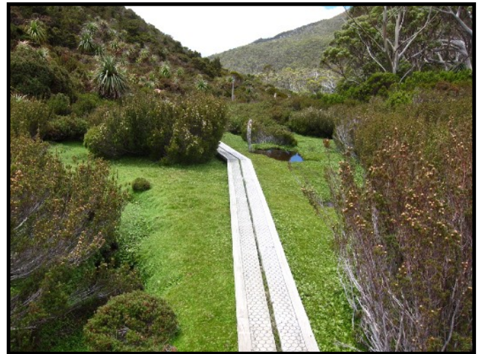
A "marsupial meadow" in the subalpine of Mt. Rufus

All along the trail Tasmania's importance as a refuge for Australian wildlife is made apparent by the abundance of bizarrely cube shaped wombat droppings. The grazing of these large, squat marsupials plays an important role in shaping these high elevation plant communities, much like marmots in the Northern Hemisphere. Their activities maintain large golf green like openings in the shrub layer that an Aussie friend referred to as "marsupial meadows".