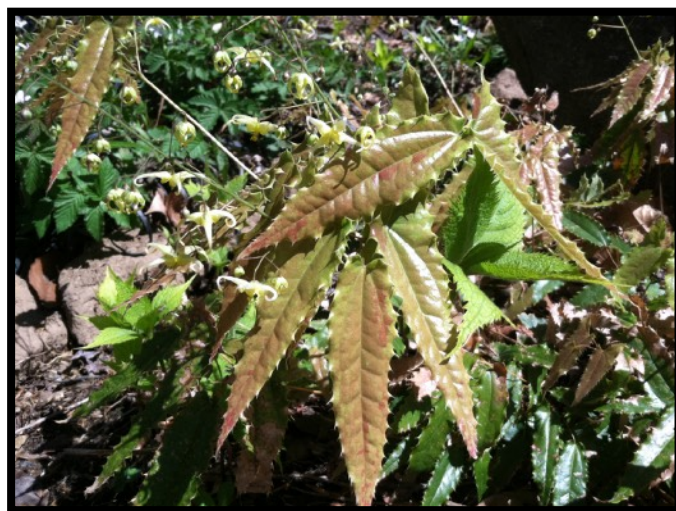
Epimedium 'Spine Tangler' has notable spines along the margin.

Leaflet size varies from species to species, with some selections of E. grandiflorum having leaflets but a centimetre in length, while those of E. wushanense which can exceed 25 cm long. Most fall somewhere between five and 15 cm. Leaf margins are occasionally entire, though more frequently display small, stiff spines, occasionally to great aesthetic appeal. While visually striking, a mature clump of E. ilicifolium may actually hurt quite a bit as the foliage hardens off by mid-