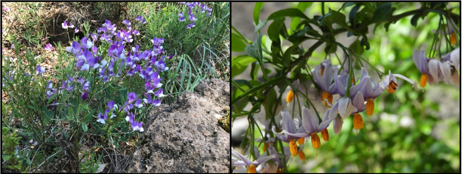
Lathyrus nervosus (left) and Solanum valdiviense (right), growing in Conguillio National Park.

During the last two days of riding we entered the Conguillio National Park with its massive lava and ash field below the volcano Llaima. While only Senecio chilensis grew on the lava field, the flora along the border of the lava flow was interesting. In moist areas were Lathyrus nervosus , Fuchsia magellanica , and Solanum valdiviense shrubs, with numerous patches of Calceolaria biflora along road cuts.