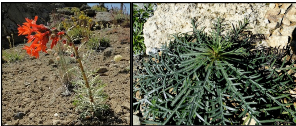
Left: Ipomopsis aggregata in the Wenatchee Mountains.

Ipomopsis aggregata occurs in dryland areas in much of the western United States and in the interior of BC. It is very drought tolerant and needs very good drainage in the garden. We grew it in Sechelt Sand with a small percentage of humus.