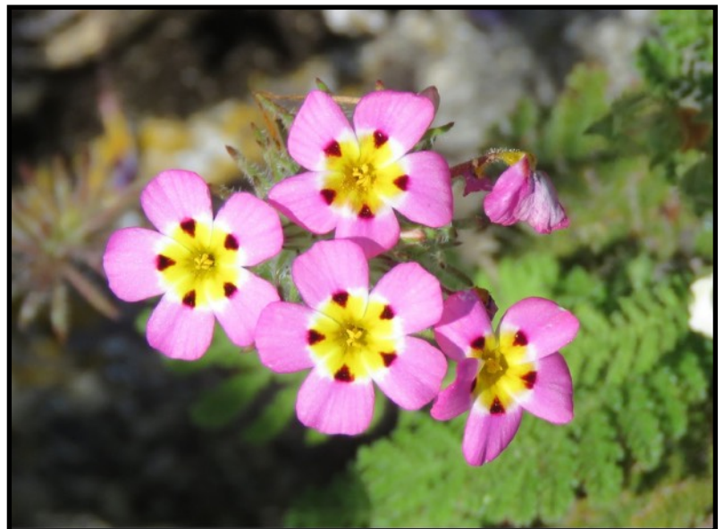
A pink form of the endemic annual Leptosiphon montanus , also known as mustang clover.