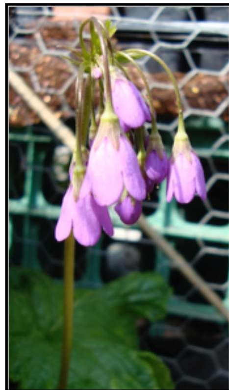
First flower stalk in 2012.

This Primula is a member of the Cortusoides section (formerly placed in the genus Cortusa ), and is a vigorous herbaceous perennial. DNA studies have confirmed its identification as a Primula and subspecies of P. matthioli (id info from Kevock Garden Plants). It has light green rounded scalloped leaves, which make dense clumps in a relatively short time (20 cm wide). The densely clustered flowers are borne on slender stems (to 30 cm) and are rich purple-pink (occasionally white), pendulous and bell-like and usually hang to one side. This subspecies is larger in all of its parts than Primula matthioli . It needs moist humous soil with some shade. It originates from Turkey and Central Asia, hence turkestanica .