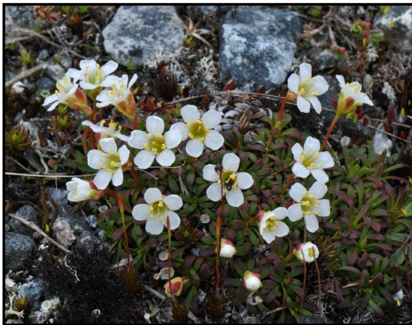
Diapensia lapponica .

The conference registration fee is CAD $495.00 Canadian or USD $415 . Registration for the conference will close as of June 1, 2018. The price of the conference fee includes access to the speaker’s presentations, field trips and some meals. For any questions contact Todd Boland at todd.boland@warp.nfld.net