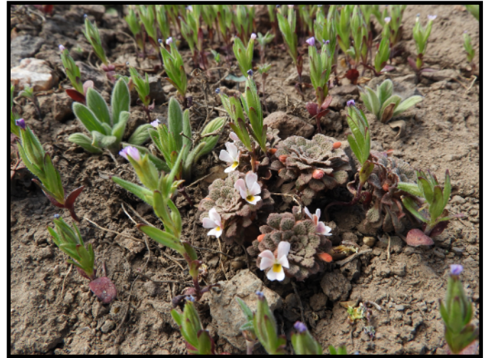
Viola philippii and Phacelia species.

Paul Krystof recommended that we visit Andean ski areas just east of Santiago. The Valle Nevado ski area, one and a half hours from the city by tour bus, up a mountain road with 60 switch back curves was ablaze with California poppies ( Eschscholzia californica ), an introduced species, and numerous patches of Alstroemeria sp. At lower elevations the pale yellow flowering large cactus Echinopsis chiloensis was prevalent, with occasional plants showing the bright red inflorescence of Tristerix aphyllus , a parasitic plant of this cactus. At 3000 meters, the slopes appeared to be barren until one wandered uphill from the village. Beside the tiny flowering Viola philippii were scattered Tristagma bivalve and large cushions of Laretia acaulis and Anarthrophyllum gayanum . The latter cushion was flowering where there was protection. The bright pink Oxalis squamata was beginning to flower as were two other yellow Oxalis species. One was O. compacta while the other may have been O. cinerea . Astragalus vesiculosus in early bloom and pre-bloom Nassauvia pyramidalis were also observed.