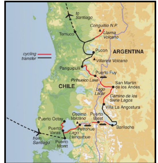
Map of the cycling tour.

Although the late November trip through the northern extremity of Patagonia was primarily a cycling trek, botanizing from a bike was possible. My gradually worsening worn out knees still allow for relatively pain-free cycling but very limited hiking, hence an organized bike trip. The trip started 1,000 km south of Santiago, in Puerto Varas, Chile, looping through Argentinian Andes heading north and back to the Parque Nacional Conguillío, in Chile. Free days allowed small excursions to the Catedral ski resort in Bariloche, Argentina, the base of the volcano Villarrica, in Pucon, Chile, and the Araucaria forest. On an excursion to the ski area, Valle Nevado, near Santiago, alpine flowers lay hidden on slopes that appeared barren.