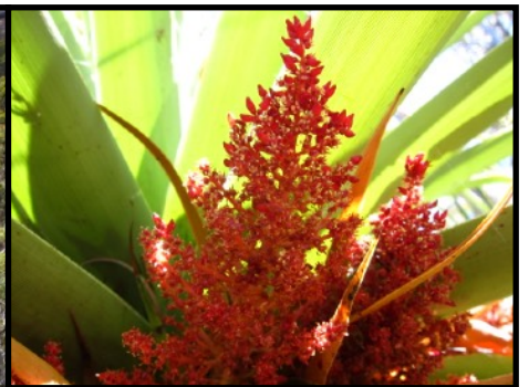
Left: A grove of exotic looking Richea pandanifolia Above: A close up photo of R. pandanifolia flowers.