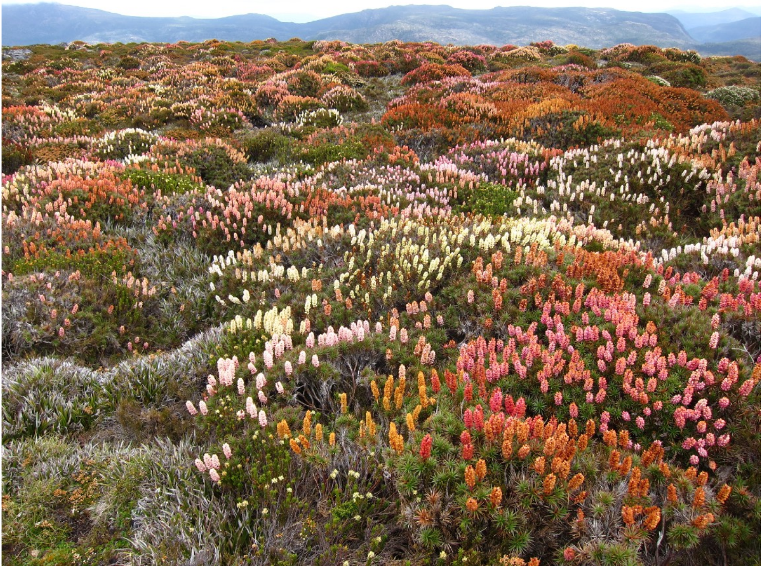
Richea scoparia meadow on Mount Rufus, Tasmania

Volume 61, Number 1 Quarterly Bulletin, 2018