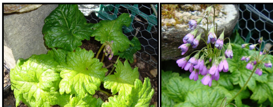
A happy plant in its location nevertheless, as it had numerous flower stocks (right) in 2013.

In my garden the plant faces east but its base is protected from most of the midday and late afternoon sun. If it had more shading, the leaves and flowers would last longer, provided the deer didn't get them! I started my plant from AGS 2010-11 seed on Jan 15, 2011. The seed was just covered in granite grit and given outdoor treatment under a dome, sprouted by mid April, potted up mid May and planted out summer of 2011.