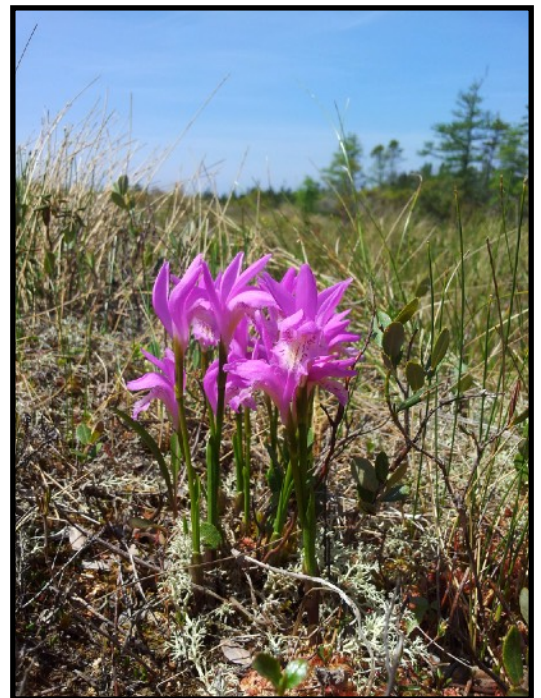
Arethusa bulbosa .

Welcome to Newfoundland, the far east of North America! Eastern Newfoundland is a land of botanical extremes; boreal forest of balsam fir, black and white spruce with associated northern woodland plants; a multitude of bogs and fens were grow a multitude of orchids and insectivorous plants; and rocky barrens of the coast which house wind-swept contorted trees and plants of an alpine nature more in common with high elevations of the New England Appalachians. We have the largest population of North Atlantic summering humpback whales, some of the largest seabird colonies of eastern North America and are along the passing route of icebergs calving off glaciers in Greenland. This NARGS venue provides participants with a chance to visit one of the most hauntingly beautiful regions of North America. Newfoundland is truly where alpines meet the sea.