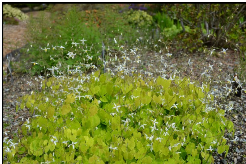
Epimedium brevicornu growing in the Alpine Garden at UBC.

The genus Epimedium , commonly known as barrenworts or bishop's hats, are herbaceous members of the Berberidaceae family. If you have not made yourself familiar with the herbaceous members of this plant family, please do so at your earliest convenience. There are some true gems to be had, many of them suitable in scale and aesthetic for the alpine garden. Numbering 55 to 70 species, depending on whose taxonomy you follow, the genus Epimedium provides enough diversity to be of lasting interest, while also remaining small enough to conceptually grasp and commit to memory. By-and-large, they are forgiving, easy to cultivate plants with great year-round interest from both flowers and foliage. As a group they have received a respectable amount of interest in recent decades, and I feel it is most warranted. Increased devotion is largely due to the discovery of a number of new species, with the genus being expanded from 23 recognized species in 1958 to the current 50 plus species recognized today.