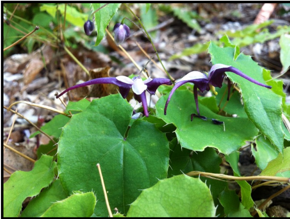
Epimedium acuminatum ‘Night Mistress’ is cultivated for its especially dark, prominent flower spurs.

Stay tuned for Ben’s cultural advice and species recommendations in the continuation of this article in the spring Bulletin.