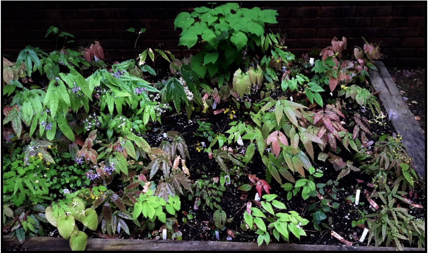
A variety Epimedium spp. growing together, demonstrating diversity of foliage.

The leaves and flowering stems of Epimedium arise from rhizomes which vary in character depending on species, and may be important diagnostic features for identification. Broadly speaking, plants may be spreading (leptomorphs) or clumping (pachymorphs). Don't let your mind wander to the bamboos when you see these terms, as not all spreaders are inherently problematic or aggressive. Even the most rambunctious Epimedium is likely to spread only a few inches per year, not a half dozen meters. Rhizomes give rise to buds that form at or just below the soil surface in late summer, and benefit from a good layer of mulch. Small leaves or conifer needles are best, as larger, coarse leaves may inhibit shoot emergence if they mat down. Bark mulches may also be used. In cold climates with insufficient snow cover, shallow rhizomes or exposed buds may desiccate in drying winds and extreme fluctuations in temperature. A mulch of some type will help guard against this.