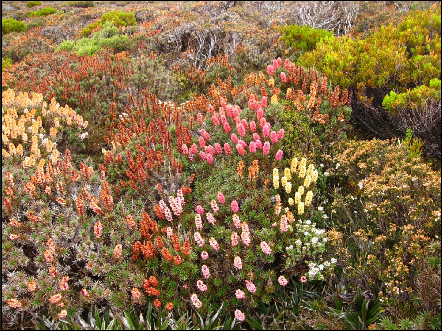
A mass of Richea scoparia showing colour polymorphism

The weather-beaten peak and surrounding alpine zone is carpeted by tattered Microcachrys tetragona , a prostrate conifer species which can be found growing happily at UBC Botanical Garden, as well as a number of cushion species and wildflowers. Among these is the endemic Dracophyllum minimum , Euphrasia striata and the charming snow gentian, Gentianella diemensis . While the ascent to the peak certainly offers abundant botanical interest it doesn't match the floral spectacle of the descent to Shadow Lake through Richea Valley.