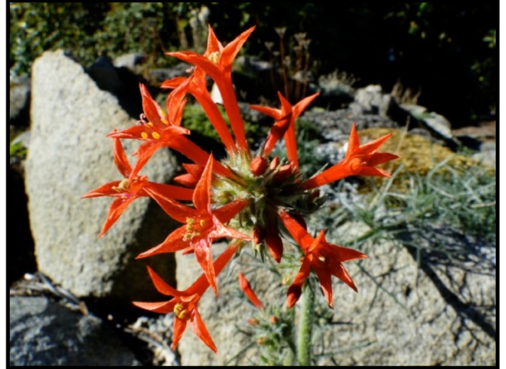
Ipomopsis aggregata in the garden in October.

An unusual flower in the October garden of 2012 was Ipomopsis aggregata or scarlet gilia. The plant came from seed we collected on Mount Kobau in 2011, which we planted in the fall and germination was excellent in early Spring. The plants formed attractive rosettes in the garden and one plant produced a long flower spike.