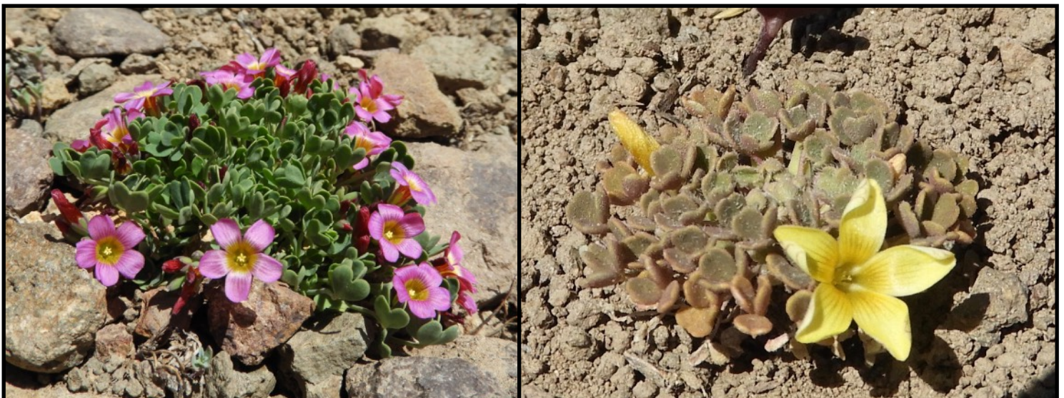
Oxalis squamata (left) and Oxalis compacta (right).