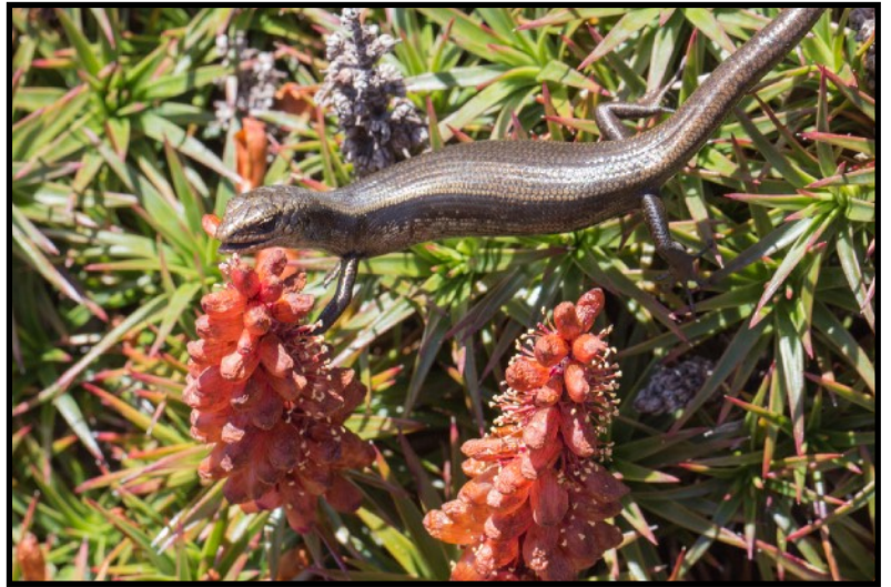
A snow skink removing the operculum of Richea scoparia for the nectar.*

A morphological feature of the genus is a fused conical flower corolla. The distal portion is referred to as an operculum, and detaches to reveal the reproductive organs. Studies of R. scoparia have shown that the detachment of the opercula, and subsequent pollination by insects and wind, is much aided by the nectar foraging of a lizard species, the snow skink, Niveoscincus microlepidotus (Olsson et al.). The flowers also happen to be stunning. Within a single population their colour can range from pale yellow to deep pink, with all fading to rusty orange.