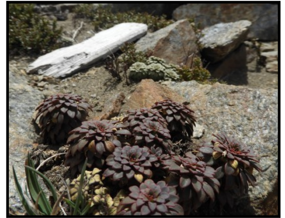
Above: Viola sacculus Below: Tristagma bivalve

Tristagma bivalve and T. nivale growing through Berberis empetrifolia could be seen flowering sporadically near the snowline. A Northern Irish cyclist, looking for an outing on a slack day, decided to join me on the hunt for flowers, a first for him. He became quite enthusiastic and had a good eye for spotting new species.