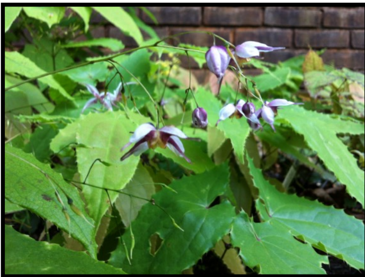
Epimedium mikinorii .