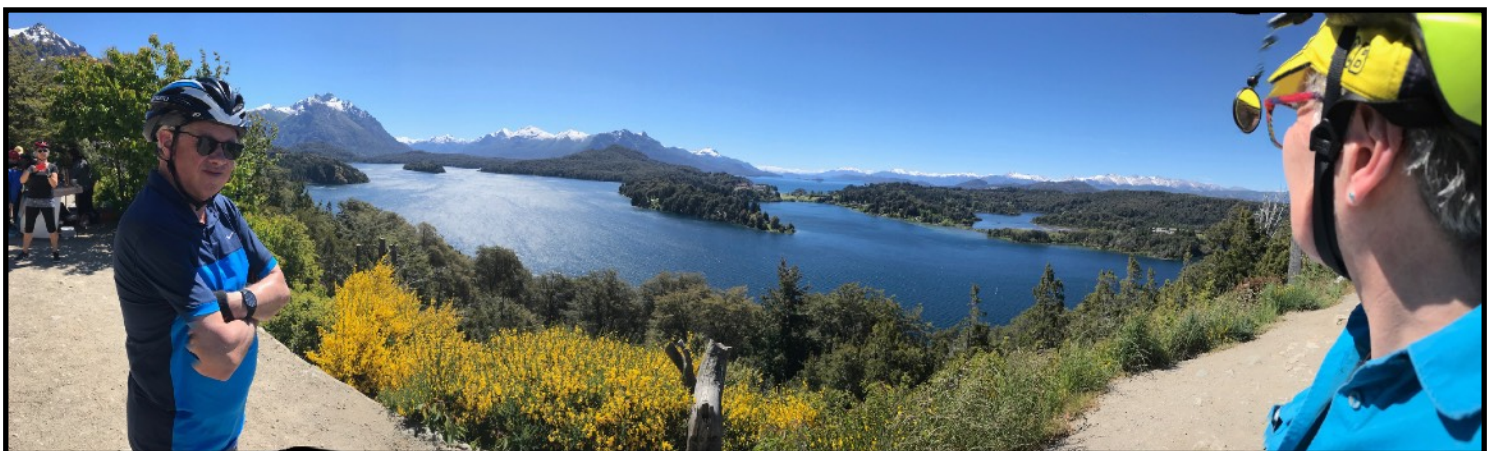
View of Lago Nahuei Huapi, Argentina, with Genista monspessulana in the foreground.

The most striking images throughout the trip, besides the beautiful vistas, are the numerous Embothrium coccineum (Chilean firebush) and the introduced invasive Genista monspessulana (French broom), both in full flower. The species are ubiquitous both in nature and in gardens. We were struck by how well gardens and roadsides were maintained throughout our trip. The climb through the Andes consisted of riding ferries on several lakes and steep gravel roads as well as lovely paved bike lanes. The forest density rivalled our own with trees right to the water and snow-covered peaks in the distance.