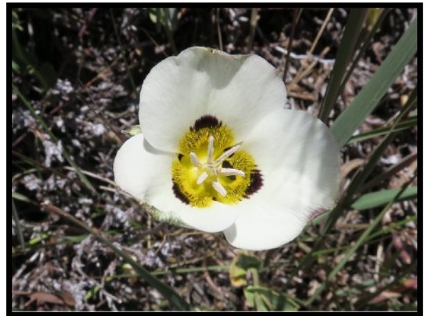
Calochortus leichtlinii .

Not all trails were accessible, however. One, the Half Dome hike, is restricted to only 300 people a day, and those lucky hikers are decided by a lottery draw. Although entered, Howard was not selected. But it didn't seem to impact his positive impression of the park. Many more plants were found, photographed and identified. Some of the most striking and interesting were the Ivesia santolinoides , well camouflaged on rocks with leaves reminiscent of silver tails, the rocky dwelling cliff-brake fern Pellaea bridgesii , charming Penstemon newberryi , and Howard's favourite, Calochortus leichtlinii . With Californian plants not his area of specialty, his delight in learning about and identifying the plants on the trip was obvious in his presentation. New to him were Streptanthus tortuosus , with its notable, large bracts, and yet another Californian endemic, Achyrachaena mollis , a dandelion relative.