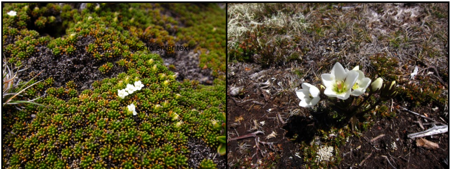
Dracophyllum minimum (left) and Gentianella diemensis (right).

Mt. Rufus rises 1416 m above Lake St. Clair at the southern end of Tasmania’s famous Overland Track. From open lakeside eucalypt woodland with an understory of Lomatia tinctoria , Callistemon citrinus , and arborescent Banksia marginata , the track climbs through primeval rainforest of contorted Nothofagus cunninghamii enrobed in moss and lichen. As the wind grows harsher upslope, the forest gives way to subalpine heathlands of Boronia , Leptospermum , Ozothamnus , and other low shrubs growing thickly between the skeletal white trunks of snow gum, Eucalyptus coccifera . Patches of silvery Astelia alpina add to the otherworldly landscape.