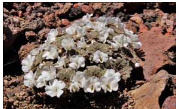
Viola cotyledon white