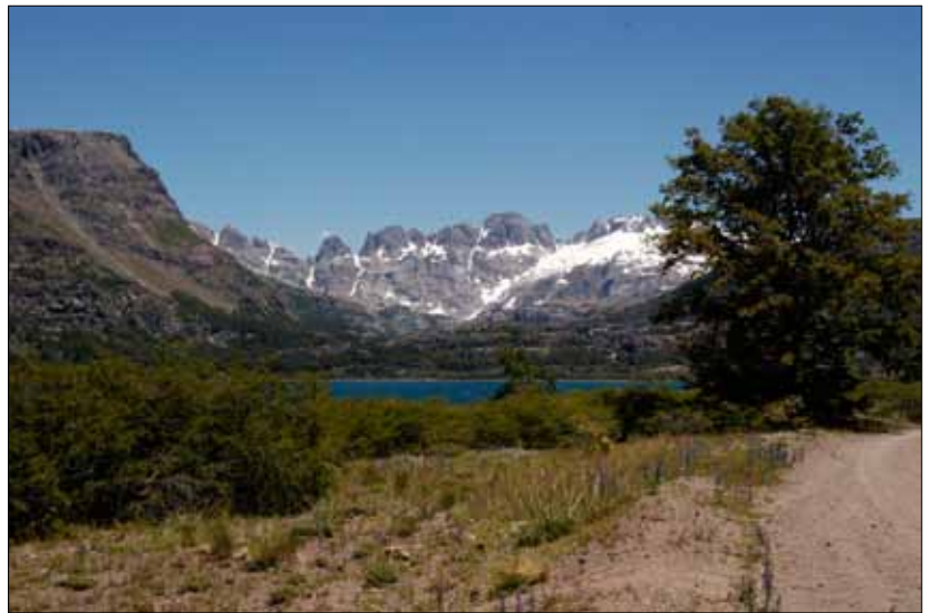
Natural Protegida EPU Lauquen National Parque

thin taproot and erect bright yellow flowers on 20 cm stems. This beautiful species likes especially hot sandy soil. Arjona tuberosa , from the Santalaceae family, is a somewhat sloppy growing species with white flowers on about 20 cm stems. The mainly Chilean and famous yellow-flowering Rhodophiala montana was here in poor condition. This species has the same properties as R. elwesii , mendocina and araucana , but clearly distinguishes itself by its narrow leaves. A few plants of Pantacantha ameghinoi , a member of the Solanaceae family, were also found here. It is a small species with spiny leaves and white-yellow flowers. Over the next two days we made our last tours. The first was a long drive to the Natural Protegida EPU Lauquen National Parque, a protected area. Our goal—to find the last Viola species of our trip, Viola congesta .