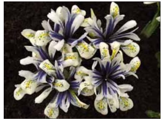
'Eye Catcher' with Multiple Flower Parts

A previous Dutch grower of my 'Eye Catcher' had allowed 'Amazing' (00-KN-1) to be mixed in. In 2015 I spent about two days overall during the week I was there, going through the 150 m of 'Eye Catcher' and pulling out the 5-10% "contamination" and replanting it elsewhere. This year there was less than 1% and I was similarly looking over the bed (now 280 m) and taking out 'Amazing' and replanting them