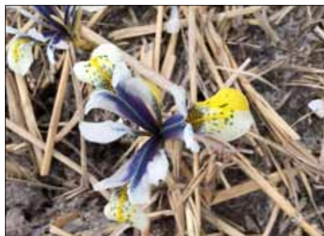
Eye Catcher in Straw