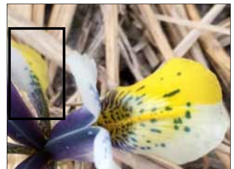
Eye Catcher with Yellow Fall