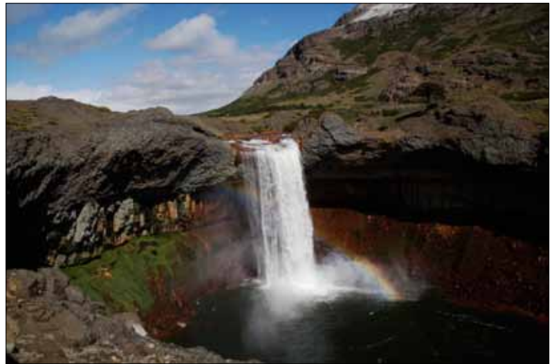
Salto del Agrio

through Salto del Agrio, beautifully situated amid ancient Araucaria forests. Notable species that we saw here were a little Gunnera magellanica along a stream and Cortaderia pilosa , a pampas grass species about 50 cm high. Our last stop for that day was just south of Lago Caviahue. Every day on our tour we found interesting plants—here, for example, Viola volcanica and Oxalis compacta . Despite the tremendous acidity of Lago Caviahue we spotted interesting birds, including a nice flock of flamingoes. The schedule for next day was to explore an elevated area above the village of Copahue and we hoped we would no longer be bothered by snow. Alfredo, our driver, dropped us at a trail behind the village where we would walk towards the Chilean border and then to Laguna las Mellizas, where he would pick us up again.