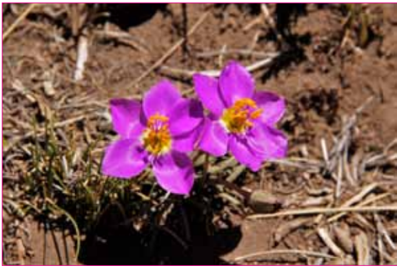
Montiopsis aff. dianthoides

not previously seen. At the foot of the volcano crater we found Maihuenia poeppigii , the only Patagonian cactus that grows in the high Andes. The most avid alpine plant enthusiasts were very excited to find three different, fantastic species together: Nassauvia ulicina , Hypochoeris hookerii and Arjona tuberosa . Nassauvia ulicina , especially, is an uncommon species. It has needle-like leaves and forms cushions about 8 cm high in open dry steppe to 500 m altitude. Hypochoeris hookerii , an Asteraceae, is a rosette-forming perennial with a