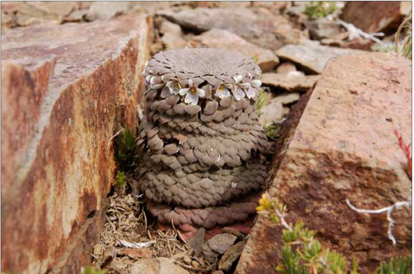
Viola copahuensis in Patagonia

Volume 59, Number 3 Quarterly Bulletin, Summer 2016