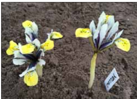
Yellow Eye Catcher