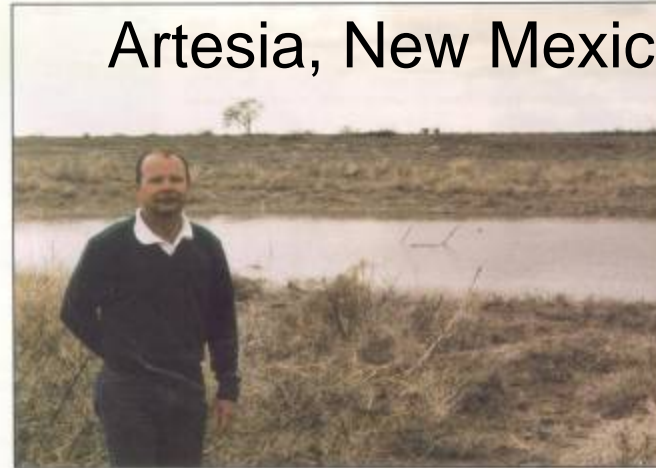
Artesia, New Mexico

The economic and political significance of this could be huge in states where saltcedar has taken over river basins. The Pecos River is a prime example of a watershed where the trees have not only taken over the riparian habitat, but also wasted millions of gallons of water annually. This is a complex issue between New Mexico and Texas, Duncan points out. He explains that New Mexico for over 50 years has been legally obligated, through the Pecos River Compact, to deliver a certain amount of water, determined each year by a complex formula, to Texas.