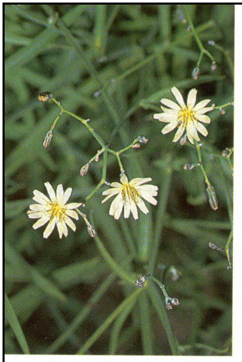
Figure 1. Launaea cornuta from Blundell (1992)

Description: An erect perennial with hollow stems up to 1.5 m high and creeping rhizomes. Leaves form a rosette at the base, alternate on the stem, sessile, up to 25 cm long by 3 cm wide, entire or with two to three pairs of lobes acute-pointed near the base. Inflorescence large, diffuse with numerous flower heads on peduncles about 2.5 cm long. Involucre up to 10 mm long by 4 mm across, glabrous or shortly pubescent, phyllaries in two to three rows, 2–4 mm long outside, up to 10 mm long inside. Florets 10–25, yellow up to 15 mm long, ligule often reddish outside. Seeds pale brown, elliptical, ribbed, 2–4 mm long with white pappus 5 mm long.