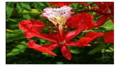
Fig 7: Gulmohar flower.

Flowers: Large reddish orange with 5 petals and white stripes on 1 petal. petals somewhat larger than the others, of the same size and color, up to 8 cm long, with 4 spreading scarlet or orange-red petals, a fifth upright petal, called standard, slightly larger, with yellow and white spots. Sepals 5, thick, green outside, reddish inside with yellow rim, reflective when flower opens, sharp-tipped, finely hairy, about 2.5 cm long. 5 stamens, 10 red stamens. The pistil has a hairy unicellular ovary about 1.3 cm long. Style about 3 cm long.<sup>[5,26,29,30]</sup>