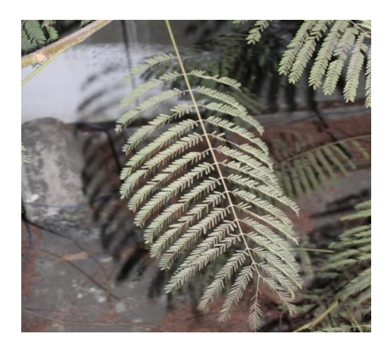
Fig No: 3 leaf