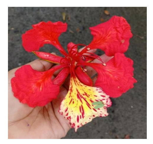
Fig No 4: Flower.