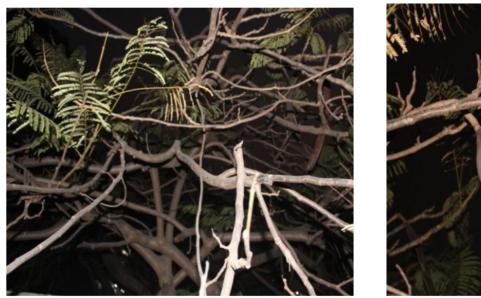
Fig.no.5: Branch & Stems.