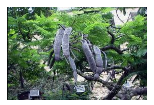
Fig 10: Gulmohar fruits.