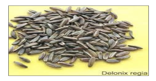
Fig 9: Gulmohar seed.

Seeds: Seeds 30-45, hard, greyish, shiny, 2 cm long, oblong, very similar in shape to date seeds, with bony seed coat. Mottled laterally. Weight about 0.4g.<sup>[31]</sup>