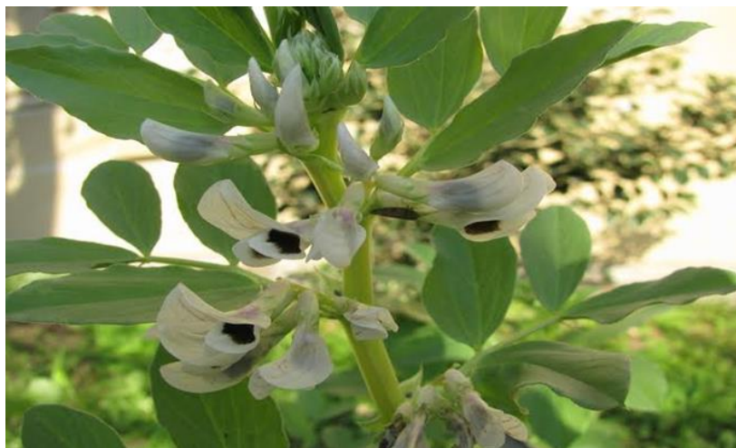
Figure 17 Vicia faba plant