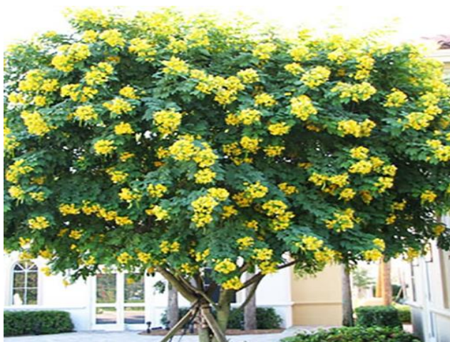
Figure 7 Senna sulfurea plant

Senna sulfurea (Collad.) which is known as glossy sulphur-flowered senna, glaucous cassia, kalamona, and smooth senna, is distributed in India, Sri Lanka, Australia, Polynesia, south eastern Asia, Gabon and China. It is a member of the family Caesalpiniaceae and is commonly planted as ornamental plant due to its beautiful flowers. It grows up to 3 m high. Its young shoots are hairy and later become hairless. It's an evergreen, perennial shrub or small tree, with 15-30cm leaves, 3.5-6.5 cm leaf stacks; yellow flowers and flat strap shaped pods with black shiny seeds [42]. The leaves find folksforic application in curing of blennorrhagia when mixed with milk and sugar. The bark and leaves contain antioxidants that are useful to relieve diabetes and are used to treat dysentery and gonorrhoea [42, 43]. The flowers and pods are purgative; the pods are prepared and used an antiseptic to manage skin diseases [42].