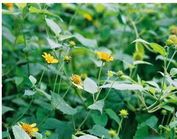
Figure 23 (a) Melanthera scanden

Melanthera scanden and Aspilia africana (Compositae) are medicinal plants considered to be of great biological importance. Aspilia africana (Compositae) is a semi-woody herb that grows up to 2 meters high and widely distributed across tropical Africa [173]. Melanthera scanden is a scrambling herb of waste thickets, commonly dispersed in the forested areas and extending widely across tropical Africa. Melanthera scanden has similar medicinal uses with Aspilia africana . They are known to provide forage for all stock in thicket edges around villages. With haemostatic preparations they are used on cuts and fresh wounds [174, 175]. They are used to draw up exudations from open fresh sores and promote healing as well as curbing inflammation [176, 177]. Antimicrobial, antioxidant, anti-inflammatory, Antidiabetic, hypolipidemic and antiplasmodial activities of the plants have been reported in some studies [175, 178-180]. Both plants contain essential phytochemicals; possess mild antityrosinase and antioxidant capacities that provide clues to further understand their applications in folk medicine.