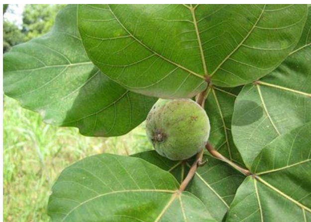
Figure 2 Ficus vallis-choudae leaves and fruit

Ficus vallis-choudae D. is a tropical tree of the Moraceae family, with white latex [19]. Ficus vallis-choudae is known as a riverine fig tree. It is widely distributed in Tropical African countries like Nigeria, Senegal, Cameroon, Sudan, Malawi and Ethiopia [20]. According to Oliver [21], the leaves and young leafy stems are used as local drug for nausea, bronchial, jaundice and gastrointestinal disorders. The figs are edible and mostly appreciated by children in some parts of Africa [20]. The bark extracts of Ficus vallis-choudae in organic media have been reported to possess anticonvulsant and antifungal activities as well as anti-inflammatory and antinociceptive effects [4, 22, 23].