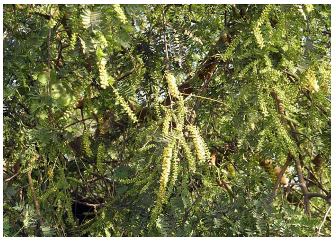
Figure 8 Prosopis cineraria leaves

Prosopis cineraria (L.) Druce, also known as called as Indian mesquite and sponge tree, is widely distributed in Asian countries like India, Iran, Afghanistan, Oman, Sri Lanka, Saudi Arab, Pakistan and Yemen. It is member of the family Leguminosae and grows up to 5 m tall tree, with bipinnate leaves consisting of 7-14 leaflets on each of one to three pinnae.