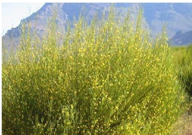
Figure 15 Aspalathus linearis plant

Aspalathus linearis (Brum.f Dahlg.) which is globally known as rooibos is a plant belonging to the family Leguminosae that grows naturally in the Cederberg Mountains in the western parts of the Western Cape Province, South Africa. The rooibos plant has gained transition from being a wild resource to become a plant of great economic and biological importance [105]. Rooibos is cultivated and usually processed to tea. After harvesting, the plant material may be subjected to a fermentation process which involves bruising and oxidizing it in open air. The processed tea is usually referred to as fermented rooibos, while the unprocessed tea is referred to as unfermented or “green” rooibos Joubert and De Villiers [106] with total production including unfermented rooibos was in excess of 14,000 tons [107]. Rooibos tea is believed to possess antispasmodic properties, as well as ability to relieve digestive troubles among others [108, 109]. Rooibos have a unique flavonoid composition, containing rare compounds as previously described. Both the fermented and unfermented rooibos possess good antioxidant activities and tyrosinase inhibitory activity as an indication of having diverse health promoting properties, especially to solving problems associated with oxidative stress [3]. The plant contains essential bioactive phytochemicals like flavonoids flavonol, phenolics, tannins and flavanols [3, 110, 111]