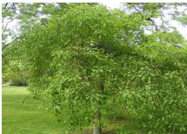
Figure 6 Fraxinus excelsior plant

Fraxinus excelsior L. also known as European ash or common ash is widely distributed in Europe and usually cultivated as an ornamental plant in Canada, New Zealand and United States. It belongs to the Olive family Oleaceae. Fraxinus excelsior is a large tree that grows up to 40 m tall, with ascending branches, pale grey smooth bark, serrated and stalkless; flowers usually open before the leaves unfold; flattened seeds of about 2-5 cm long in bunches and ripen individually [33].