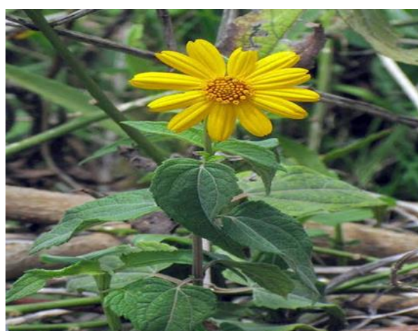
(b) Aspilia africana (Compositae)