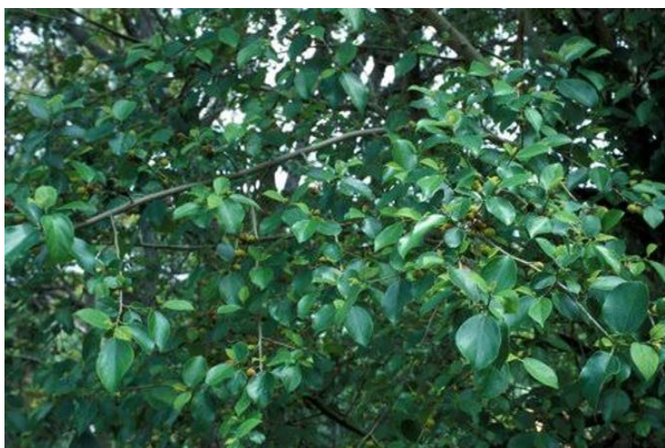
Figure 13 Ficus exasperate leaves