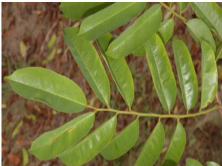
Figure 18 Fresh leaves of Pterocarpus soyauxii plant

Pterocarpus soyauxii Taub (Fabaceae) which is commonly known as African Coral-wood is a popular green vegetable often utilized in the South Eastern part of Nigeria due to its high vitamin C content and unique taste [129, 130]. Crude extract of the leaf could potentially increase white and red blood cells as well as haemoglobin [131]. The plant has found wide tradomedicinal applications in treatment various diseases such as renal infections, hypertension, chronic anaemia, fungal infections and skin diseases [132-134]. Phytochemical investigations of Pterocarpus soyauxii Taub revealed the presence of flavonoids, bioflavonoids, ascorbic acid and pterostilbene [135-138].