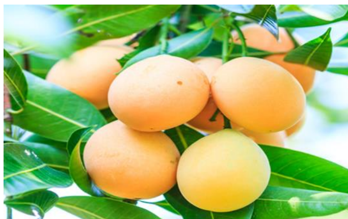
Figure 9 Bouea macrophylla leaves and fruits

Bouea macrophylla belongs to the Anacardiaceae family and is related to mangoes [48, 49]. It is commonly known as the Mariam Plum or Plum Mango. It also has been shown as an evergreen and a perennial tree that grows up to 25 meters of height, highly seasonal and is widely distributed in South East Asia including Malaysia, Indonesia, Laos, Thailand, Java, Myanmar, and Sumatra [50]. The leaves and fruits are edible, popularly eaten in local communities of Sabah, Malaysia and Sarawak [51]. The plant is widely cultivated in Malaysia for shade as well as for ornamental purpose [50]. Traditionally, almost all parts (seeds, unripe and ripe fruits, and leaves) of the plant have been used for various culinary purposes [49]. Ripe fruits of B. macrophylla have sweet taste and have found various applications in preparing snacks, beverages and jellies. On the other hand, unripe fruits with sour taste are used as vegetable [48]. In Indonesia and Malaysia, the tender leaves of the plant are used as a raw vegetable in the preparation of salads [50]. A successful study has been undertaken to show the phytochemical constituents of B. macrophylla Griffith as well as its antioxidant activity [52].