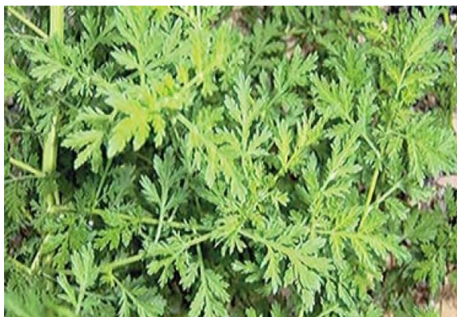
Figure 1 Artemisia annua leaves

Artemisia annua L. is herbaceous perennial herb also known as sweet wormwood belonging to the family Asteraceae . It is of Asia origin and widely dispersed throughout the world temperate region. It is widely applied in folklore medicine. A. annua is traditionally used to treat fevers, remove intestinal worms, gush menstruation, repel intestinal gases, treat hemorrhoids and boils, etc. [11]. The plant shows promising ethnopharmacological activities such as antifungal, antipyretic, antiplasmodia, anti-inflammatory and antioxidant [11]. A. annua is famously known for its application in treatment of malaria. It is the primary source of artemisinin, a sesquiterpene lactone possessing antimalarial activity. For the production of artemisinin, the plant is cultivated on a large scale in countries like Vietnam, China, Turkey, Iran, Afghanistan, Madagascar and Australia. Artemisinin based Combination Therapies (ACTs) comprising artemisinin, its derivatives like artemether, arteether, etc, and few long acting drugs like lumefantrine and amodiaquine are effectively used worldwide for the treatment of malaria caused by Plasmodium falciparum [11-13]. Various species of Artemisia , including A. annua , are characterized with essential oils that exhibit strong bio-herbicidal and insecticidal activities [6, 14, 15, 17, 18].