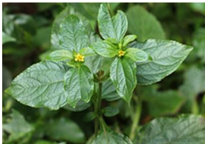
Figure 22 Synedrella nodiflora plant

Synedrella nodiflora is from the kingdom Plantae, infrakingdom of Streptophyta, subkingdom of Viridiplantae, division of Tracheophyta, subdivision of Spermatophytina, superdivision of Embryophyta, class of Magnoliopsida, order of Asterales, superorder of Asteranae, family of Asteraceae , genus of Synedrella Gaertn., and species of Synedrella nodiflora (L.) Gaertn [163]. S. nodiflora is a branched ephemeral herb that can grow up to 80 cm in height. It has a shallow root system that is usually strongly branched. The leaves exist in opposite pairs and are usually 4-9 cm long while the lower part of the stem may root at the nodes, especially in moist conditions.