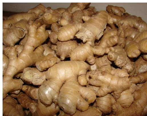
Figure 20 (a) Zingiber officinale plant and