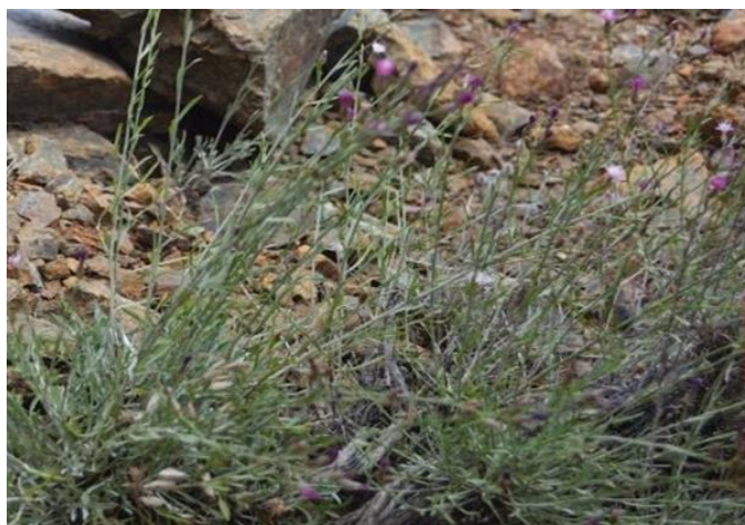
Figure 5 Centaurea austro-anatolica plant

Centaurea austro-anatolica is a 30-60 cm tall perennial herb with branches, tomentose and hairy leaves as well as pink flowers. The plant belongs to the family Asteraceae. It mostly grows in Antalya and Muğla Provinces in Turkey [29]. While several species of the genus Centaurea are widely applied in ethnomedicines for the treatment of diarrhoea, diabetes, hypertension, microbial infections, rheumatism and ulcers [30-32], there is little or no report on any medicinal uses of C. austro-anatolica in folklore medicines in Antalya, Muğla or Konya provinces. There is a report on GC-MS based volatile component analysis and antimicrobial activity assessment of C. austro-anatolica [32].