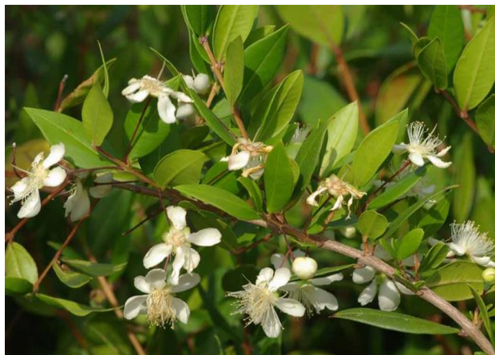
Figure 10 Myrtus communis leaves and flowers