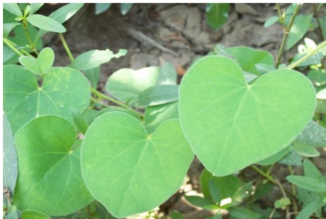
Figure 14: Triclisia subcordata (Oliv)

Triclisia subcordata (Oliv) is a flowering plant in the Menispermaceae family. It is predominantly found west tropical African countries including Ivory Coast, Nigeria, Senegal, Ghana, Sierra Leone and Togo [99]. The plant primarily serves as rope used for tying purposes while the importance of the species however rest with their medicinal applications. The root extract finds folksforic applications in the treatment of ulcer, snake bite, diarrhea, malaria, and pyorrhea, anemia joint pains, swelling of extremities, rheumatic pains and hypertension in Nigeria [100, 101]. The plant has also been evaluated for its enzymes inhibition activities, antiulcer, antihistamine, antimicrobial, antioxidant, anticancer, and antidiabetic activities [8, 10, 15, 102-104]