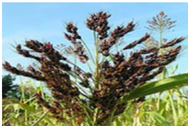
Figure 3 Sorghum ( Sorghum bicolor )

Sorghum bicolor is commonly known as Sorghum . It is the fifth most commonly consumed cereal crop by human after rice, wheat, corn, and barley. The majority (about 65%) of cultivated Sorghum is commonly used to make animal feeds and industrial products, while about 35% of it is directly consumed by humans. It is a plant that is well grown across Asia, Africa and America. It is a member of the plant family Poaceae and is well-known for its diverse phytochemical composition possessing antioxidant properties and effectiveness in cholesterol control [24]. In trado-medicine, the stem is used to treat anaemia and blood related ailments; it also possess both an anti-malarial and anthelmintic properties [25].