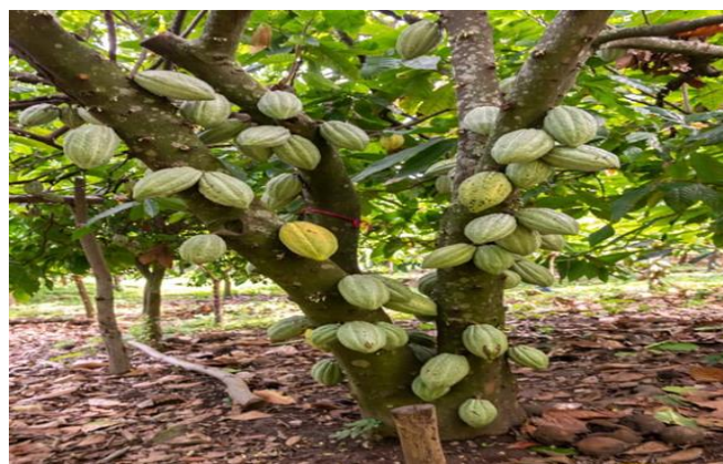
Figure 4 Theobroma cacao plant

Theobroma cacao is a tree usually cultivated in some West African Countries like Ghana and Nigeria, and predominantly cultivated in Brazil for its industrial value. It belongs to the family Malvaceae and is popularly called Cocoa tree. The seed is the main source of chocolate; the ash from pod from the pod is used as source of lye for soap making. Cocoa butter extracted from the seed of cocoa is used in cosmetics and formulations for skin care products.