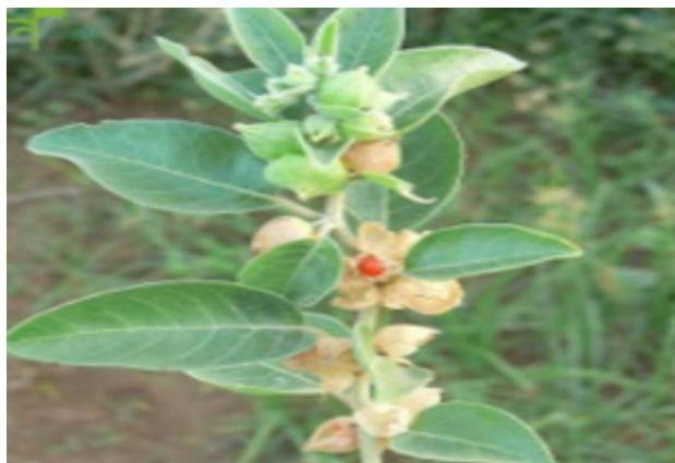
Figure 19 Withania coagulans plant

Ashwagandh powder [139]. It works as an antidote to scorpion sting (Gupta and Singh, 2018). Different parts of plant are applied to treat rheumatism, ulcers, senile debility and dropsy. The fruits are blood purifier, diuretic, emetic, alterative, hepatoprotective, hypolipidemic, hypoglycemic, milk coagulant, sedative, sweet, stomachic and biliousness, used to treat diabetes, asthma, dyspepsia, skin rashes, intestinal infections, stomachache, strangury and wounds. The fruits extracts alongside W. somnifera are used to prepare a composite Ayurvedic medicine 'Liv 52' which is a hepatoprotective herbal formulation [140, 42]. The twigs are chewed for cleaning of teeth and to relief toothache [141]. The flowers water extract is taken to control diabetes [142]. The bitter leaves are alterative and febrifuge. The seeds are diuretic anti-inflammatory and emetic [143, 144]. Studies on antimicrobial, antitumor, antiinflammatory, Antimutagenic, antihyperglycemic, hepatoprotective, cardiovascular, free radical scavenging, immunosuppressive and central nervous system depressant activities of the plant parts have been reported [145-147]. The plant extracts showed the presence of saponins, alkaloids, phenolic compounds, steroids, tannins, proteins, an essential oil, milk-coagulating enzyme, carbohydrates, fatty oil, organic acids and amino acids [140, 148]