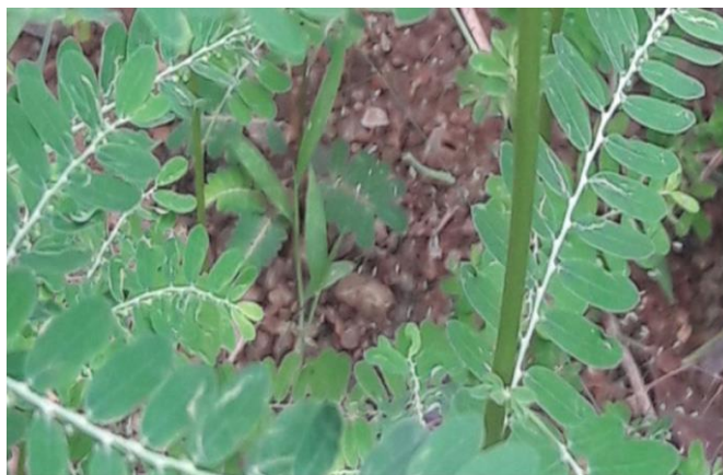
Figure 21 Phyllanthus niruri leaves

Phyllanthus niruri Linn belongs to the family Euphorbiaceae and is an annual herb that is widely spread throughout the subtropical and tropical countries of the world including India and Sri Lanka. It is an important ethnobotanical plant of the Ayurveda system of medicine mentioned in all the relevant ancient Ayurvedic texts [154]. It is commonly found growing as weed in both cultivated and wasteland areas particularly in the rainy season. P. niruri Linn is commonly known as, 'Chancapiedra' (stone breaker), 'Gale of the wind' and 'Seed under a leaf' according to its pharmacological activities and morphology [155]. It is stated that the plant's extract is one of the most widely used remedies in Ayurveda system of medicine especially for anaemia, bronchitis, skin diseases, cough, kidney, liver, asthma and urinary tract disorders [156]. P. niruri Linn has a growing value as researches have uncovered more of its medicinal properties in recent years [154]. The plant demonstrates antimicrobial, anti-inflammatory and anti-diabetic activities, antiviral activity against hepatitis B virus, litholysis action of kidney and gall bladder stones, hepatoprotective activities, lipid lowering and immunomodulatory activities [157-162].