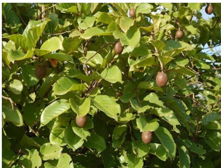
Figure 16 Nauclea latifolia plant