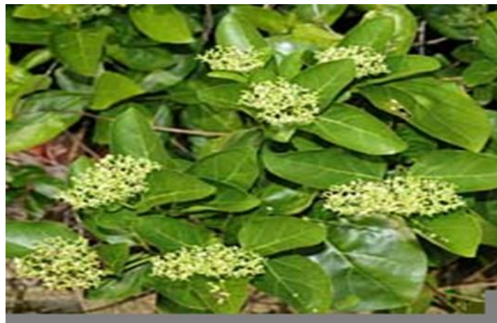
Figure 11 Premna mucronata Roxb

Premna mucronata Roxb commonly known as, “Ganiar”, “Bari arani”, “Agnimatha”, “Agethu” and “Agyon”, is a low bushy tree (with trunk up to 1.2 m height) of great ethnobotanical value belonging to the family Verbenaceae. Furthermore, P. mucronata is a medicinal and aromatic plant and one of the important ingredients of “Dashamula” herbal preparation [69]. The bark finds application in curing boils while the leaves have been applied externally to treat dropsy as diuretic [70, 71]. Savasani et al. [72] reported that P. mucronata showed cardioprotective activity in myocardial infarction due to its antioxidants composition. It also possesses larvicidal properties Renjana and John [73]. Antimicrobial, hypocholesteremics and wound healing ability as well as anti-inflammatory activities have been demonstrated by this plant [74-76]. Recent studies showed that its essential oil has remarkable antifeedant properties [71, 74]