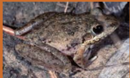
Bumpy rocket frog Litoria inermis .

Relatively little information is available about other animals in coastal grass-sedge wetlands. A range of snakes, frogs, fishes and invertebrates occur, with many being important food items for waterbirds. The eastern snapping frog Cyclorana novaehollandiae and the green striped burrowing frog Cyclorana alboguttata are typical frogs of coastal grass-sedge wetlands, as are the northern dwarf tree frog Litoria bicolor , eastern dwarf tree frog Litoria fallax , tawny rocket frog Litoria nigrofrenata and the bumpy rocket frog Litoria inermis . Freshwater crayfish and crabs, leeches and dragonflies (nymphs and adults) are typical inhabitants. In sites that are connected by channels to tidal areas, juveniles of barramundi Lates calcarifer , mullets and other fishes may use coastal grass-sedge wetlands (especially saline examples) as nursery areas (see Saltmarsh wetlands management profile www.epa.qld.gov.au/nature_conservation/habitats/wetlands/wetland_management_profiles/ ).