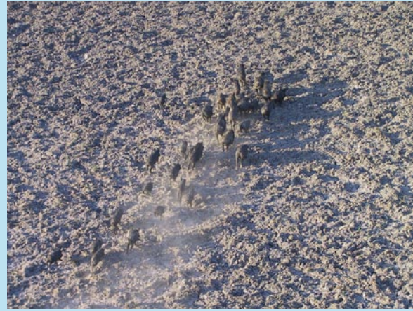
Feral pigs impacting wetlands.

QPWS staff are currently conducting a number of State and Natural Heritage Trust funded pig management projects at multiple parks sites throughout central Queensland. One example is the “Judas Sow” project in Kroombit Tops National Park, which aims to improve knowledge of feral pig feeding habits by radio tracking a number of sows in known pig populations. Seasonal movements of these pigs will be monitored for a designated period, for example three weeks, for up to 18 months. Other pig monitoring projects underway will provide data on where the pigs shelter and feed