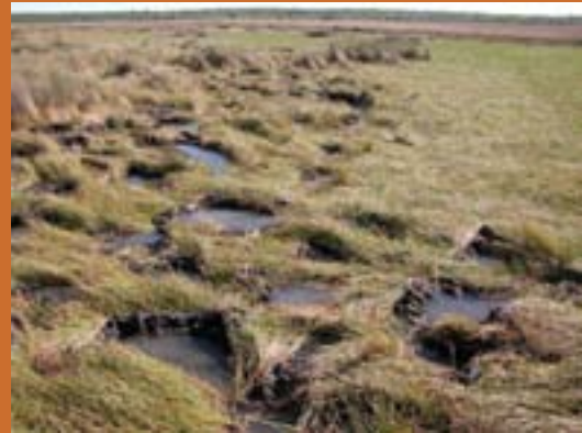
Feral pig diggings in Eleocharis sedgeland.

As both wetlands and pigs can occur across several properties, effective control of pigs depends on coordinated management by networks of land managers. For information on control programs contact NR&M Land Protection officers ( www.nrm.qld.gov.au/pests/contact_list.html ) and local government weed and pest officers. For further information on feral animal management, see the NR&M website www.nrm.qld.gov.au/pests/pest_animals/ .