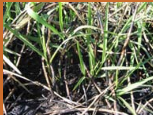
The vulnerable grass Paspalidium udum responds well to fire on the Townsville Town Common.

Given these different findings, more research is required to develop robust and broadly applicable guidelines for the use of fire in coastal grass-sedge wetlands.