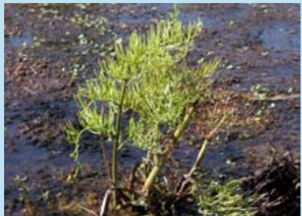
Water fern Ceratopteris thalictroides .

The water fern Ceratopteris thalictroides is widespread in Queensland’s coastal grass-sedge wetlands and occurs in many tropical countries. It is a small, brittle fern that may be erect, floating or submerged and it reproduces both by spores and fragments. It is edible to humans and the leafy parts are commonly eaten raw or as cooked green vegetable; it is also used in Chinese medicine and cultivated as an aquarium plant.