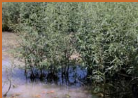
Budda pea Aeschynomene indica is a legume that can be found in coastal grass-sedge wetlands.

Depending on substrate, temperature, water depth, and frequency and duration of inundation, coastal grass-sedge wetlands in north Queensland may support thickets of tall forbs such as the legumes sesbania pea Sesbania cannabina and budda pea Aeschynomene indica (which tend not to be prolific in consecutive years), and other erect forbs notably Ludwigia perennis , Melochia corchorifolia and Caldesia oligococca .