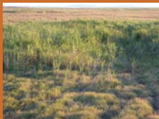
Common reed Phragmites australis is sensitive to frequent fire.