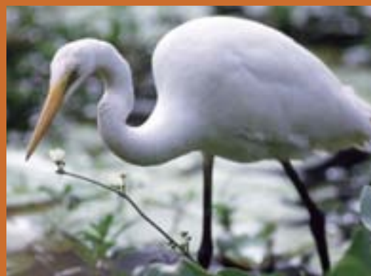
Intermediate egret Ardea intermedia feed in coastal grass-sedge wetlands.

Some waterbirds depend on or frequently use coastal grass-sedge wetlands for breeding: magpie geese and whiskered terns Chlidonias hybridus nest in colonies in bulkuru swamps around the time of peak water depth; radjah shelducks Tadorna radjah raise crèches of juveniles in sheltered channels through saline swamps; brolgas (tropical coast) and sarus cranes Grus antigone (on western Cape York, which is the