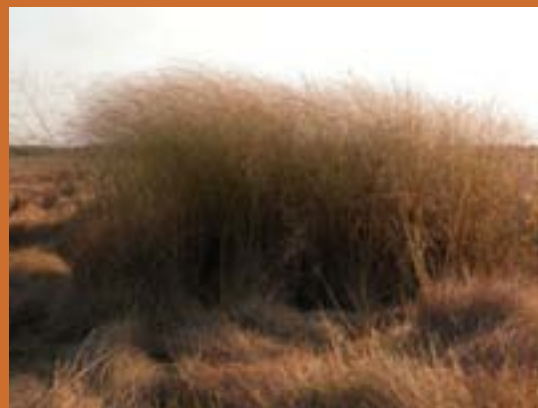
A typical grass found in northern coastal grass-sedge wetlands, Panicum trachyrhachis .

In the Gulf Plains and Cape York bioregions, prominent components of coastal grass-sedge wetlands are indigenous grasses of the rice Oryza and panic Panicum genera ( O. rufipogon , O. australiensis , P. trachyrhachis , P. trichoides , pepper grass P. laevinode ). Other grasses likely to be present include Xerochloa imberbis and saltwater couch Sporobolus virginicus in more saline areas and spiny mudgrass Pseudoraphis spinescens and some widespread grasses such as Dicanthium spp. in non-saline areas. In regard to sedges, bulkuru Eleocharis dulcis , often with E. spiralis , may dominate in some sites especially those with saline influence and coastal grass-sedge wetlands in these bioregions commonly include Fimbristylis spp..