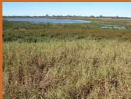
Para grass Brachiaria mutica (foreground) in a coastal grass-sedge wetland (background).

Some native plants, notably cumbungi, can overrun coastal grass-sedge wetlands especially where disturbance or nutrient enrichment have occurred.