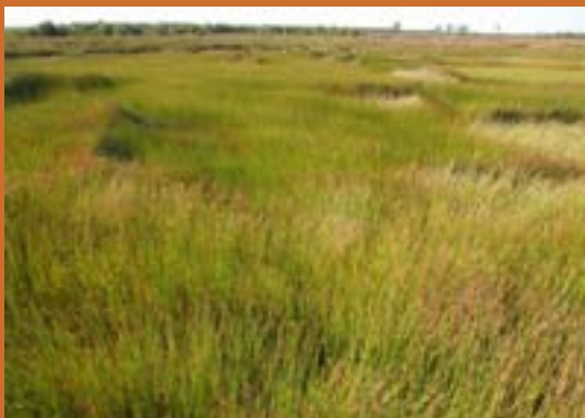
Coastal grass-sedge wetland dominated by spike-rush Eleocharis sp..