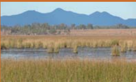
Sedge Schoenoplectus litoralis swamp.

Depending on substrate, temperature, water depth, and frequency and duration of inundation, coastal grass-sedge wetlands in north Queensland may support thickets of tall forbs such as the legumes sesbania pea Sesbania cannabina and budda pea Aeschynomene indica (which tend not to be prolific in consecutive years), and other erect forbs notably Ludwigia perennis , Melochia corchorifolia and Caldesia oligococca .