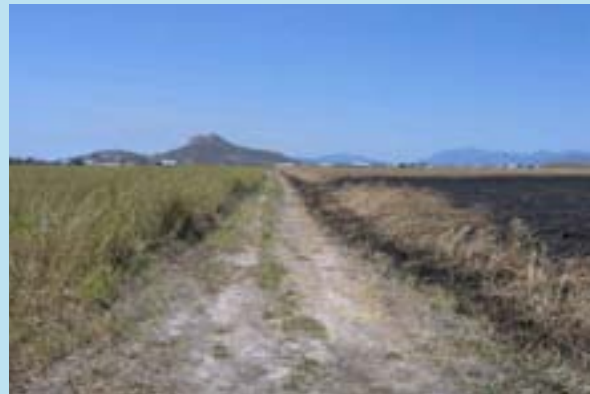
Para grass Brachiaria mutica control trials at Townsville Town Common — undisturbed para grass paddock on the left and burned paddock on the right.

The location of the Common and its history of land use, presents its current managers with a number of management issues. Increased water flow (sewage outflow) has resulted in expansion of mangroves into former coastal grass-sedge wetlands. Removal of grazing from the Common in the late 1970s saw exotic para grass Brachiaria mutica and guinea grass Panicum maximum expand over a broader area and increase in density, crowding out native grasses and sedges, reducing waterbird populations, and increasing fire fuel loads. Location of the wetlands next to an international airport complex requires that certain management actions must take into account the safety of air traffic, such as burning only with south-east winds and often after the last flight has taken off for the evening. In 2002, QPWS in partnership with the Commonwealth Scientific and Industrial Research Organisation (CSIRO) initiated a trial to assess the impacts of grazing on para grass, native couch Cynodon dactylon and common reed Phragmites australis at the Common.