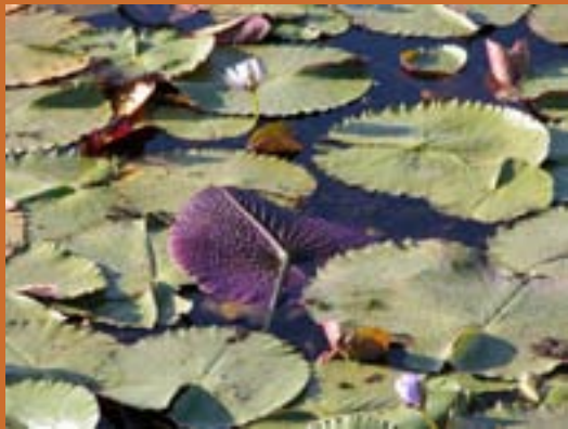
Waterlilies Nymphaea sp. are found in some coastal grass-sedge wetlands.