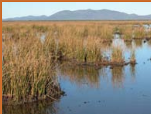
Coastal grass-sedge wetlands provide habitat for the critically endangered yellow chat Epthianura crocea macgregori (Capricorn/Dawson subspecies).

The Capricorn (Dawson) subspecies of the yellow chat Epthianura crocea macgregori (critically endangered, EPBC Act; endangered, NC Act) inhabits both saltmarsh and coastal grass-sedge wetlands on the Torilla Plain, Fitzroy Delta and Curtis Island of central Queensland and its population size is apparently only several hundred birds (see the Saltmarsh wetlands management profile www.epa.qld.gov.au/nature_conservation/habitats/wetlands/wetland_management_profiles/ for further information). In coastal grass-sedge wetlands it prefers tall stands of Schoenoplectus litoralis (occurring in saline wetlands) and Cyperus alopecuroides (lining channels and depressions in freshwater wetlands) on marine plains; it seems that after breeding in Schoenoplectus and saltmarsh habitats in the wet season, many birds retreat to the Cyperus habitats in the drier months. The gulf subspecies of yellow chat E. c. crocea is listed as vulnerable in Queensland (NC Act) and a poorly known population occurs, probably in coastal grass-sedge wetlands, on the Gulf Plains.