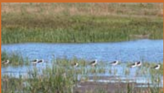
Black-winged stilts Himantopus himantopus in a coastal grass-sedge wetland.