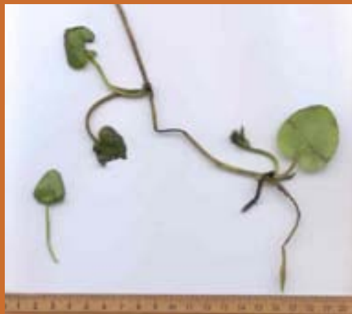
The vulnerable frogbit Hydrocharis dubia occurs in coastal grass-sedge wetlands.

The false water-rat (water mouse) Xeromys myoides (vulnerable, EPBC and NC Acts and IUCN Red List) mainly inhabits mangroves, which provide feeding habitat, and adjoining ecosystems, notably saltmarshes and coastal grass-sedge wetlands, which provide sites for this animal's nest mounds (see the Saltmarsh wetlands management profile www.epa.qld.gov.au/nature_conservation/habitats/wetlands/wetland_management_profiles/ for further information). It depends on coastal landscapes where these wetland types persist as connected and fully functioning