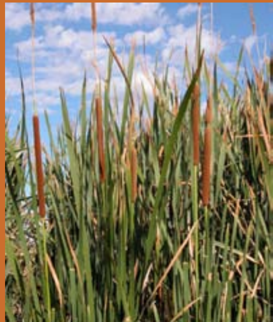
Cumbungi Typha sp. was traditionally used by Indigenous people as a food source (roots and pollen).

There is a moderate likelihood of encountering cultural heritage sites within and adjacent to coastal grass-sedge wetlands. Evidence of traditional occupation and use recorded within coastal grass-sedge wetlands includes burials, middens, stone artefacts and scatters, story places and sites for cultural activities. The most commonly recorded sites within coastal grass-sedge wetlands are stone artefact scatters associated with on-site food and fibre processing and open camp occupation sites.