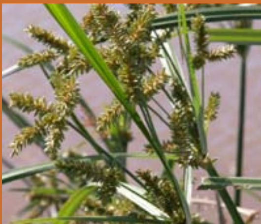
Seed head of the sedge Cyperus alopecuroides .

Along the east coast of Queensland, undisturbed coastal grass-sedge wetlands are commonly dominated by the sedges Schoenoplectus litoralis (where saline influence is greatest) and bulkuru (moderate or low saline influence). Other sedges in the more saline sites include Eleocharis philippensis , Cyperus scariosus and Fimbristylis ferruginea . Moving into the coastal grass-sedge wetlands that are influenced more by fresh water, these sedges may be replaced by tall spikerush Eleocharis sphacelata , Cyperus alopecuroides , bunchy sedge C. polystachyos , soft twigrush Baumea rubiginosa , Bolboschoenus fluviatilis , Juncus spp., and Scleria spp.. Cumbungi Typha spp. and the tall robust sedges — jointed twigrush Baumea articulata and Lepironia articulata — may dominate in patches. As for grasses, saltwater couch and Paspalum vaginatum typically occur in saline coastal grass-sedge wetlands along the east coast. These give way to water couch P. distichum , swamp ricegrass Leersia hexandra , Ischaemum spp. and some widespread grasses such as Chloris spp. in the freshwater regimes. Common reed may occur in tall clumps in both saline and freshwater sites.