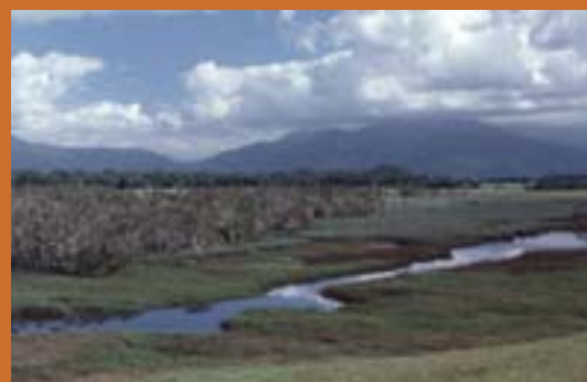
Coastal grass-sedge wetlands in Eubenangee Swamp National Park.

The Queensland Environmental Protection Act 1994 establishes a general environmental duty upon landowners to take all reasonable and practical measures to prevent or minimise harm to wetlands and their environmental values , having considered such things as the sensitivity of the wetland, recommended practices and financial implications. Coastal grass-sedge wetlands have a range of environmental values related to ecological health, public amenity and safety. Some of these values are described in the Cultural heritage values and Ecological values sections below.