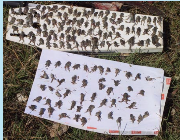
Gut contents (frogs) of a feral pig.

and at what times of day. This may offer some information on how the pigs adapt to seasonal changes in weather or food resources. Such information will provide a better understanding of feral pig habits and optimise the effectiveness of pig control programs both in national parks and other tenures. In areas such as the Whitsunday Shire, this information will be shared with the local Council and park neighbours and assist with setting management actions under the shire’s Pest Management Plan.