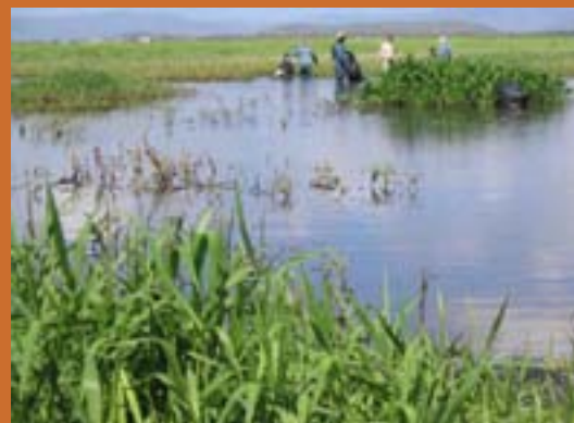
QPWS rangers removing Olive hymenachne Hymenachne amplexicaulis from the Townsville Town Common.