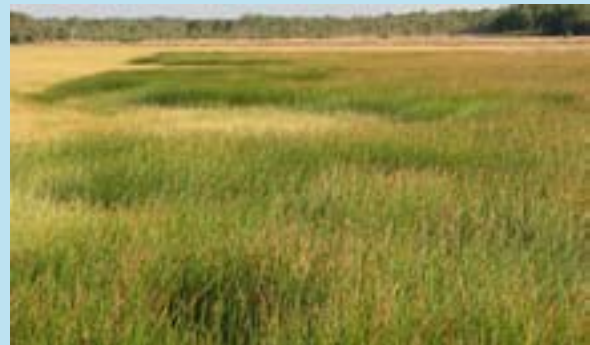
Bulkuru Eleocharis dulcis in a typical coastal grass-sedge wetland.

The sedge “bulkuru” Eleocharis dulcis is widespread in the Asia Pacific region including northern Australia. Named as a “spike-rush” by botanists, the common name “bulkuru” has long been applied in Queensland. Usually this plant grows on marine plains subject to a past or present regime of tidal inundation, often together with other salt tolerant species such as E. spiralis , whereas other common members of the genus — notably, tall spikerush E. sphacelata — prefer freshwater regimes. In the wet season its hollow, erect stems form dense green swards that may totally occupy a wetland. The most important feature of bulkuru is its substantial below-ground tuber — this was sought after by Aboriginal people and in parts of Asia, forms of this plant with large tubers have been cultivated to produce edible water chestnuts. Tubers are dug up in the dry season by magpie geese Anseranas semipalmata and broilgas Grus rubicunda , also by feral pigs Sus scrofa (see below), leaving a churned soil surface.