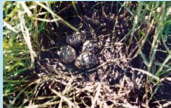
Nest and eggs of Australian painted snipe Rostratula benghalensis australis .

The plumage of the Australian painted snipe Rostratula benghalensis australis (vulnerable, EPBC and NC Acts) provides good camouflage: green-brown upper parts, barred or spotted wings and grey or dark brown hood. Because of its secretive habits, the species is not often reported. In coastal regions, it inhabits coastal grass-sedge wetlands in both freshwater and saline environments, as well as lakes and saltmarshes. Recent surveys of waterbirds on marine plains in central Queensland (REs 11.1.3 and 11.3.27x1a-c) have revealed small numbers of this non-migratory shorebird and it has occasionally been reported at other coastal grass-sedge wetlands on Queensland's east coast from near Townsville to near Brisbane. Nests and/or young have been recorded from about December to May and small muddy islands with short couch grass and sparse sedge are favoured nest sites. There is no robust estimate of the population size of this species but a decline in numbers across Australia has been documented. This nomadic snipe apparently depends on networks of inland and coastal, small and large wetlands.