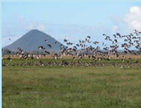
A flock of magpie geese Anseranas semipalmata in a coastal grass-sedge wetland.

With an estimated population size exceeding one million birds, considerable body size and pied plumage, the magpie goose Anseranas semipalmata is one of Australia's most abundant and recognisable waterbirds. It occurs patchily throughout coastal Queensland with largest aggregations on western Cape York. Flocks of thousands still occur on the east coast, notably in the lower Fitzroy River wetlands, Torilla Plain, Goorganga Plain and Townsville to Bowen wetlands, but loss of wetland habitats to agriculture has reduced numbers. Magpie geese favour coastal grass-sedge wetlands dominated by bulkuru Eleocharis dulcis because they consume the mature bulkuru tubers and may nest in the bulkuru (as isolated pairs or small loose colonies) when it is inundated; nesting also sometimes occurs in Schoenoplectus litoralis beds and in other grass-sedge habitats. Although it is a versatile opportunist, the ecology of the magpie goose is strongly linked to the seasonal availability of bulkuru and movements around