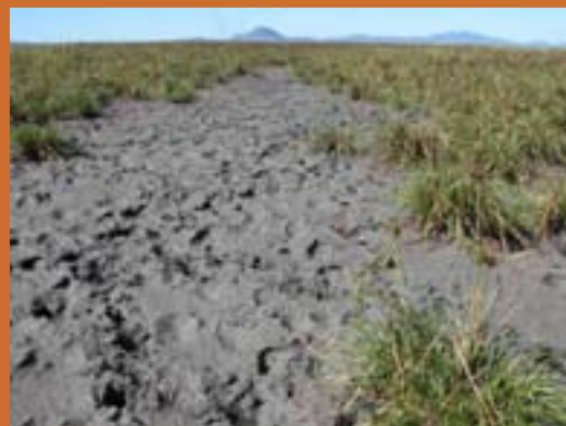
Cattle pugging in a coastal grass-sedge wetland.