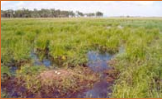
Brolga Grus rubicunda nest and eggs in a coastal grass-sedge wetland.