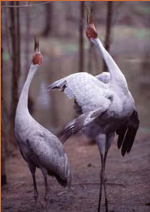
Brolgas Grus rubicunda performing the elaborate courtship and bonding dance. During the dry season brolgas may congregate in flocks of several hundreds, but during the wet season, form territorial pairs in shallow wetlands to breed.