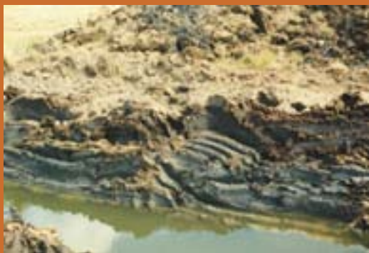
Potential acid sulfate soils (also called “marine mud” or “mangrove mud”) are typically dark grey, wet and sticky. They can range from sand to clays.

As coastal grass-sedge wetlands are found on the marine and alluvial plains across the landscape, the underlying substrate may consist of acid sulfate soils (ASS). Draining grass-sedge wetlands can change water flows and disturb naturally occurring but potentially destructive ASS. When exposed to air these soils produce acid and can cause significant environmental and economic impacts such as the poisoning of aquatic species and the degradation of concrete and steel structures. Swamps that have been drained support more frequent and more severe fires, which in turn can lead to the exposure of ASS.