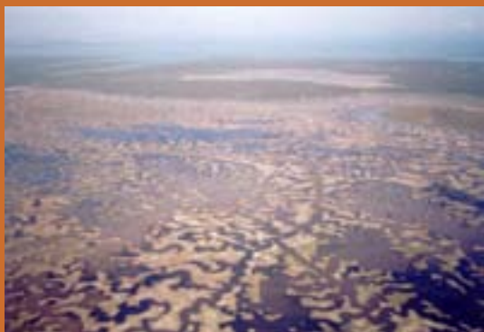
Complex networks of shallow depressions and channels, Torilla Plain.

The setting for coastal grass-sedge wetlands dictates that they do not have capacity to retain any great depth of water. Accordingly, inundation is usually temporary, ranging from a few weeks each year during periods of heavy rain and flash flooding, to many months. In some cases, the wetlands may dry out only for a short period in the dry season or may remain wet in the innermost parts.