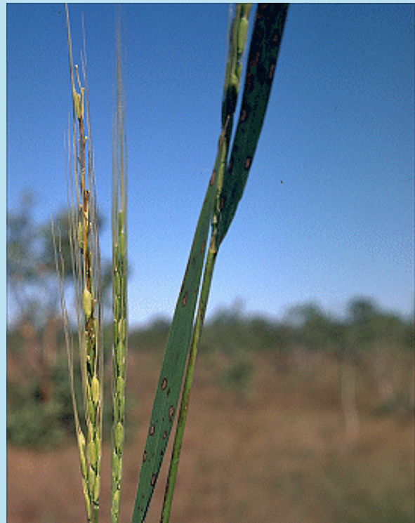
Spikelet of Australian rice Oryza australiensis .

The original source of rice that is grown commercially in Australia today is the Asian wetland plant Oryza sativa . In tropical Australia, several species of this genus naturally occur, including O. australiensis and O. rufipogon . In the wet season, these plants may grow to 1m or 2m in height, either as isolated tussocks or in dense patches or swards, but they bend under the weight of mature stalks and seeds and eventually collapse and dry out. The seeds are attached to long silvery awns (forming “beards”) and are smaller than commercial rice grains. In coastal floodplains of the Northern Territory, Australian rice is a key component of the food chain, providing food for young magpie geese, and for native rats that, in turn, are preyed upon by snakes and other animals. In Queensland, the plant mainly occurs in Gulf of Carpentaria catchments and is a prominent feature of four REs (see Appendix 1). Little is known about management issues in Queensland but the disappearance of wild rice from some large wetlands of the Barkly Tableland of the Northern Territory has been attributed to unsustainable grazing practices.