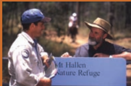
QPWS ranger and a nature refuge landholder.

The NRM plans produced by the regional bodies are designed to focus on catchment assets and pressures and are part of a larger picture for natural resource management. The plans operate within other local, regional, State and Australian Government planning processes (legislation, policies and strategies) and industry codes of practice. These regional bodies have trained project officers who co-ordinate field days, conduct property visits and assist landholders and councils in accessing current land management information as well as providing incentive funding to complete on-ground works. For more information on the regional body operating in your catchment and their funding opportunities go to www.nrm.gov.au/state/qld/index.html#regions .