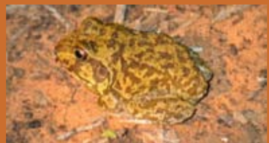
Eastern snapping frog Cyclorana novaehollandiae .