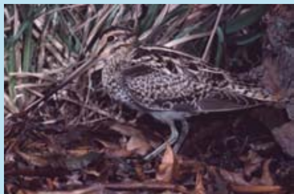
Latham's snipe Gallinago hardwickii migrate from their breeding grounds in Japan for the austral summer.

Latham's snipe Gallinago hardwickii , formerly named "Japanese snipe" because a large proportion of its population breeds in Japan, is a migratory shorebird that commonly occurs in coastal grass-sedge wetlands in eastern Australia during the non-breeding period (August to April). Displaying barred and streaked, brown and white plumage, the Latham's snipe can also be distinguished from the (only) distantly related Australian painted snipe Rostratula benghalensis australis by its longer straight bill, short rasping call and typical fast, towering escape flight. The bird was formerly a popular target for recreational hunting. Many Latham's snipe occur in Queensland only during migration, spending the austral summer in southern Australia; some extensive coastal grass-sedge wetlands in Queensland may be important staging areas during northward migration. Although able to find its preferred invertebrate food in a variety of freshwater wetland types, including artificial and