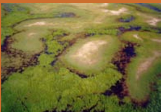
Aerial view of Eleocharis swamps.