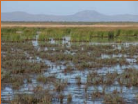
Transition from saltmarsh wetland to coastal grass-sedge wetland.

Coastal grass-sedge wetlands adjoin or merge with a wide range of other wetland types. On marine plains, they lie between saltmarsh wetlands and upland (non-wetland) ecosystems; on alluvial plains they may lie between river channels/levees and the high ground at the floodplain edge, surrounded by infrequently inundated floodplain and often they occur patchily within complexes of wetland types such as coastal melaleuca swamps and braided river channels. Frequently, the boundaries of each type are not clear and may change over time as determined by patterns of rainfall and flooding. A consequence of these patterns is that coastal grass-sedge wetlands must be managed in an integrated way with other wetland types on marine and alluvial plains.