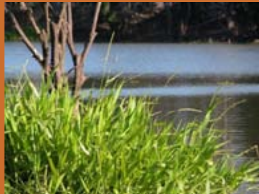
Olive hymenachne Hymenachne amplexicaulis is difficult to control once established in wetlands including coastal grass-sedge wetlands.

The use of fire to control rank growth of wetland vegetation and to encourage fresh new growth is a technique that has been used by Aboriginal people and subsequently by European managers of coastal grass-sedge wetlands. However, the frequency, intensity and timing of fires has changed since European settlement and research is needed to determine the fire regime that will produce optimal outcomes for both graziers and biodiversity. Fires should be carefully planned around the season and conditions for burning. The reeds Phragmites sp. and the sedge Bolboschoenus fluviatilis are very susceptible to frequent fire and may disappear from the wetland over time.