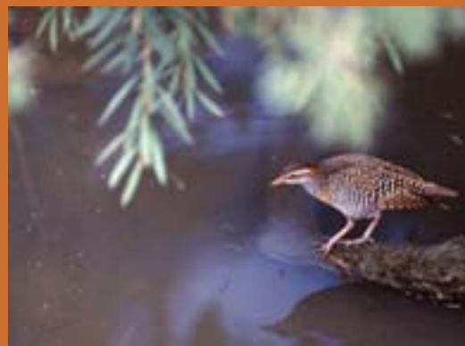
Buff-banded rail Gallirallus philippensis prefers habitat of dense vegetation or tussock grasses close to swamps, watercourses or on coastal islands.

species' core breeding area in Australia) attend their nest mounds in coastal grass-sedge wetlands; and comb-crested jacanas Irediparra gallinacea place floating nests among waterlilies within grass-sedge swamps. Black swans Cygnus atratus and black-winged stilts Himantopus himantopus often nest in coastal grass-sedge wetlands, on mounds in more open parts that have been established, for example, because of saline inundation.