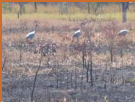
Brolgas Grus rubicunda feeding post fire, Townsville Town Common.