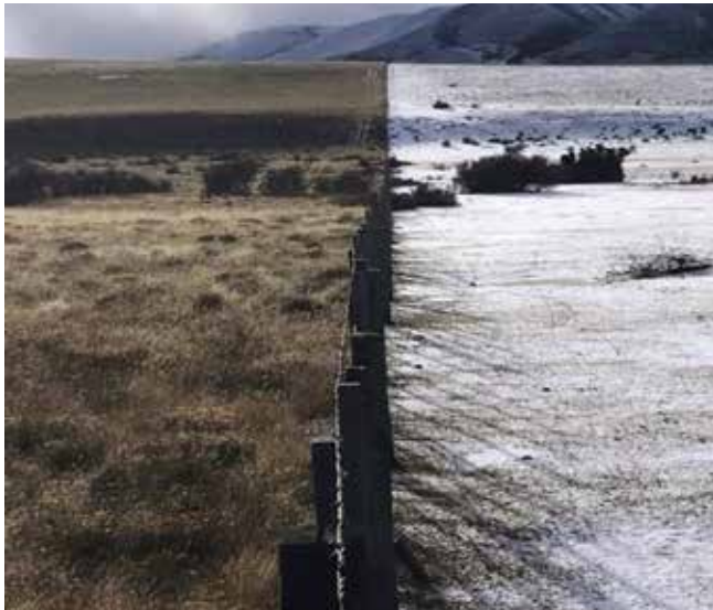
ABOVE Table 5: On the left is an abundant cover and diversity of species while the right has bare soil. The difference results from how the landscape is managed, and in terms of temperature extremes the difference is profoundly significant. Patagonia, 21 July 2020.