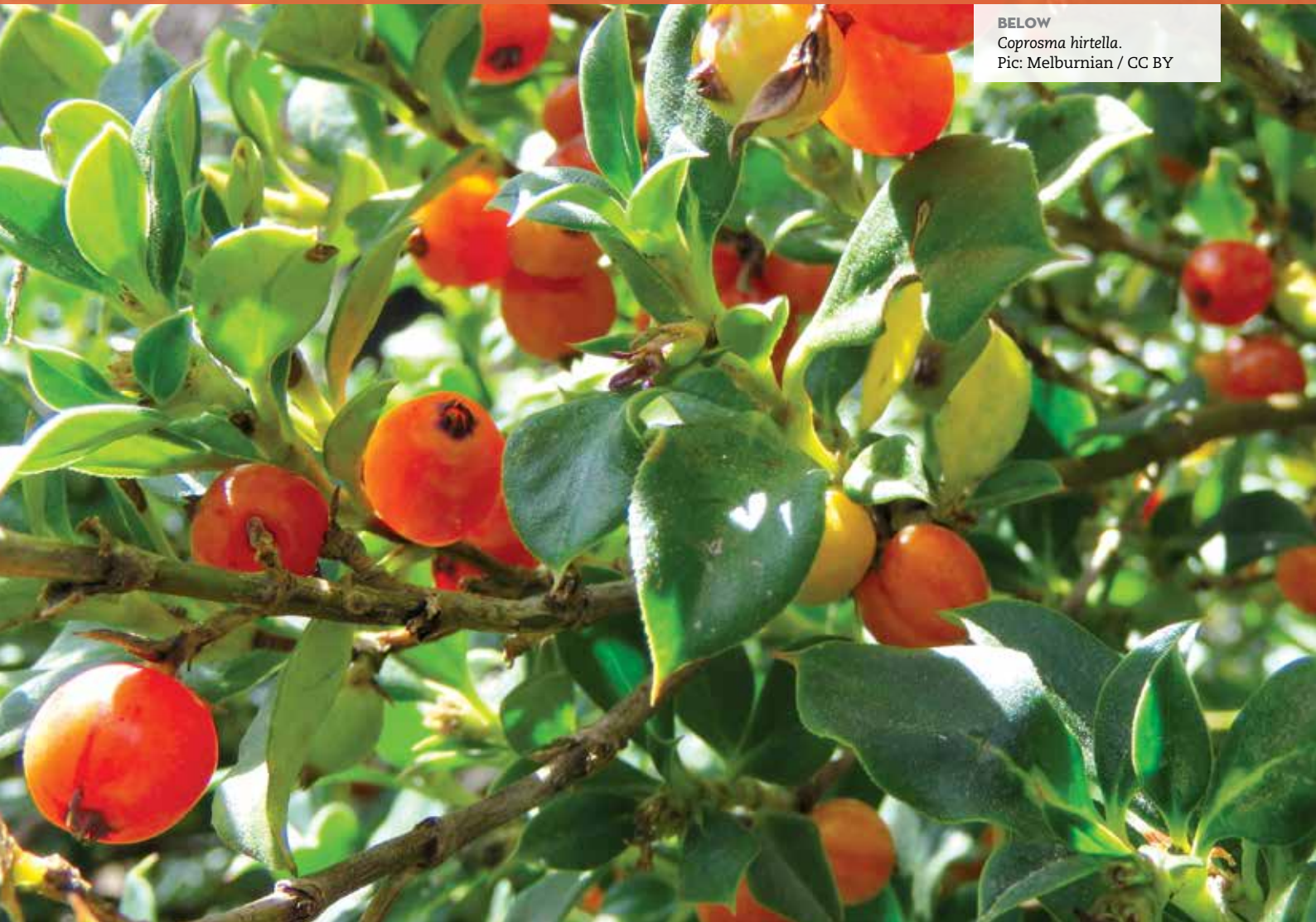
BELOW Coprosma hirtella.