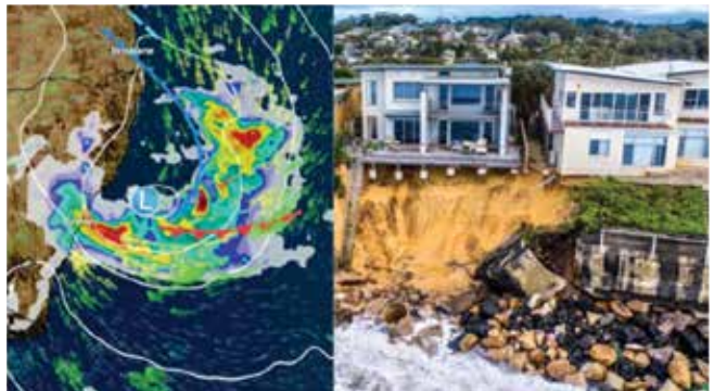
ABOVE Table 8: When we have dysfunctional ecosystems on large areas of land, we have greater evaporation and evapotranspiration, and less transpiration and condensation. The water cycle is less capable of functioning effectively. This, in turn, leads to a 'rejection' or 'pushing back' of weather events entering the land environment, which escalates the intensity of storms at sea.