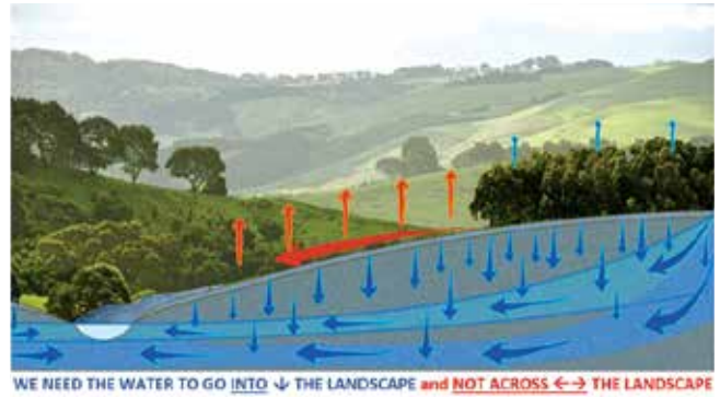
ABOVE Table 6: An efficient water cycle is essential in order to have an effective nutrient (and carbon) cycle, a beneficial solar energy flow and an ongoing succession of community dynamics. We cannot have one without the others.