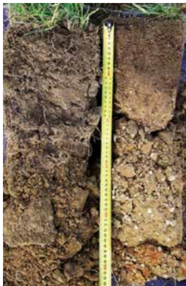
RIGHT Table 7: Left is a deep carbon rich soil profile - stored, stable and resilient. Right has a volatile 100mm of topsoil, dependent on regular rainfall. These two core soil profiles were taken on the same day, from one side of a fence to another. The difference in water holding capacity and temperature/ climate mitigation is the result of different landscape management.