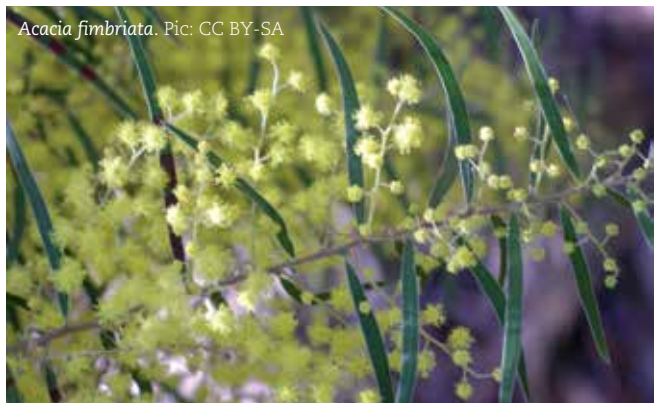
Acacia fimbriata.