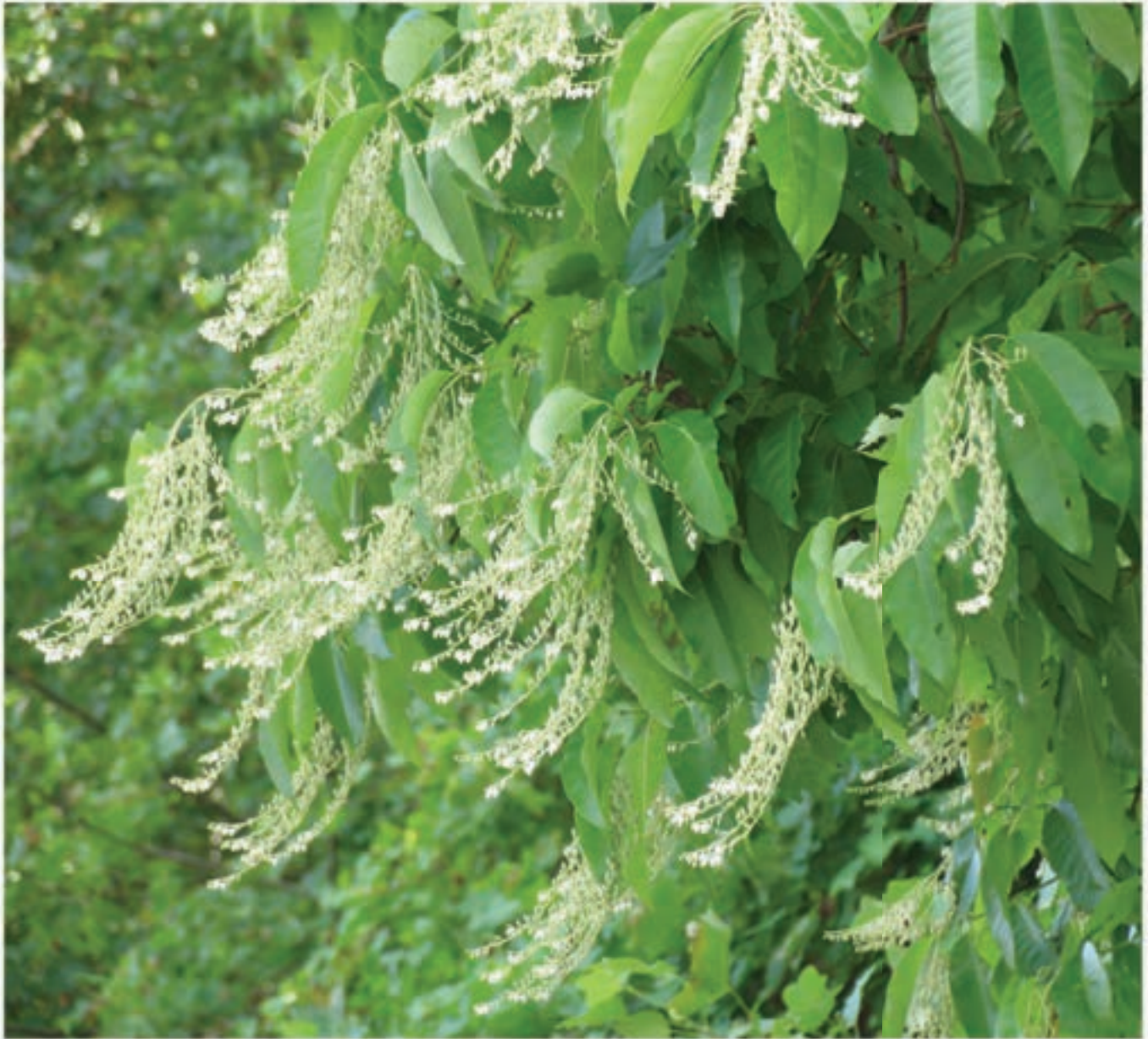
Figure 5: Sourwood racemes with flowers.