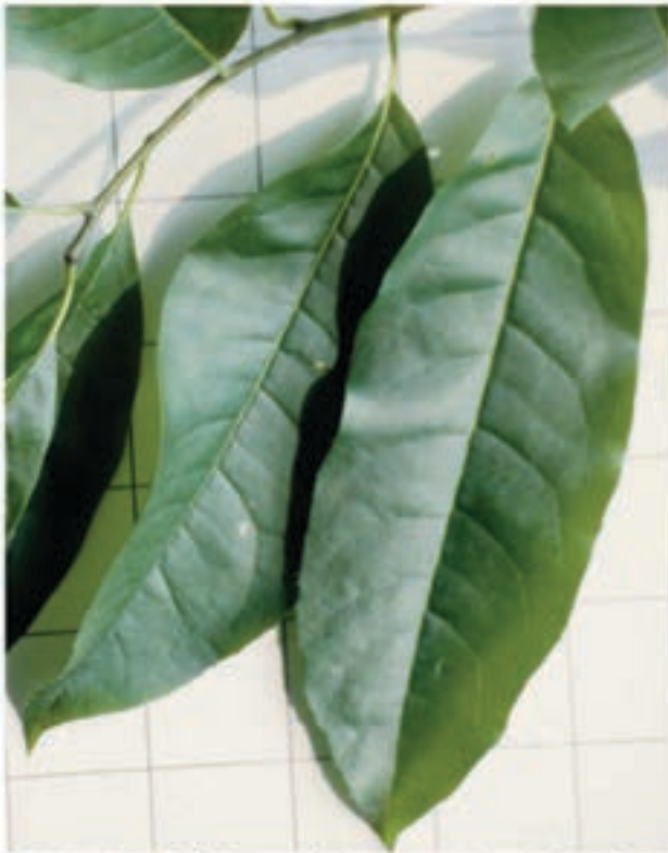
Figure 3: Sourwood leaves on 1 inch by 1 inch square grid and in the wild. Leaves are fully expanded by June.