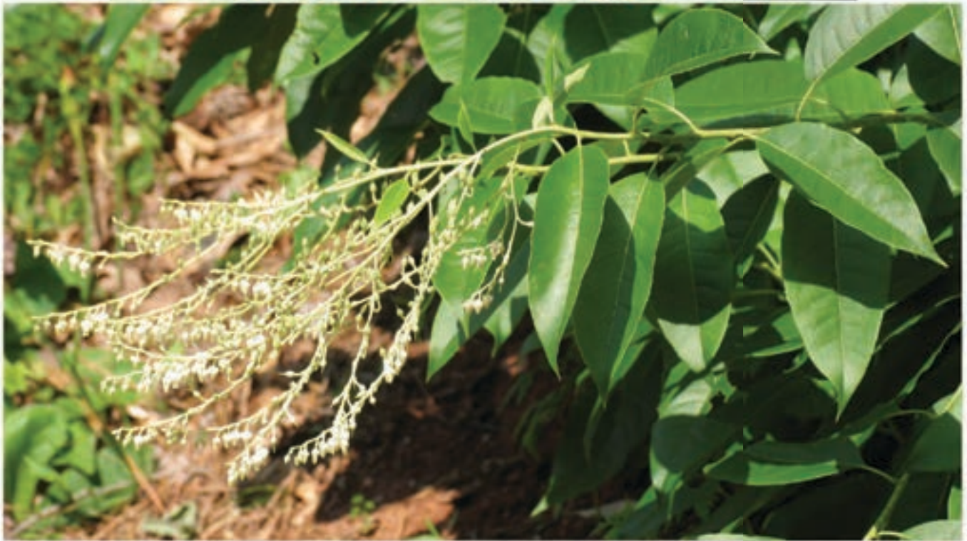
Figure 4: Sourwood leaves & flowers.