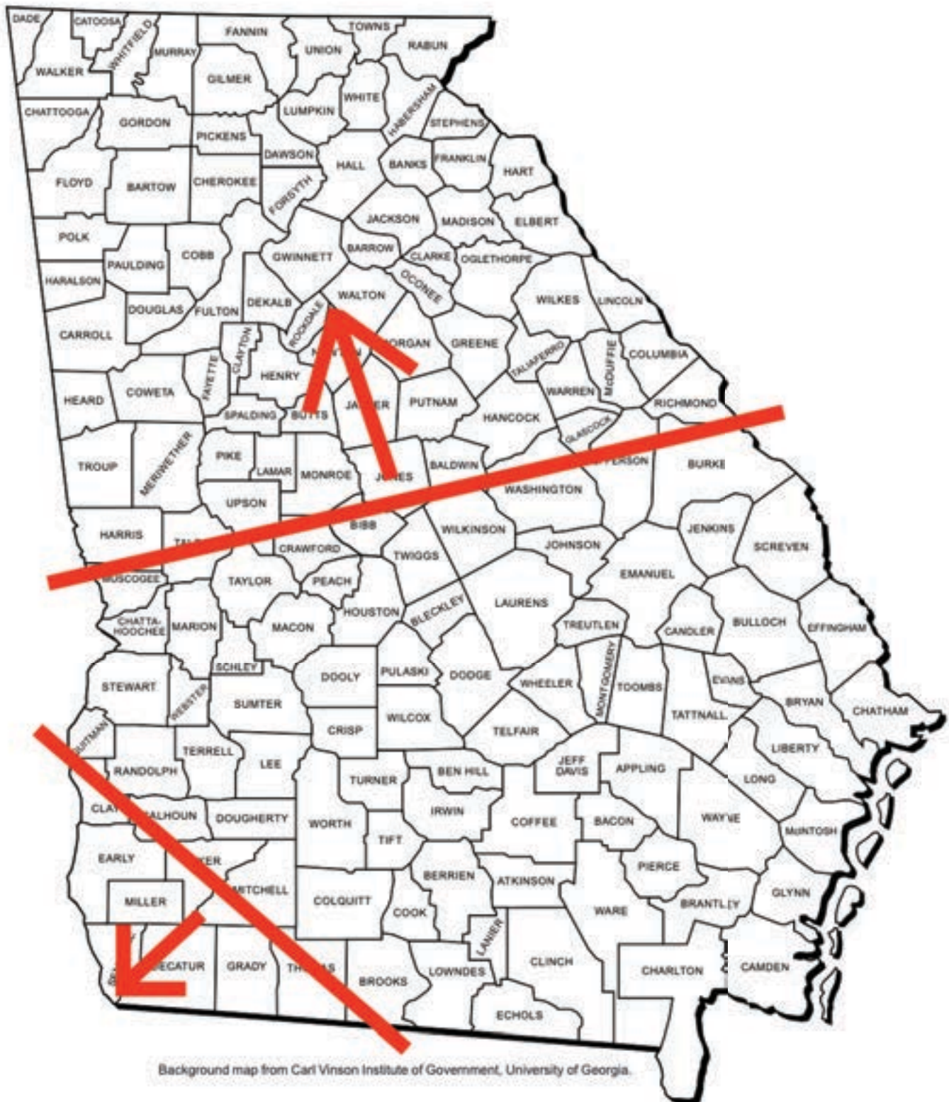
Figure 2: Oxydendrum arboreum - sourwood generalized native range in Georgia.

Range based upon herbarium records, federal agency maps, and personal observations.