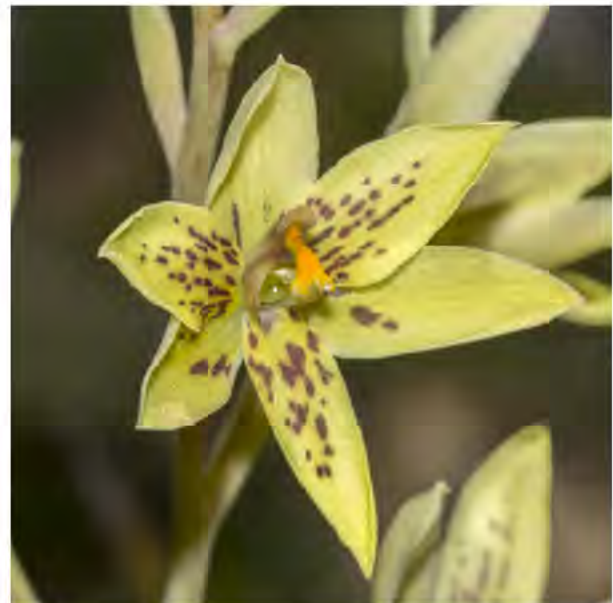
Thelymitra villosa - Custard Orchid