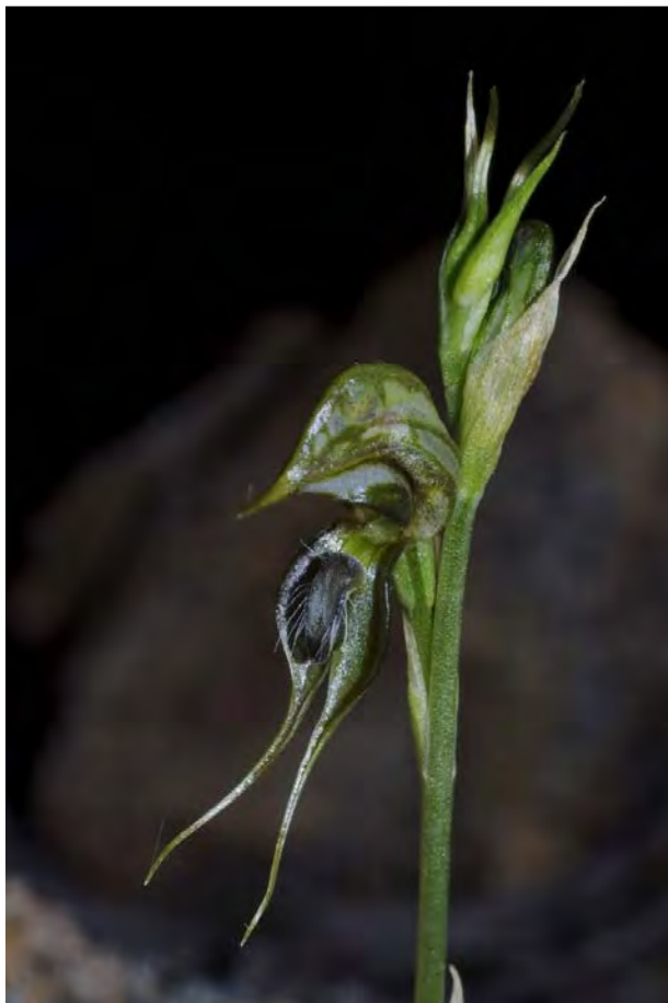
Pterostylis sp greasy - Greasy Rufous Greenhood