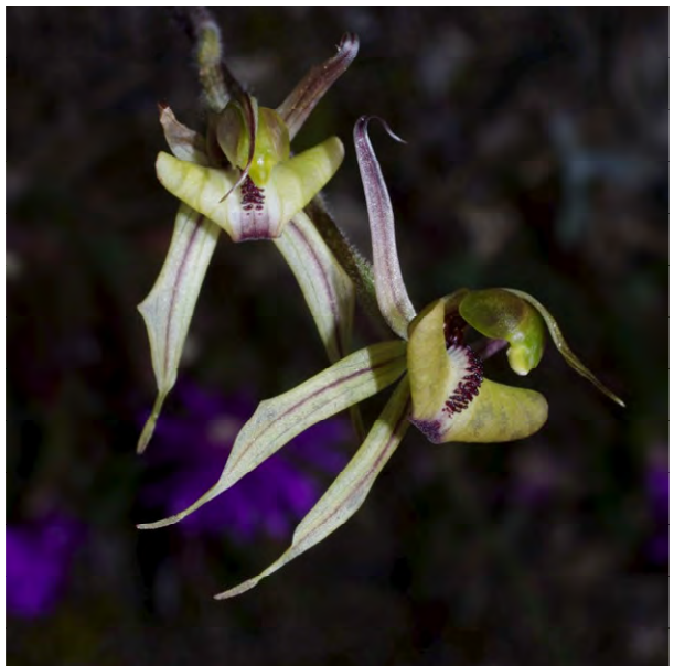
Caladenia brevisura - Short-sepaled Spider Orchid