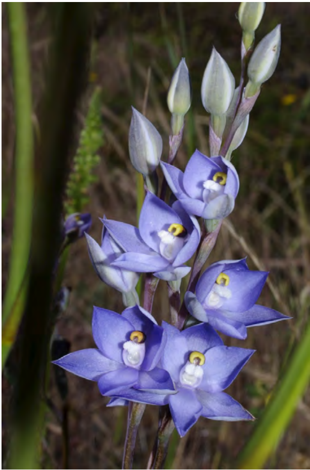
Thelymitra petrophila - Granite Sun Orchid