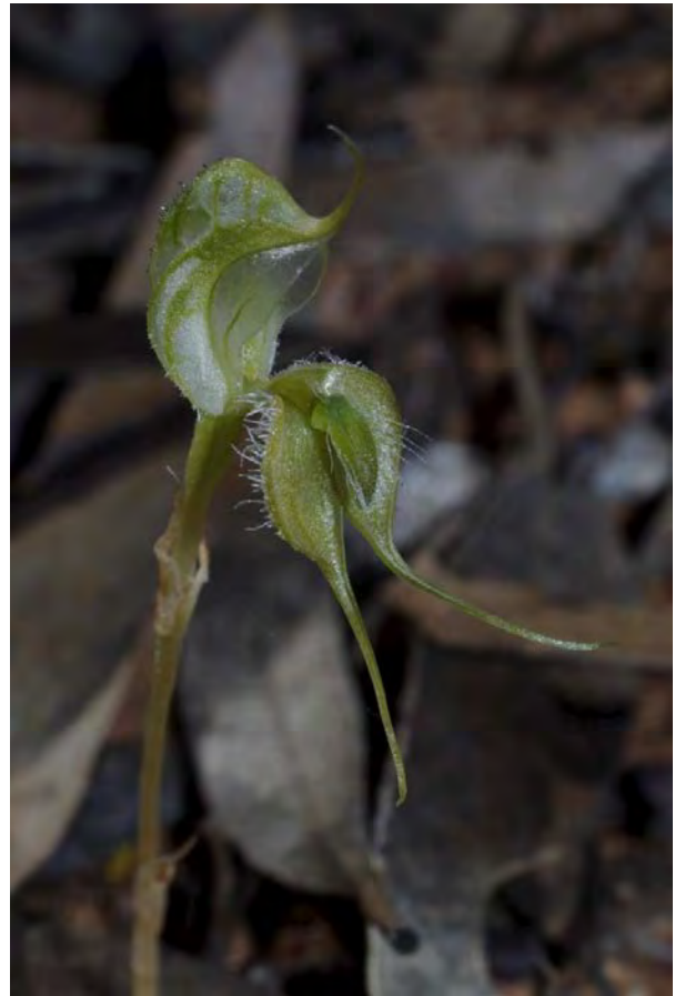
Pterostylis ciliata - Hairy Rufous Greenhood