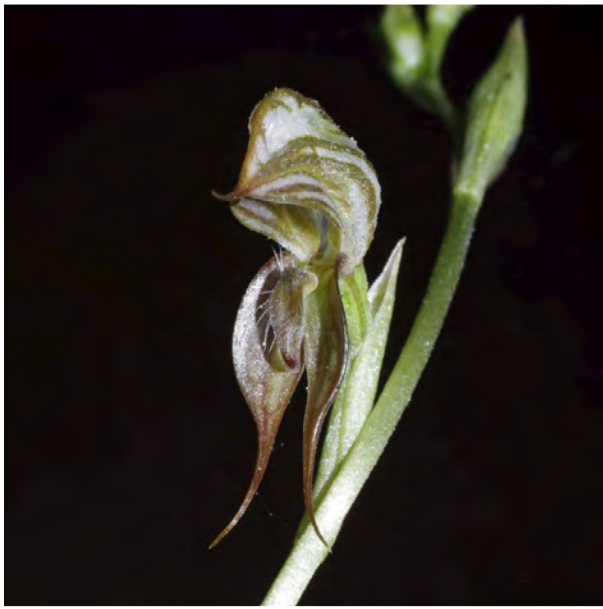
Pterostylis sp dainty brown