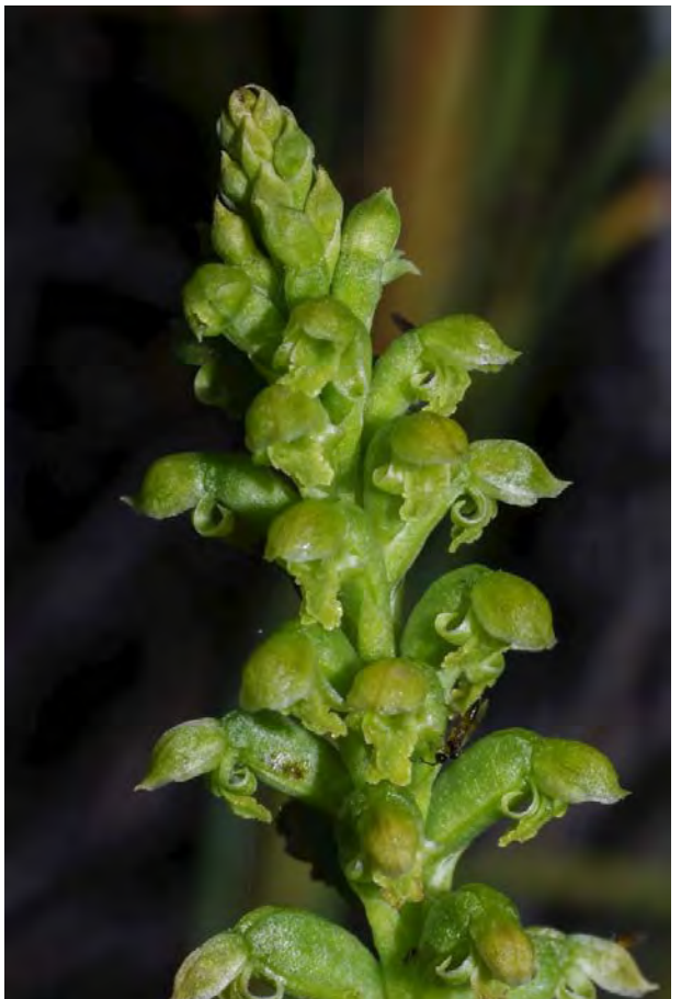
Microtis eremicola - Desert Mignonette Orchid