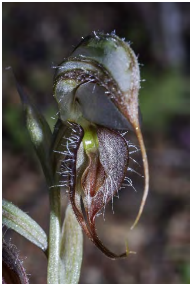
Pterostylis spathulata - Spoon-lipped Rufous Greenhood