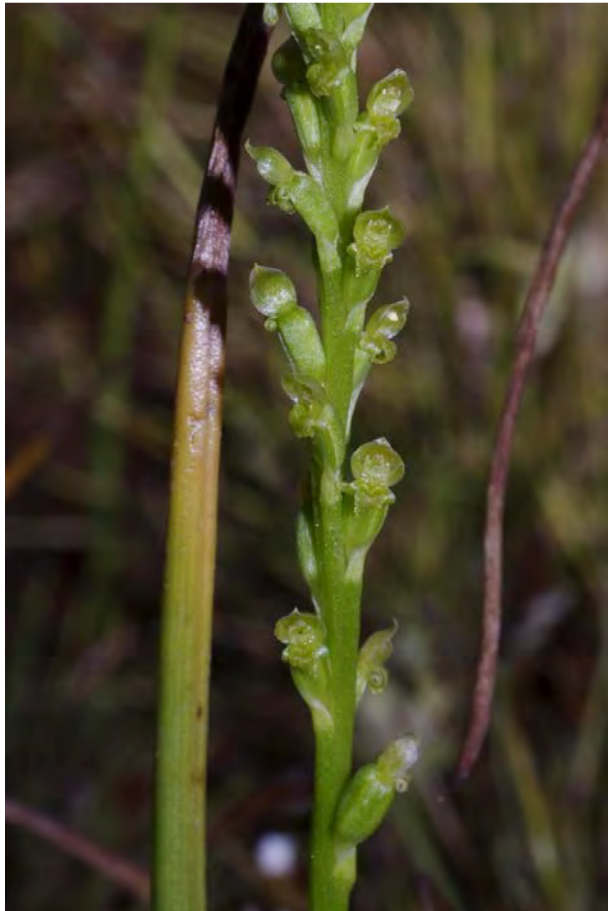
Microtis eremaea - Slender Mignonette Orchid