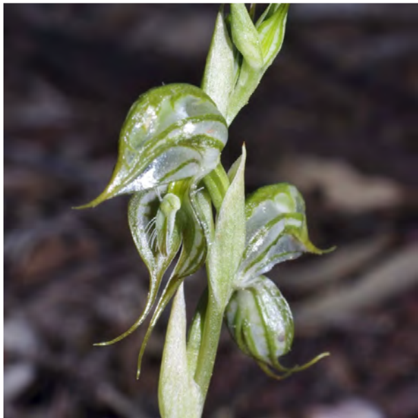
Pterostylis leptochila - Ravensthorpe Rufous Greenhood