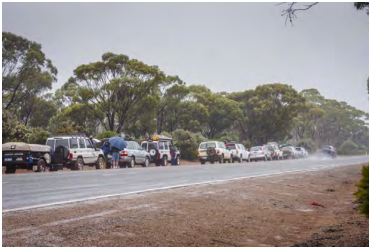
Rain interrupted play! Day 5