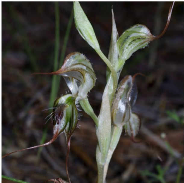
Pterostylis sp exerted labellum