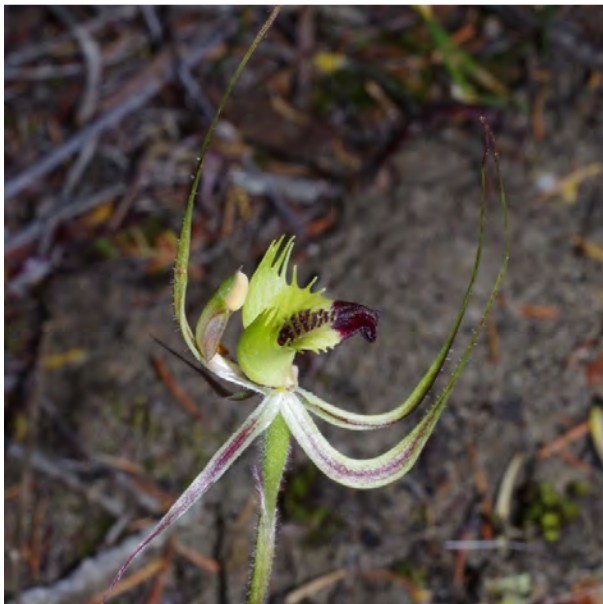
Caladenia attingens subsp gracillima - Small Mantis Orchid