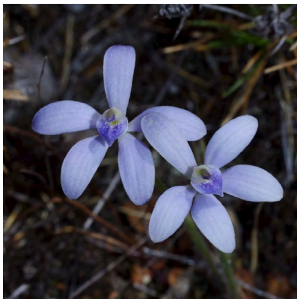
Cyanicula ashbyae - Powder-blue China Orchid