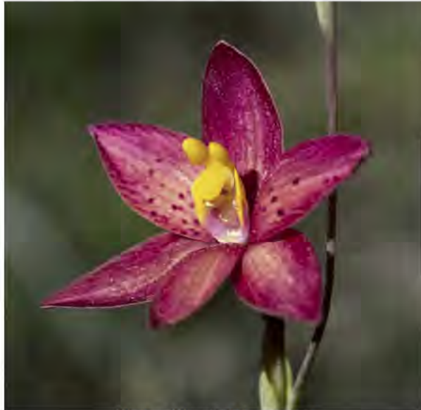
Western Wheatbelt Sun Orchid

The photo labelled Western Wheatbelt sun orchid from Dragon rocks was in fact Thelymitra spiralis (note: both Thelymitra spiralis and Thelymitra maculata grow at Dragon Rocks)