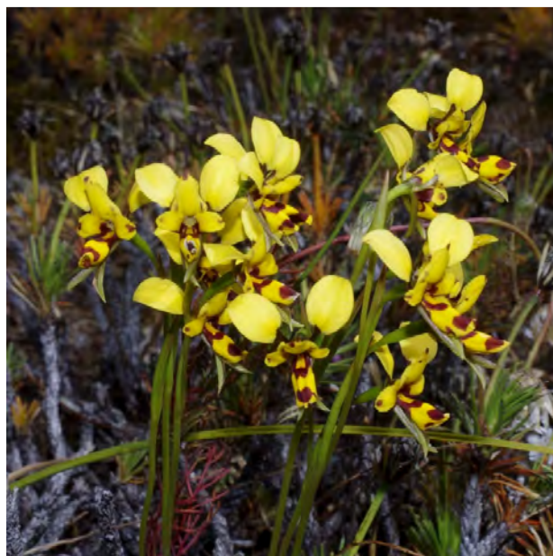
Diuris picta - Granite Donkey Orchid