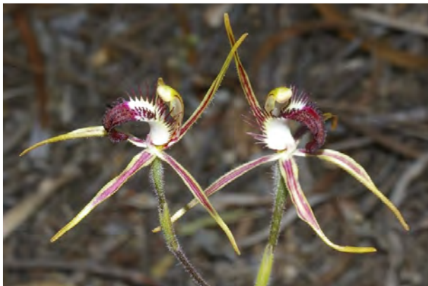
Caladenia graniticola - Pingaring Spider Orchid Pterostylis sp dainty brown