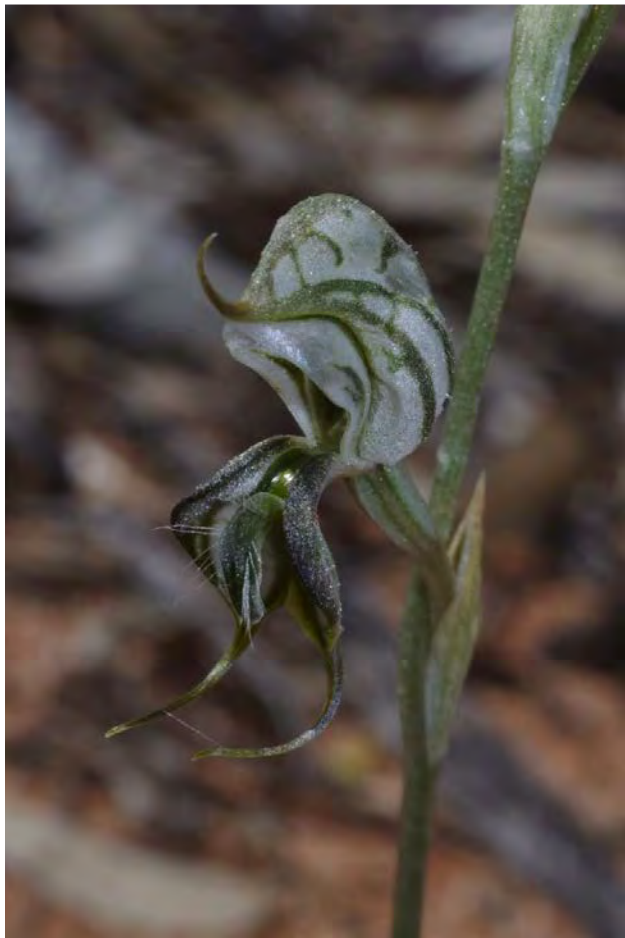
Pterostylis insectifera - Insect-lipped Rufous Greenhood