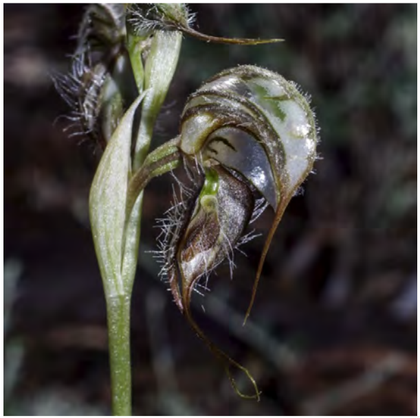
Pterostylis sp straight top