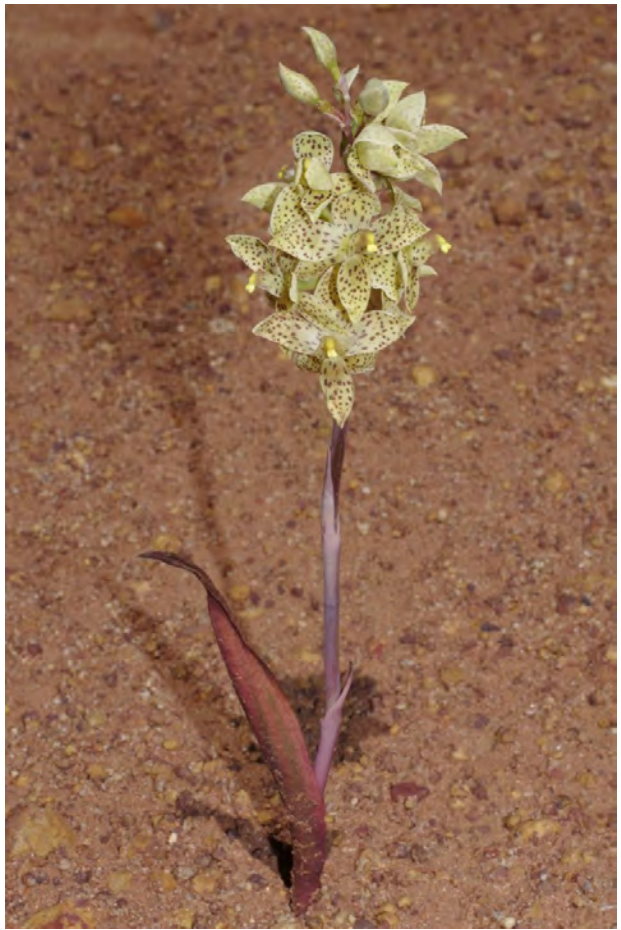
Thelymitra sargentii - Freckled Sun Orchid