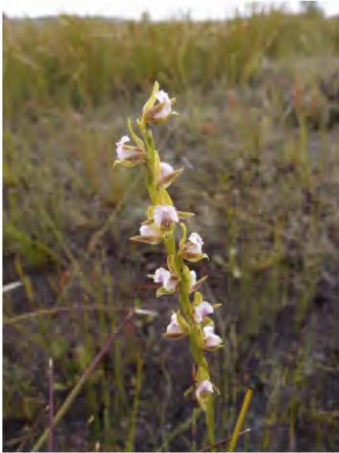
Prasophyllum fimbria - Fringed Leek Orchid