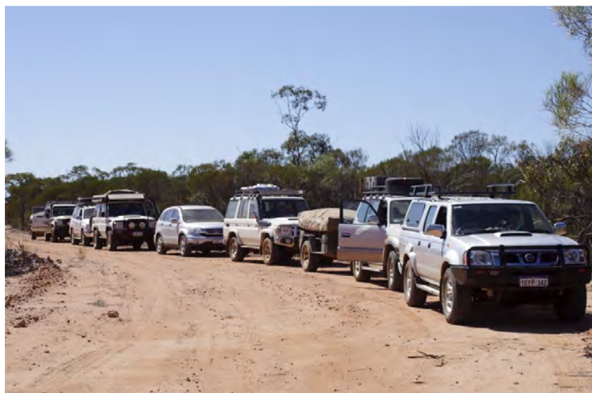
Convoy Day 3