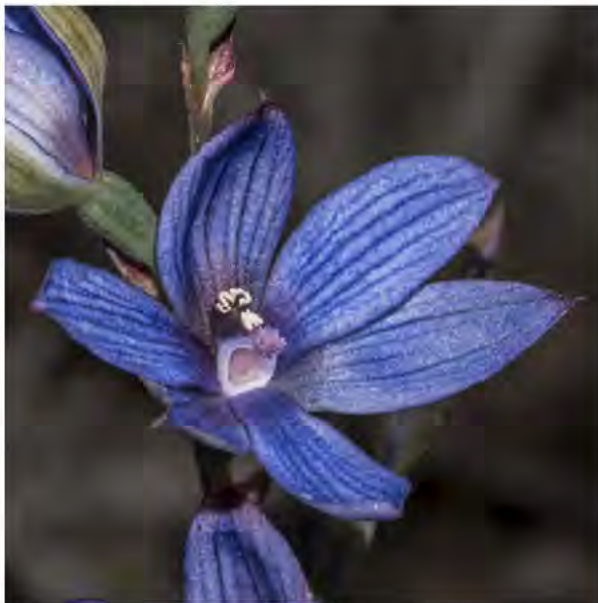
Thelymitra latiloba - Wandoo Sun Orchid