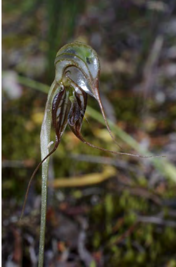
Pterostylis aff spathulata (long sepals)