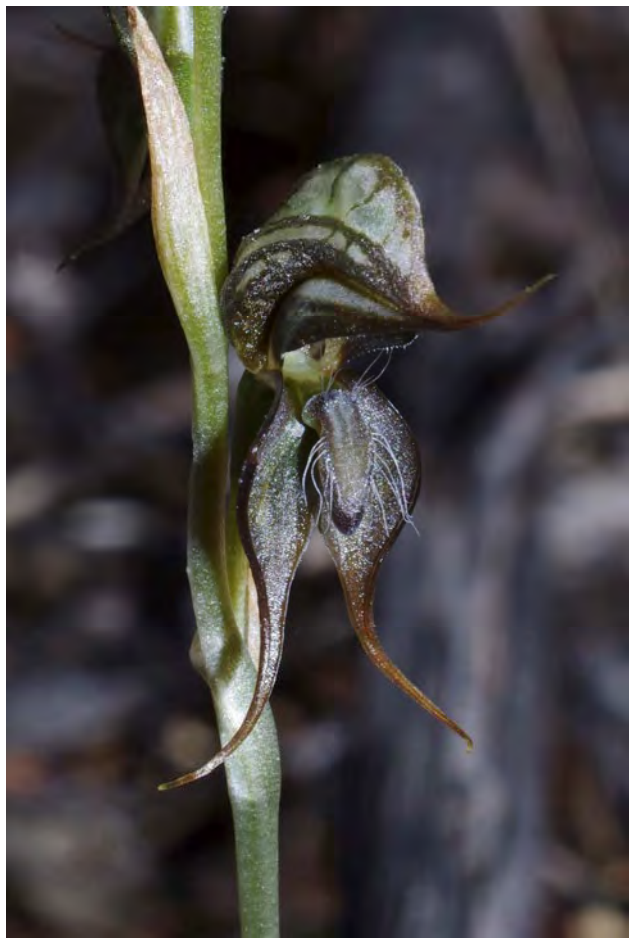
Pterostylis roensis - Rufous Greenhood