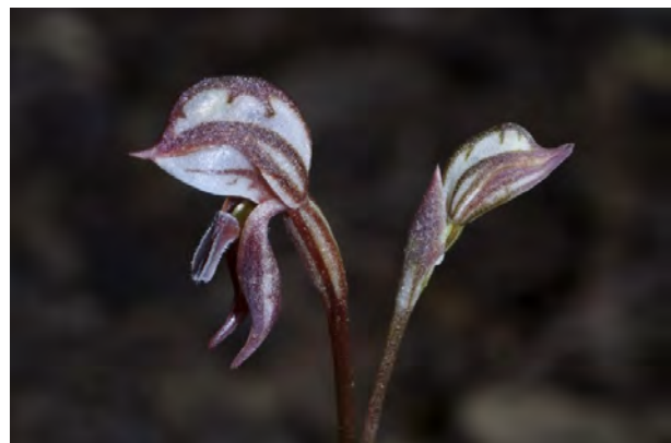
Pterostylis sp. Ongerup