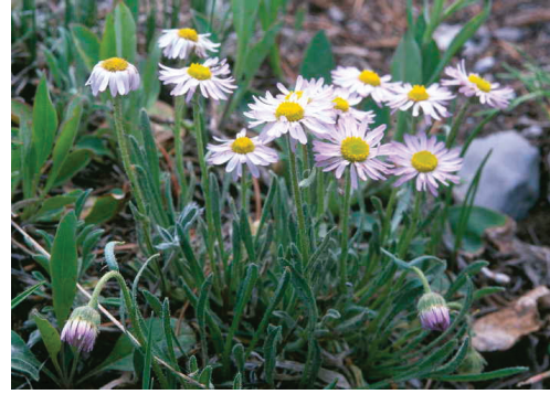
FIG. 4. Erigeron vetensis (sect. Stenactis). Ray corollas are reflexing, heads nodding in bud.

E. arenarioides (D.C. Eaton ex A. Gray) A. Gray ex Rydb.