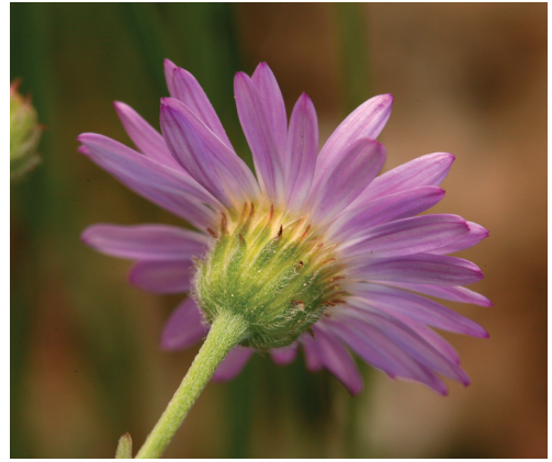
FIG. 7. Erigeron filifolius (sect. Filifolii ). Close-up of head. Photo by Steve Matson, 2006, from CalPhotos database.

Perennial, taprooted; caudex simple or more commonly a multicapital crown or with elongating branches, forming mats ( E. acomanus , E. tener ) connected by systems of lignescent rhizomes and caudex branches; vestiture short-strigillose to villous, hirsute, or glabrous, hairs white ( E. tener , E. acomanus , E. tweedyi , and E. wilkenii have similar vestiture; E. cronquistii , E. evermannii , E. subglaber glabrous to glabrate); stems branching (simple in E. acomanus , E. wilkenii ); leaves spatulate to oblanceolate, entire, with expanded and indurate petiole bases, often folding, not clasping; heads 1 or 1–3, nodding in bud ( E. acomanus , E. tweedyi ), behavior unknown in others; phyllaries with a broad green midband, minutely glandular; rays white to pink, not coiling (or coiling in