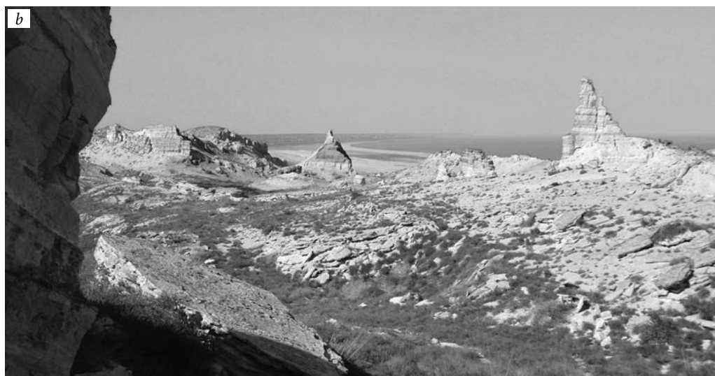
Fig. 1. The geographic location of the Aral Sea: a — satellite image of Aral Sea, 2014 ( http://earthobservatory.nasa.gov/IOTD/view.php?id=84437 ); b — landscape photo of seafloor of Aral Sea, May 2014 (Sherimbetov).

A list of vascular plants recorded on the dried bottom of the Aral Sea in its southern part is presented below.