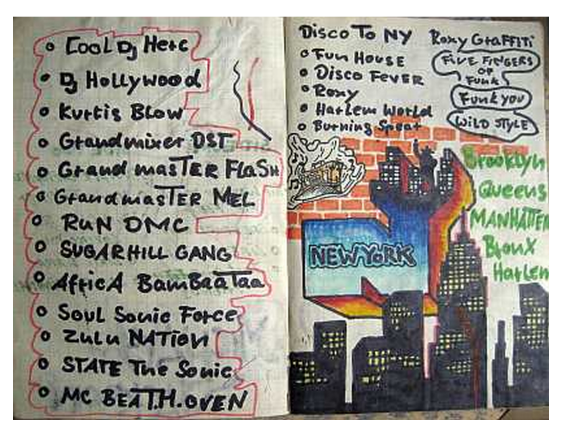
Figure 2: New York © private collection Simo.