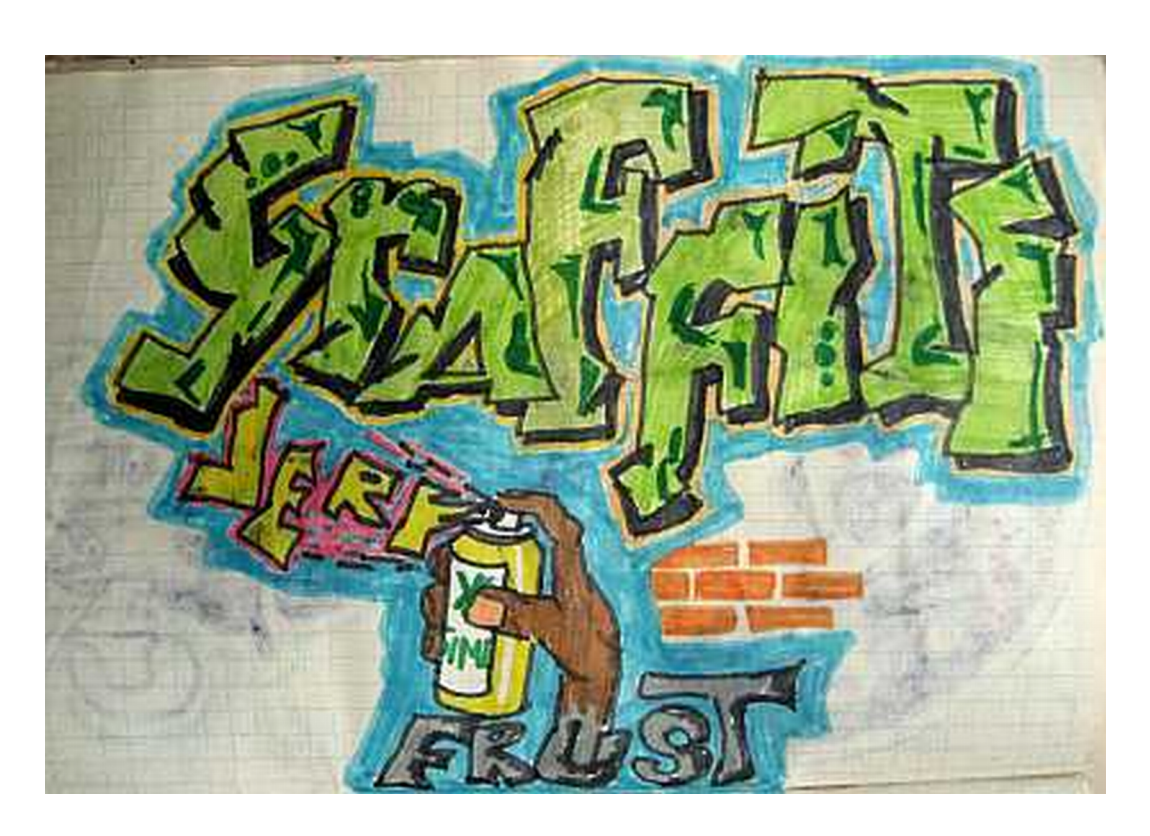
Figure 3: Graffiti Frust © private collection Simo.