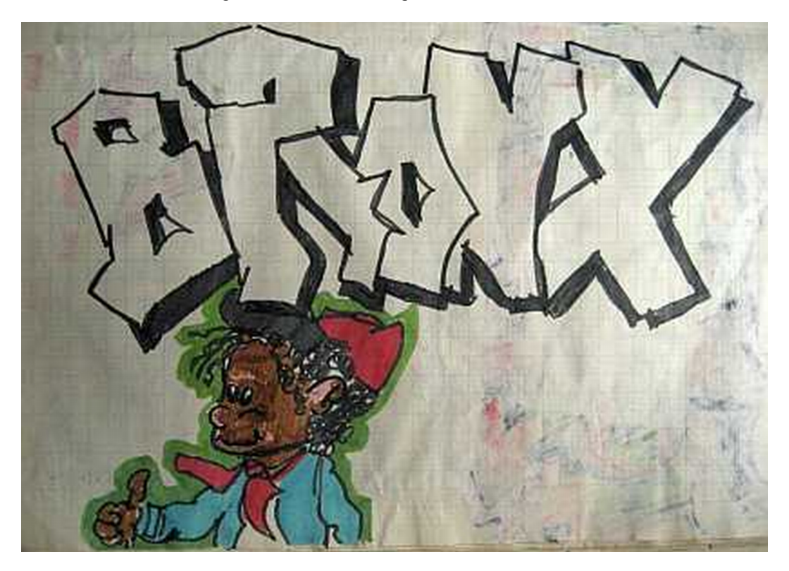
Figure 4: Bronx © private collection Simo.

Simo's mind was in an imaginary Bronx and his body in the local hip-hop scene in Dresden, a pattern he shared with hip-hop heads all over the GDR. He received his