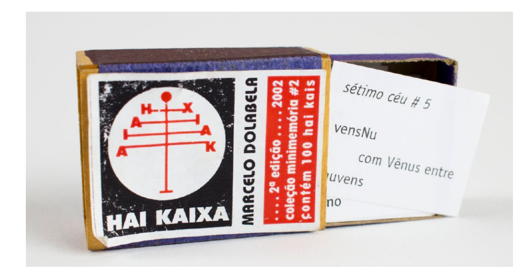
Figure 6 – Hai Kaixa.

I finally want to mention the Hai-kaixa (see Figure 6) by Marcelo Dolabela, a small matchbox that contains one hundred haikais:<sup>66</sup>