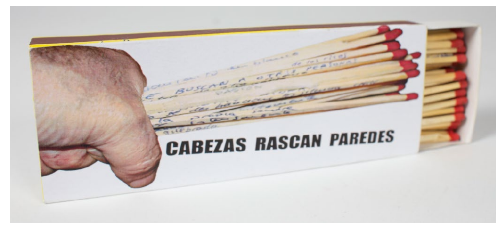
Figure 3 – Cabezas rascan paredes.

Cabezas rascan paredes (Poemas para prender en plena calle) –Heads Scratching Walls (Poems to Light on the Street)– by Julio Fernández Peláez is an object-book made in a matchbox with long matches (see Figure 3).<sup>51</sup> The box, cover and back cover of the book, is a container of 36 handwritten matches or pages that make up the book. On the back cover it is reported that: "Heads Scratching Walls is a book of poetry written in matches / and it is also a matchbox that contains a book of poems", <sup>52</sup> therefore, a book that serves as an object and object that is a book. Each one of the 36 matches are materiality that conveys writing.