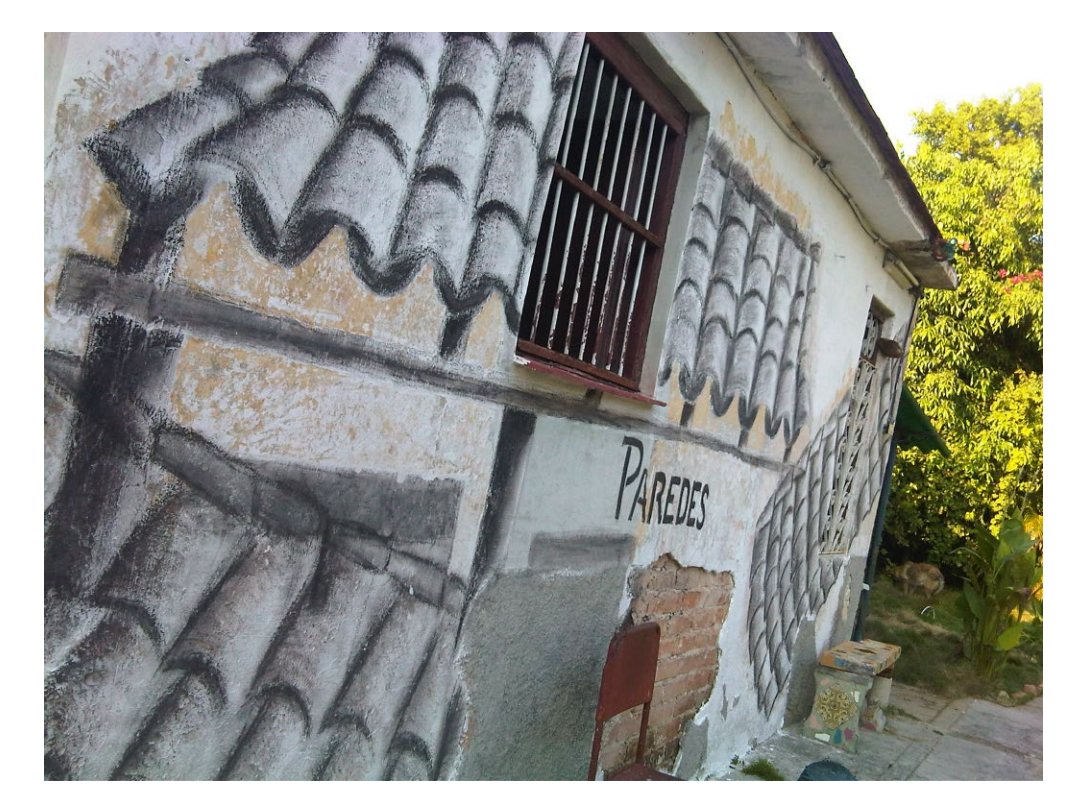
Figure 7 – House-Book.

72. Boa Mistura (2012). São Paulo seems to be an open book as city, not just for the art of graffiti in its streets and avenues, but also for the abundant pichação / pixação or "wall writings" all over the city. For an analysis on pichação in São Paulo as exposed writing, see Pereira (2010, 2016).