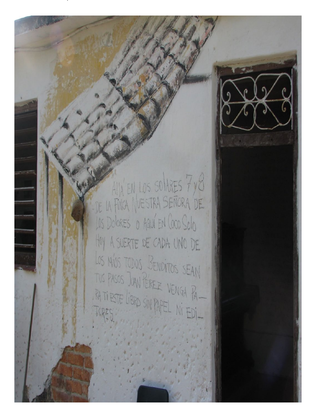
Figure 8 – House--Book.

73. For a short documentary on this project, see: <a href="https://bit.ly/2Yf5Ouc">https://bit.ly/2Yf5Ouc</a>>. Access on: Mar. 28, 2020.