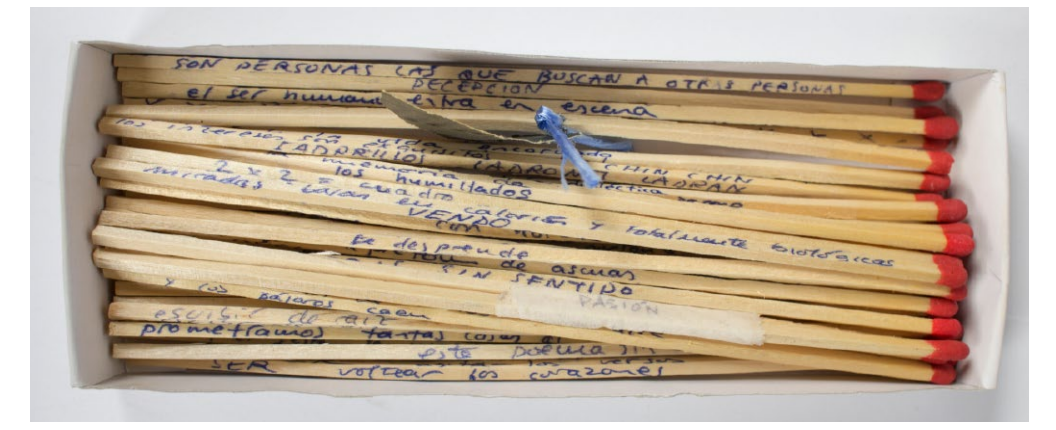
Figure 4 – Cabezas rascan paredes.

Surprisingly, in contrast to careful textual elaboration, the usefulness of the very object is striking, matches industrially created that propose to the reader a performative act: light the poetry, burn the text, reduce it to ashes. There is a strong contrast between the difficult production of the texts and its easy destruction. The hand that writes, it also manipulates the match, the genesis and the death of the text are related to hand movement. The object invites the reader to light the poetry and burn the text.