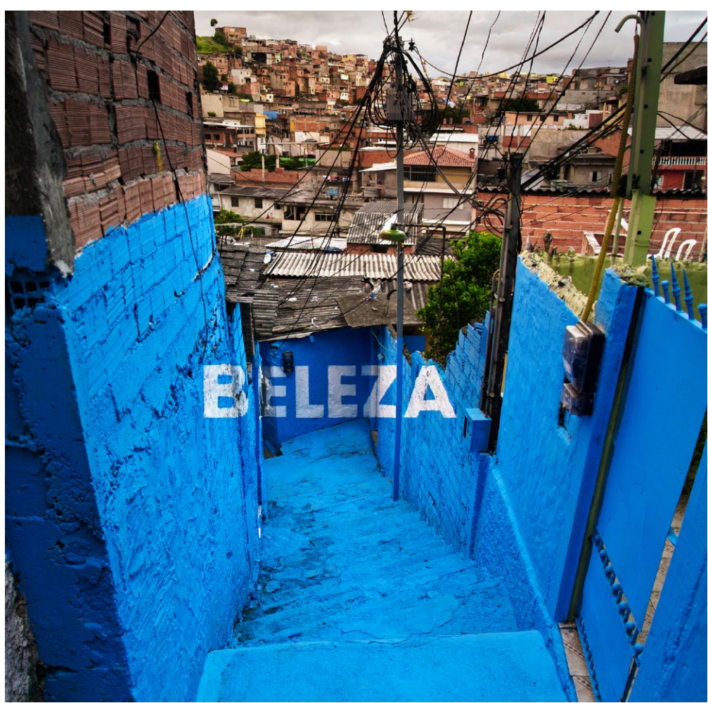
Figure 11 – Beleza / Beauty. Picture: Boa Mistura.

It is meaningful that for the interventions, the members of the community, stigmatized with misery, distress, violence and drugs, chose democratically to print on walls words like "beauty", "persistence", "love", "sweetness", and "pride", all of them full of positive connotations.<sup>74</sup> These are meaningful concepts for dwellers that represent their hopes and dreams, these public writings openly question the stigma that these communities face. The interventions were made in busy alleyways of the neighborhood, the words in the walls will be read but the intention is that oral interaction among passers-by will bring those topics –beauty, sweetness, poetry, love, etc.– to regular conversations. Readers will be surprised to find themselves walking through those art interventions. The permanence of those words in the walls of the alleys remember inhabitants and visitors that the meaning of those words also dwells those spaces that they transit. As aforementioned, Roger Chartier<sup>75</sup> supports the idea that sometimes just