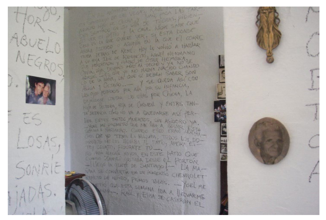
Figure 10 – Corridor.