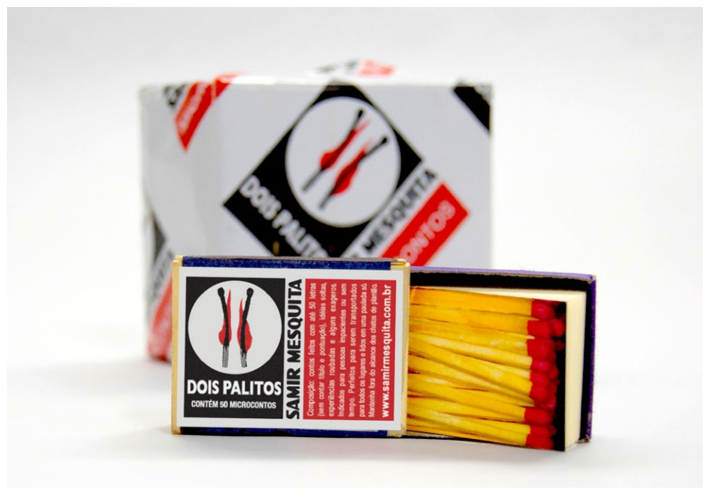
Figure 5 – Dois palitos.

I finally want to mention the Hai-kaixa (see Figure 6) by Marcelo Dolabela, a small matchbox that contains one hundred haikais:<sup>66</sup>