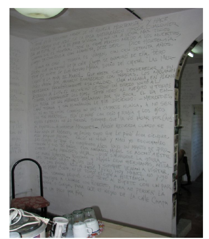
Figure 9 – Kitchen.