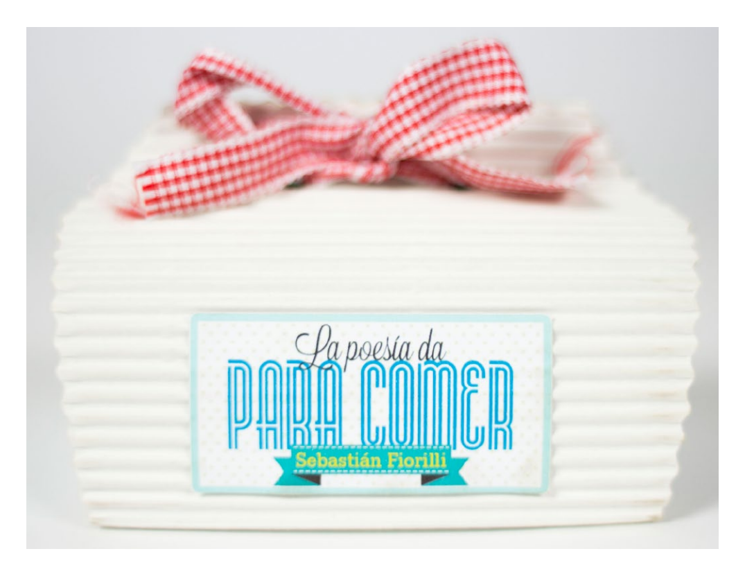
Figure 1 – La poesía da para comer.

These 24 page-wafers are numbered and divided into five blocks that follow an order indicated in the lower right portion of the wafer, so they are not completely autonomous pages. This object-book is also an example of ephemeral art and transitory writing.<sup>36</sup> The wafer, a thin sheet of unleavened bread, is made to be eaten. If the reading process is to mentally digest and meditate in order to understand, this book suggests to physically eat the book: chew it, taste it, swallow it, convert it into an assimilable substance for the organism. The title, Poetry to Eat, suggests ingestion and poetic digestion, the wafer invites the reader to consume it, perhaps in communion. Known as graphophagy, the practice of textual ingestion or consumption has ancient roots, and also an important tradition within the field of object-books.<sup>37</sup> Giorgio Cardona<sup>38</sup> describes graphophagy as a non-linguistic use of texts, and as an old practice considered therapeutic.<sup>39</sup> Cardona offers detailed descriptions of old religious practices in relation to graphophagy, like the one called "written water" among Jews and Muslims.<sup>40</sup> Cardona describes how even today water is used to clean tablets with Koranic verses, or even macerate pieces of paper with Koranic verses and, after the ink dissolves in water, this water is then drunk by believers.<sup>41</sup>