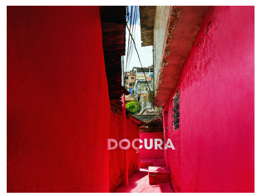
Figure 12 – Doçura/ Sweetness.

the intentionality of binding different parts together could be a book, perhaps these alleyways are binding a book that Boa Mistura just only started to write. Further, Boa Mistura explores here a social function and use of writing when they gathered together many members of the community to intervene those spaces.