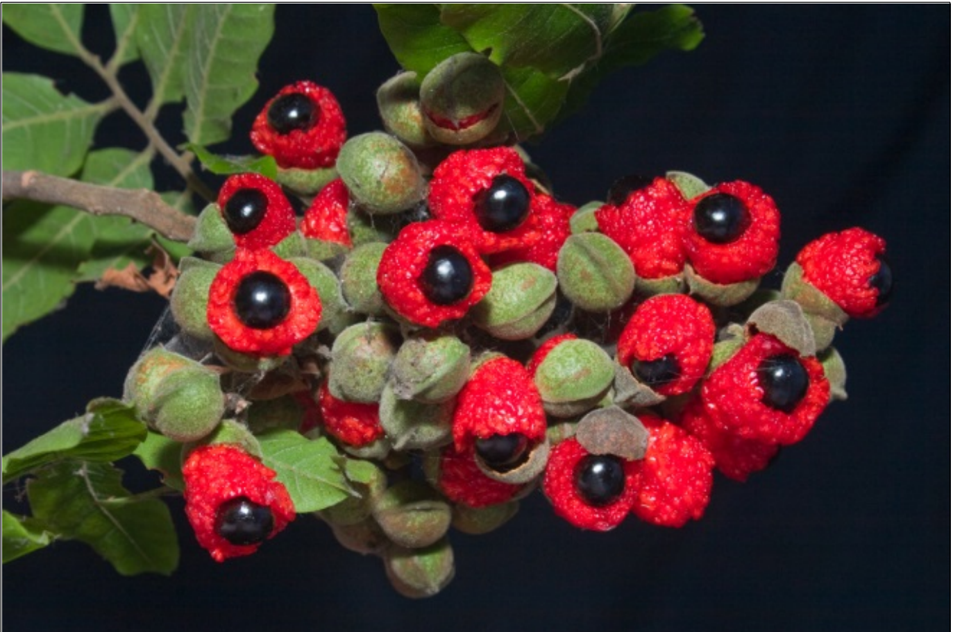
Fig. 1. The amazing if not spectacular seeds of tītoki appear like a black licorice gumdrop embedded in a ripe red raspberry (Casa del Prado, Balboa Park, San Diego, CA).

raspberry and you have a fairly accurate picture of the curious and eye-catching seeds (appearing nearly good enough to eat!), which are sure to draw attention in the garden or landscape ( Fig. 1 ). It performs well in coastal plains and valleys from San Diego to San Francisco and is perhaps somewhat drought tolerant in central California but probably needs regular water in the southern part of the state to look its best.