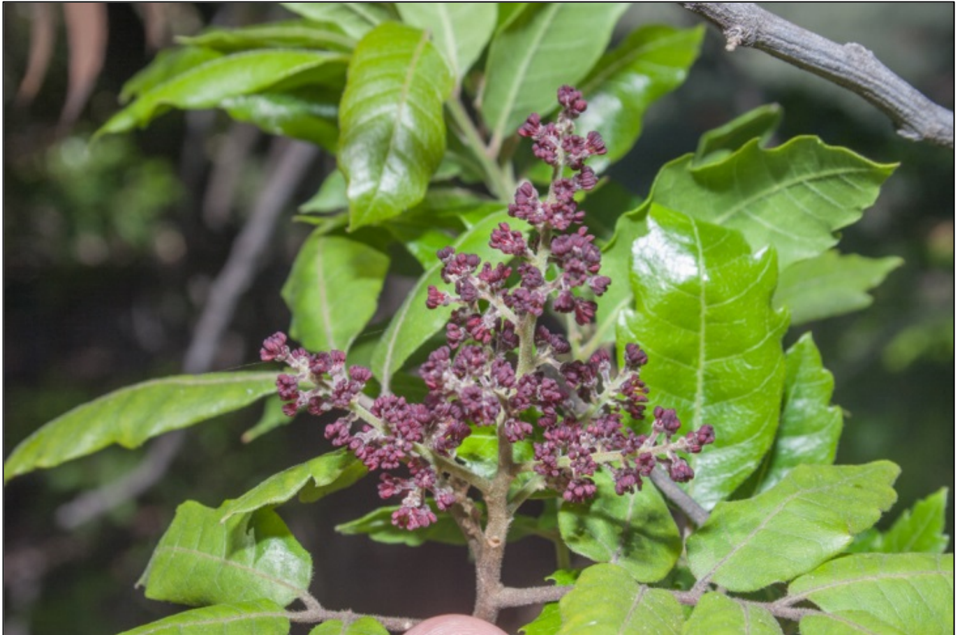
Fig. 7. Flowers of tītoki are small, inconspicuous, lack petals, and have purplish stamens, which give the flowers their color (Los Angeles County Arboretum & Botanic Garden, Arcadia, CA).

growing to 15 to 20 feet in 10 years, 30 feet in 20 years, and 40 feet after 30 to 40 years. These growth rates are similar to those in New Zealand (Parsons 2014). Richards (1956) considered tītoki a hardy, moderately fast-growing tree if on fertile, deep soils.