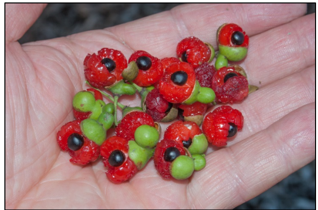
Fig. 15. While somewhat curious and interesting, seeds of Alectryon tomentosus are smaller than and not as showy as those of tītoki (1954-1716-S, Los Angeles County Arboretum & Botanic Garden, Arcadia, CA).