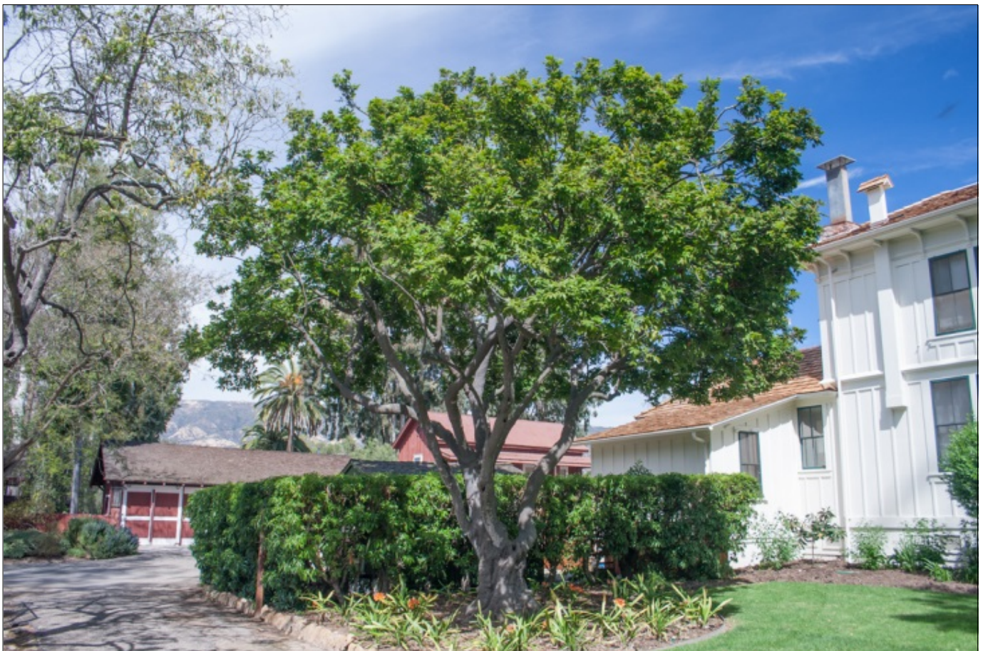
Fig. 2. Tītoki is a medium, slowly to moderately growing, broad-leaf, evergreen tree tending to form an irregularly rounded canopy (Stowe House, Goleta, CA).

Bark: gray to dark gray or nearly black, smooth ( Fig. 4 ).