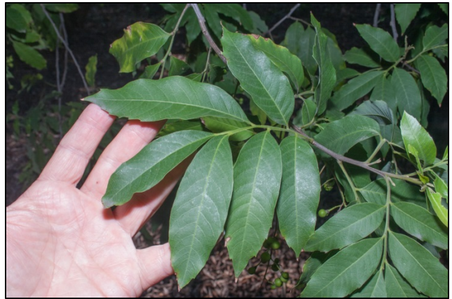
Fig. 13. Alectryon tomentosus from Australia has leaves similar to those of titoki but its seeds, while attractive, are not as large and showy (1954-1716-S, Los Angeles County Arboretum & Botanic Garden, Arcadia, CA).