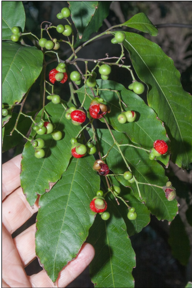
Fig. 14. Alectryon tomentosus has seeds similar to those of tītoki but they are smaller and not as showy (1954-1716-S, Los Angeles County Arboretum & Botanic Garden, Arcadia, CA).