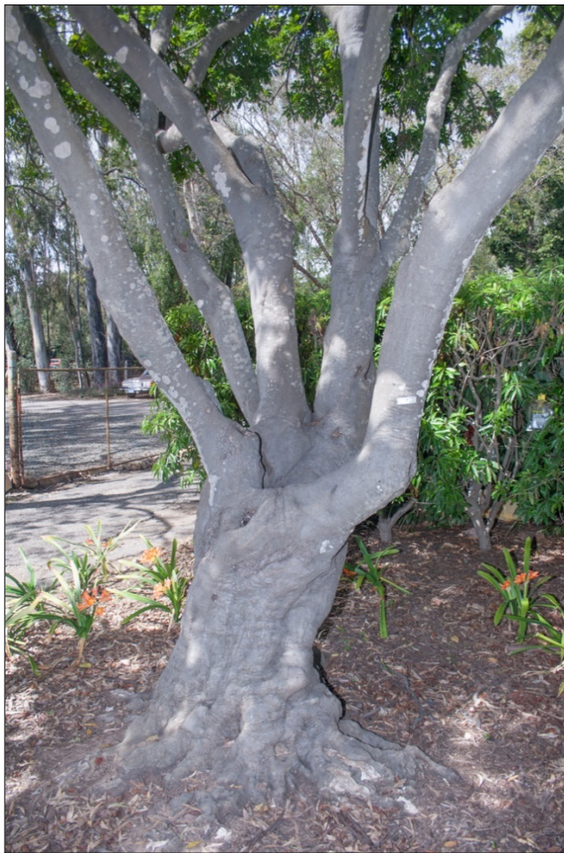
Fig. 3. Tītoki typically has a solitary trunk but sometimes has low multiple branches (Stowe House, Goleta, CA).

Leaves: unevenly pinnate, alternate; petiole 3 inches long; blade 6-13 × 4-8 inches, oblong; 3-7 pairs of pinnae and a single terminal one, these 1.75-4.25 × 0.75-1.60 inches, ovate-lanceolate to ovate-oblong, deep glossy green adaxially (upper) ( Fig. 5 ), paler abaxially (lower), +/- thin-textured, acuminate to obtuse or subacuminate, margins smooth or remotely toothed; twigs and leaves with dense, short, soft, silky, rusty brown hairs especially when young.