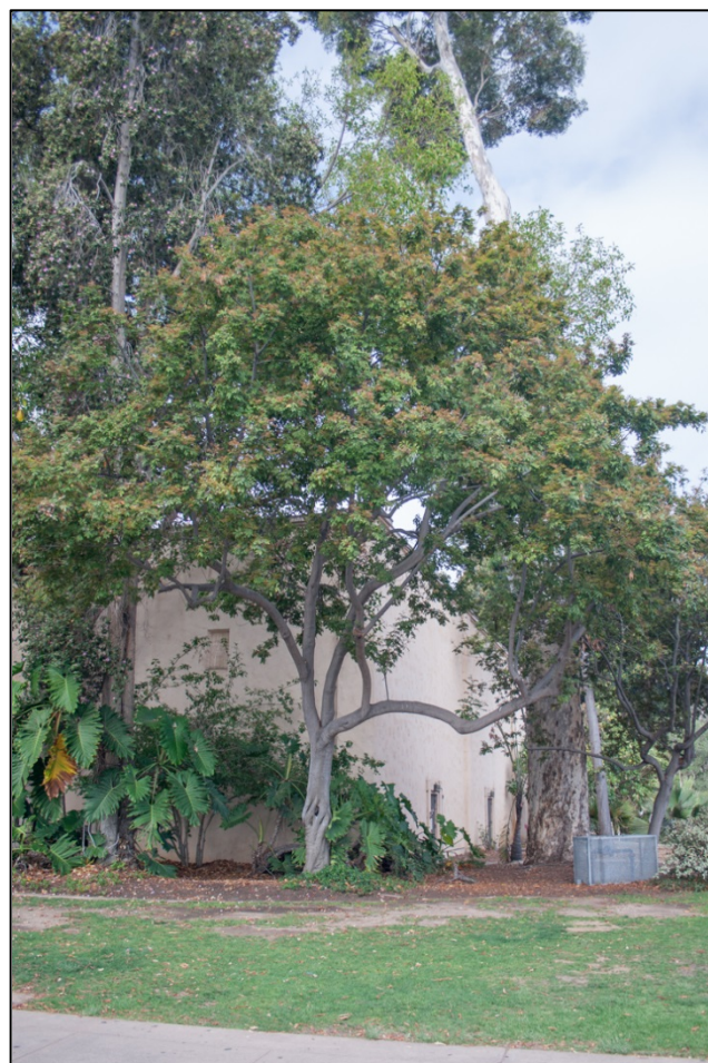
Fig. 10. The Casa del Prado Theater in Balboa Park in San Diego, CA has several nice tītoki , some of which produce seeds