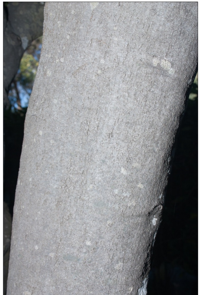
Fig. 4. Bark of tītoki is gray and smooth (Stowe House, Goleta, CA).

Flowers: in much open and branched terminal panicles 4-12 inches long at branch tips in the spring and early summer ( Fig. 6 ); flowers bisexual or staminate (male), lacking petals, purplish ( Fig. 7 ), small, 0.10-0.15 inch wide, inconspicuous but fragrant,