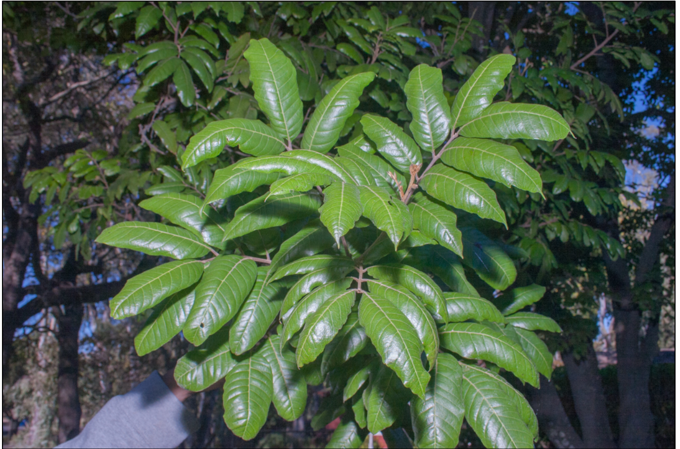
Fig. 5. Leaves of tītoki have three to seven pairs of glossy green pinnae (Stowe House, Goleta ,CA).