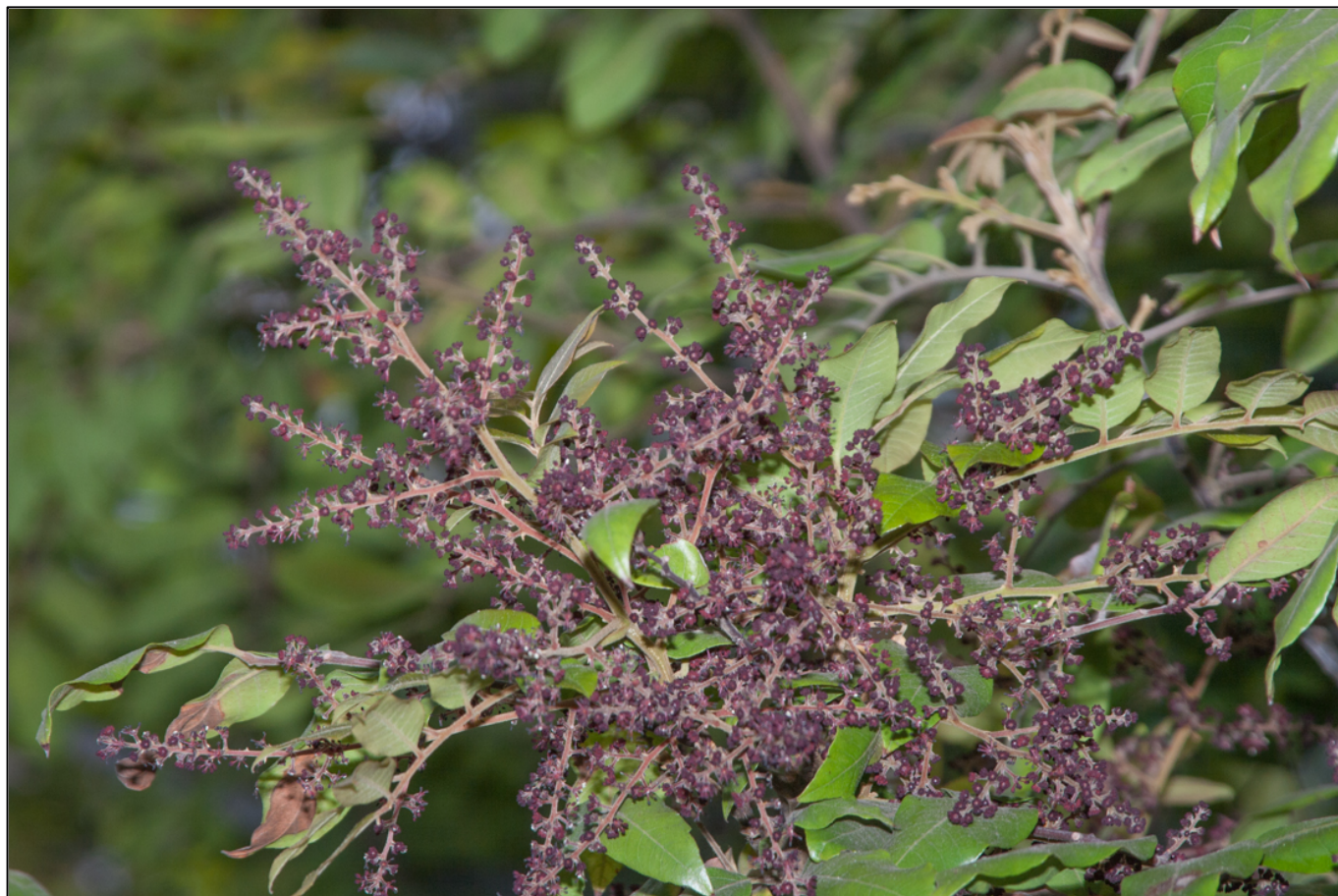
Fig. 6. Flowers of tītoki are in much branched terminal panicles in spring and summer (Zoro Gardens, Balboa Park, San Diego, CA).

Tītoki has a moderate to fast growth rate when young in coastal California, attaining four to five feet in height after three years from seed. Growth tends to slow in older plants with trees in California typically