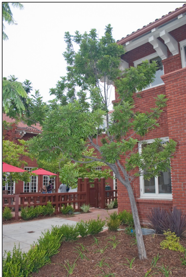
Fig. 9. The Carrillo Recreation Center at 100 E. Carrillo St. in Santa Barbara, CA is home to a small but nice tītoki .