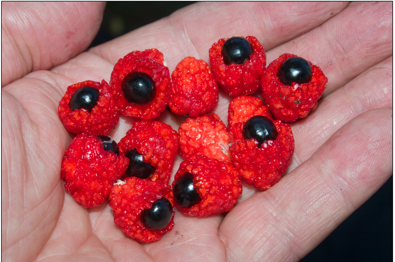
Fig. 8. Seeds of tītoki are shiny black and embedded in a scarlet, fleshy aril (El Prado, Balboa Park, San Diego, CA).