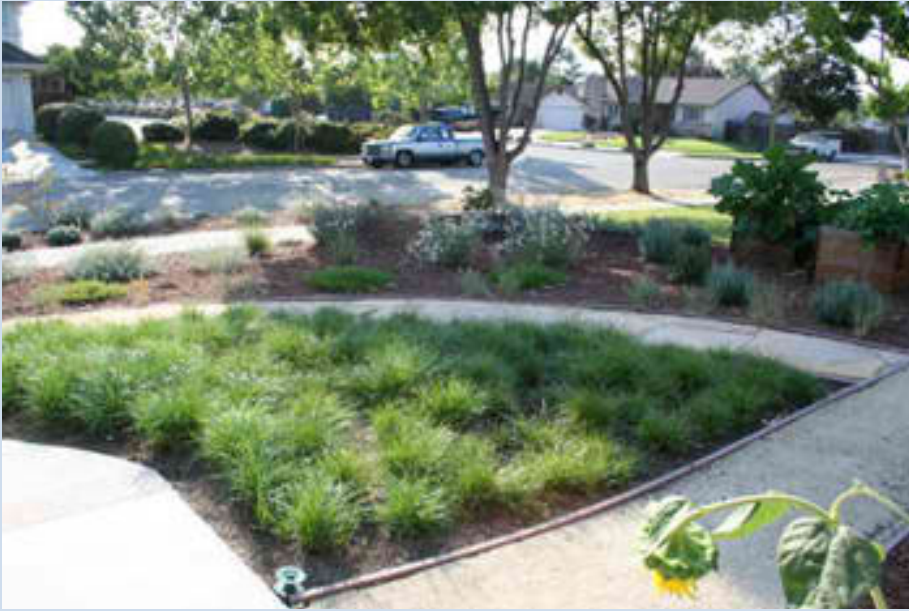
Carex pansa (California Meadow Sedge) * California Native *