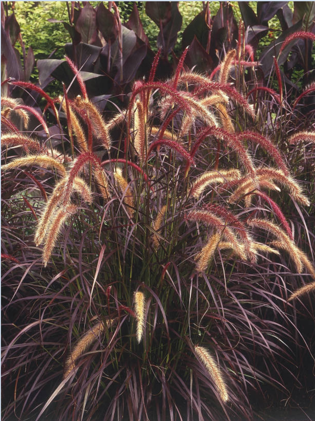
Pennisetum setaceum 'Rubrum' (Purple Fountain Grass)