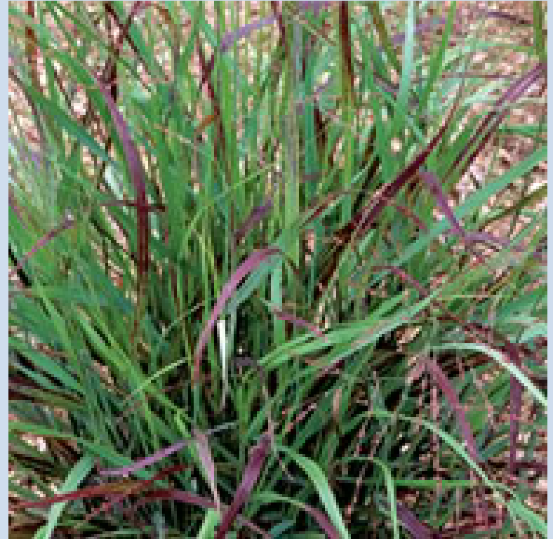
Panicum virgatum 'Shenandoah' (Switch Grass)