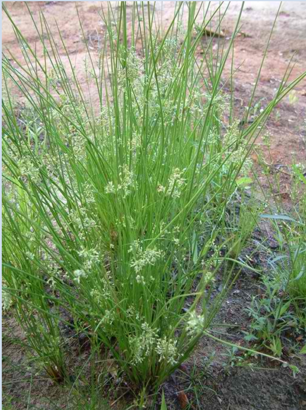
Juncus effusus (Soft Rush)