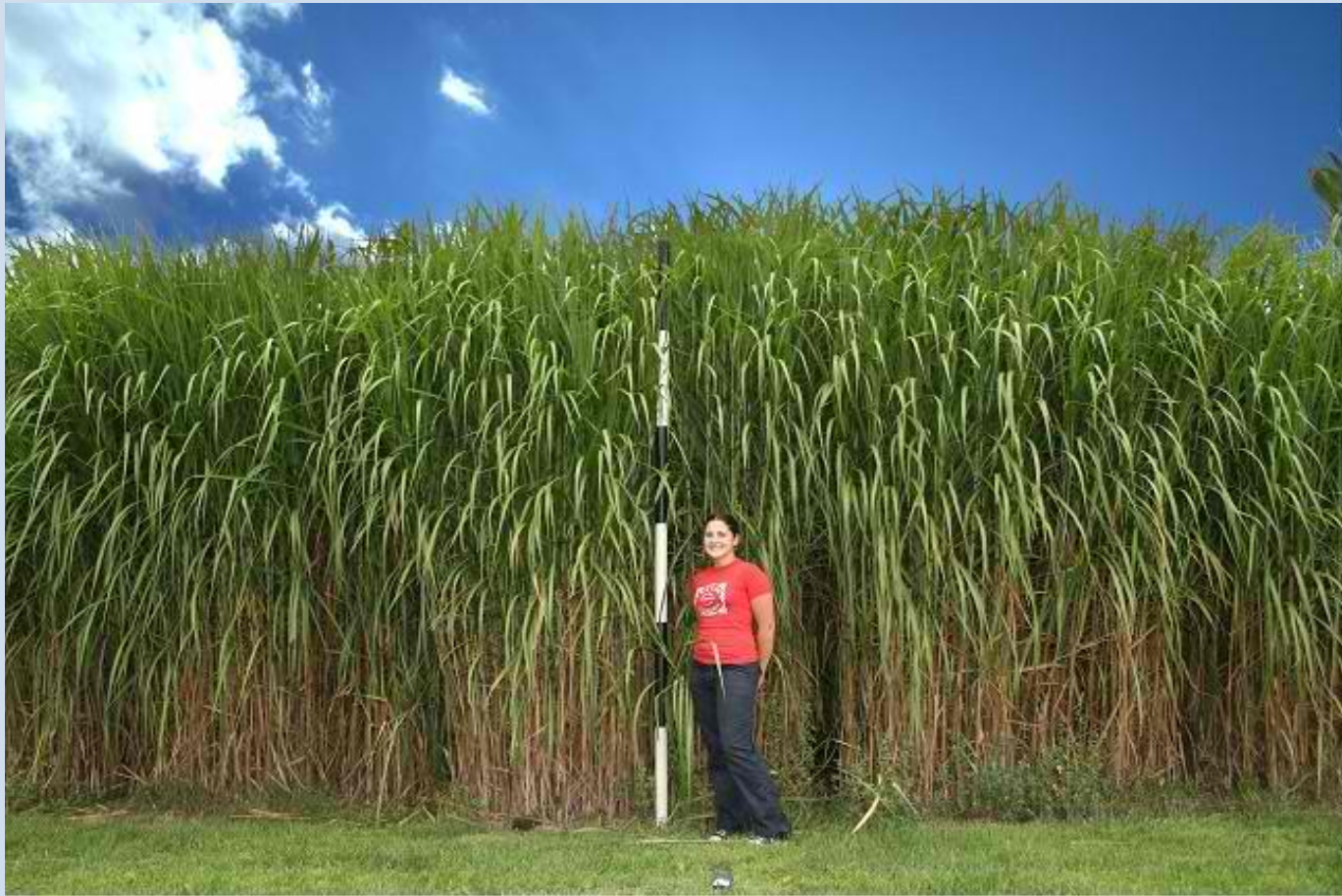
Miscanthus x 'Giganteus' (Giant Silver Grass)