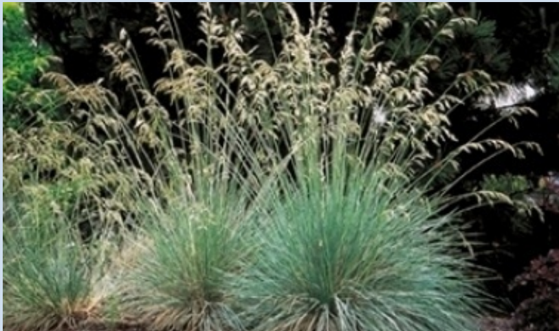
Helictotrichon sempervirens (Blue Oat Grass)