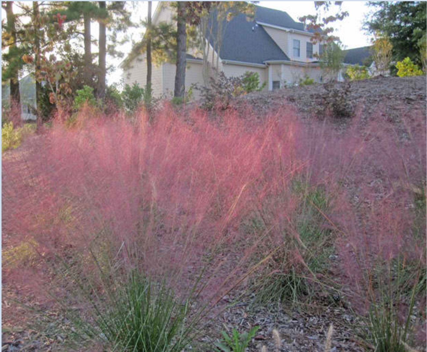
Muhlenbergia capillaris (Pink Muhly)