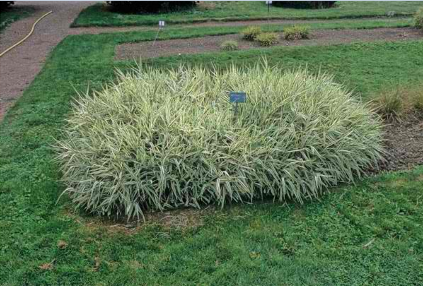
Phalaris arundinacea picta (Ribbon Grass, Gardener's Garters)