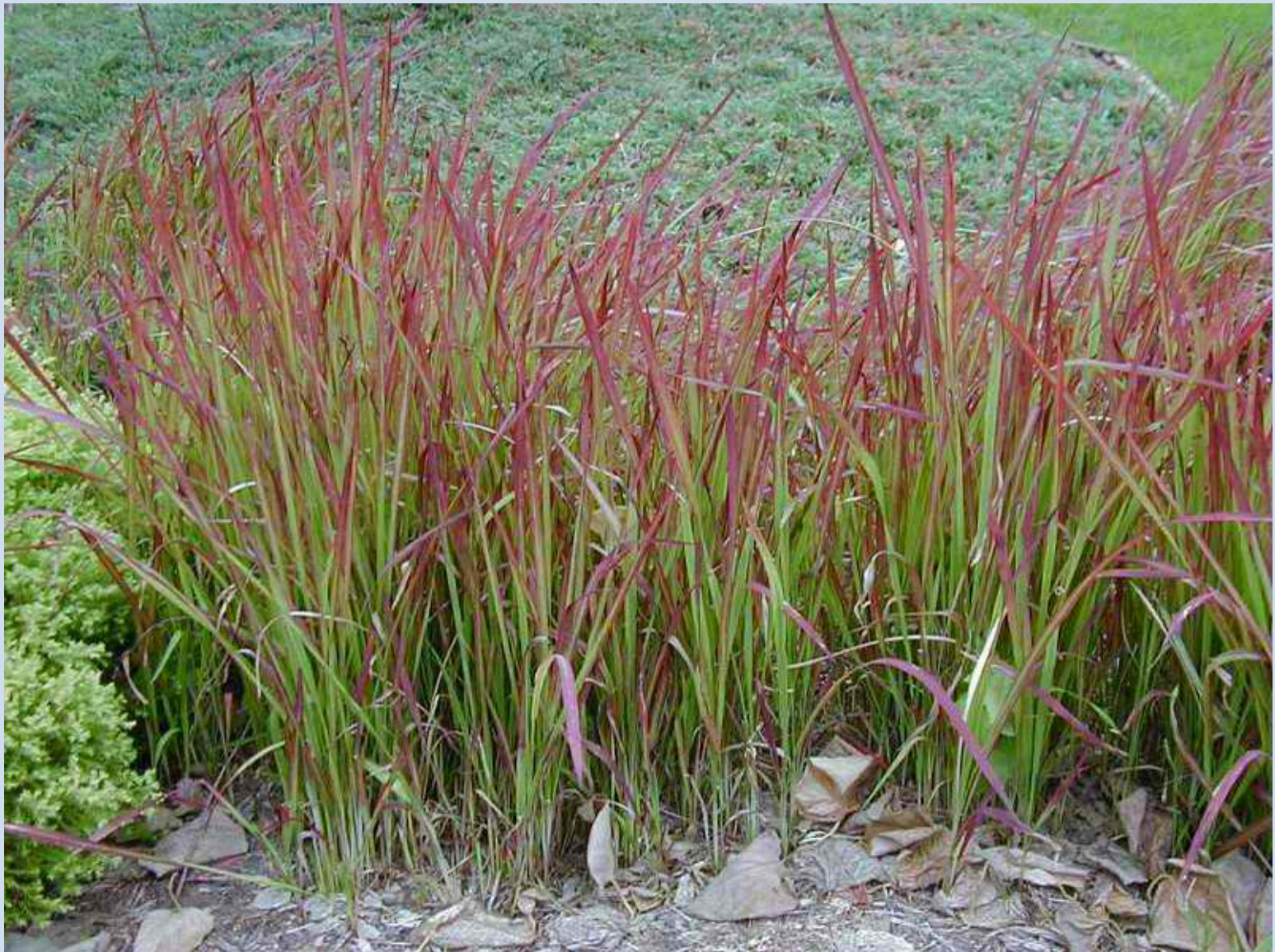
Imperata cylindrica ' Rubra ' (Japanese Blood Grass)