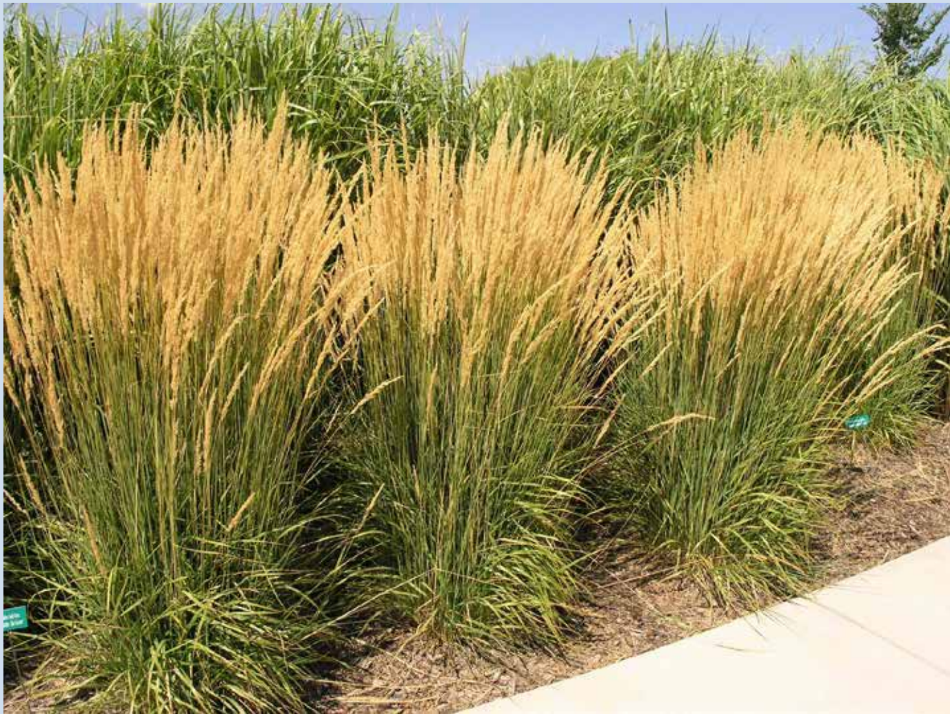
Calamagrostis x acutiflora 'Karl Foerster' (Feather Reed Grass)