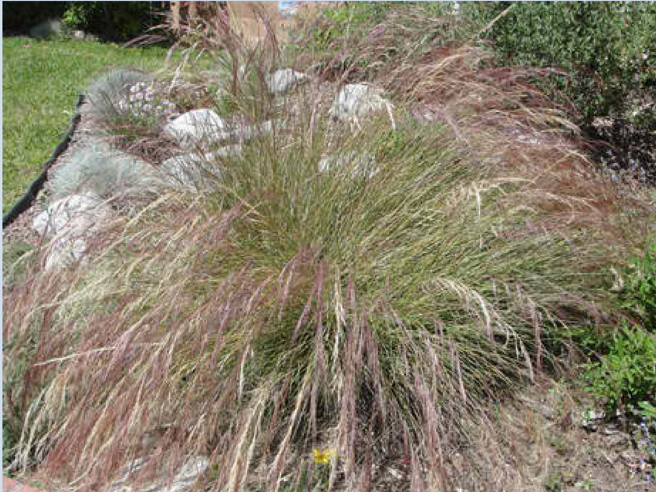
Aristida purpurea (Purple Three-Awn) * California Native *