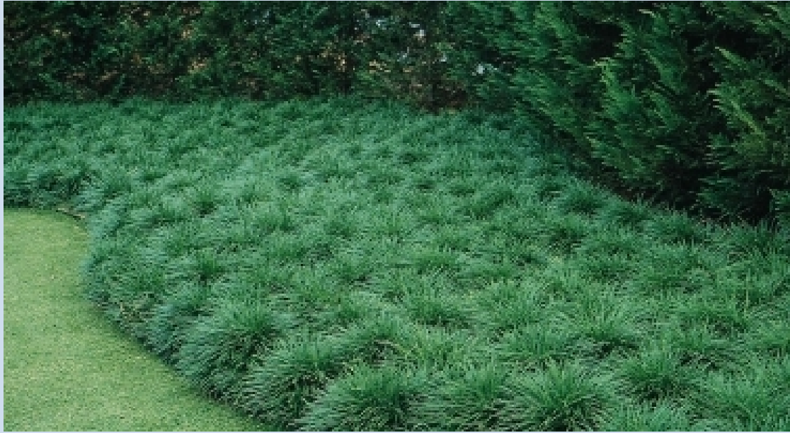
Ophiopogon japonica (Mondo Grass)