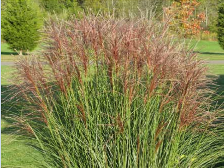
Miscanthus sinensis 'Gracillimus' (Eulalia, Japanese Silver Grass)