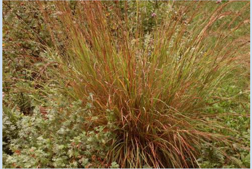
Schizachyrium scoparium (Little Bluestem)