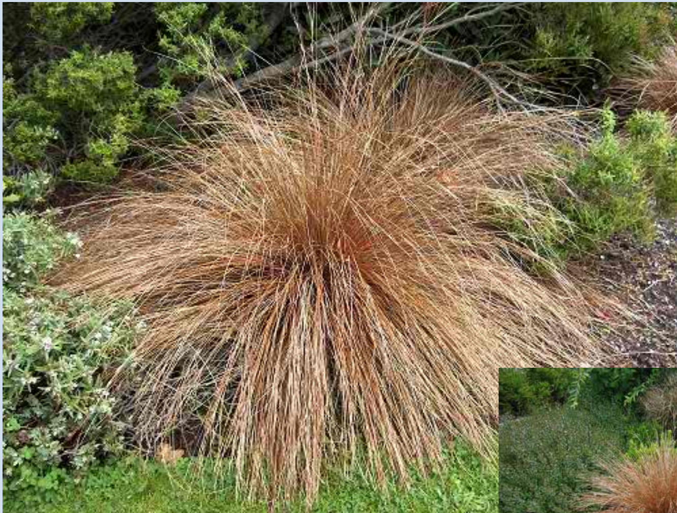
Carex buchananii (Leatherleaf Sedge)