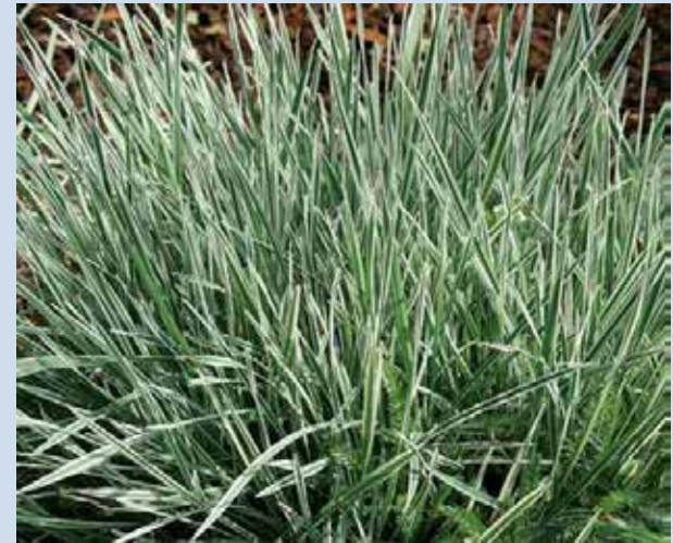
Arrhenatherum elatius bulbosum 'Variegatum' (Bulbous Oat Grass)