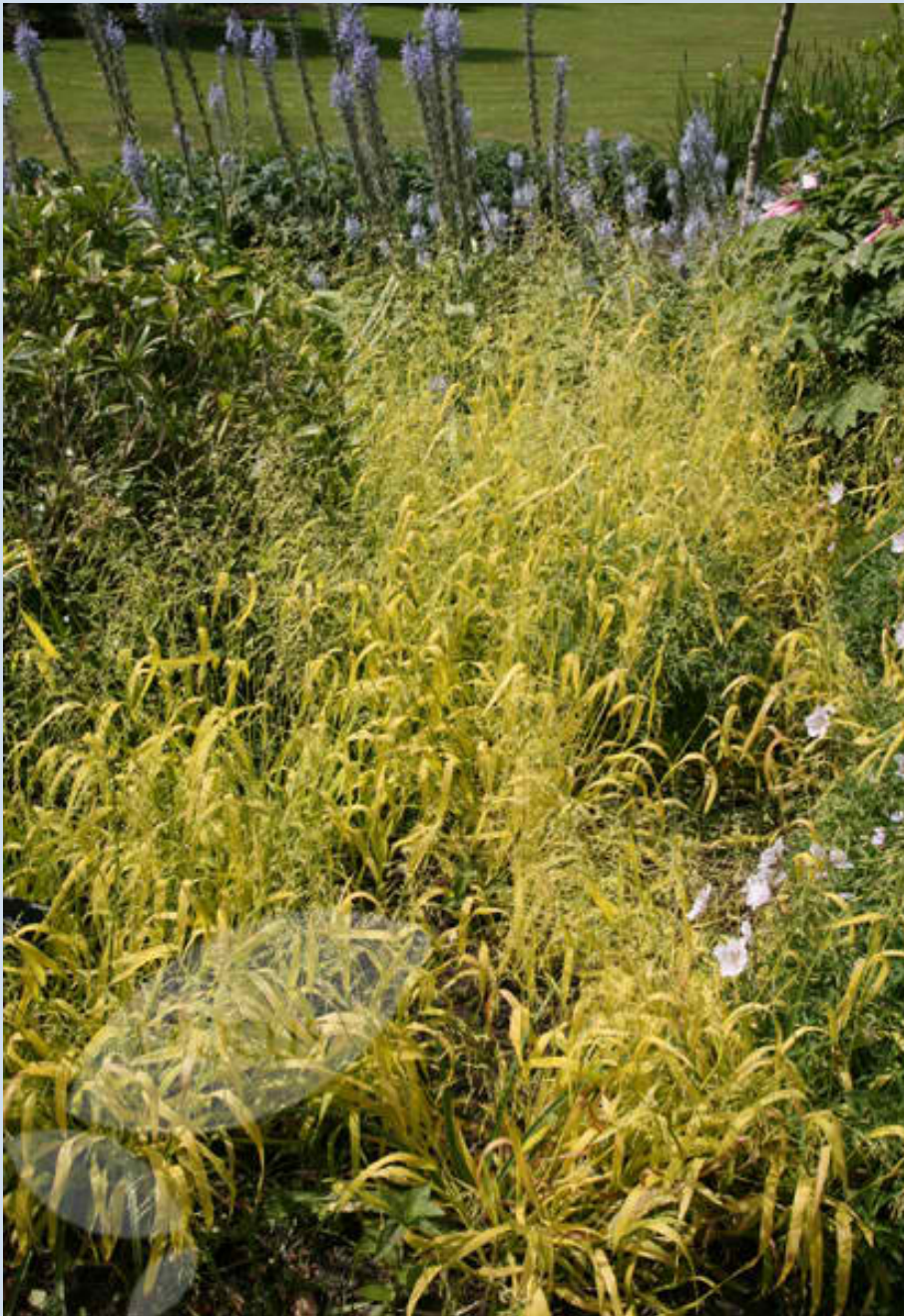
Miliium effusum 'Aureum' (Bowles' Golden Grass)