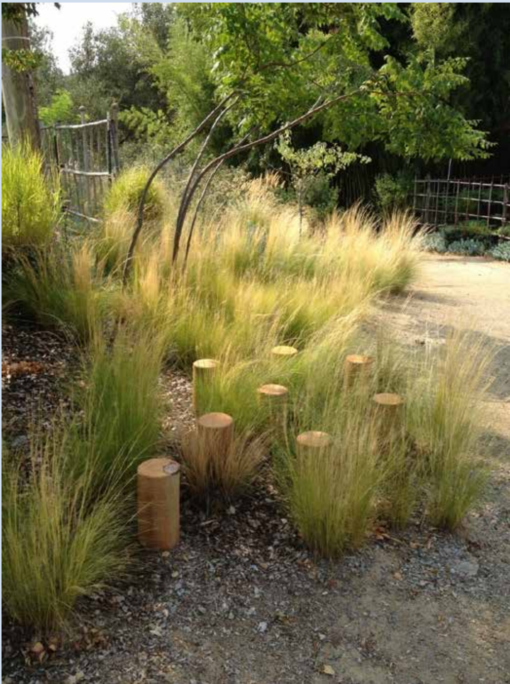
Stipa tenuissima (Mexican Feather Grass)