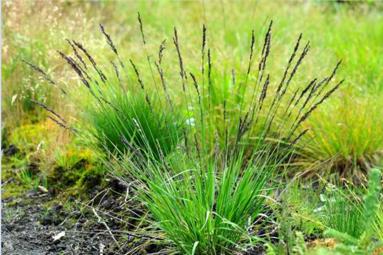
Molinia caerulea (Moor Grass)