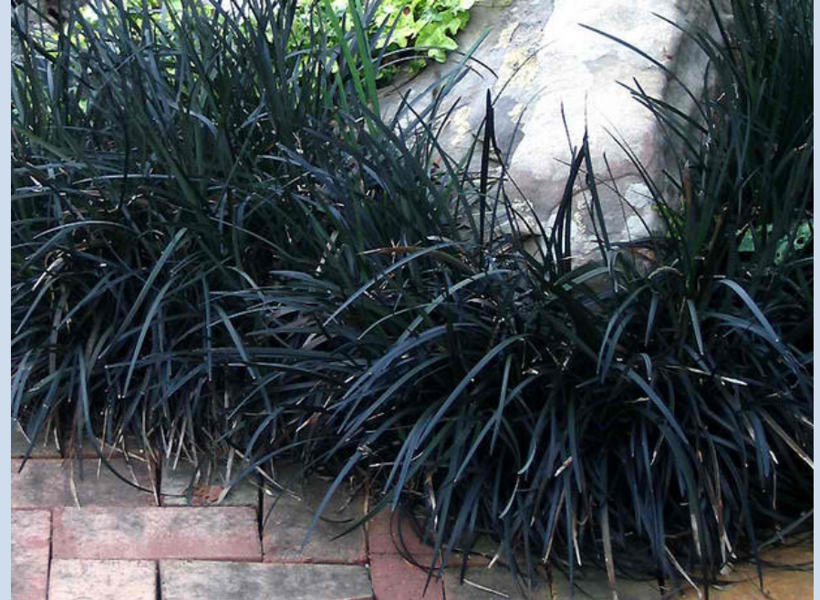
Ophiopogon planiscapus 'Nigrescens' (Black Mondo Grass)