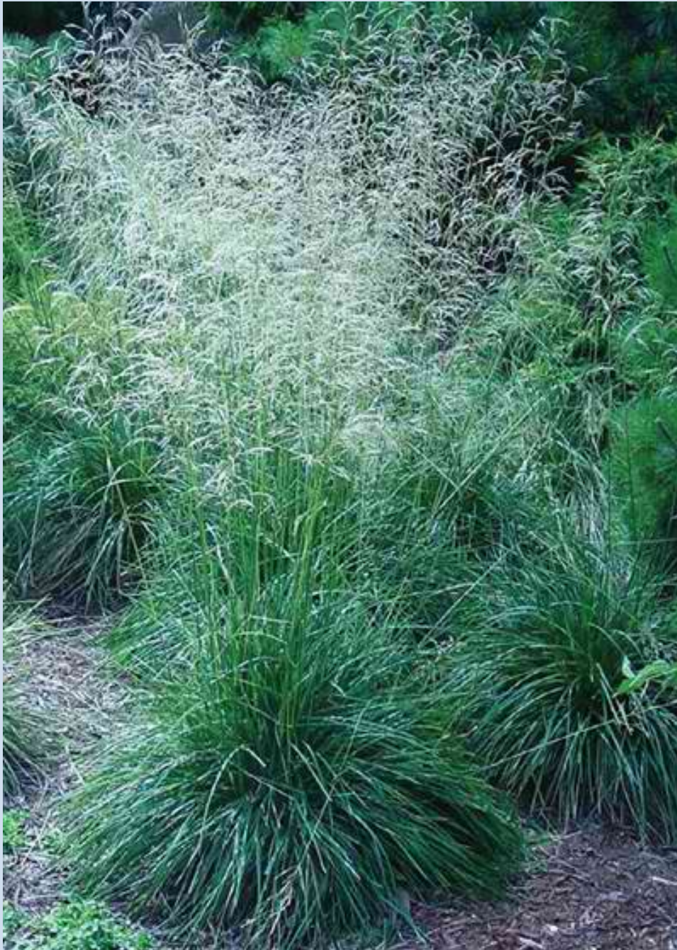
Deschampsia cespitosa (Hair Grass)