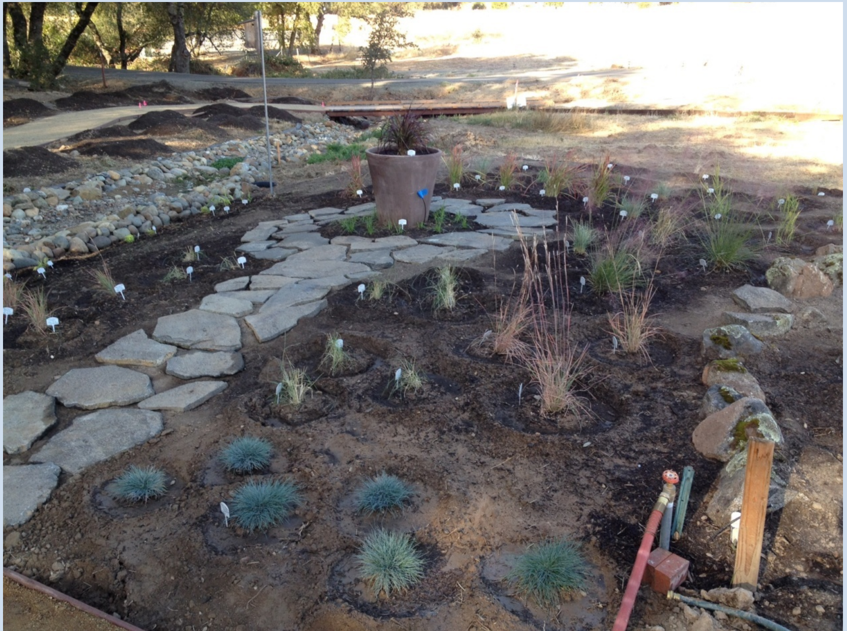
Demonstration Garden: October 12, 2013