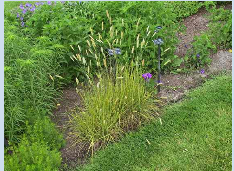
Alopecurus pratensis 'Aureus' (Yellow Foxtail Grass)