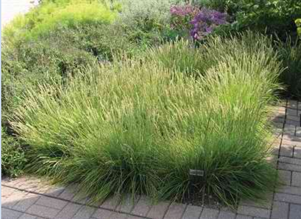
Sesleria autumnalis (Autumn Moor Grass)