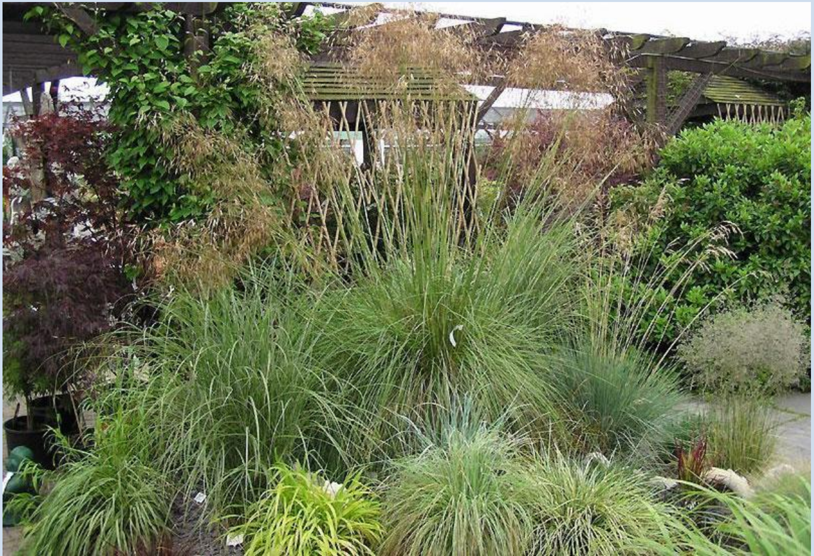
Stipa gigantea (Giant Feather Grass)