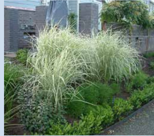
Miscanthus sinensis 'Variegatus' (Eulalia, Japanese Silver Grass)