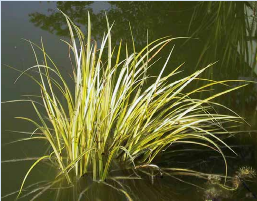
Acorus gramineus 'Variegatus' (Variegated Sweet Flag)