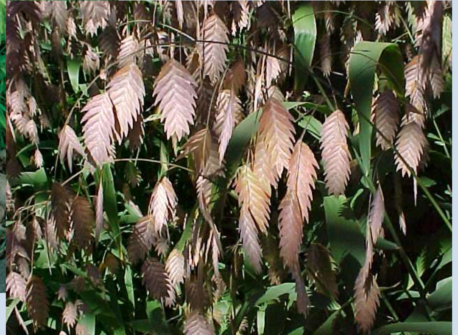
Chasmanthium latifolium (Sea Oats)