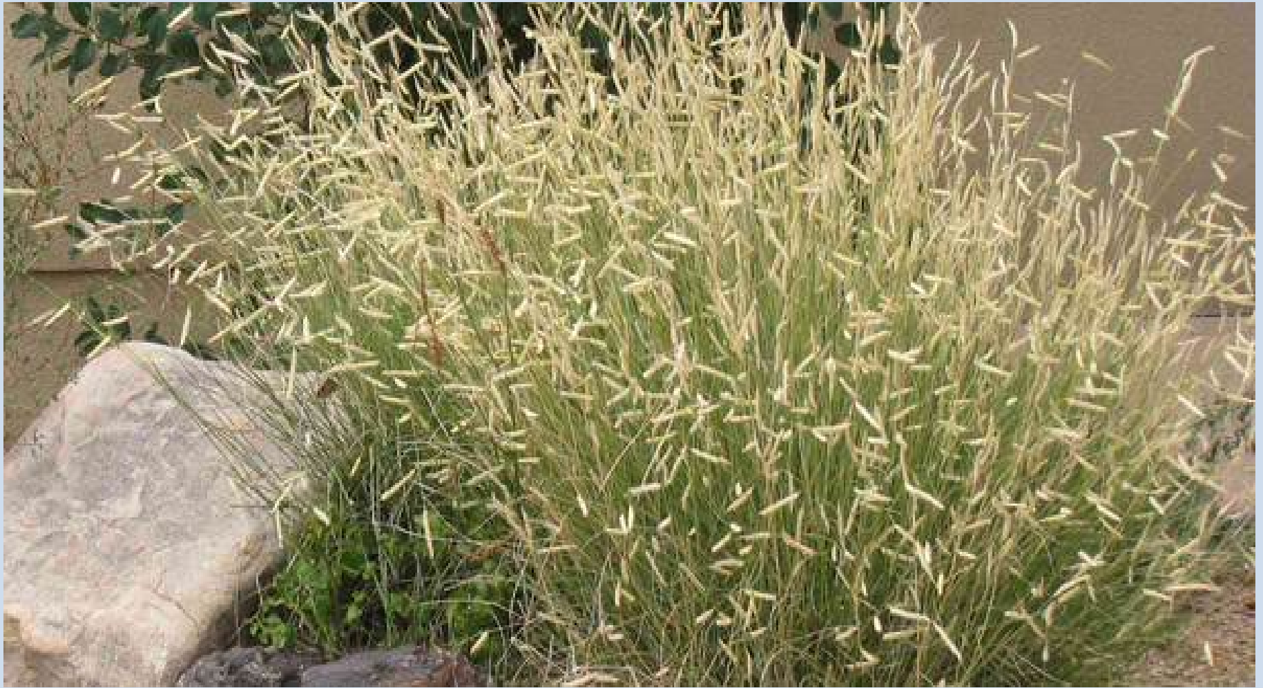
Bouteloua gracilis (Blue Grama, Mosquito Grass)