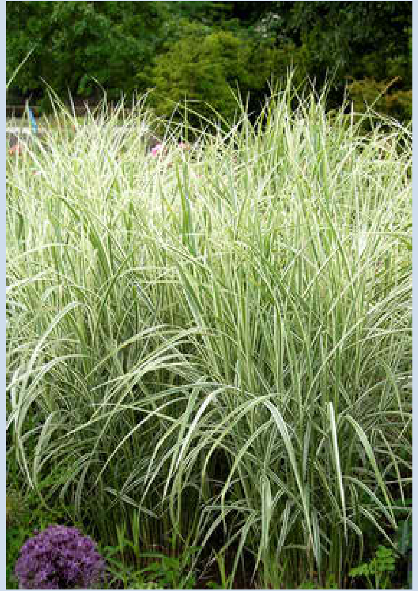
Miscanthus sinensis var. condensatus 'Cosmopolitan' (Maiden Grass, Japanese Silver Grass)