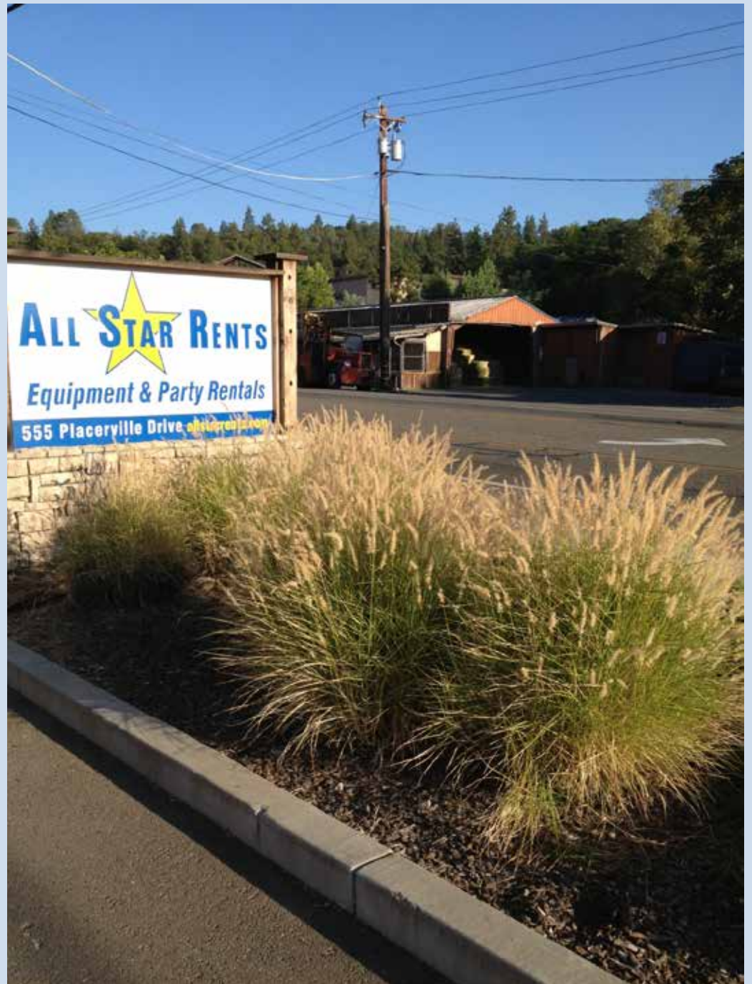
All Star Rents on Placerville Drive, Placerville