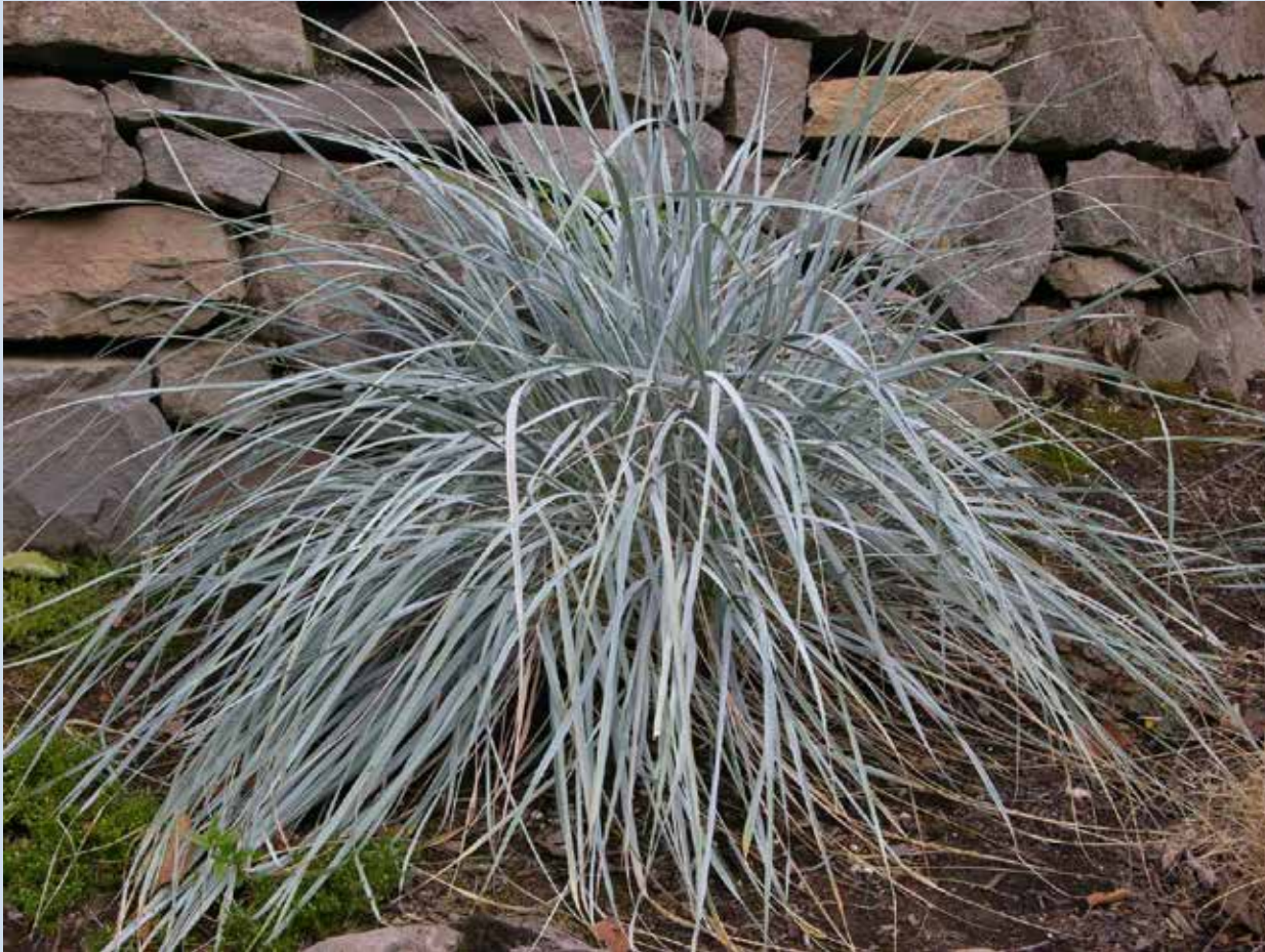
Elymus magellanicus (Magellan Wheatgrass)