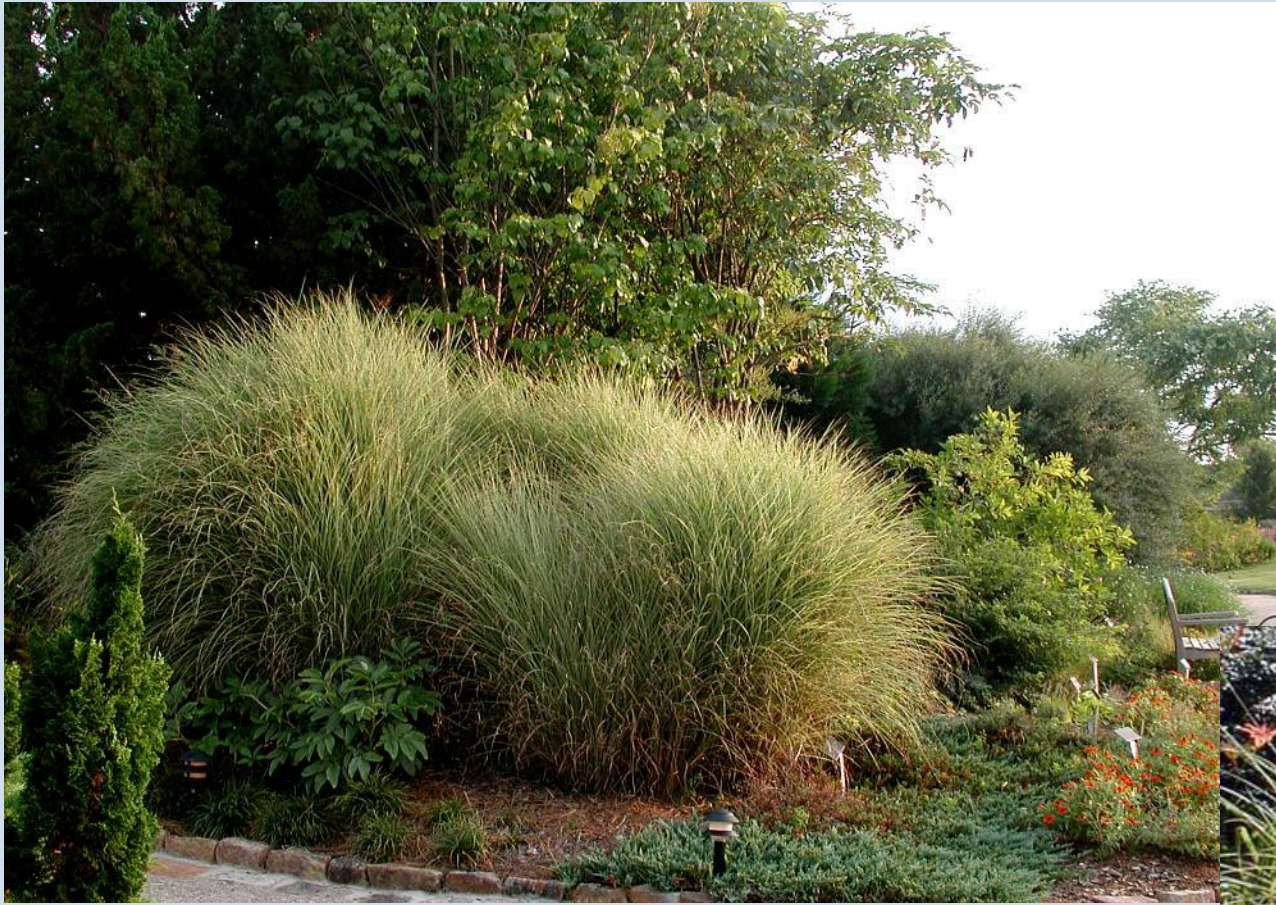
Miscanthus sinensis 'Morning Light' (Eulalia, Japanese Silver Grass)