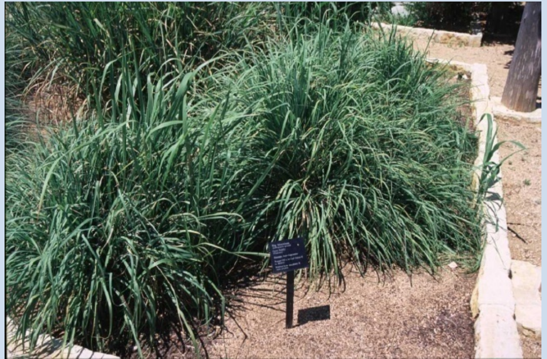
Andropogon gerardii (Big Bluestem, Turkeyfoot)