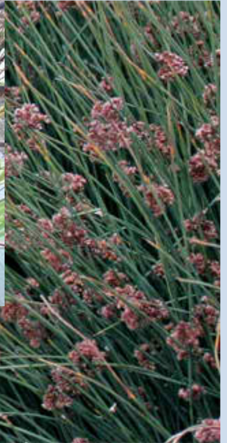
Juncus patens (California Gray Rush) * California Native *