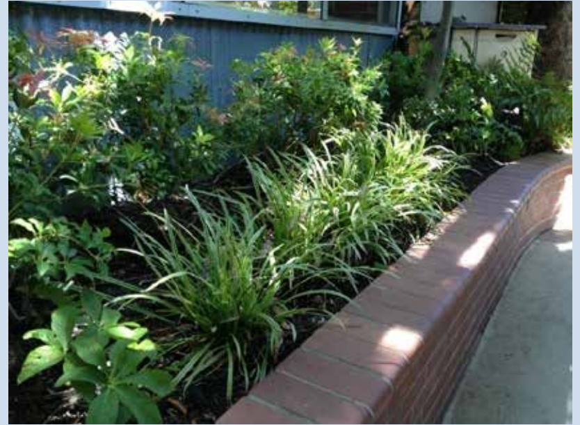
Liriope muscari 'Variegata' (Big Blue Lily Turf)