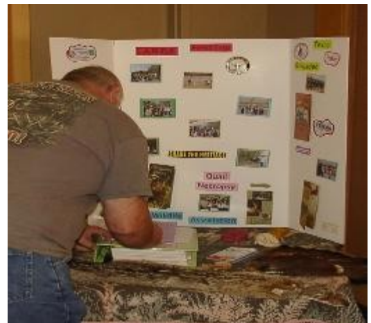
A new volunteer for the L.A.N.D.S. project. CC-12-A.