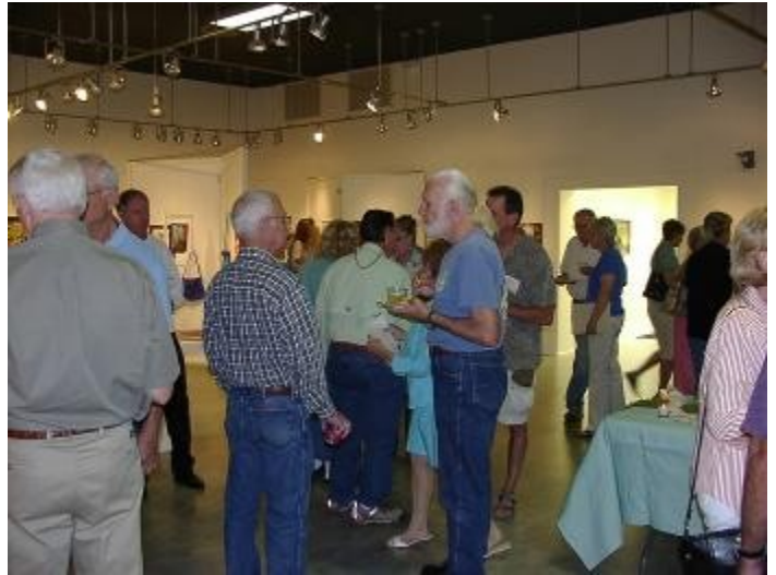
A full house at the new class reception.