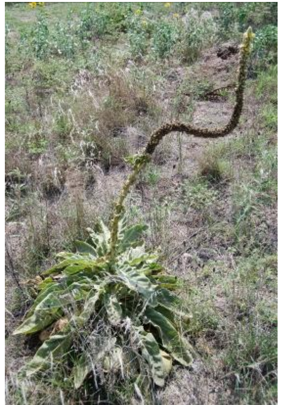
Common Mullein Verbascum thapsus Known as "cowboy toilet paper" because of the thick absorbent leaves. The dried stems were dipped in wax and used as torches.