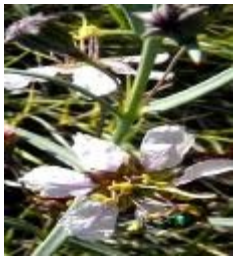
Longstalk heimia Nesaea longipes Bandera County

Rare, Endangered, and Threatened in the Four Counties