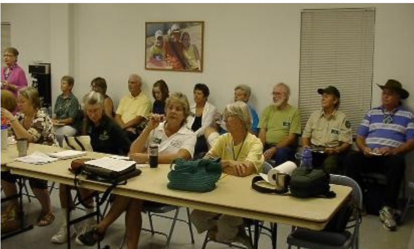
Excited committee members and mentors watch the first day of class unfold.