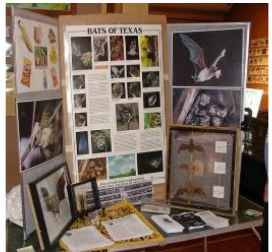
The Old Tunnel display helps recruit volunteers. KL-03-A.