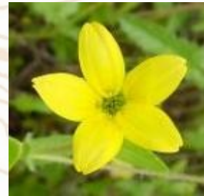
Lindheimeria texana: Texas Star

We meet the fourth Monday of each month (excluding June and December) at 7p.m. in the Upper Guadalupe River Authority Lecture Hall at 125 North Lehmann Drive in Kerrville. We welcome anyone interested in our monthly topic and the Texas Master Naturalist program. Please join us.