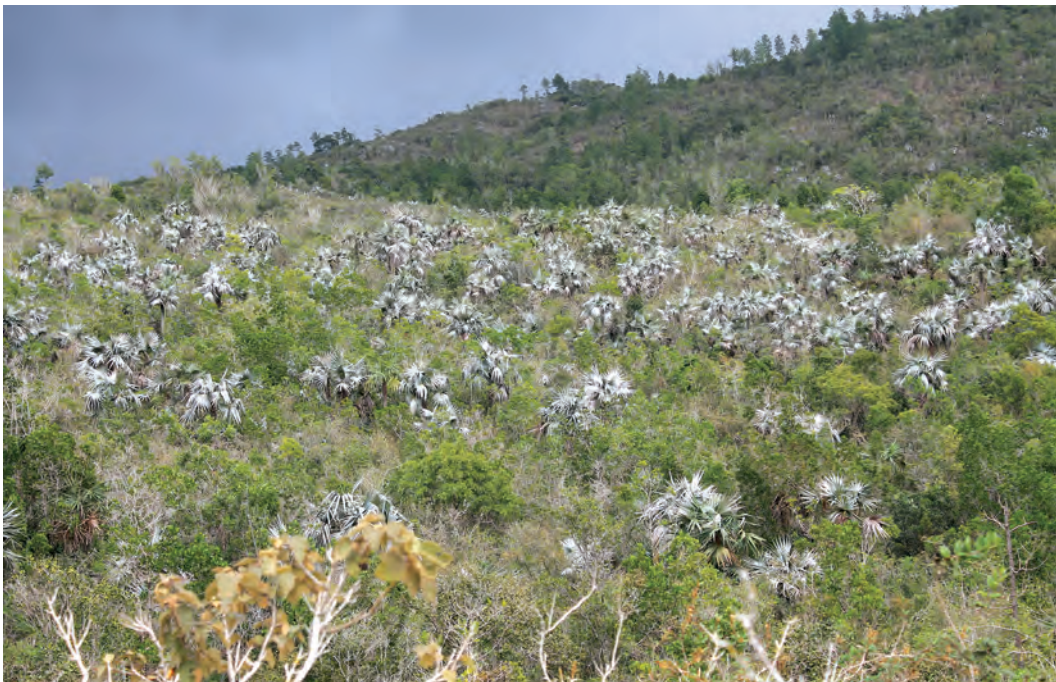
2. Coccothrinax spirituana in its natural habitat where ash-gray leaves are conspicuous.

This palm differs from other species of the genus by having leaves ash-gray on both surfaces of the blade (Figs. 1 & 2). It is related to Coccothrinax macroglossa but can be