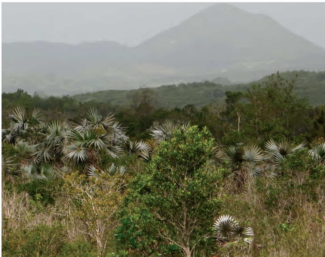
7. Vegetation at San Felipe "cuabal" with Coccothrinax spirituana .

1.3–1.5 mm long, 0.4 mm wide at base, triangular, acute and free distally; anthers oblong, 0.8–2 mm long, 0.4 mm wide, dorsifixed subapically, base sagittate at maturity; ovary globose, 0.7–0.8 mm in diameter; style up to 1 mm long, cylindrical at the base, gradually widening in the upper half; stigma infundibuliform, 0.5 mm long, 0.5 mm wide. Infrutescences interfoliar, pendant. Fruit depressed–globose to globose, 9–10.5 × 12–13 mm when fresh, 6.8–8.8 × 6.5–8.1 mm dry; pedicels 2.5–4 mm long; epicarp smooth, shiny, light purple to dark reddish–purple at maturity (Fig. 6). Seed depressed–globose to globose, cerebriform, 6.2–8.2 × 5.2–7.5 mm, grooves 4–6, wide and deep; endosperm homogenous, intruded partially through the center from apex to near the base. Eophyll lanceolate, very narrow, rigid, with 3 prominent veins adaxially, greenish, 15–29 cm long, 2.5–3 cm wide.