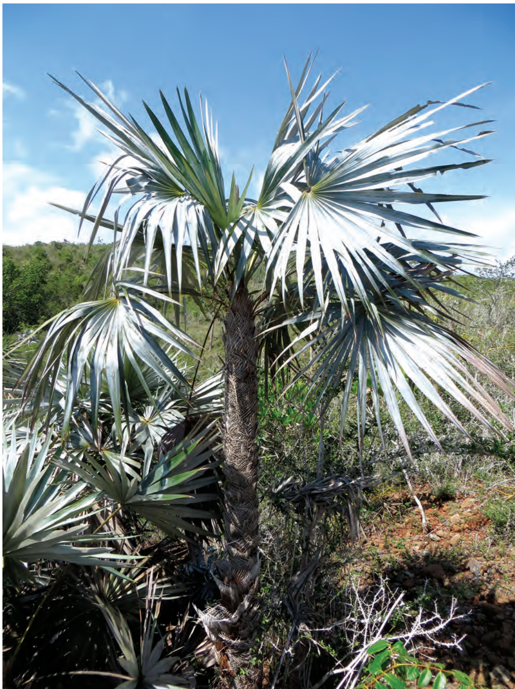
4. A tall and old Coccothrinax spiritwana in its habitat.

all of them longitudinally striate, basally glabrous, covered outside from the opening to the apex with cottony white indument; primary branches slender, 32–39 cm long, 4.5–6 mm diameter, basal bract 5–9 mm long; all bracts persistent; rachillae around 30 per primary branch, basally 7–12 cm long, 1.5–