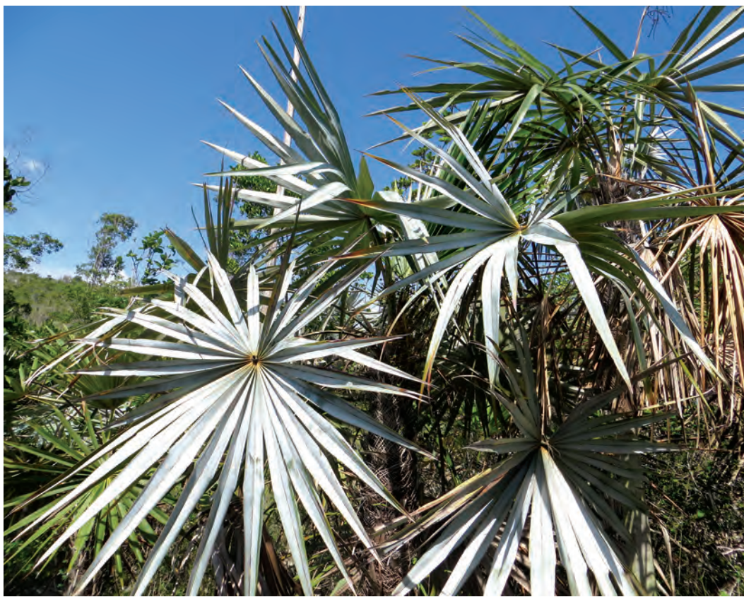
8. Coccothrinax spirituana (foreground) and C. clarensis ssp. clarensis (background).

sector of Cuba (Borhidi 1996), consisting of slightly undulating hills, 185–235 m elevation. The main vegetation types on the San Felipe outcrop are secondary thorny xeromorphic serpentine shrub land, pine forest plantation, secondary serpentine grassland, and gallery forest. (Bécquer et al. 2003). Dominant shrubs and trees include the following species: Brya ebenus , Bursera inaguensis , Diospyros crassinervis , Ternstroemia peduncularis , Pera bumeliefolia , Byrsonima lucida , Jacaranda cowellii , Gochmatia cowellii , Phyllanthus orbicularis , Reedia fruticosa , Maytenus buxyfolia and Chamaecrista lineata . Coccothrinax clarensis ssp. clarensis also shares the habitat with C. spirituana (Fig. 8). The climate is seasonal, with a rainy period from May to October and a dry season in the winter.