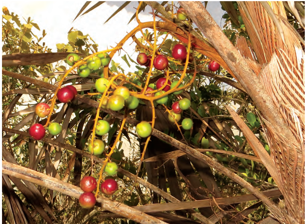
5 (top). Coccothrinax spirituana , detail of leaf sheath with a long free strands tips. 6 (bottom). Infructescence of Coccothrinax spirituana with ripe fruits.