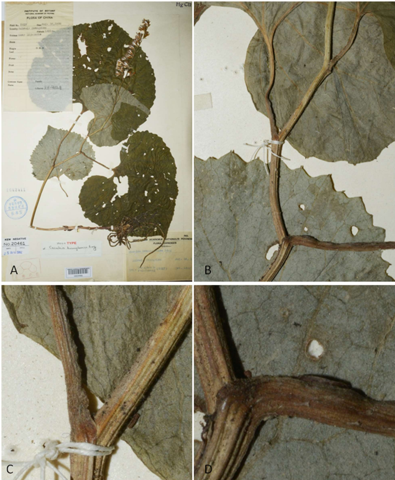
Fig. 1. A. Holotype of Parasenecio hwangshanicus (Y. Ling) C. I. Peng & S. W. Chung. B. Closeup of stem and petioles. C-D Closeup of base of petiole, showing expanded wing.