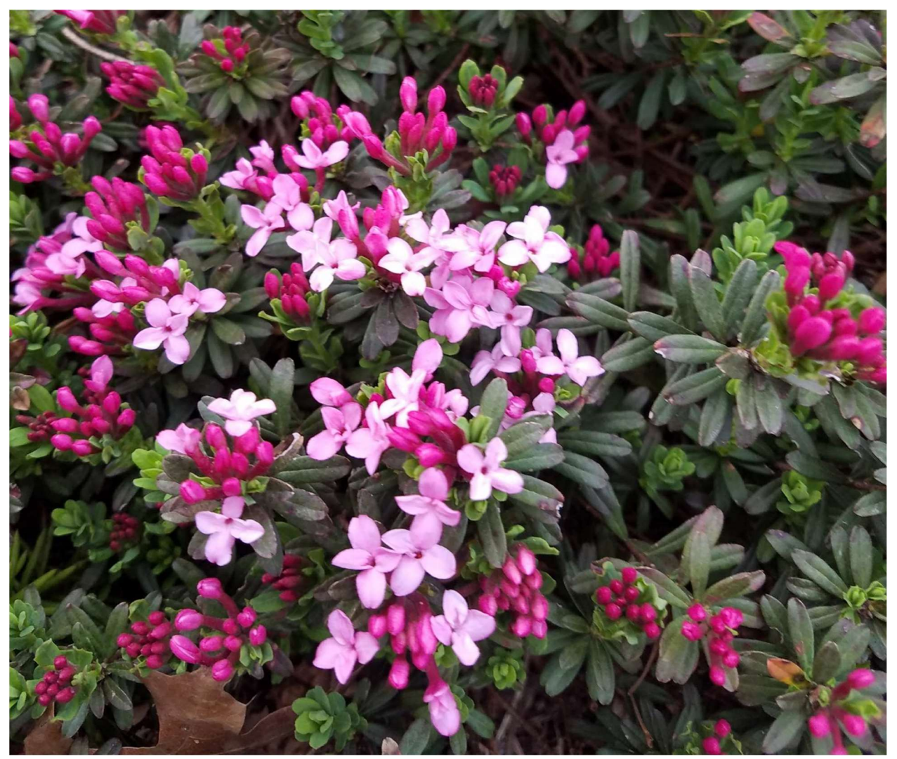
Daphne cneorum 'Ruby Glow'

Daphne cneorum is another species that at times can be found in nurseries. This low growing groundcover plant is covered with very fragrant flowers. We have three plants growing along the driveway and enjoy the fragrance just walking up the drive to get the mail.