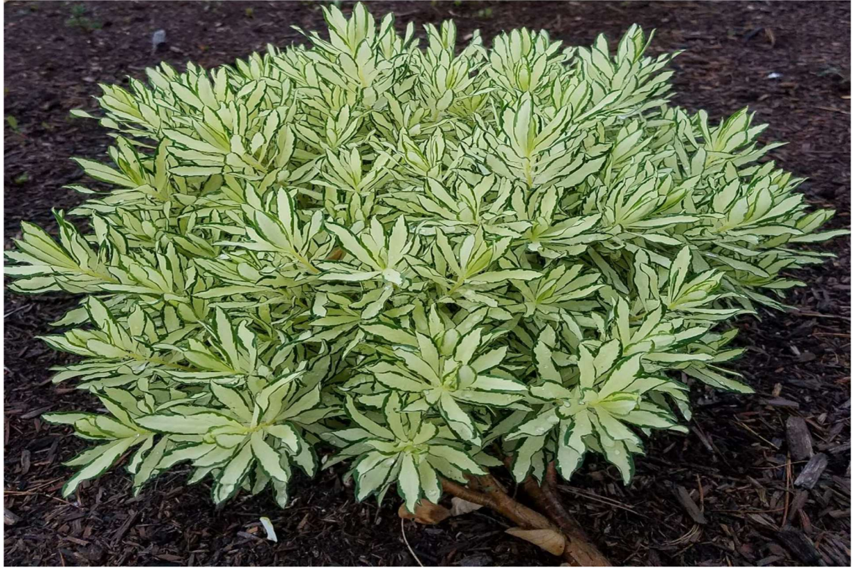
Daphne 'Brigg's Moonlight'