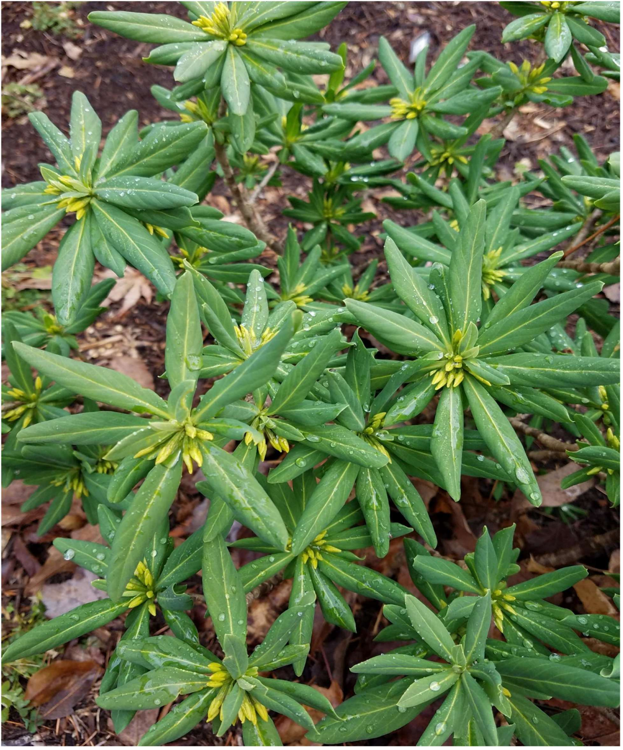
Daphne jezoensis in late November