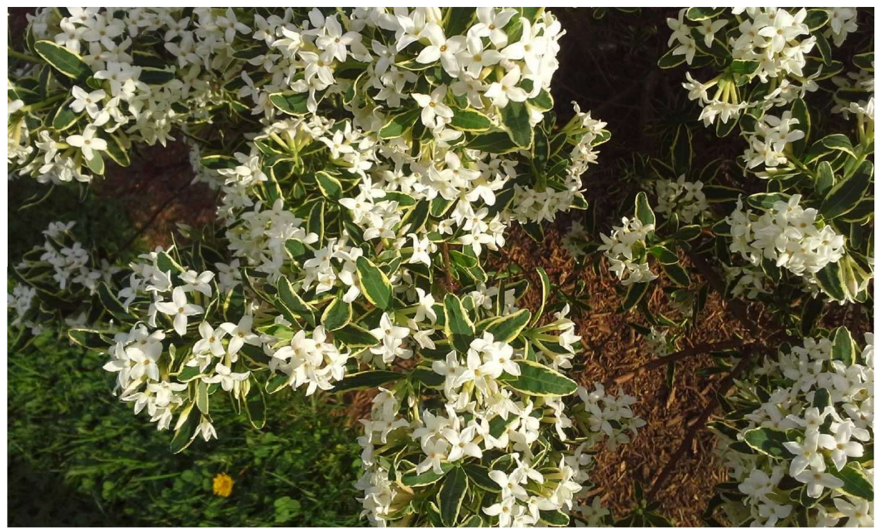
Daphne 'Carol Mackie'

Daphne 'Carol Mackie' is the most widely available Daphne. This shrub grows to two and a half feet tall with a four-foot spread. Blooming in May with extremely fragrant flowers Carol Mackie often fills the area with a sweet fragrance.