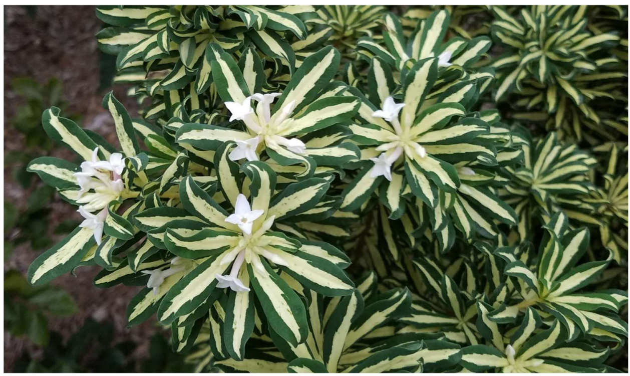
Daphne 'Carol's Limelight'

40 Wells Road Granby, CT 06035 <u>sales@obrienhosta.com</u> <u>www.obrienhosta.com</u>