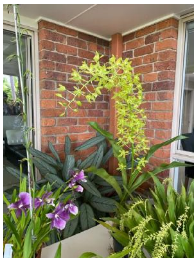
Grammatophyllum scriptum – Don