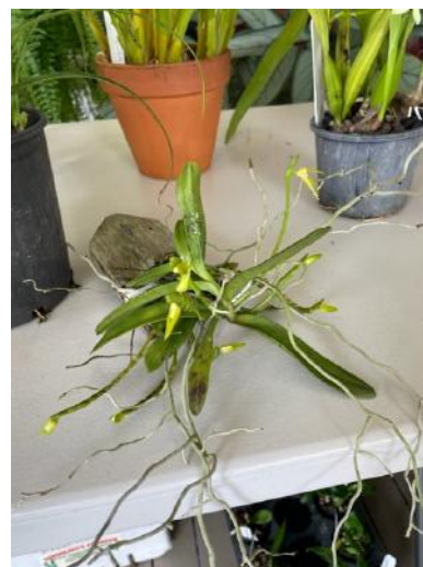
Thrixspermum centipeda - Carol