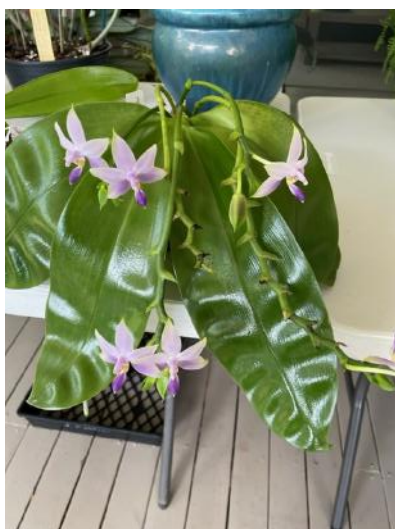
Phalaenopsis violacea Graham & Beryl