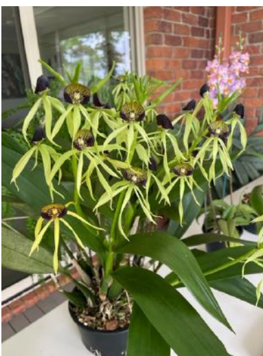
Prosthechea cochleata