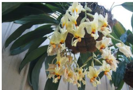
Stanhopea unknown - Col