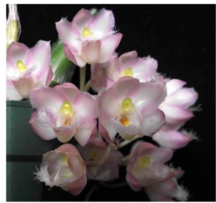
Clowesia Rebecca Northen 'Grapefruit Pink'

Clowesia Rebecca Northen (Grace Dunn x rosea ) again can be white to pink, but the fringing is more pronounced than on Grace Dunn, but it has retained the floriferousness and even improved the fullness of the flowers in most clones.