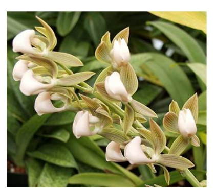
Mormodes frymirei, OW X4.2