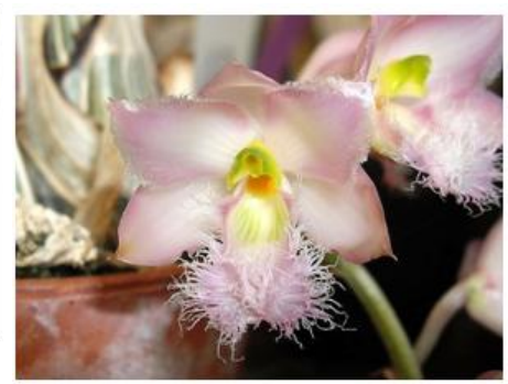
Clowesia rosea Photo: John Varigos, OW X4.2

Clowesia is a genus with mostly pale green, more darkly green –veined species in which