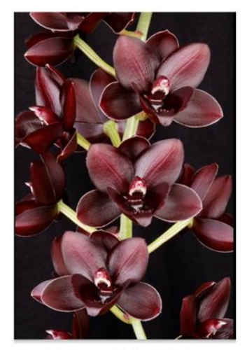
Fredclarkeara Enter Light 'SVO Dark Beauty' FCC/AOS Photo: Fred Clarke, 0+1.4

Fredclarkeara Desert Tenor (Mormodia Painted Desert x Catasetum tenebrosum ) Fredclarkeara After Midnight (Fredclarkeara After Dark x Catasetum Mark Dimmitt) Fredclarkeara Enter Light (Fredclarkeara After Dark x Catasetum pileatum ), got an ECC of