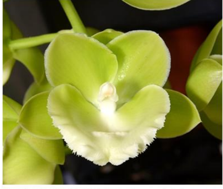
Fredclarkeara Providence, OW X4.2

All of you who grow Catasetums Join Sunset Valley Orchids on line mailing list for specials and cultural information at www. sunsetvalleyorchids.com