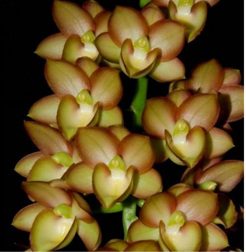
Fredclarkeara Desert Tenor 'Sunset Valley Orchids' FCC/AOS Photo: Arnold Gum, 0+1.4

Fredclarkeara No Doubt (Mormodia Painted Desert x Catasetum Susan Fuchs)comes in creams with red speckles and one was awarded with cream and brown shaded flowers.