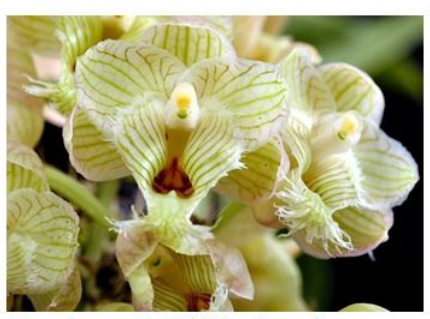
Clowesia warszewitzii 'El Cerro' AWD/SCO, OW X4.2