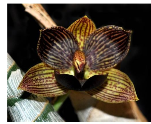
Cycnodes Spotted Hornet, OW X4.2