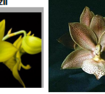
Cycnodes Jem's Dragon 'SVO' FCC/AOS