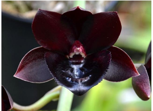
Fredclarkeara After Midnight 'SVO Dark Beauty' FCC/AOS,

Catasetum closed this programme and showed a nicely shaped Fredclarkeara that is not