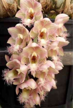
Clowesia Grace Dunn 'Live Oak' HCC/AOS (warszewitzii x rosea), OW X4.2

only two miniature species are commonly used in hybridizing. All have at least some fringing on the lip. The two miniature species produce short densely packed inflorescences of flowers, one with