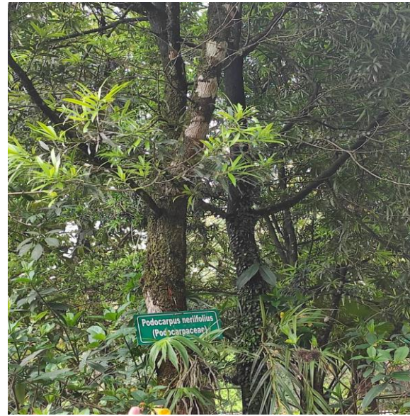
Fig: Few of the important species found around the experimental garden.

Towards the end of the trip we were also taken to the extension experimental garden which was across the road. Here many species of plants belonging to Zingiberaceae family were seen to be conserved.