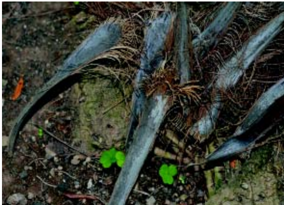
Fig. 5 Detail of the marcescent basic parts of the leaves at the Florence palm

Following all these observations, we conclude that our palm is different from all the species of the Trithrinax genus mentioned above.