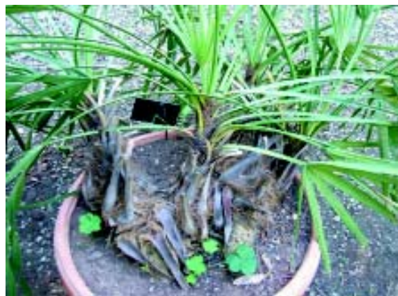
Fig. 4 Detail of the subterranean trunk of the Florence palm, Photo by Andrea Grigioni, Museo di Storia Naturale dell'Università di Firenze

From the aforementioned descriptions of Trithrinax biflabellata and T. schizophylla unequivocally turns out that both species show aerial trunk with long spines, leaf blade divided in segments. Every segment has at the top a deep division in two sharp parts and there are more than 20 segments per lamina.