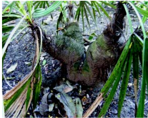
Fig. 9 Detail of the base of the Trithrinax palm growing in the Buenos Aires Botanical Garden, Argentina.

the top and form a reticulum. Laminae are 35 \times 45 cm, they show 5/8 segments (Fig. 6). Segments are 1,5 cm wide on average, 26–35 cm long, generally split almost down to the base of the lamina, stiff, pale glaucous-green adaxially, more tomentose-pruinose abaxially with a prominent rhyme in the middle. About half of the segments are shortly divided at the tip (1–1,5cm.) where they show two short but very strong terminal spines (Fig. 7). The other half has a single and not divided prickly tip. The segments division increases with the leaf age, that is the same leaf shows deeper divisions when older, therefore it is less evident in young or very young leaves. Inflorescence and fruits are unknown.