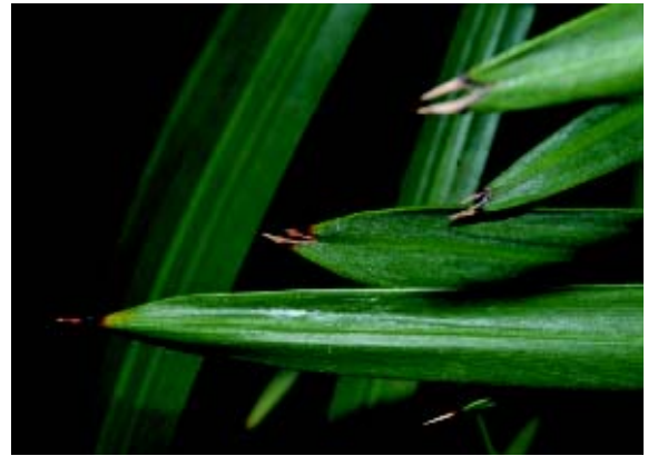
Fig. 7 Detail of the terminal part of the leaves