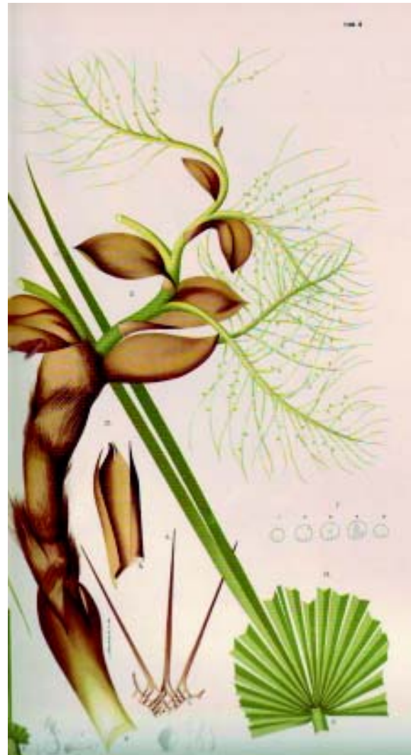
Fig. 1 Botanical samples of Trithrinax biflabellata by Barbosa Rodrigues (1899)

some authors as synonym of T. schizophylla and has been described as having long spines in the terminal part of the trunk by Barbosa Rodrigues protologue (1899): “Caudex erectus, gracilis vaginis in spinas validissimas excurrentibus horridus, foliis rigidis biflabellatis longe petiolatis, [...] lamina usque probe