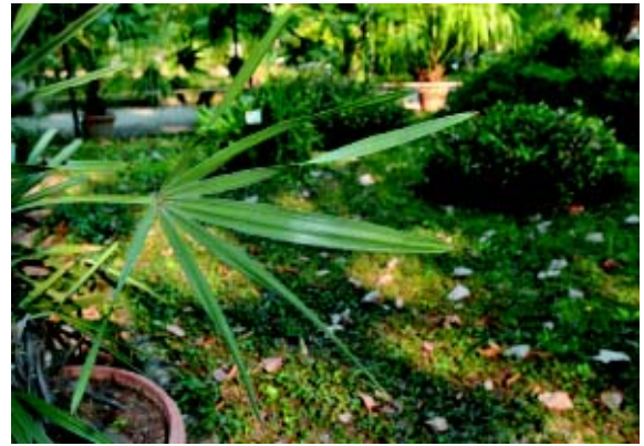
Fig. 6 Detail of the leaves of the Florence palm, Photo by Andrea Grigioni, Museo di Storia Naturale dell'Università di Firenze

The specimen in the Florence Botanical Garden (Giardino dei Semplici) has been sowed in 1907, then labelled by catalogue number 2657 (nowadays its number is 1259). The seeds were acquired from the Buenos Aires Botanical Garden (Argentina) where a similar specimen still grows in that Garden (Fig. 8 and 9). We do think the Buenos Aires specimen can be its mother or sister palm. We cannot exclude that further specimens are growing in the wild in Argentina.