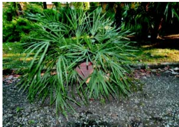
Fig. 3 The Trithrinax palm growing in the Florence Botanical Garden, Photo by Andrea Grigioni, Museo di Storia Naturale dell'Università di Firenze

We here omit the protologues of Trithrinax acanthocoma and T. brasiliensis because the differences between the specimen of Trithrinax growing in the Florence Botanical Garden and these other two species are obvious by the aerial trunk, the structure of the leaf blade and the number of segments.