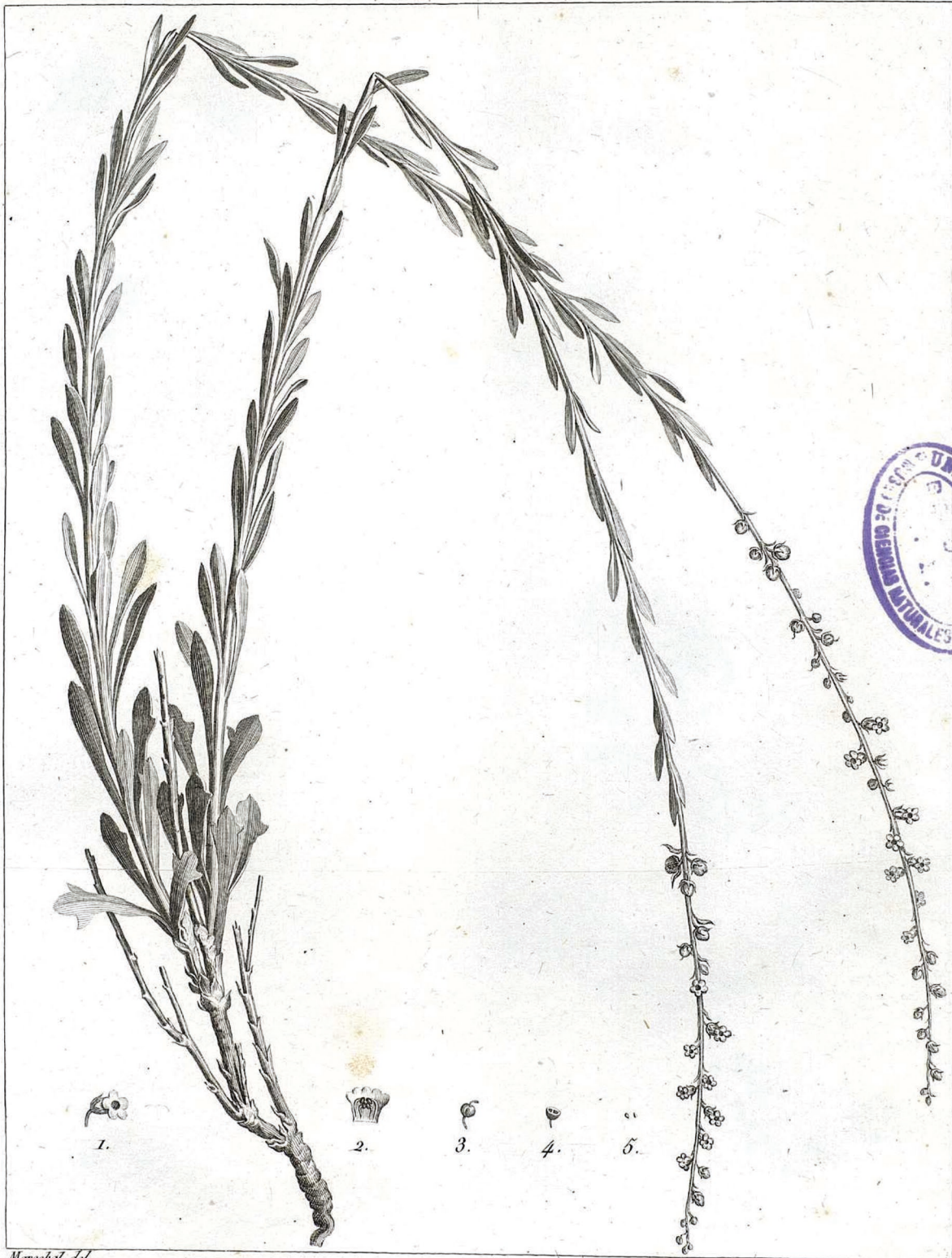
FIG. 1. — Lectotype of Anarrhinum fruticosum Desf., illustration in Desfontaines (1798: pl. 142).