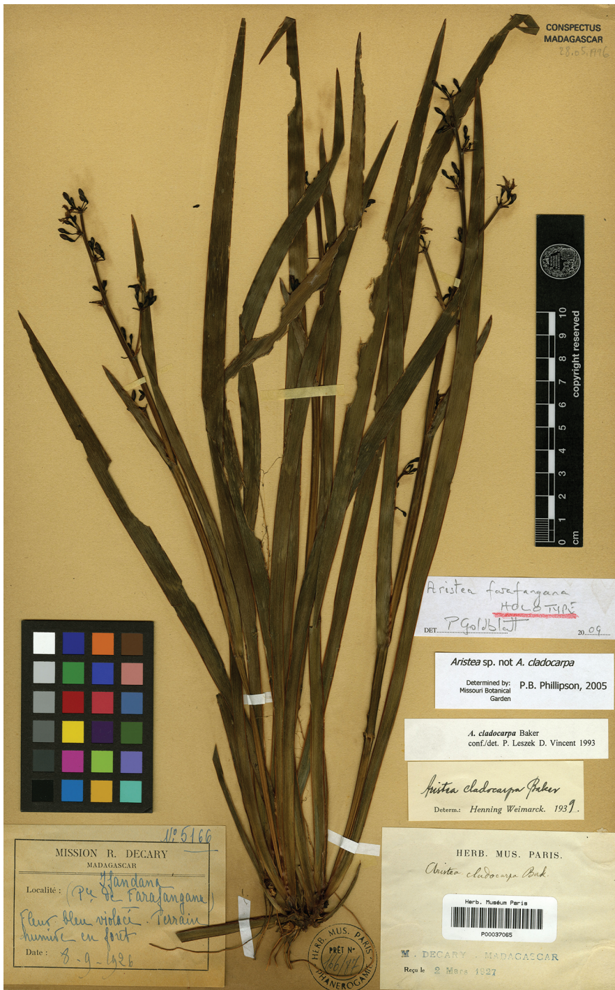
Fig 1. — Type specimen of Aristea farafangana Goldblatt & Phillipson, sp. nov., Decary 5166 (P00037065).