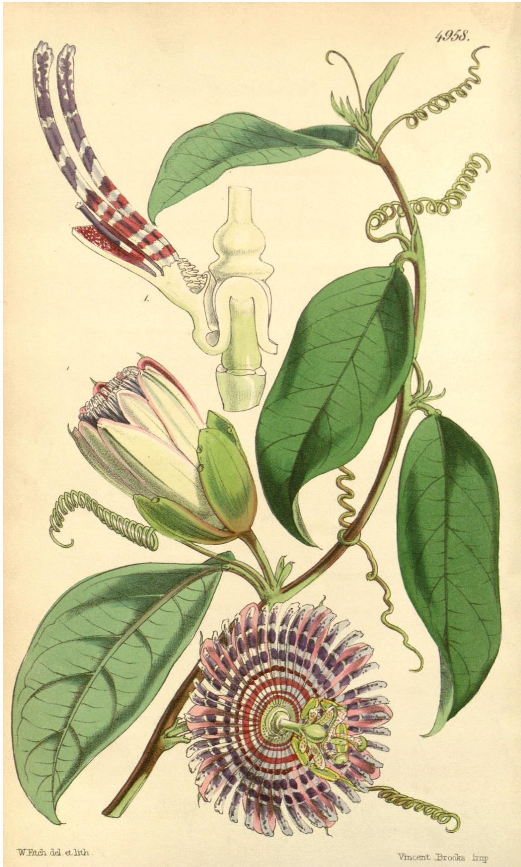
FIG. 2. — Iconography of P. tinifolia Juss. from Guyana, according to Hooker et al. (1857).