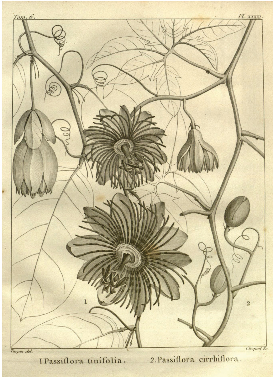
Fig. 1. — Iconography of P. tinifolia Juss. from the original description by Jussieu (1805).