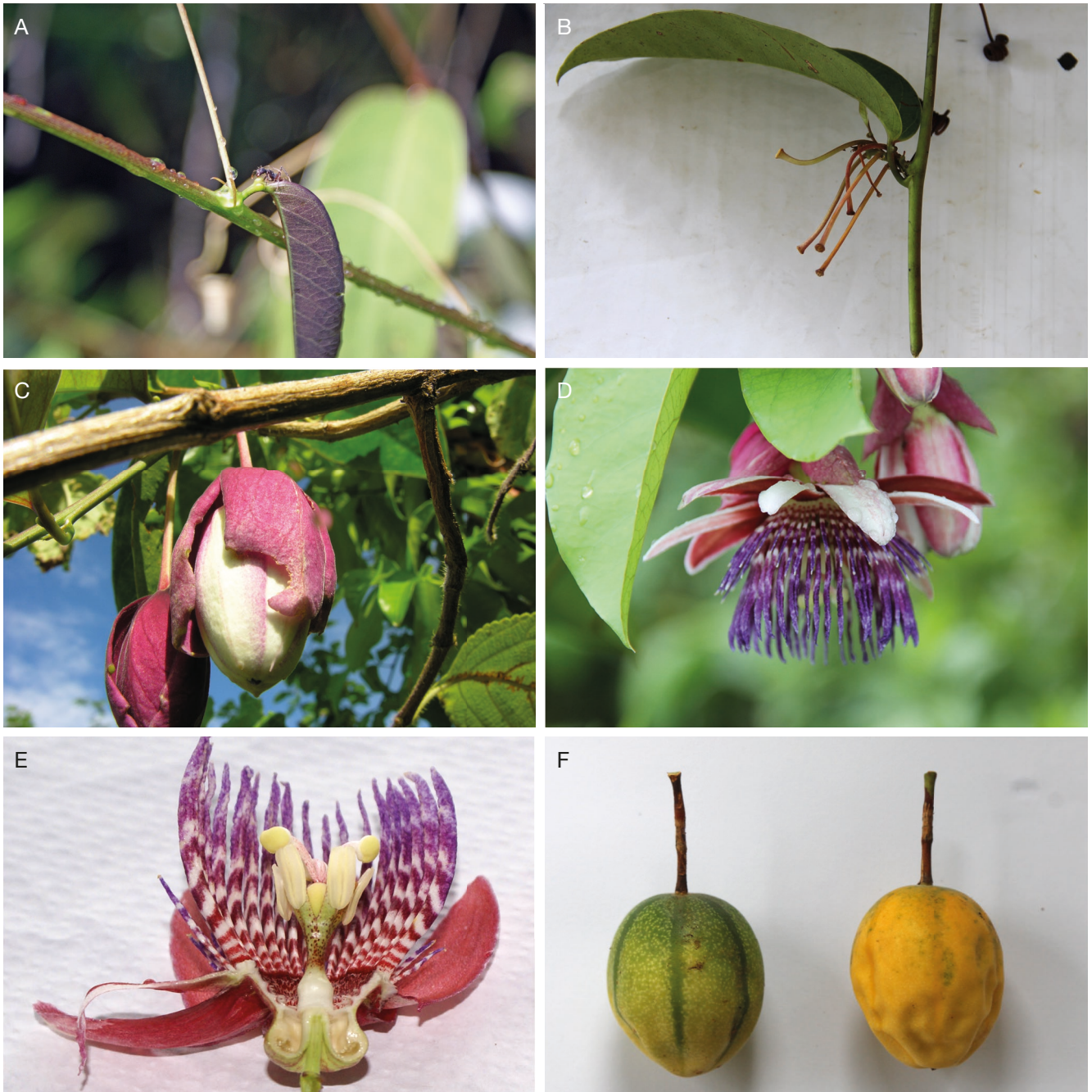
FIG. 4. — Passiflora tinifolia Juss., French Guiana: A , young leaf with glands at the apex of the petiole and linear stipules; B , mature leaf with peduncles gathered in a pseudoraceme; C , flower bud with bracts; D , flower; E , longitudinal section of flower; F , immature and mature fruit.

is also found in P. gabrielleana , and rarely in P. laurifolia . Thus, only the color of the bracts separates P. favardensis from P. laurifolia .