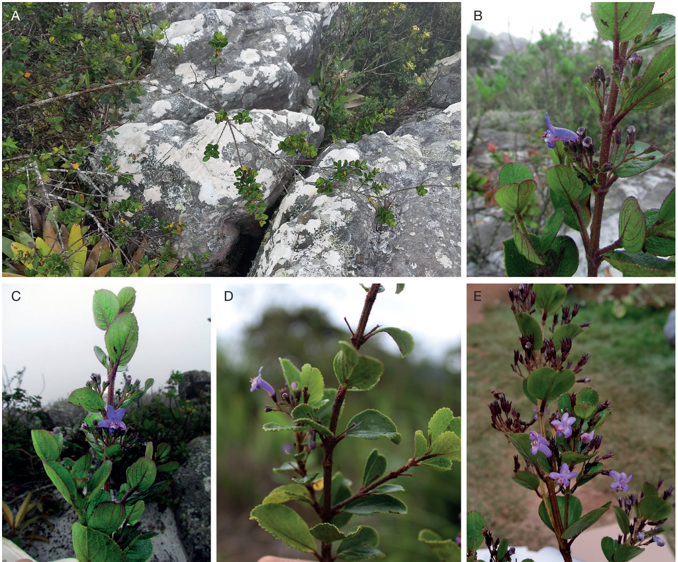
Fig. 3. — Hyptidendron pulcherrimum Antar & Harley, sp. nov.: A , habit and habitat; B , flowering branch, highlighting a flower, side view; C , branch; D , flower and inflorescence; E , flowering branch.