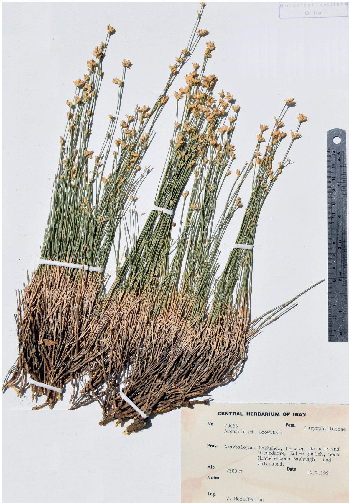
FIG. 1. — Bufonia iranica Z.Rostami, Assadi & F.Ghahrem., sp. nov. From holotype: Mozaffarian 70066 (TARI).