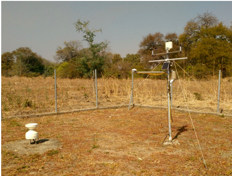
Figure 6. Automatic weather station in Sikaunzwe, which sends data directly to the ZMD, but is not disseminated locally.

provided by the ZMD is significantly limited. The only formal climate and weather information that consistently makes it to the ground are seasonal forecasts which are printed on pamphlets and distributed annually by the ZMD. This fact is particularly tragic considering that in the Southern Province alone, the ZMD has eight automatic weather stations collecting live data. Furthermore, while the ZMD's headquarters has the technical capacity to prepare flood forecasts and issue advisories based on precipitation and live river level data collected upstream, its current system of relaying information electronically prevents meaningful lead times from reaching the most at-risk people on the ground who often lack electricity and cellular networks, not to mention working internet connections.