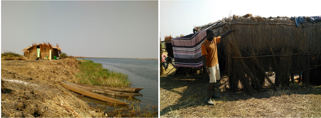
Figure 4. In the fishing village of Simalaha, residents illustrate water levels during the 2006 floods.

which were strictly described in terms of their negative impacts, people also recognized the positive roles that floods play in fishermen's livelihoods as well as in supporting soil fertility on the floodplain.