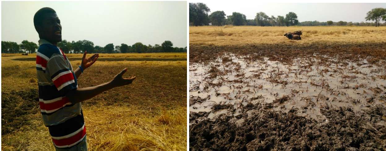
Figure 10. Site of the Nakalonzya Dam in Sikaunzwe where residents hope to deepen a natural wetland to store floodwaters and enhance their water security.

In Sikaunzwe, for example, I was taken to Nakalonzya Dam near Nduna village to a natural pond on the floodplain. This reservoir, I was told, provides drinking water for both people and livestock until September when it typically dries up. However, due to the clay-like soils on the floodplain that provide a natural seal, if deepened residents were sure that the reservoir would be able to hold water for several months longer and provide significant relief from the increasing number of dry spells experienced locally. Supporting community-initiated adaptive strategies such as this could work to address the dual climate-induced challenges of floods and droughts experienced in Kazungula communities.