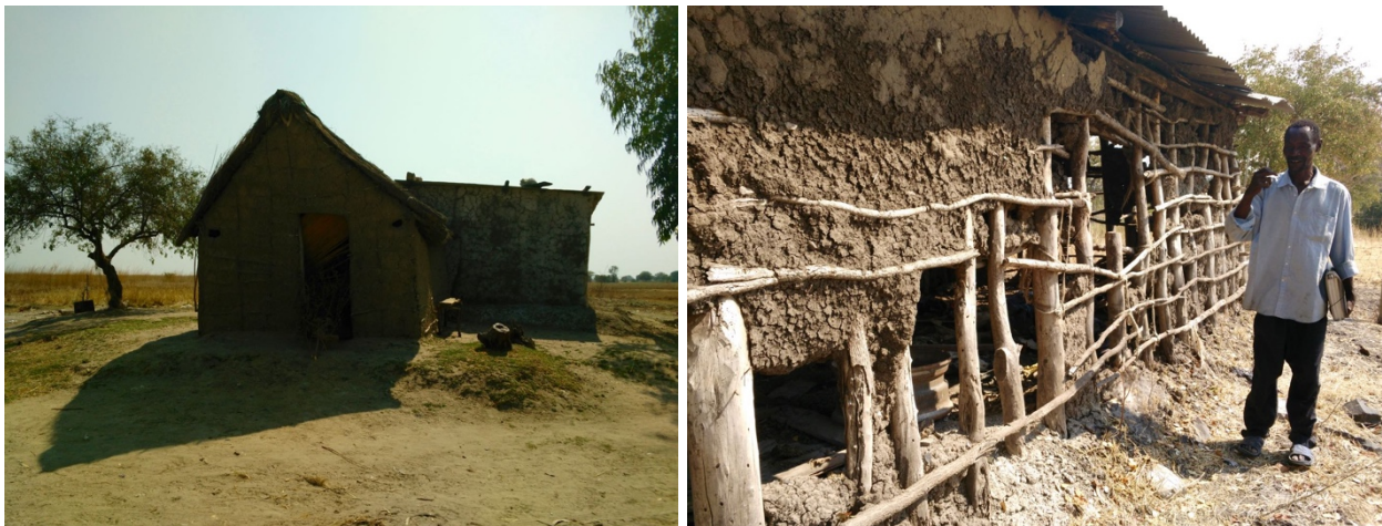
Figure 5. Homes, even those constructed on earthen mounds, often suffer irreparable damage.

Beyond these agricultural adaptations to protect crops from loss to floods and droughts, most residents described seasonal or temporary relocation as a commonly practiced adaptive strategy. Unlike much of the world where land tenure is dominated by private property, such fluid movements to and from the river are much more feasible in places like Zambia where tribal and customary law still dominates. Most residents described at least some members of their household shifting to the upland for a period of time during the rainy season with their cattle for grazing. There, some people have permanent structures, while others prepare temporary ones each season. In more flood-prone communities like the fishing camp of Simalaha on the riverbanks of the Zambezi, people retract to permanent villages annually where they live in homes constructed on human-made mounds of soil to elevate themselves above the floodplain. In the event of a major flood, the whole Simalaha community will move to higher ground, either in upland areas of the bush or on the elevated tarmac road, where there is greater accessibility to relief. Actions that people can take to secure their homes are generally limited to basic reinforcement with wooden poles. Most structures are merely left and subsequent damages have to be repaired or reconstructed after floodwaters recede.