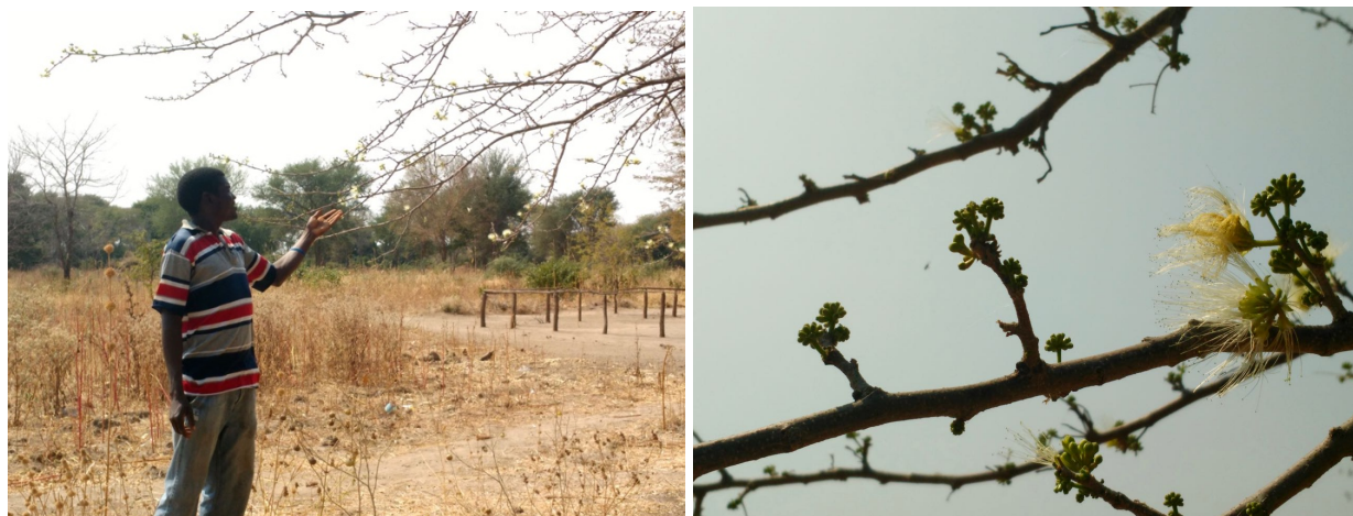
Figure 7. Sikaunzwe SDMC member illustrates how early blossoming trees indicate good rains.

While many of these environmental indicators are more useful for anticipating seasonal shifts in precipitation than impending disasters, people predict more immediate weather patterns by watching the formation, movement and type of clouds on the horizon. This, in tandem with studying wind direction, can be used to predict rains within a window of a few days. Residents also described how watching the water table in their deeper wells also provides some advanced warning to floods. Often, people explained, the day before a flood the water in their wells becomes cloudy due to seepage.