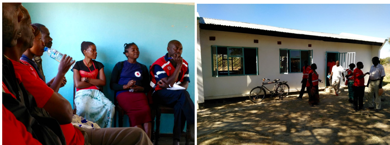
Figure 9. Community meetings provide an efficient avenue for rapidly communicating early warnings.

This information is then distributed locally by the village headman and his personal messengers, sometimes with the help of the ZRCS's SDMCs at whatever village meetings, church congregations, and collective events like funerals already planned. These venues enable rapid and wide dissemination in places with limited communication infrastructure. In urgent situations, people sometimes use bicycles to go house-to-house, though this form of transportation is difficult in the rainy season when roads and paths are deeply rutted. Depending on the type of precipitation event upstream, these method of dissemination can be effective, but in flash flood events they often fail to provide adequate lead time.