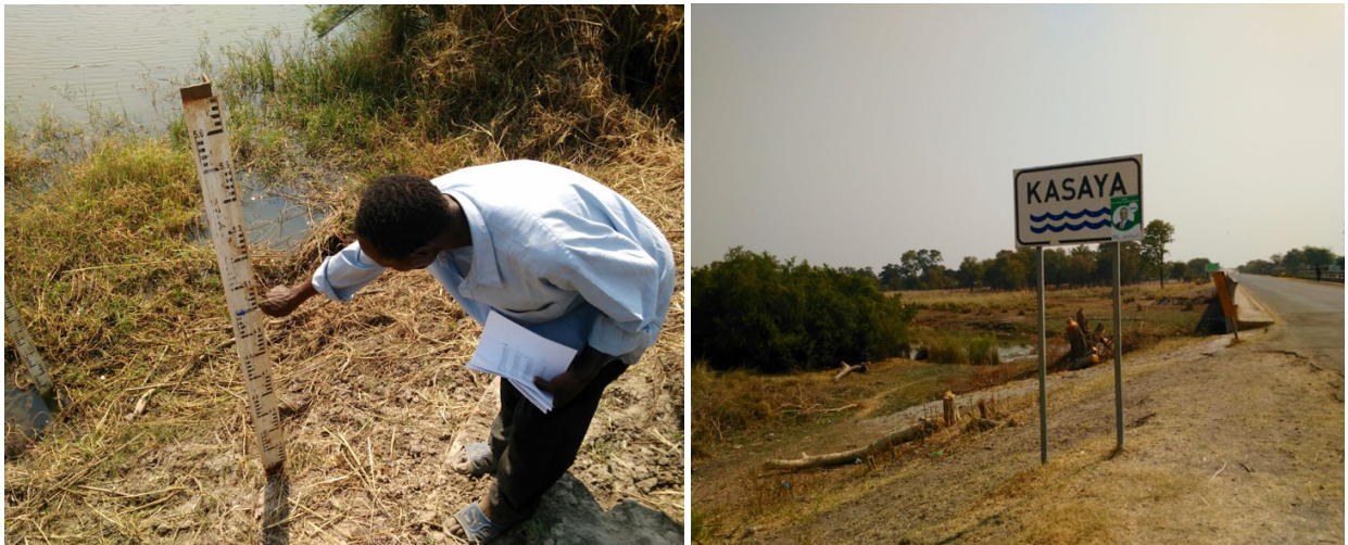
Figure 8. The gauge reader at the Kasaya Bridge takes river level readings three times daily for the Water Resource Management Authority.

collected at local ZMD-supported weather stations and the Water Management Authority (WARMA)'s live river level gauges is not actively being used or distributed locally. Instead, the data is either sent automatically, in the case of the ZMD weather station in Kazungula, or sent manually by gauge readers employed by WARMA to their headquarters. For whatever reason, either due to capacity issues or disinterest, formal weather and climate information generated in the region is strictly being extracted without being applied to the needs of local communities. Similarly, neither live precipitation data recorded by the ZMD nor live river level data registered by WARMA gauges in the upstream are disseminated to downstream communities who could take early action to avoid losses to floods based on such information.