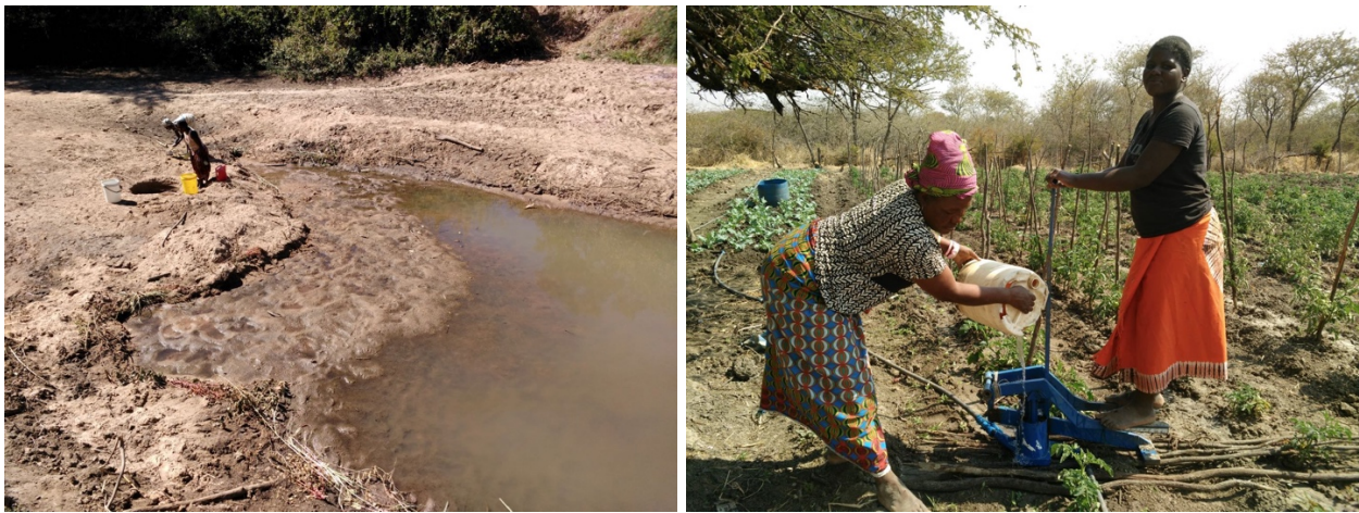
Figure 3. Water-stressed residents in Kawewa draw drinking water and irrigate their fields.

through property and crop loss, associated starvation, and the outbreak of diseases among both human and livestock populations due to compromised drinking water sources and waterlogged pastures in the aftermath of floods. Residents generally stressed droughts as the worst disasters they face and noted an increase in the intensity and extent of dry spells experienced in recent years. This may be a reflection of their most immediate experience, as the past two to three years have been characterized by severe water stress, while there have not been any major floods in the region in several years. Nonetheless, local experiences with growing water stress certainly reflects both regional climate predictions and documented trends of increasing temperatures and a reduction in overall precipitation for Zambia's southern region.