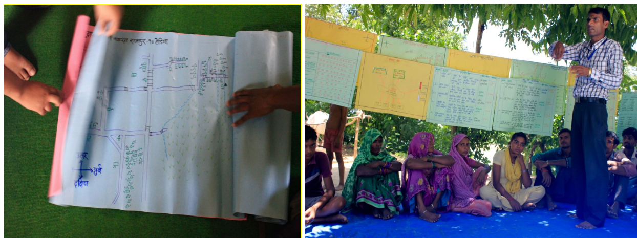
Figure 10. These participatory risk maps and community sensitization meetings offer an example from a community-based early warning system instituted by Practical Action in India and Nepal.

Through such participatory mapping exercises, facilitators can also initiate a discussion about how this locally-produced picture of risk can be translated into meaningful actions taken by residents to prepare for disasters and mitigate their effects. For example, the community may identify the most flood-prone households located in close proximity to water bodies and also map those homes with particularly vulnerable residents (e.g. elderly individuals, people with disabilities) who would need extra assistance during an emergency. Additionally, participants may locate safe places for evacuation in the upland or identify dangers along the route that residents may have to travel to the road in order to access relief materials. This kind of visual representation of risk can provide the basis for developing concrete community-initiated contingency plans that will enable residents to prepare for and respond to disasters in the absence of state support or until formal assistance arrives.