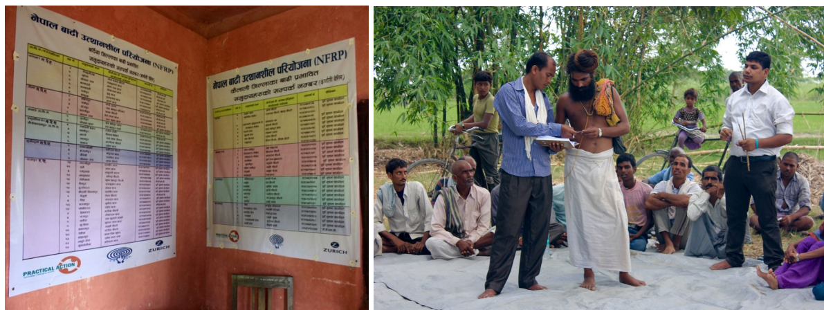
Figure 10. In Nepal and India, Practical Action has developed a formal list of downstream contacts and their updated phone numbers (Image Left), and has also paired individuals in upstream and downstream communities to exchange personal contact information (Image Right).

Certainly, informal communication strategies already exist for relaying critical information in advance to disasters. However, as residents noted, these systems are not always effective at providing adequate lead times and their informal nature also means that not all stakeholders consistently receive the information. Thus, an intervention informed by more extensive interviews and focus groups with stakeholders in Kazungula communities could determine whether or not a more formal structure for communicating lead times to downstream communities would be useful. My suggestion is not that an intervention should seek to replace, or even inadvertently displace, existing communication strategies that function locally, but rather that there may be ways in which greater formalization—if supported by residents—could enhance existing systems and increase local preparedness across Kazungula.