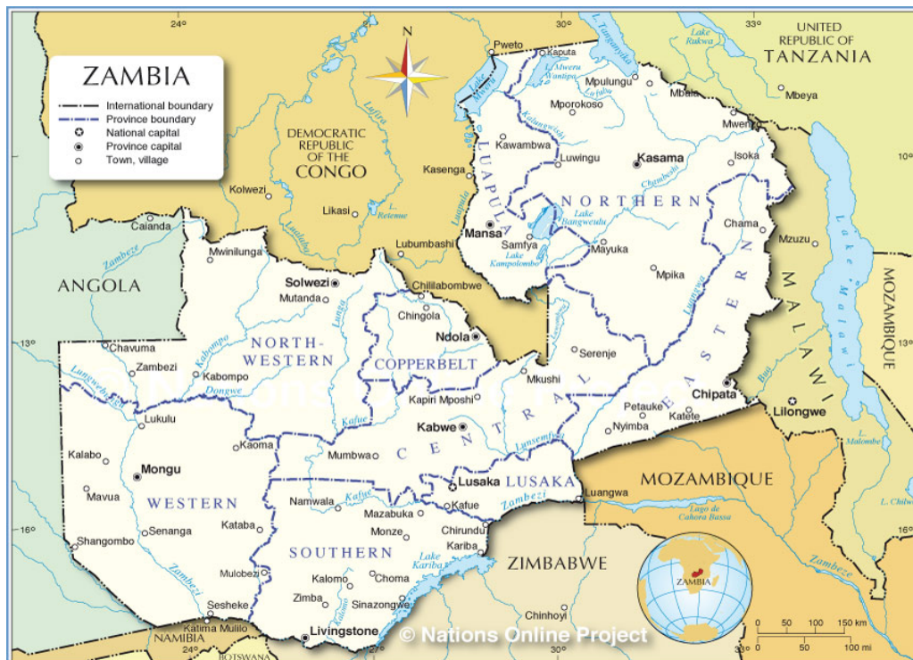
Figure 1. Map of Zambia including Southern Province

In the past two decades, Zambia's Southern Province has experienced an increasing number of extreme events, including both destructive floods and chronic droughts (Mweemba et. al, n.d.). Flooding on both the Zambezi River and along its tributaries is most often caused by extreme precipitation events upstream, particularly in the headwaters region of the Northwest Province. This process of recurring inundation, however, is also essential to local agro-pastoral production systems. Nonetheless, there have been an increasing number of severe floods over the past two decades, including particularly devastating events that impacted Kazungula residents in both the 2006/2007 and 2008/2009 rainy seasons (Mweemba et. al, n.d.).