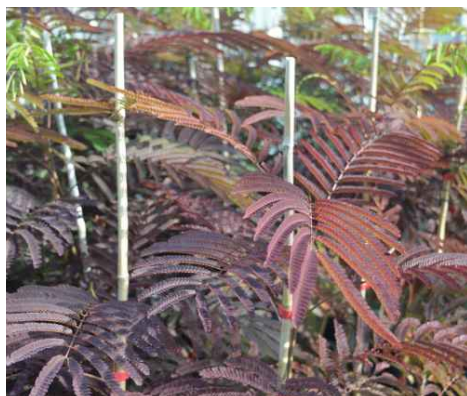
Albizia jul Summer Chocolate