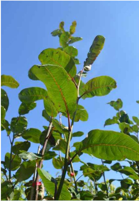
Salix magnifica – leaf detail