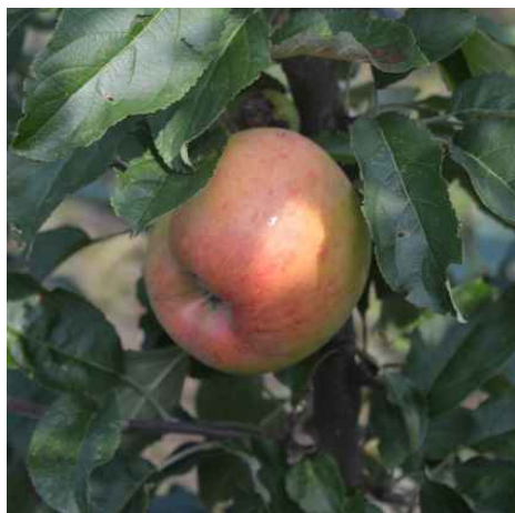
Apple Rosemary Russet