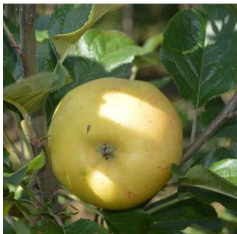
Apple Rev W Wilkes