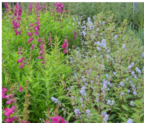
Penstemon Charles Rudd + Ceanothus Glori de Versailles