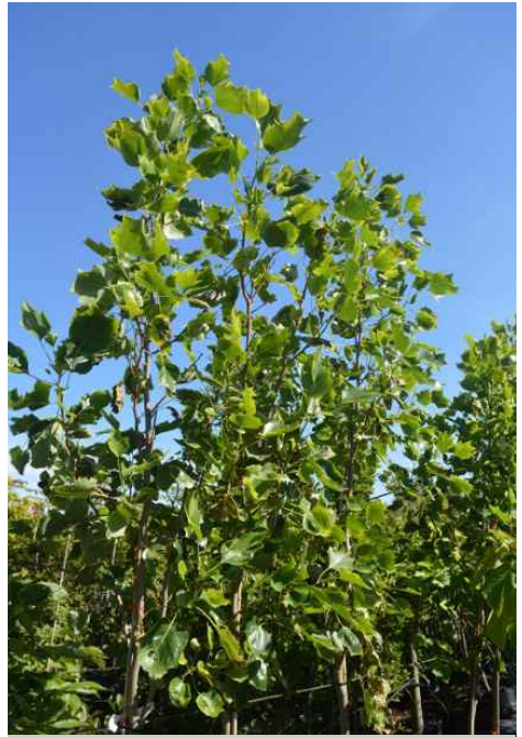
Liriodendron tulipifera Aureomarginatum