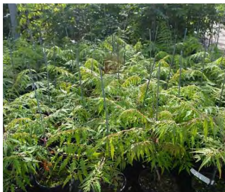
Rhus tryphina Tiger Eyes