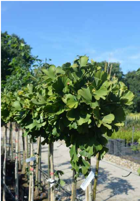
Ginkgo biloba Mariken – Top Worked