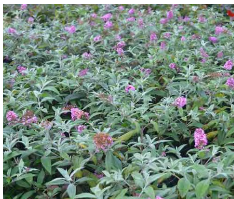
Buddleia davidii Pink Delight