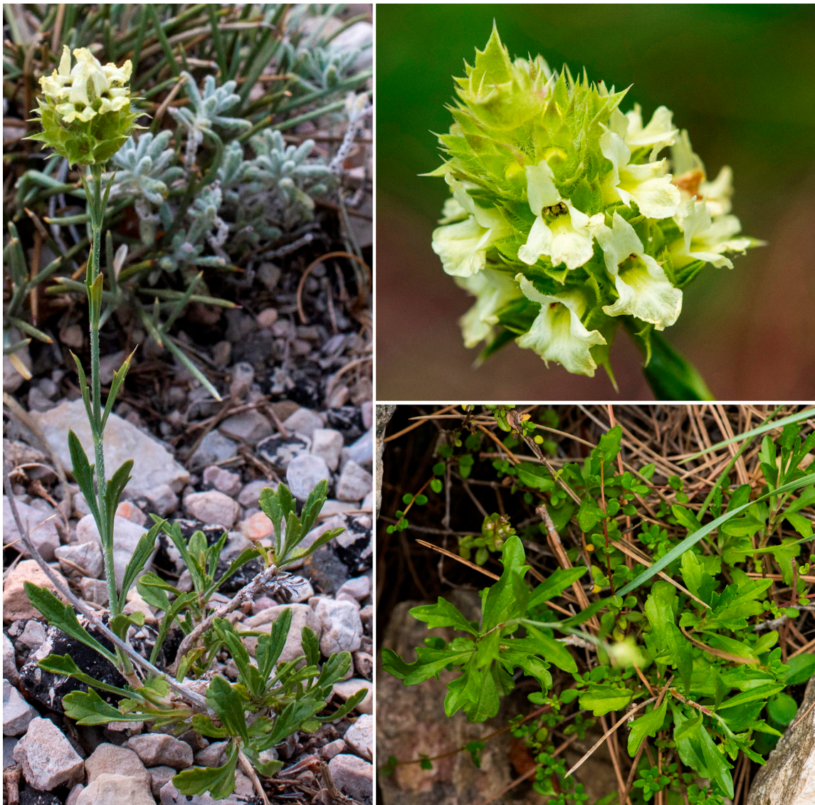
Figure 2. Sideritis royoi (field images in habitat from Caro-La Barcina mountain). Habit ( left ); inflorescence ( above right ); basal and middle leaves ( bottom right ).

Eponymy: The new species is dedicated to the late Ferran Royo Pla (1969–2016) for his outstanding work that contributed to improving the botanical knowledge of the Port Massif.