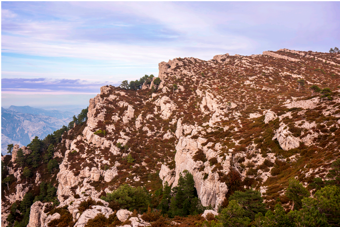
Figure 4. Habitat for Sideritis royoi in the Caro-La Barcina mountain.