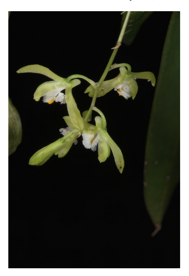
Scelochilus colombianum Uribe-Velez and Sauleda.

Plant epiphytic, semi-erect, caespitose; roots slender, flexuous; pseudobulbs cylindrical, to 2 cm long, 4 mm wide; base with 2-3 foliaceous sheaths, concealed at the base by the bases of 2—3 foliaceous sheaths, obovate, acute, to 1.8 cm long, 1 cm wide; leaves flattened to slightly conduplicate, petiolate, coriaceous, linear oblong, subacute, lanceolate, petiole to 5 mm long; inflorescence lateral, to 5-flowered, peduncle arching, terete, to 6 cm long, with 4-5 conduplicate, lanceolate, acute bracts, to 3 mm, long, 1 mm wide; floral bracts ovate, acute, to 3 mm long, 2 mm wide; ovary pedicelate to 1 cm long; sepals green, dorsal sepal oblanceolate, subacute, concave, to 1 cm long, 4 mm wide, reclined over column, lateral sepals connate for 8 mm into a concave synsepal, to 1.0 cm long, 6 mm wide, apexes subacute, extending at the base into a sepaline, saccate, obtuse spur, to 3 mm long; petals pale green, linear elliptic, subacute, slightly concave, clasping column, to 9 mm long, 3 mm wide; labellum 3-lobed, oblanceolate, to 1.3 cm long, 6 mm wide, basally canaliculate, with two acute lateral protrusions, to 1.0 mm wide, lateral lobes elliptic, to 5 mm long, fimbriated, midlobe orbicular, to 6 mm wide, emarginate, apex bent under causing the bilobed yellow callus to protrude; column terete with two thin lateral wings toward the apex, to 12 mm long, 3 mm wide; stigma transverse oval, to 3 mm wide; anther cap oval, to 1.2 mm wide.