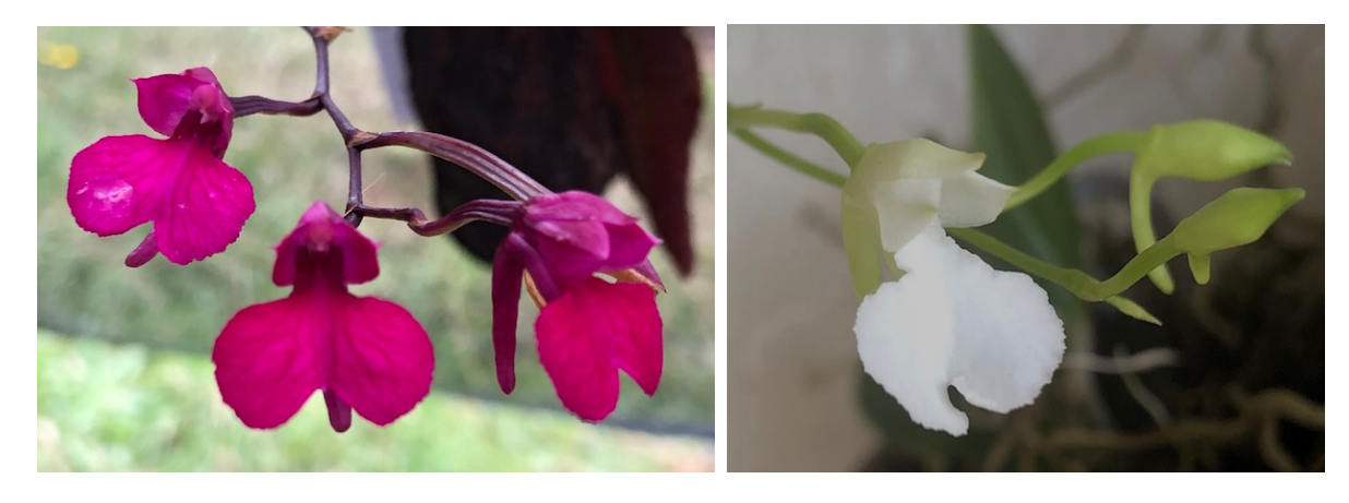
Comparettia falcata Poepp. & Endl.