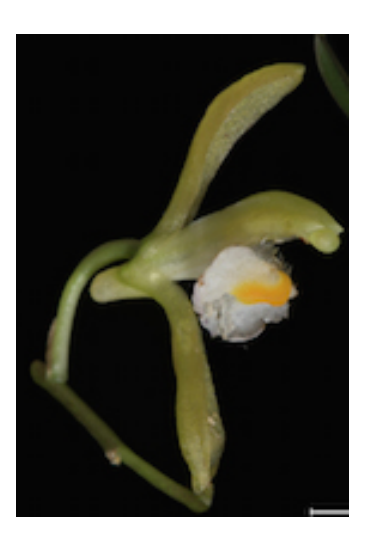
Scelochilus colombianum Uribe-Velez and Sauleda with sac-like mentum.