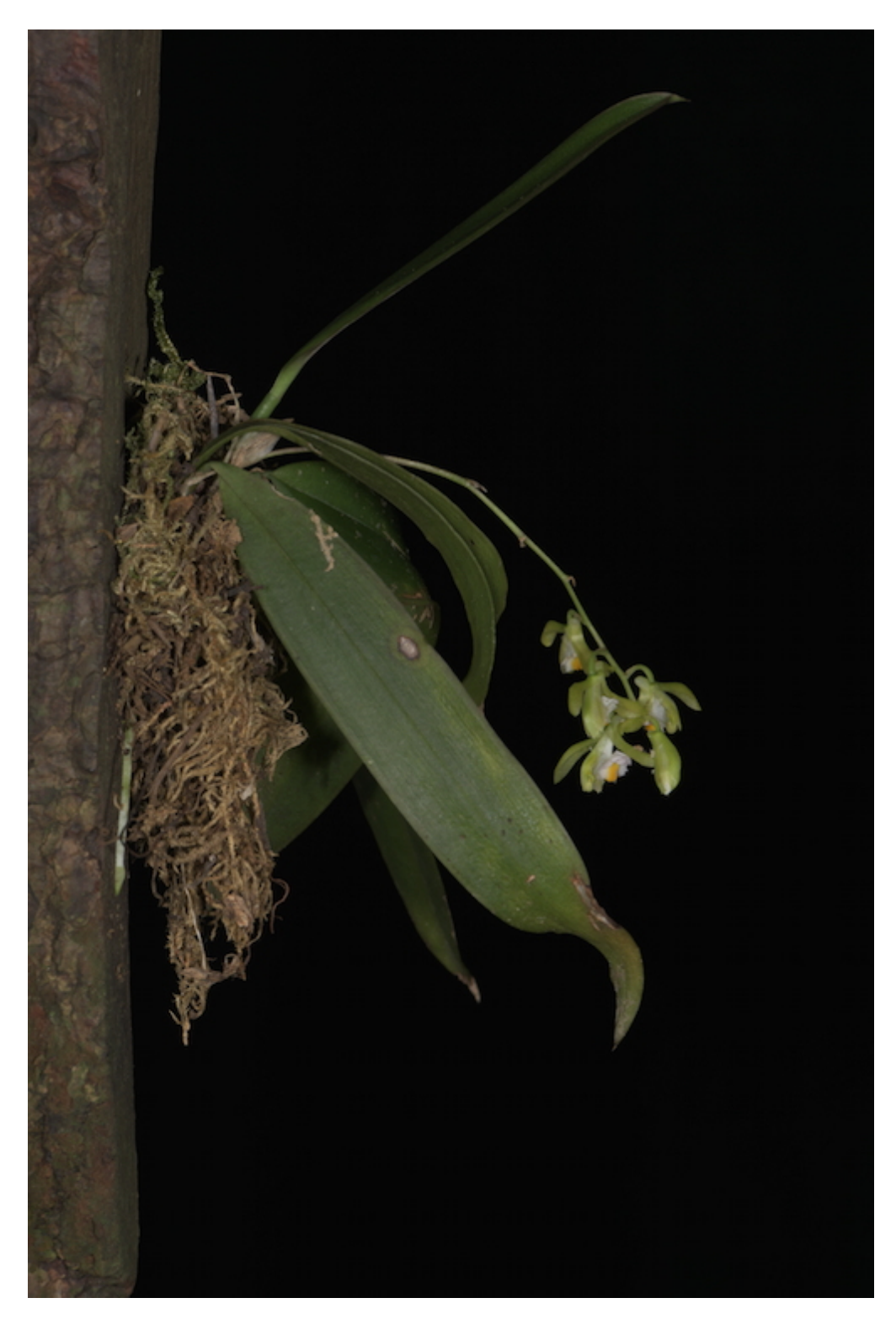
Scelochilus colombianum Uribe-Velez and Sauleda.