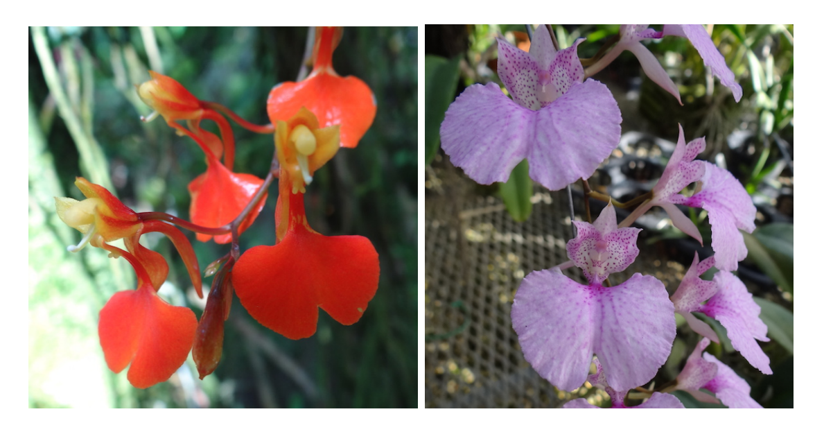
Comparettia ignea P.Ortiz.