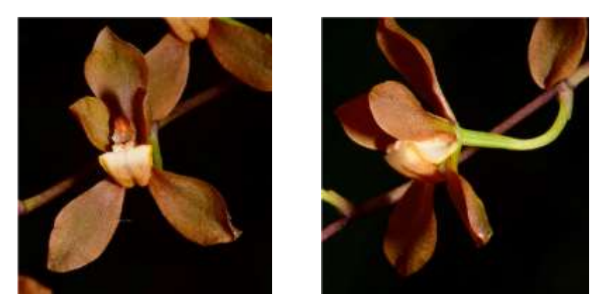
Dasyglossum putumayoensis Uribe-Velez, Sauleda & Szlachetko.

Plant to 14 cm tall; pseudobulbs oblong to obovate, slightly laterally compressed, to 6 cm long, 2.8 cm wide, enclosed basally with 1–2 leafy bracts, unifoliate; leaves linear oblong ligulate, to 10 cm long, 2 cm wide, subacute; inflorescence arching, unbranched, with apressed scale-like bracts, lanceolate, acute, to 4 mm long, 2 mm wide; pedicel with ovary, terete, to 1.2 cm long; flowers with brown maroon tepals; dorsal sepal broadly oblanceolate to spathulate, apiculate, to 1.4 cm long, 4 mm wide, lateral sepals free, broadly oblanceolate to 1.5 cm long, 4 mm wide; labellum white with reddish-brown margin, shallowly 3-lobed, elliptic in outline, to 1 cm long, 6 mm wide, emarginate, lower half of the labellum curving downward from the column, callus a simple pair of fleshy ridges, extending out from labellum, to 2 mm; column short stout, to 8 mm long, 3 mm wide, white basally reddish-brown with two short winglike projections, apex of projections reddish-brown; anther cap reddish-brown, globular to 2 mm wide; pollinarium 1.5 mm long, with 2 clavate pollinia, to 1 mm long.