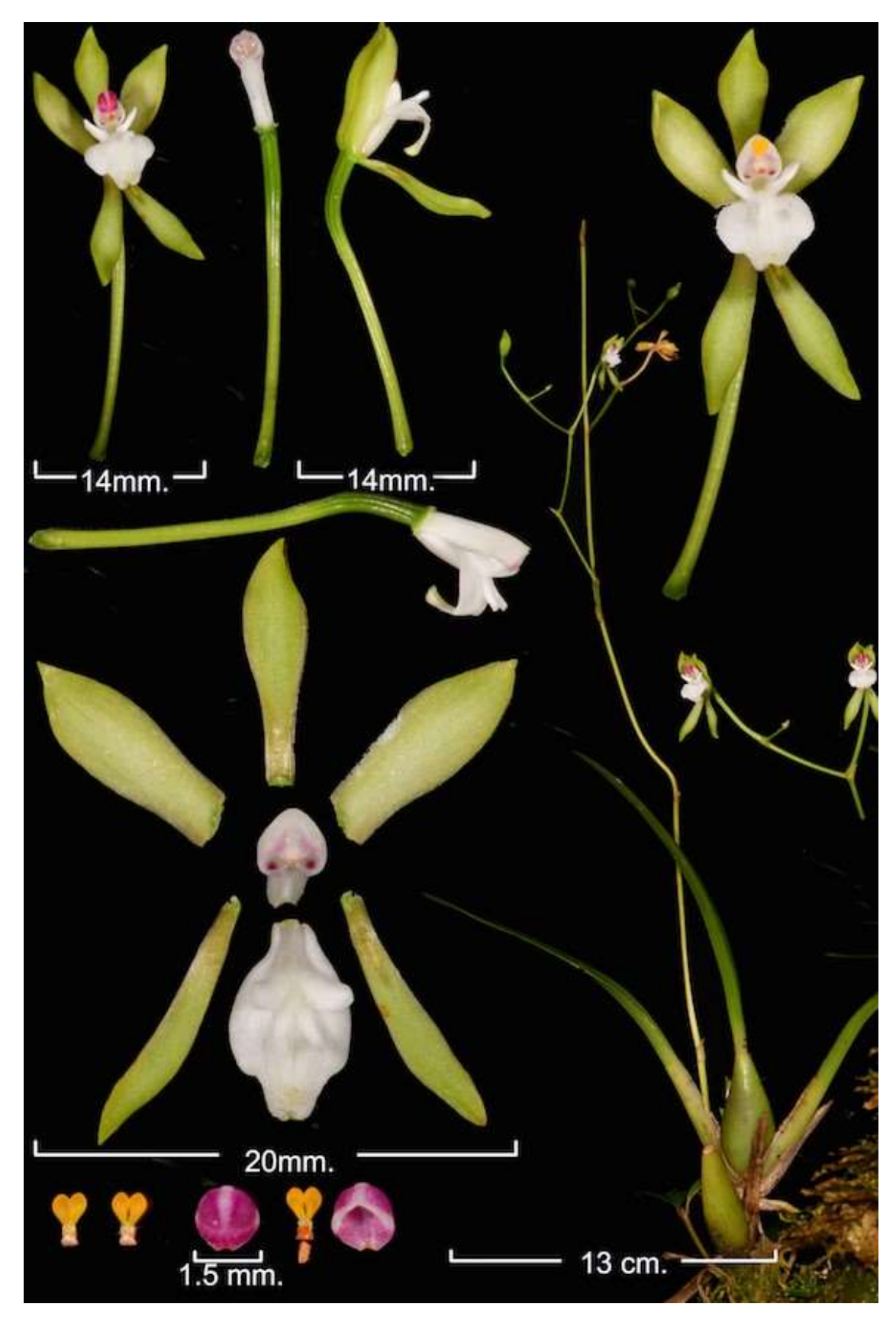
Dasyglossum caucanum Uribe-Velez, Sauleda & Szlachetko.