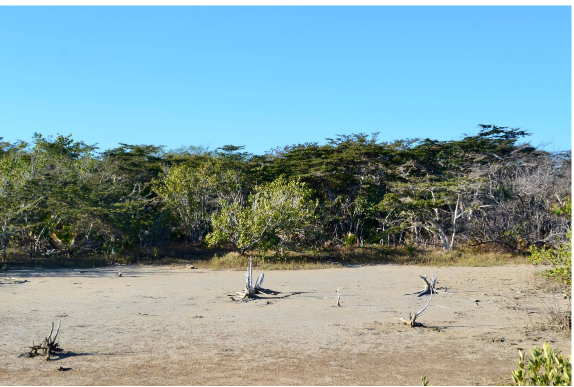
Tolumnia lyarata occurs in the sandy beach vegetation behind the estuaries that surround the shoreline.