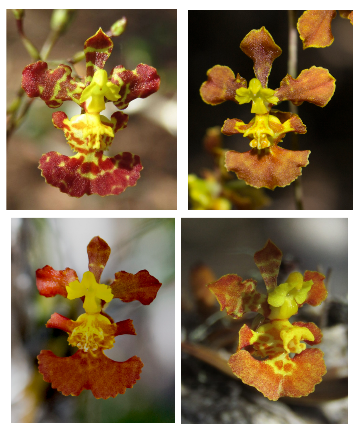
Variation in Tolumnia lyrata from Isla de la Juventud.