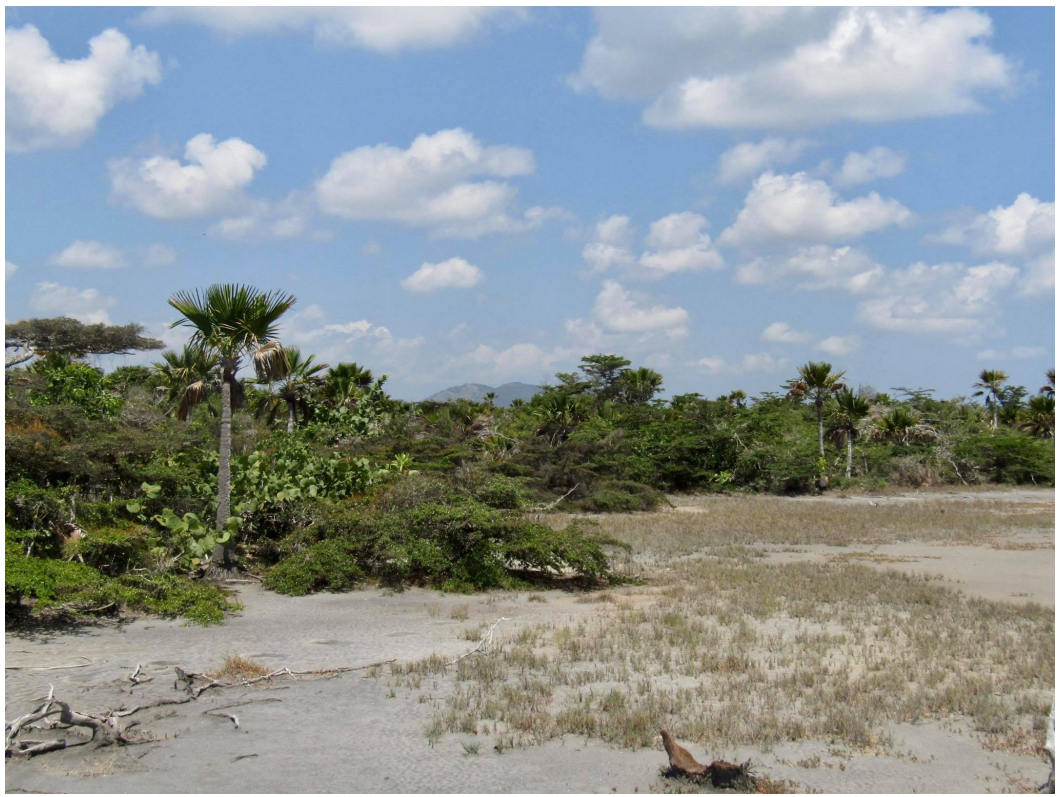
Tolumnia lyarata occurs in the sandy beach vegetation behind the estuaries that surround the shoreline.