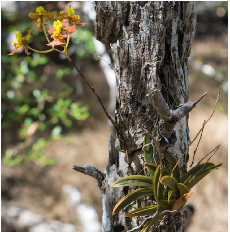
Tolumnia lyrata in situ at Isla de la Juventud.