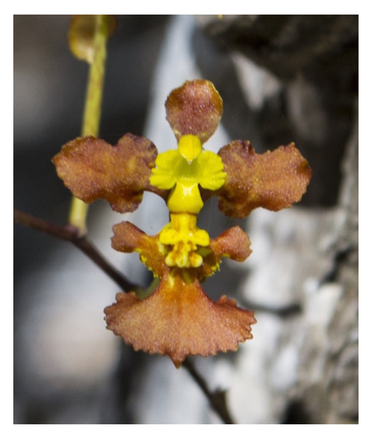
Tolumnia lyrata from Isla de la Juventud.