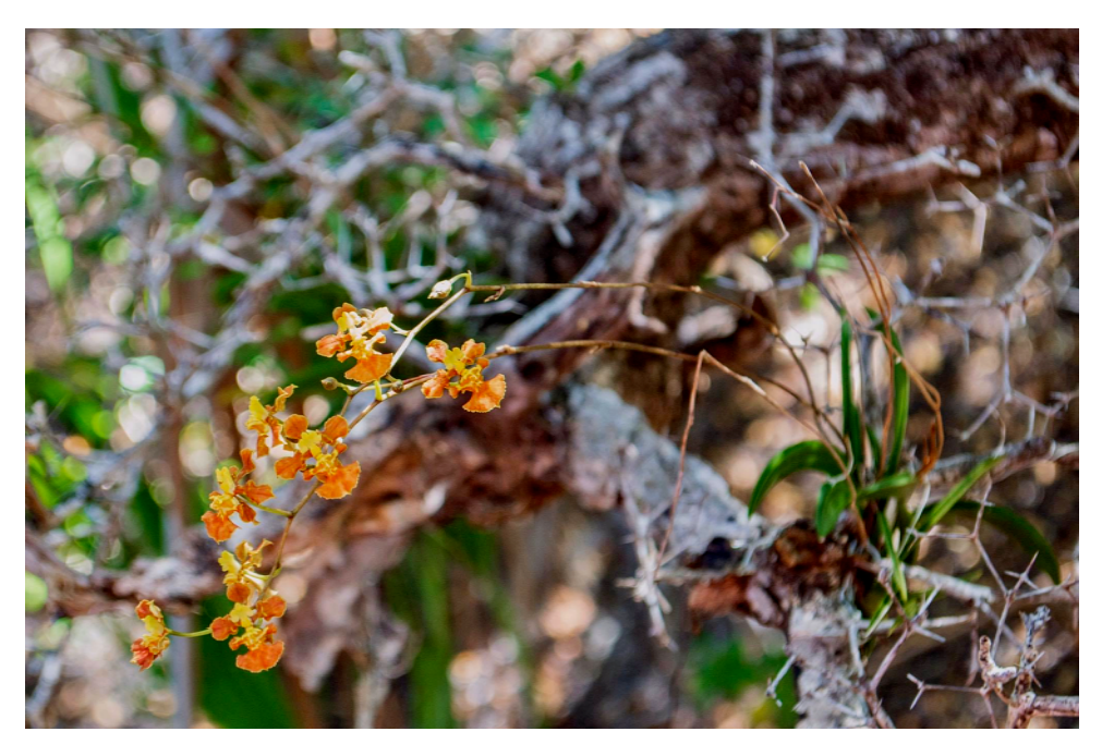
Tolumnia lyrata from Isla de la Juventud in situ.

Plants epiphytic, caespitose, equitant, to 35 cm tall; roots white, numerous; rhizome short concealed by scarious bracts and leaf bases; leaves 3-5, green to greenish-brown with minute reddish-brown spots, distichous, triquetrous, laterally compressed, straight to falcate, narrowly elliptic, acuminate, upper margins minutely erose-crenulate, to 5 cm long, 6 mm wide; inflorescence erect to 35 cm tall; peduncle to 28 cm long, with distant, scarious, sheathing bracts, to 8 mm long, panicle to 7 cm tall, unbranched, to 8 flowers, floral bracts conduplicate, lanceolate, acuminate to 5 mm long; flowers predominately reddish-orange, sometimes with yellow spots or bars; pedicellate ovary filiform to 18 cm long, dorsal sepal reddish-orange, obovate, apically acuminate, to 6 mm long, 3 mm wide; lateral sepals connate nearly to their acute apices, obovate, to 7 mm long 3 mm wide; petals reddish-orange, pandurate, apically acuminate to 8 mm long, 4 mm wide, labellum reddish-orange with a yellow crest, 3-lobed, to 1 cm wide, 1 cm long, with a pronounced minutely toothed isthmus, lateral lobes obovate, midlobe lyrate-pandurate, margin crenulate and wavy, apically acuminate callus with two lateral projections and one central ridge; column yellow, erect to 4 mm long, 2 mm wide, column wings yellow, bilobed to crenulate, to 2 mm long, 1 mm wide. Anther yellow.