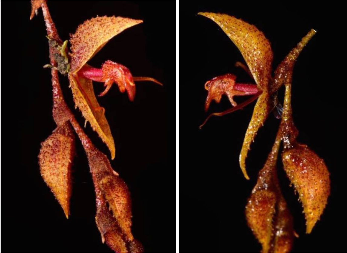
Draconanthes chingazaense Uribe-Velez & Sauleda.