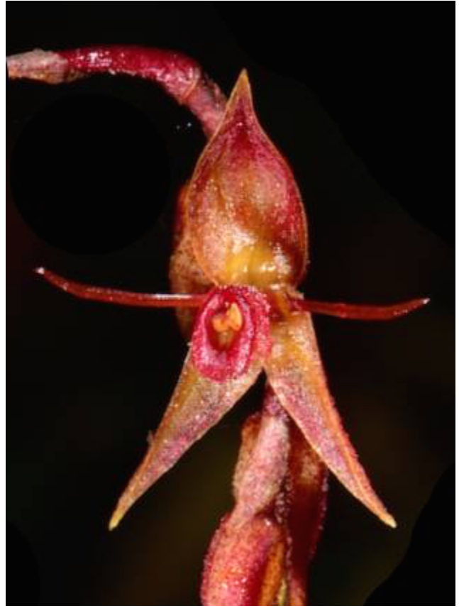
Draconanthes chingazaense Uribe-Velez & Sauleda.