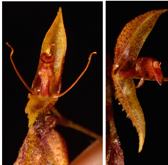
Draconanthes chingazaense Uribe-Velez & Sauleda gynostemium structure demonstrating hinged anther that folds back onto stigma resulting in self-pollination.