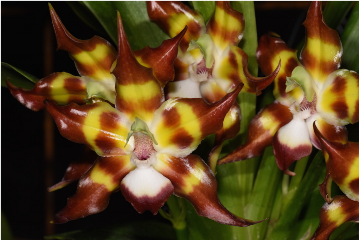
Huntleya apiculata (Rchb. f.) Rolfe.