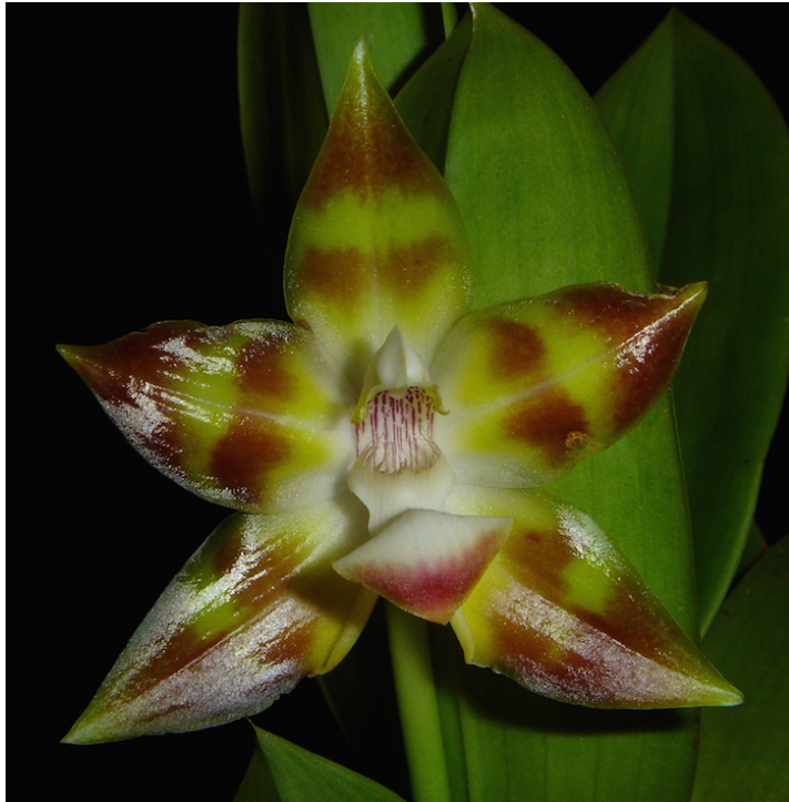
Huntleya lucida (Rolfe) Rolfe.