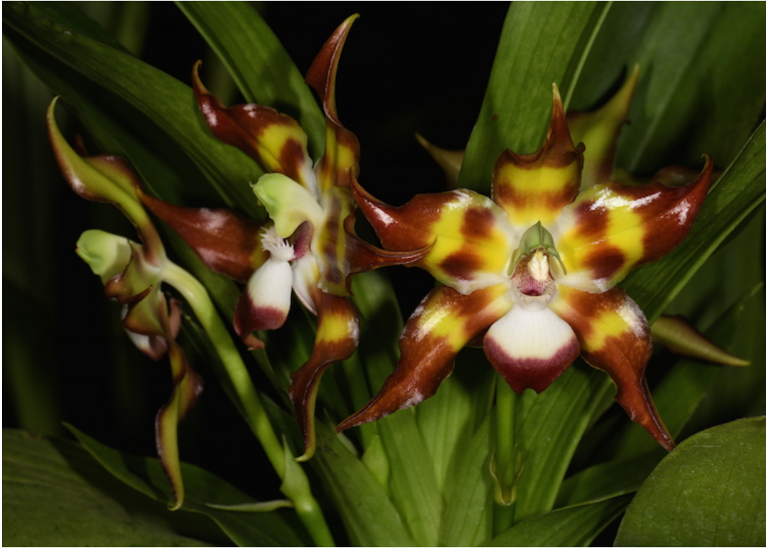
Huntleya apiculata (Rchb. f.) Rolfe.