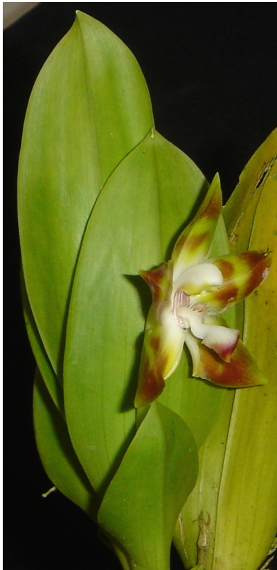
Huntleya lucida (Rolfe) Rolfe.