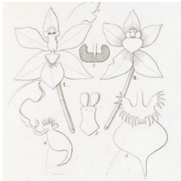
Illustration of Batemaniana apiculata Rchb. f. in Xenia Orchidacea Vol. III t. 216 (1900).

The column of H. apiculata has broad green divergent column wings; the labellum is broadly semiovate, base color is white, becoming reddish-brown towards the lateral margins and apex, apex is reddish-brown; the crest is semicircular, white, fimbriate, the fimbriae on the apical portion of crest are shorter than the fimbriae on the lateral margin; lateral margins of petals are smooth, sepals and petals are widest at base, quickly narrowing, almost as wide as long, apiculate.