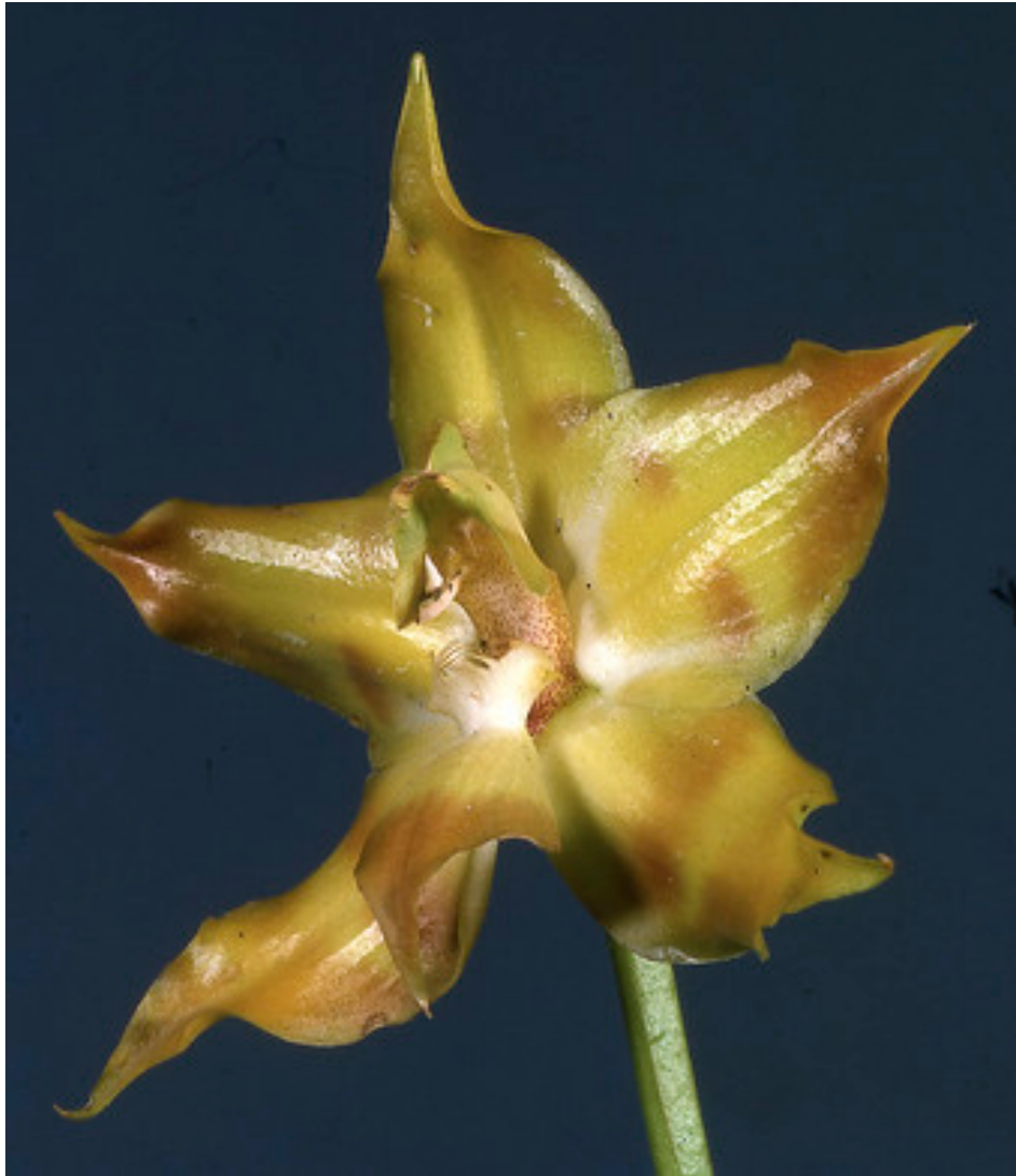
Huntleya apiculata (Rchb. f.) Rolfe.

Huntleya lucida (Rolfe) Rolfe. Orchid Review 24 (286): 236. 1916.