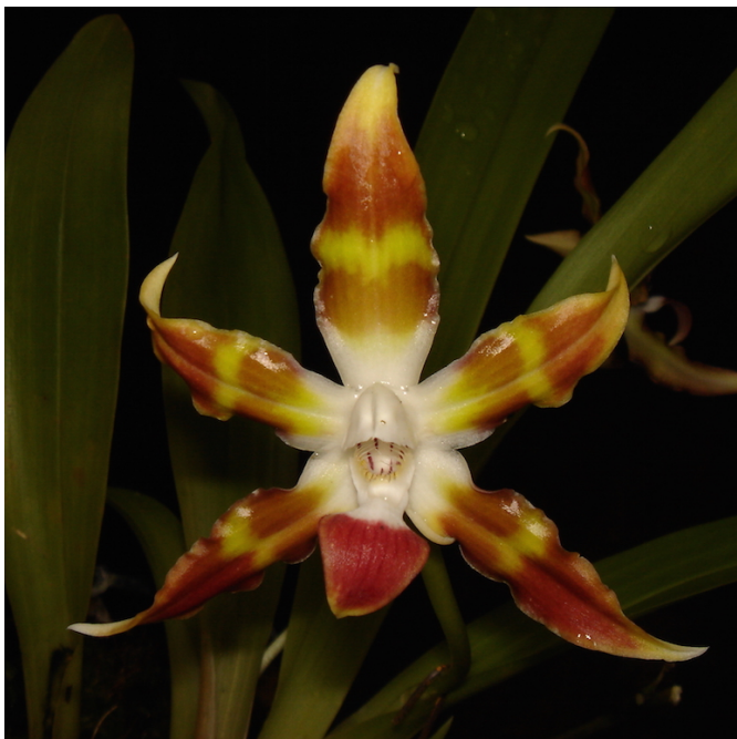
Huntleya fasciata Fowlie.