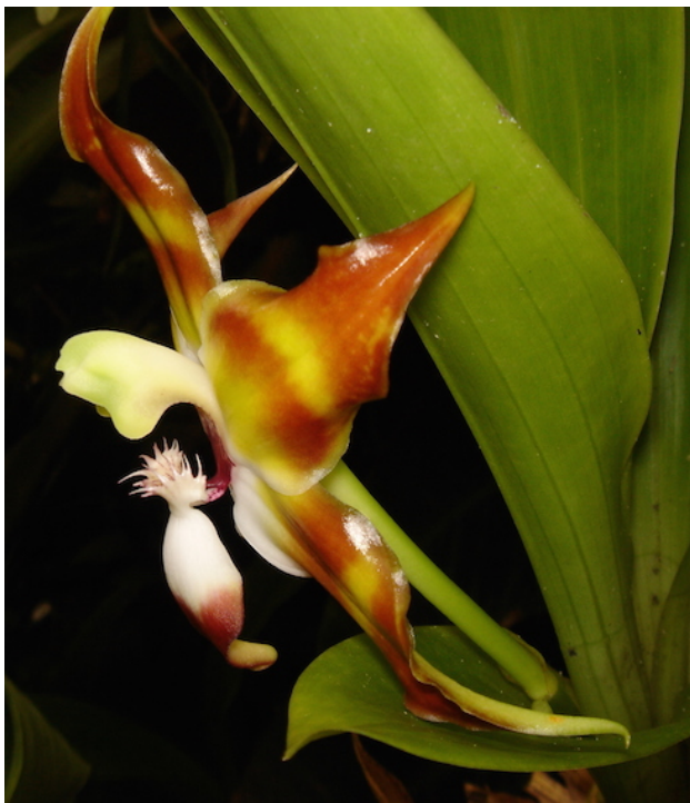
Huntleya apiculata (Rchb. f.) Rolfe.