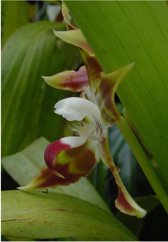
Huntleya fasciata Fowlie.