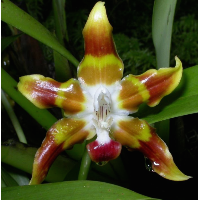
Huntleya fasciata Fowlie.

The column of H. fasciata has rounded obtuse column wings; labellum is broadly lanceolate, acute, recurved, basally white, reddish-brown, margin and apex yellow; crest is semicircular, yellow; sepals lanceolate, acuminate; petals narrowly elliptic, acute, lateral margins of petals smooth. Plants are not caespitose, but have a rhizome allowing the plant to creep upward.