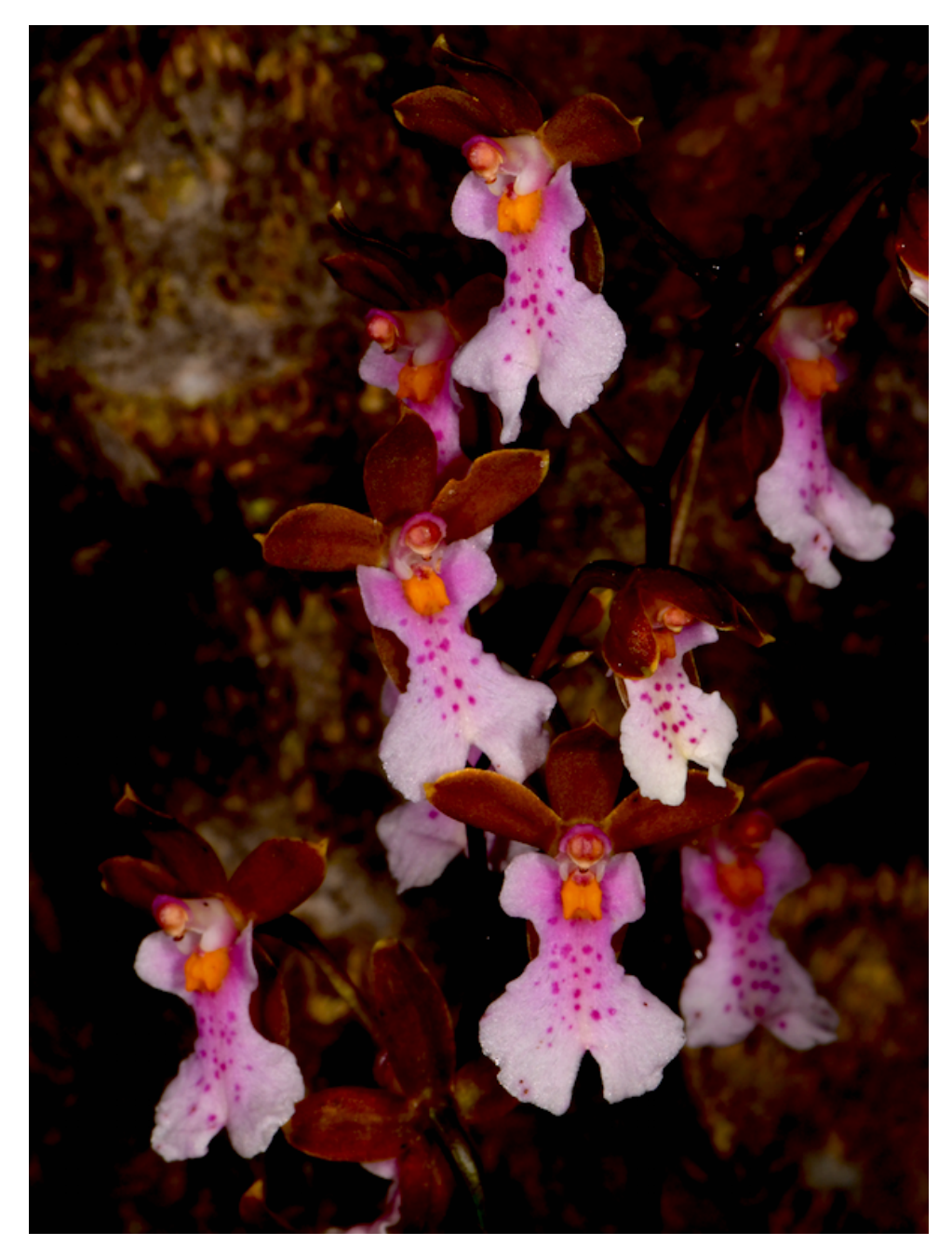
Caucaea colombiana Uribe-Velez, Sauleda & Szlachetko.