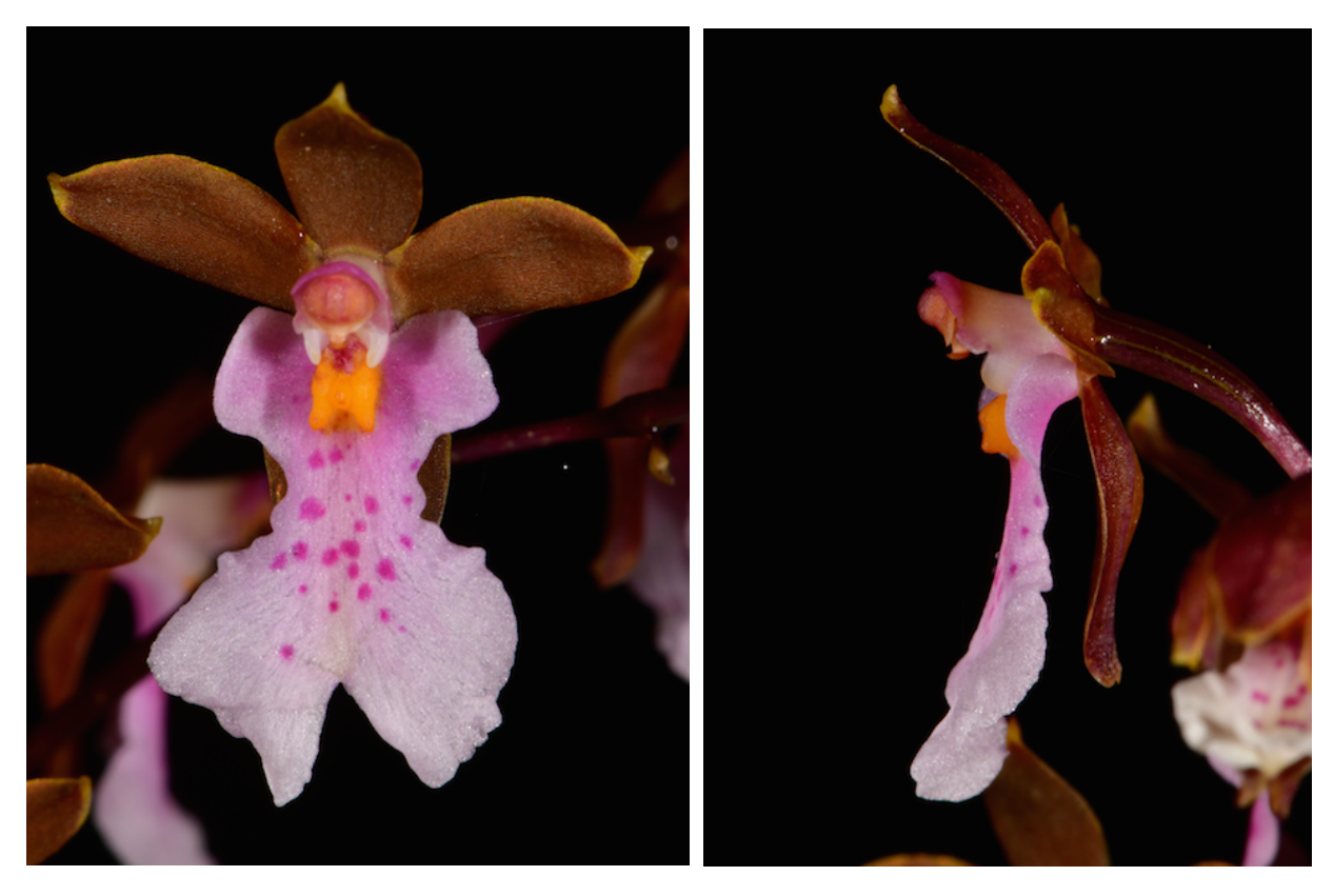
Caucaea colombiana Uribe-Velez, Sauleda & Szlachetko.