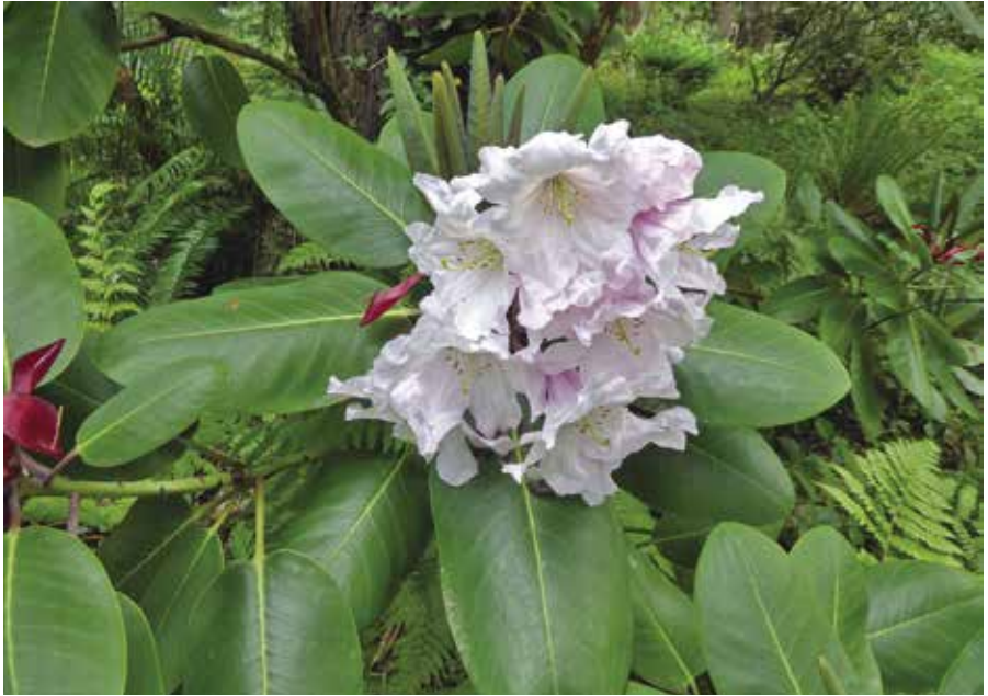
Figure 5: R. cardiobasis .