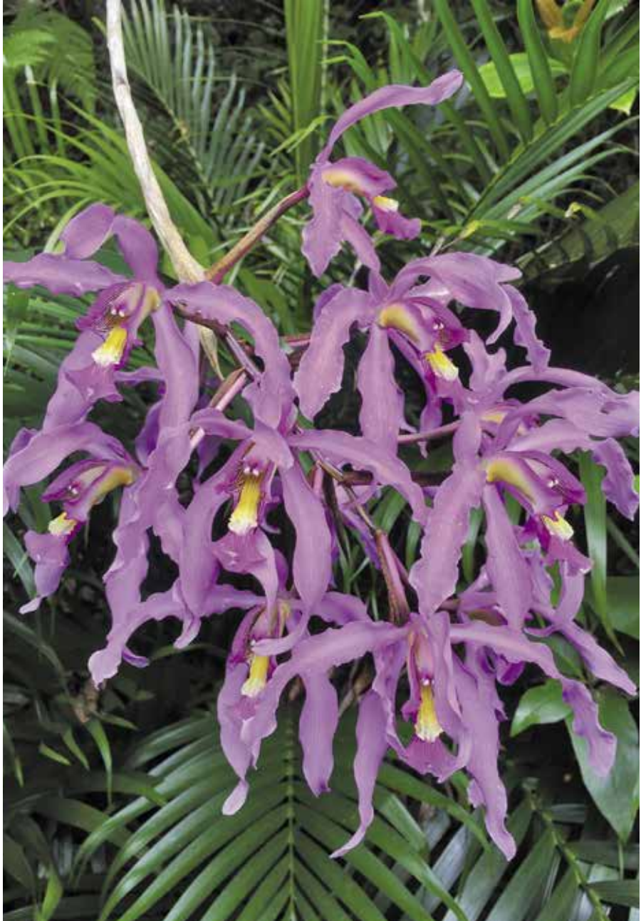
Figure 4: Schombergkia splendida .