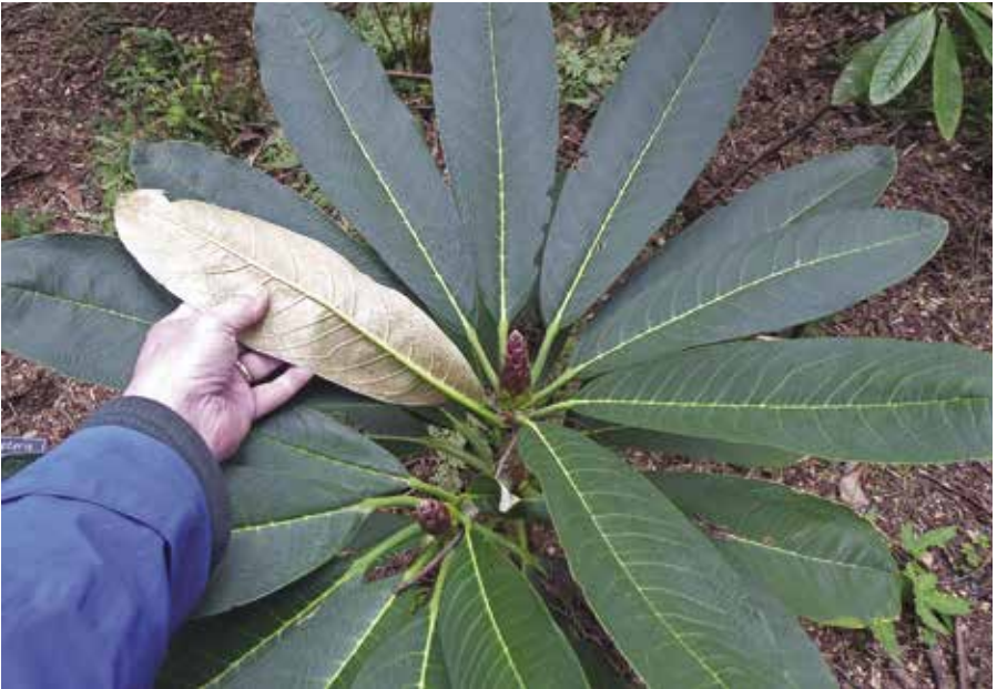
Figure 4: R. species nova (Subsection Falconera).