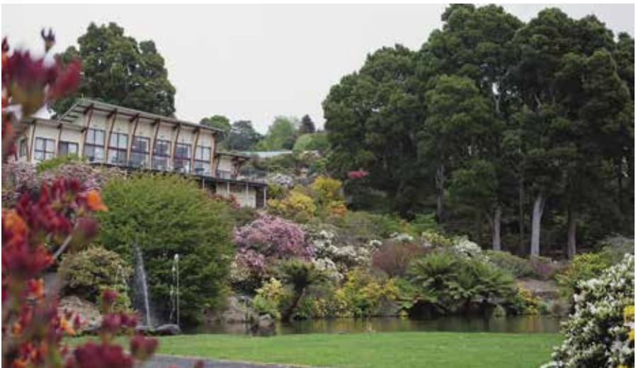
Emu Valley Rhododendron Garden: Looking up from Lake Grebep.

It is great to see the support being received for the conference Emu Valley will be hosting from 13 to 15 October 2023. Registration details will be out in the next couple of months. It will be a conference with a difference! Keep an eye out on emuvallayrhodo.com or contact the garden directly.