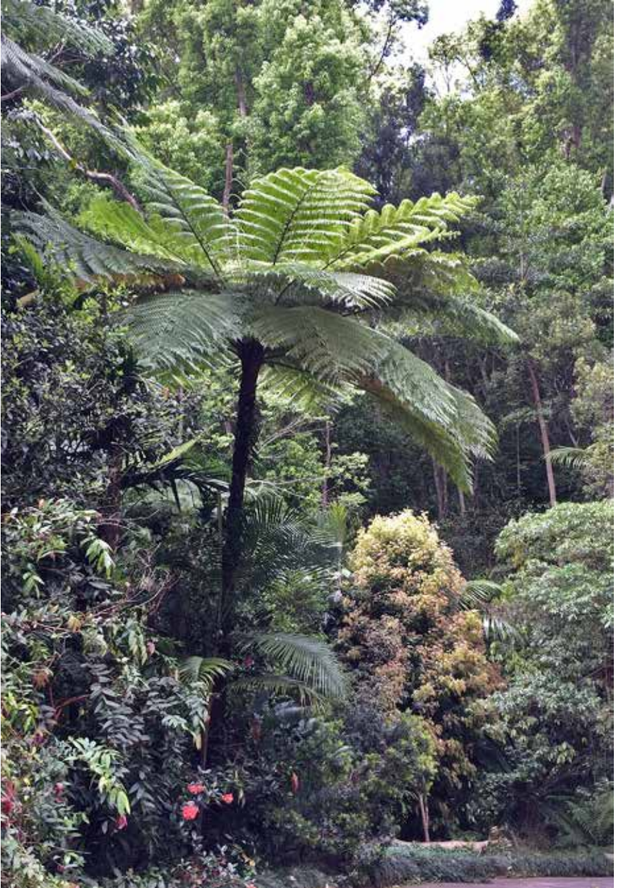
Figure 3: Cyathea cooperi .