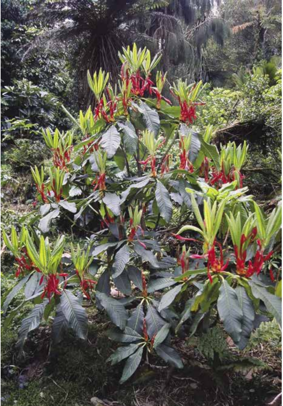
Figure 3: R. protistum 'Pukeiti' new foliage. 5.11.2004 05