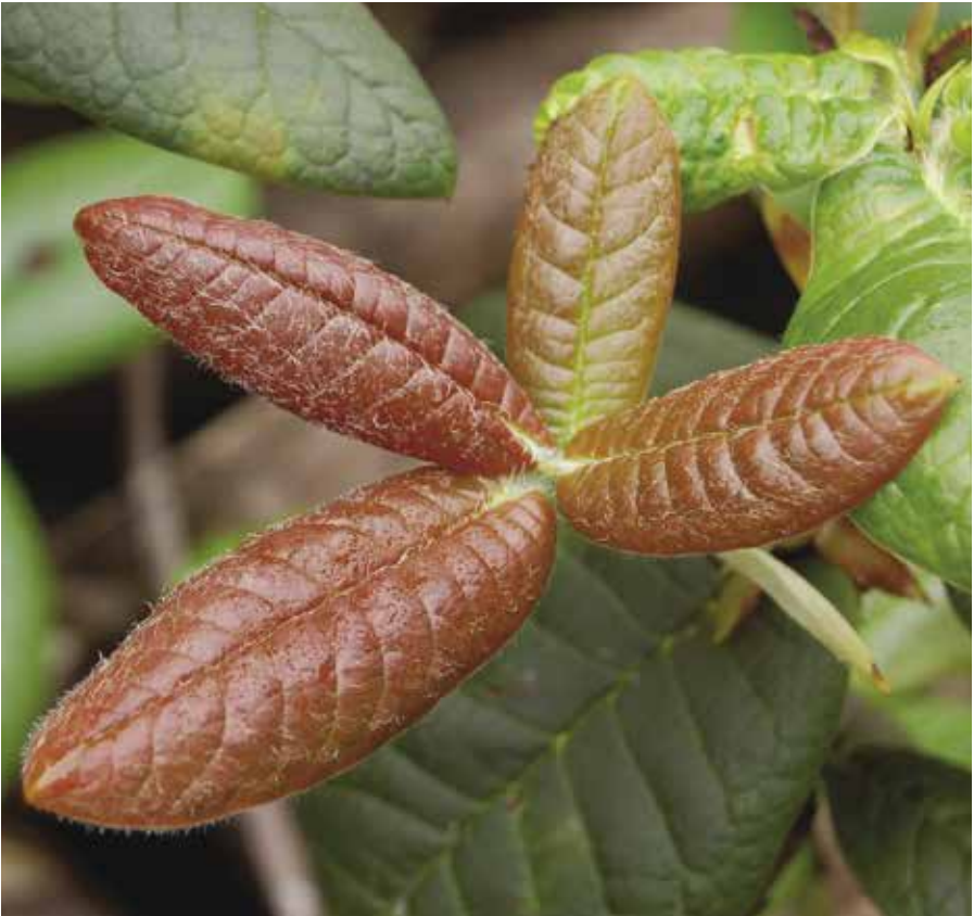
Figure 6: R. exasperatum foliage.

Alongside the now regular propagation excursions and the field trips to the South Island which have become a standard part of the program, in 2021 we