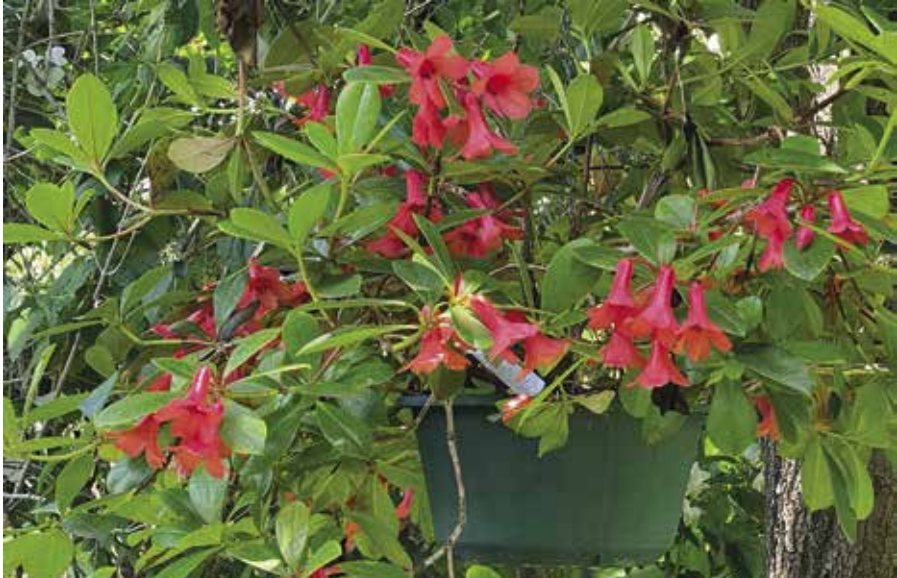
Above, Figure 3: R. viriosum , Thornton Peak form.