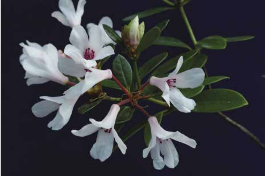
Figure 1: {[mac x rub] x [rub x pauc]} x rousei.