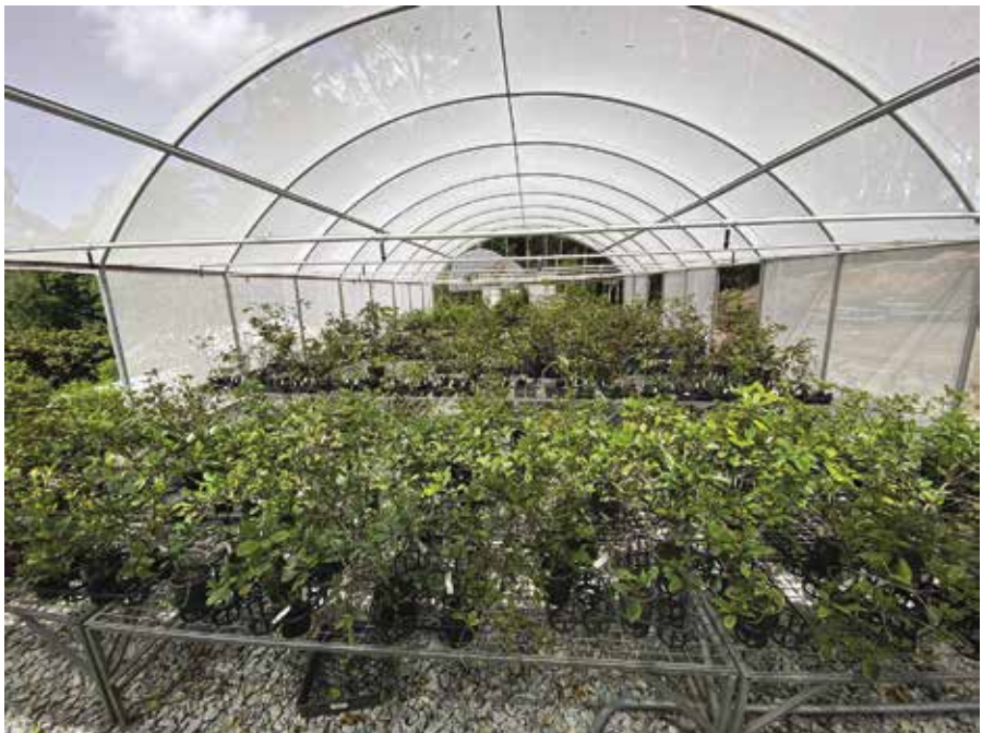
Figure 1: New shade house at Dandenong Ranges Botanic Gardens.

We have successfully propagated and hold 40 of the 47 discrete wild collected accessions of R. viriosum and R. lochiaie , and now hold approximately 300 potted plants. A permanent potted collection has now been established on a dedicated bench in the new shade house at Dandenong Ranges Botanic Gardens (Figure 1) comprised of plants propagated from wild collected cuttings. These plants form our reference collection that we can propagate and distribute plants for DRBG and other botanic gardens.