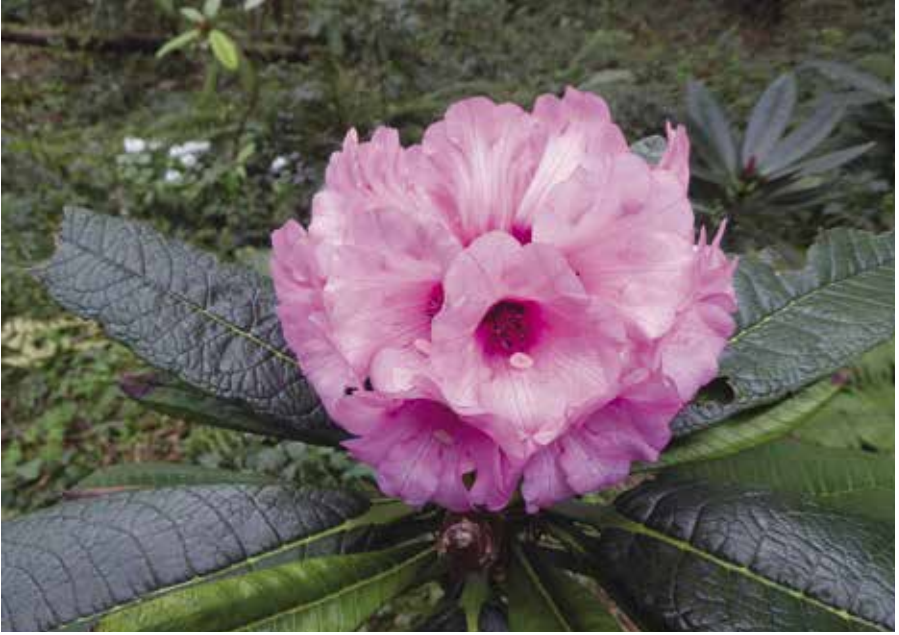
Figure 3: R. species nova (Subsection Falconera).