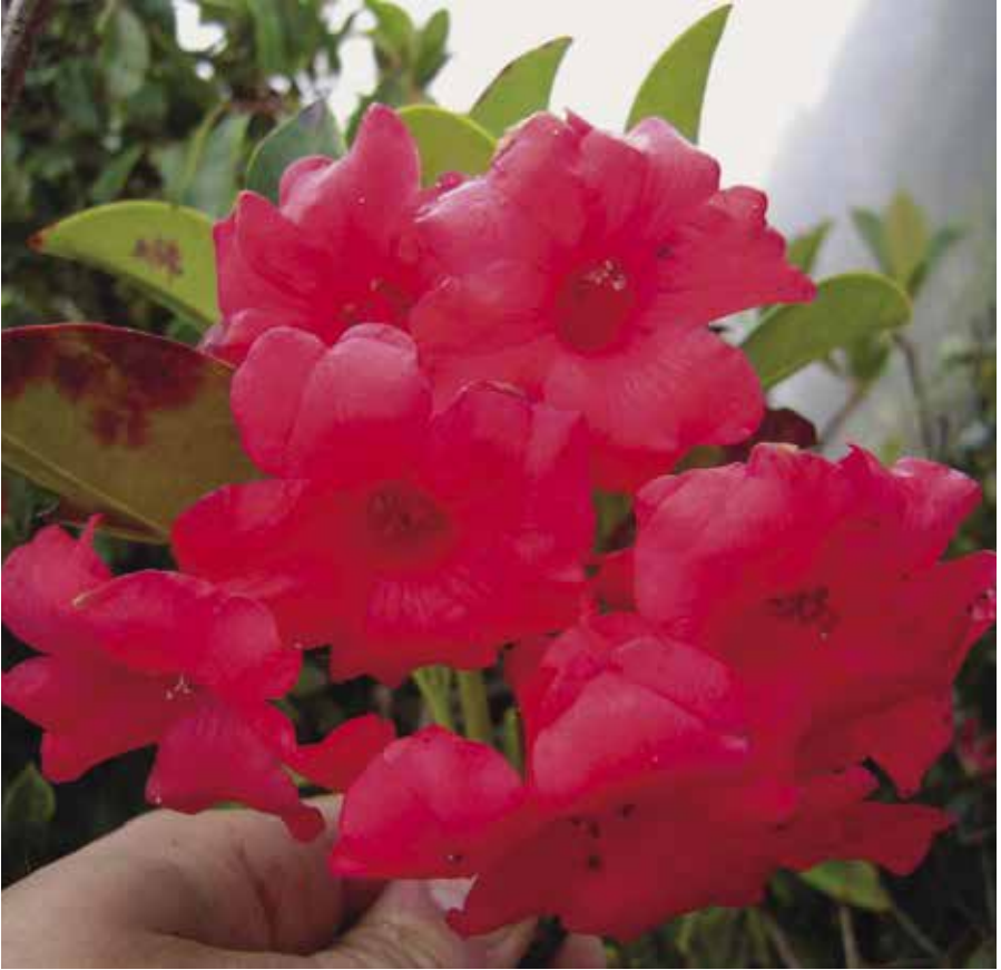
R. lochiaie Bell Peak form.