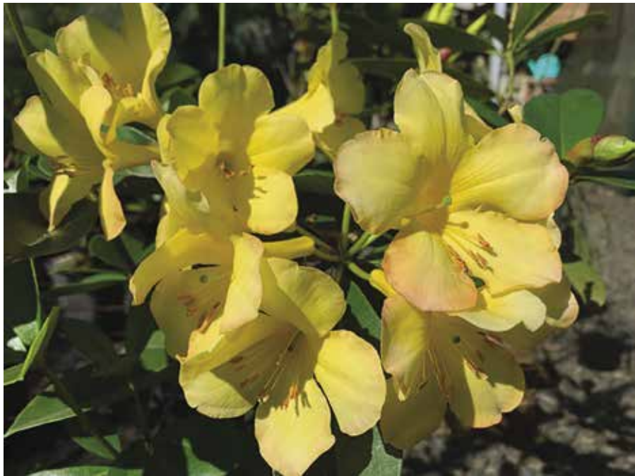
Above: R. 'Eddie's Choice'.