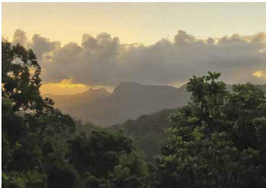
Figure 1: Sunset from Nicholl Scrub National Park.

The forests and waterways of Currumbin Valley had long been protective and productive lands for the Yugambah people. Timber getters were attracted to the valley by species such as red cedar, blackbean and silky oak, whilst graziers and farmers followed in their wake; bringing cattle and bananas to land where the forests once stood. Latterly, scenery, greenery, rock pools and solitude attracts ‘tree change’ residents, cyclists, eco retreat clientele and day tourists alike to the valley.