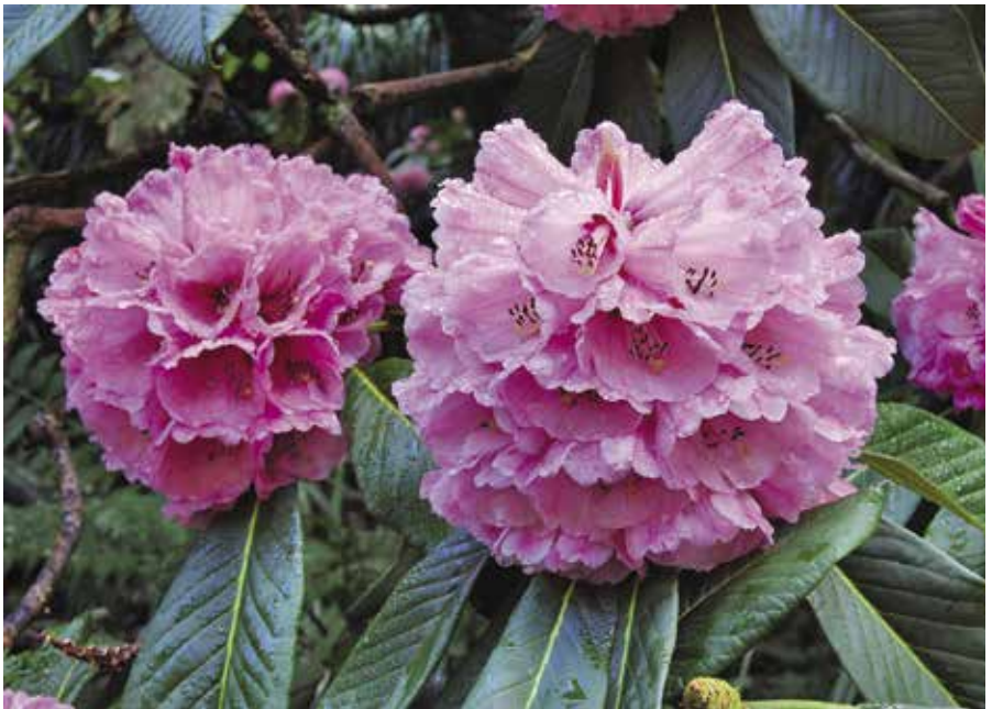
Figure 2: R. protistum 'Pukeiti' KW21498 08-05 025