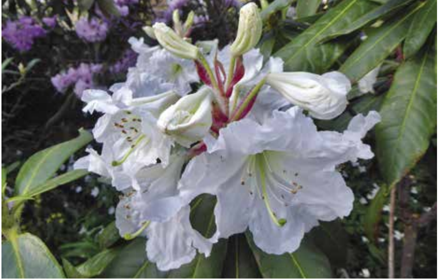
Figure 9: R. polytrichum ( R. chihsianum ).