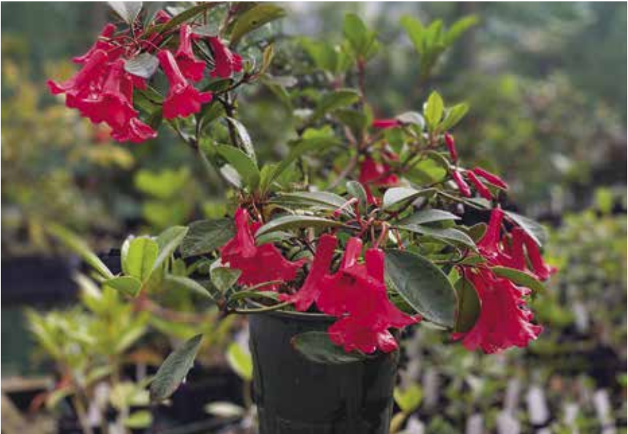
Figure 2: R. viriosum , Devil's Thumb form.

One of the more floriferous and vigorous forms of R. viriosum , with deep red pendulous flowers (Figure 2).