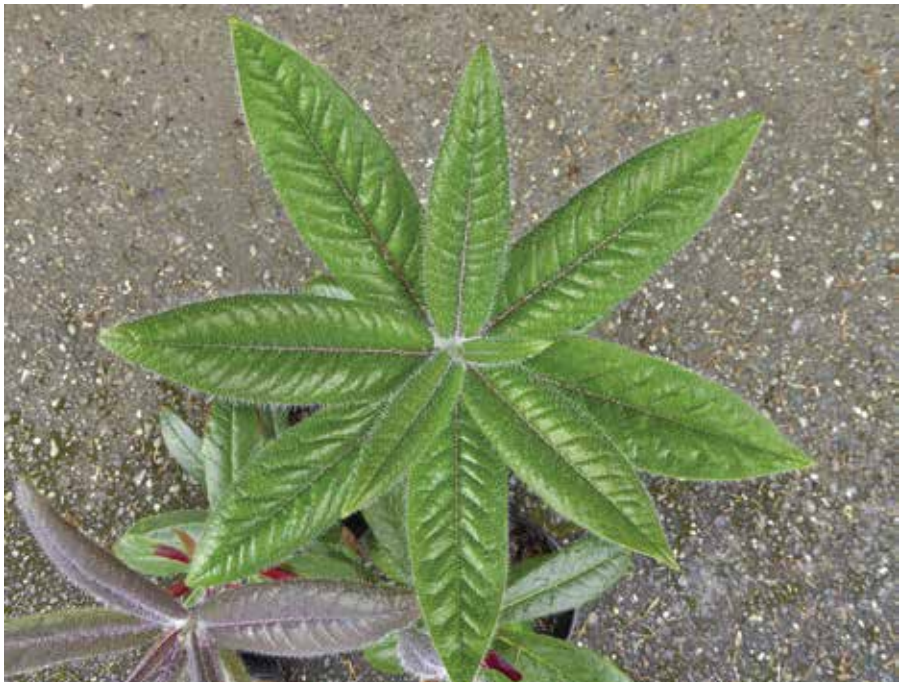
Figure 10: R. polytrichum ( R. chihsianum ).