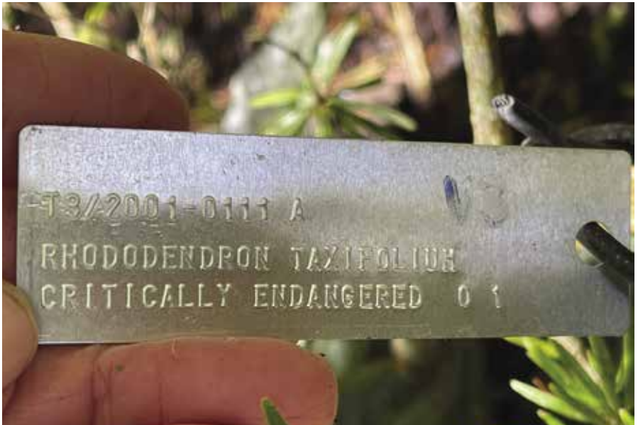
Figure 2: R. taxifolium label. An example of the management labels use at Pukeiti.