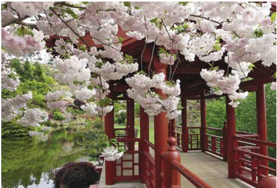
Emu Valley Rhododendron Garden: Cherry Blossoms by the Sea of Japan. see page 18.

I encourage everyone to support the journal, The Rhododendron , by contributing articles and sharing ideas—and subscribing. We all need to remind ourselves of the contributions made by Australians in the hybridisation of rhododendrons and actively encourage the sharing of Australian hybrids and knowledge between ourselves and others. Hybrids and species can so easily be lost forever if there is no ongoing propagation. We have two precious Australian endemic vireyas which are not well known by the plant buying public which we could promote by growing and supporting various botanical garden collections to display them. I urge rhododendron fanciers to consider attending a rhododendron conference interstate or overseas if they get an opportunity. We all seem to be nice people! I am hopeful that all branches will continue to attract persons with a passion for rhododendrons.