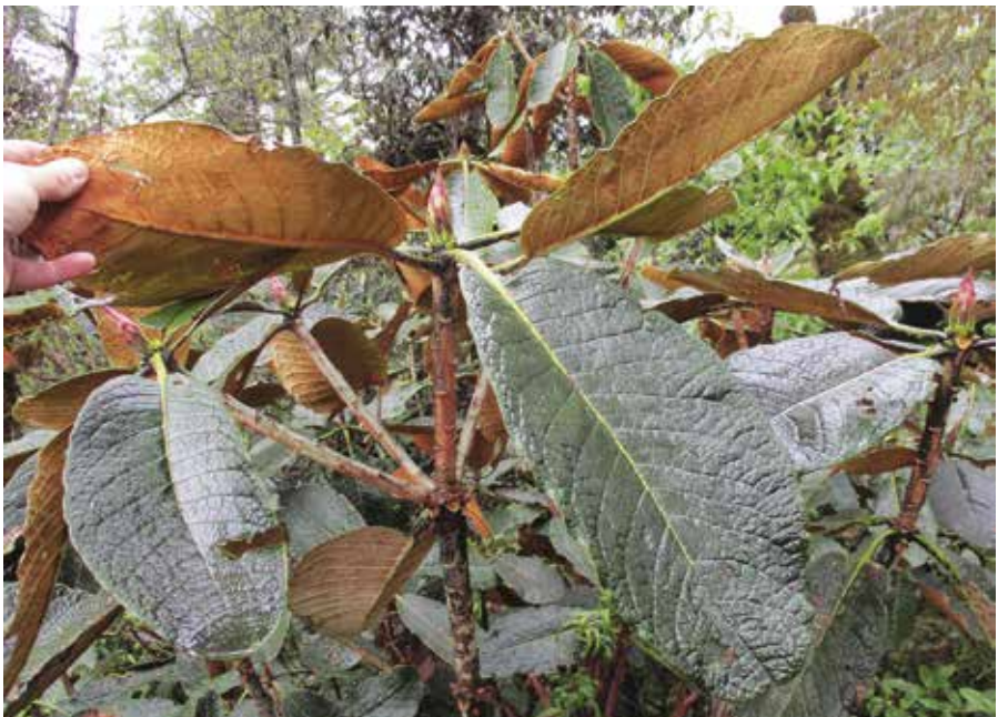
Figure 2: R. titapuriense (Subsection Falconera).