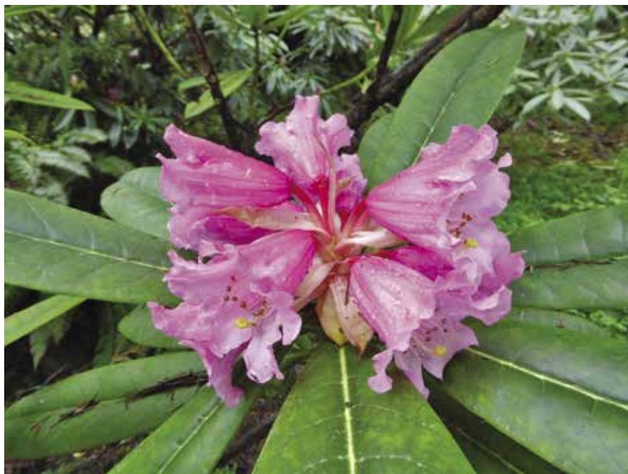
Figure 8: R. jingangshanicum .

summer. A stunning foliage plant, this is known only from the Leigong Shan of Guizhou.