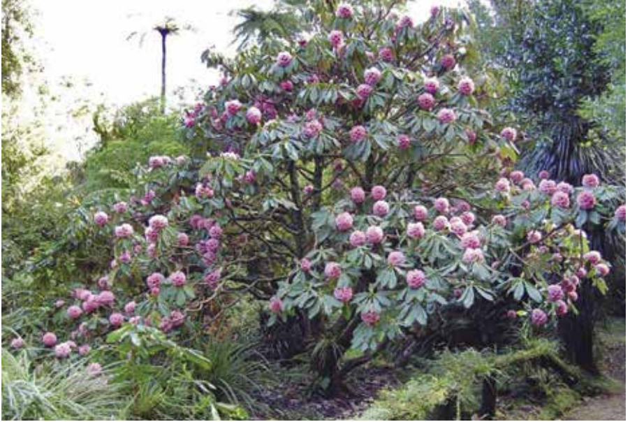
Figure 1: R. protistum 'Pukeiti' KW21498 08-05 021