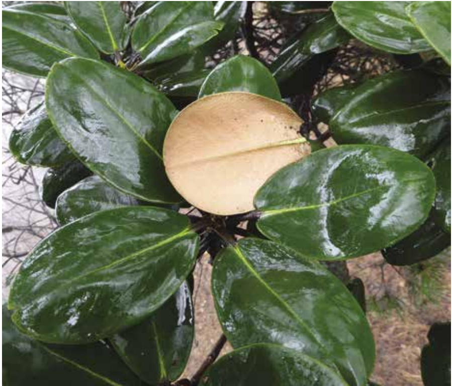
Figure 13: R. shanii .