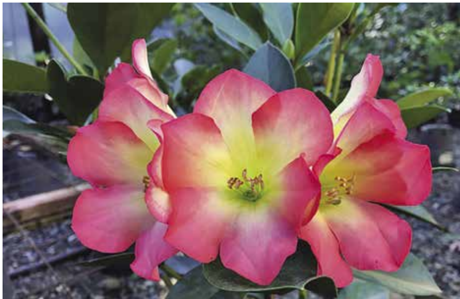
Below: R. 'Our Dorothy'.