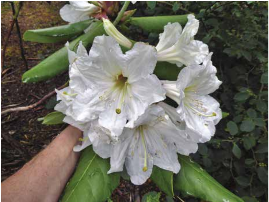
Figure 7: R. faithiae .

R. glanduliferum – Large and vigorous shrubs somewhat similar to auriculatum but with much larger and more glabrous leaves. The large fragrant white to pink flowers do not appear until mid-summer (Guizhou form) or late summer (NE Yunnan form). They are quite large and showy and range in colour from white to rose or pink and are fragrant. Native to widely scattered locations in northeastern Yunnan and adjacent N. Guizhou. Note: