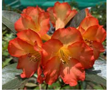
Above: R. 'Touch the Sun'.