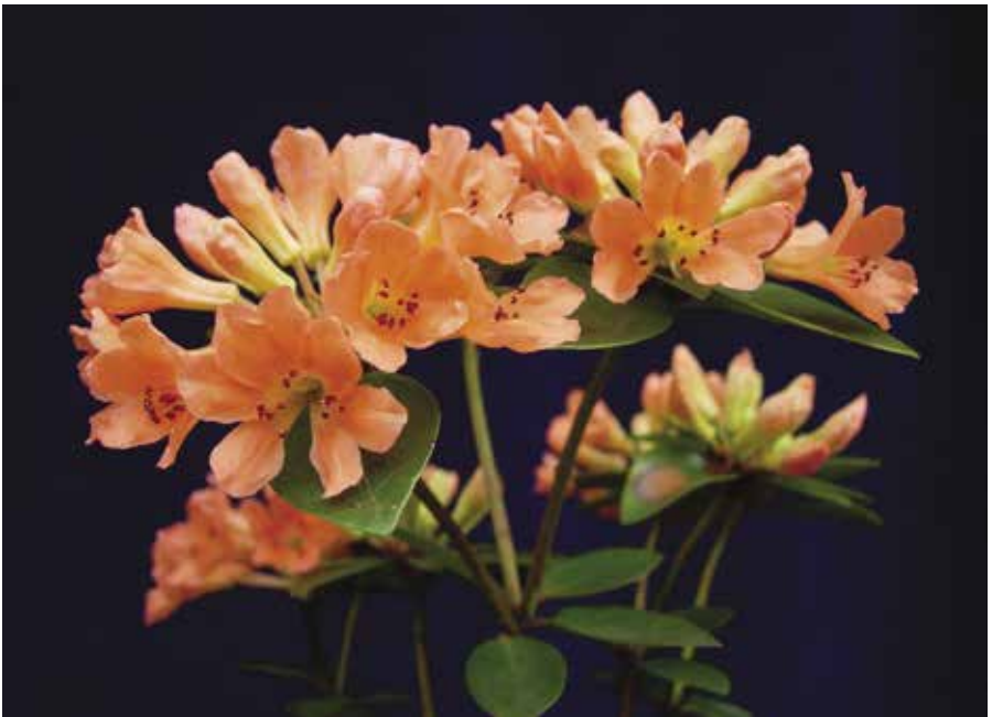
Figure 2: polyanthemum x (mac x rub).