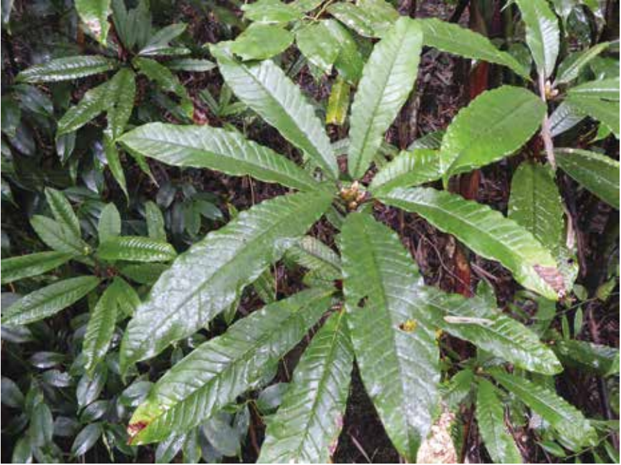
Figure 12: R. mengstzense .

of a feel of Irrorata (including the distinguishing red punctate hair bases on the lower surface of the leaves unique to this subsection) to me which is why I have placed it here.