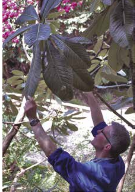
Figure 3: Doug Thomson examining indumentum , South Island collection.

This momentum early on in the project continued into 2020 which, despite the Covid pandemic, seemed as busy for the project team, If not busier.