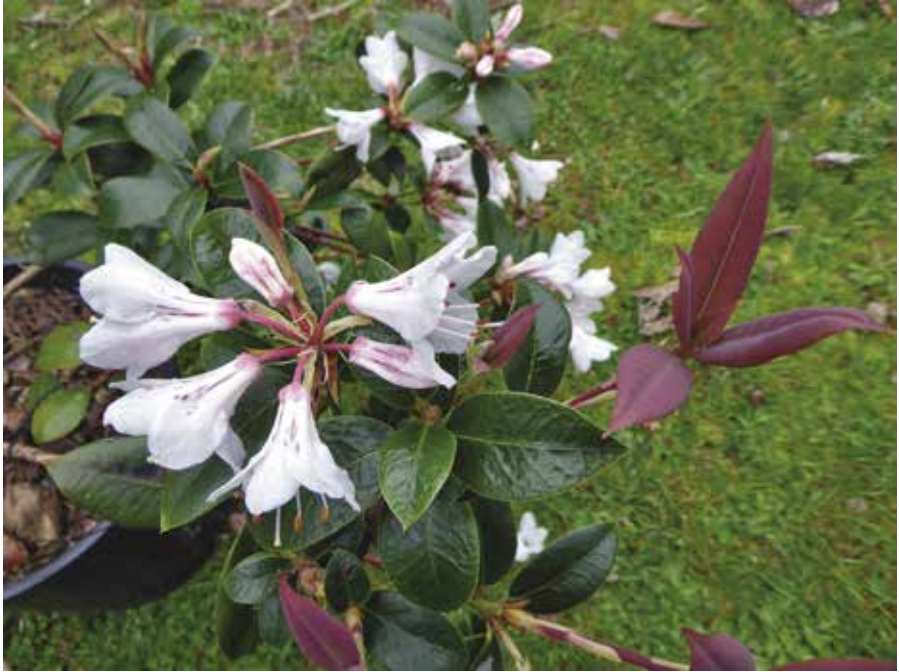
Figure 14: R. baihuaense .

R. tephropeploides – This is a new taxon from the highest mountains in northern Vietnam. It has very scaly, grey-green foliage and a dense mounded habit with pale pink flowers in mid-spring. It appears to be, and should be, quite hardy.