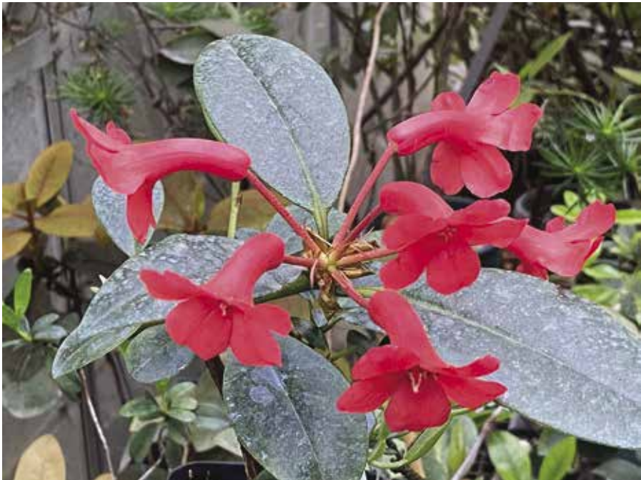
Below, Figure 4: R. lochiaie , Bellenden Ker form.