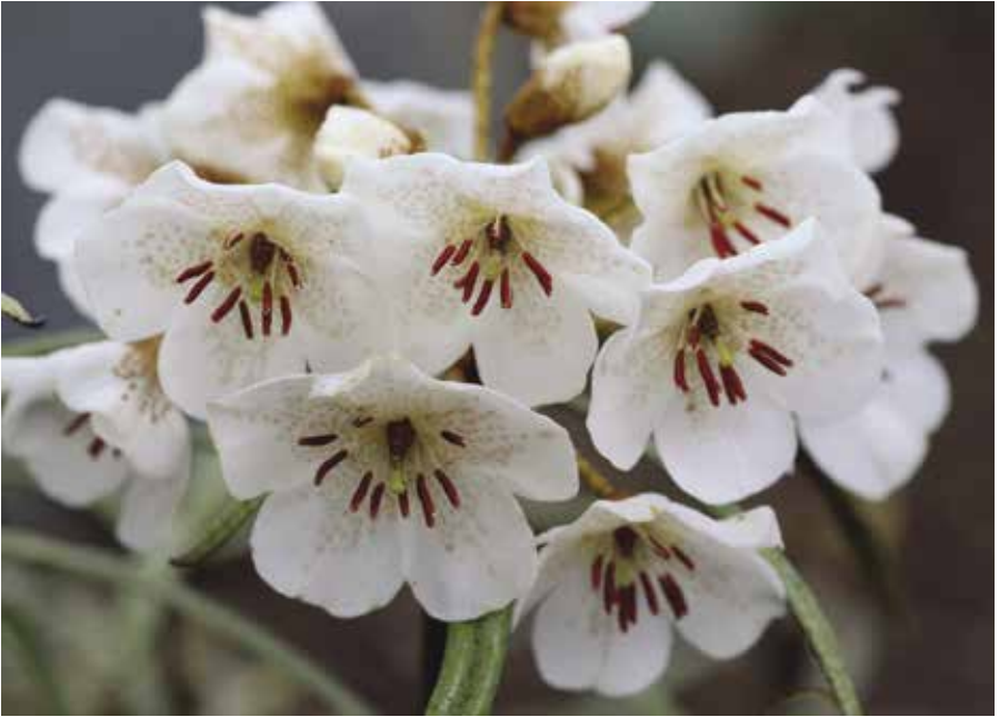
Figure 1: R. himantodes at Pukeiti, a vireya species distributed to other NZ public gardens.