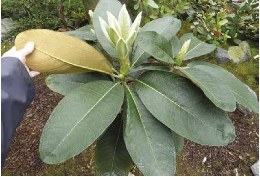
Figure 1: R. mechukae (Subsection Falconera).