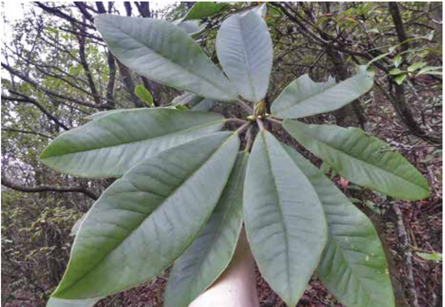
Figure 6: R. species nova (Guangxi province).