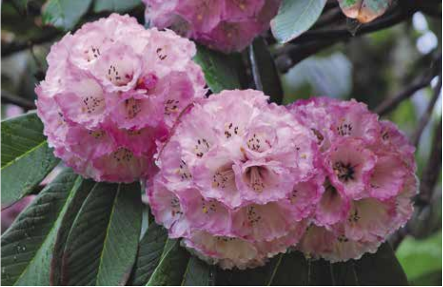
Figure 4: R. protistum hybrid sdgl. V. of Giants, 22.8.20 03.

whole group of them could sit on the forked branch at the base of the largest specimen. Unfortunately there was no sight of any flower even though it was the known flowering time, so the plantsmen and scientists had to scramble around in the leaf litter below to find old seed capsules. They were fortunate to find some and after photos were taken it was time for the 20km trek back to the village, arriving about 7.30pm for an arranged dinner and then into the jeeps back to Tengchong by 1.30am next day and then back to Sydney.