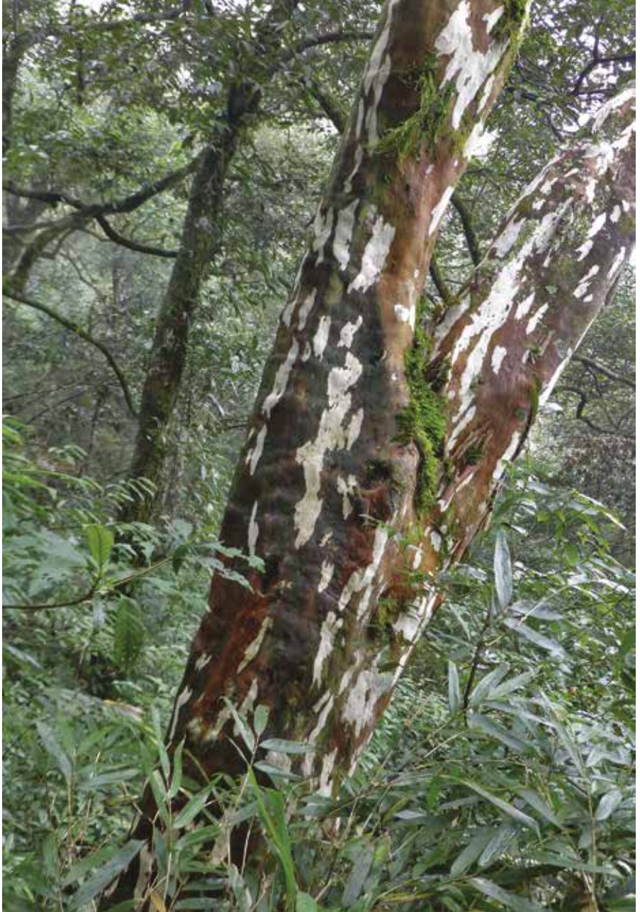
Figure 11: R. guihainianum.