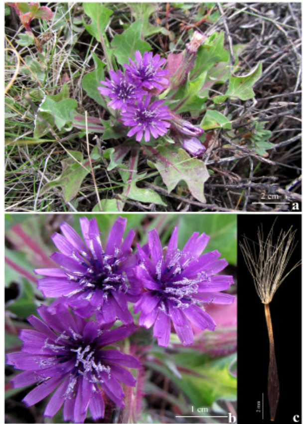
Fig. 1. Melanoseris qinghaica (S.W.Liu & T.N.Ho) N.Kilian & Ze H.Wang: a. Habit; b. Synflorescences enlarged; c. Achene.

Perennial herbs with milky latex, 4–16(–40) cm tall. Root fleshy, 6–8 mm diam. Stems branched from base or often simple at base and branched above 1/3 of length; branches often sub-equal, ±corymbose, ±erect, gray or purple-hairy. Basal leaves in rosette, petiolate; petioles flattened, winged, 1–3.5 cm long (petioles of lower leaves longer, 2–3.5 cm), broadened at the base, ±semialexicaul; lamina elliptic-oblong or oblanceolate, (1–)3.5–6(–9) × (0.4–)1–2.2(–3.5)cm, apex acute, margin shallowly lobed or sometimes lyrate-pinnatisect (lateral lobes 2–4 pairs, ovate, triangular-ovate), entire or denticulate, sparsely and distinctly ciliolate, base cuneate, gradually narrowed and winged