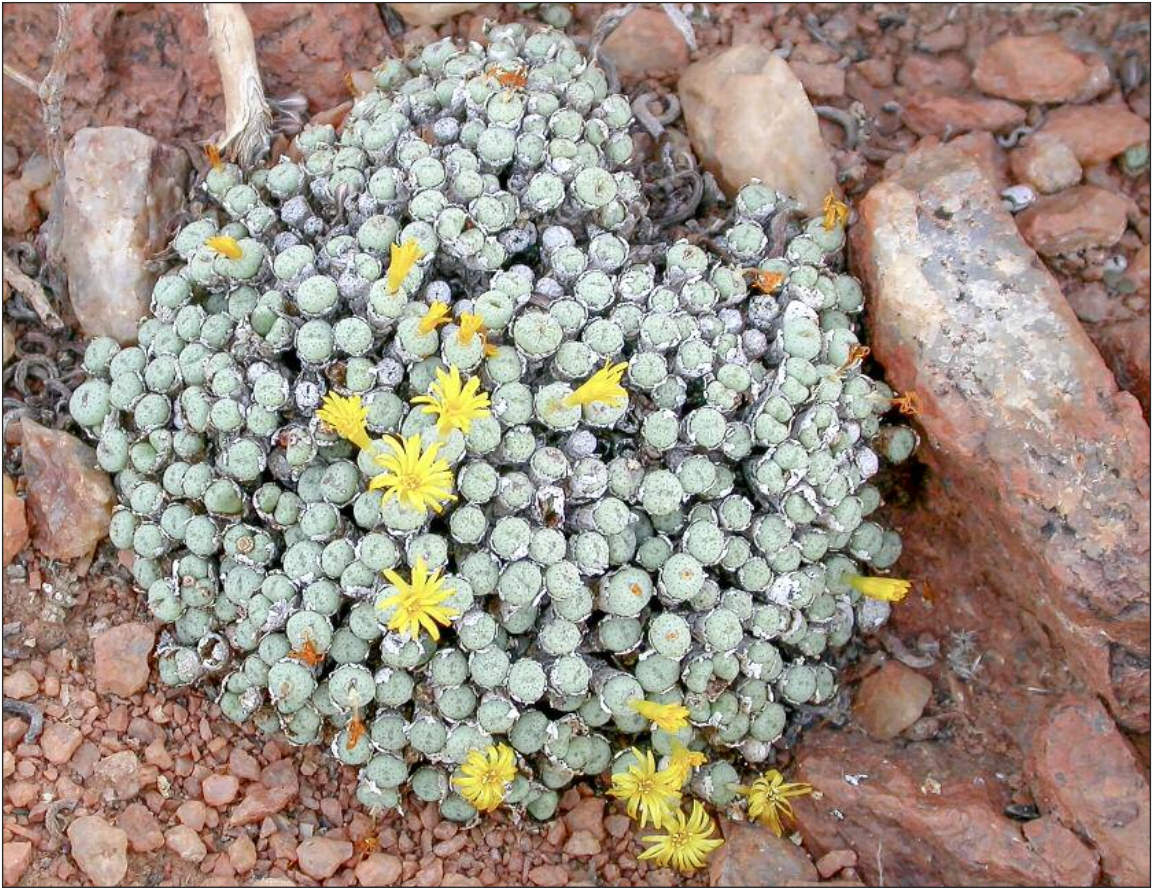
Figure 7. An extremely large (but not atypical) cluster of C. flavum subsp. novicium var. novicium growing in deep shade a few kilometres to the east in Umदाus. By contrast, var. kosiesense has not been observed to grow in such low light conditions or reach this size of plant.

subsp. flavum . A notable exception to this is the old tetracarpum form which inhabits the western extent of Bushmanland. In this new taxon, idioblastic spots occur frequently across the epidermis and are quite prominent, despite the presence of a dense layer of trichomes over the body (Figures 2A–C).