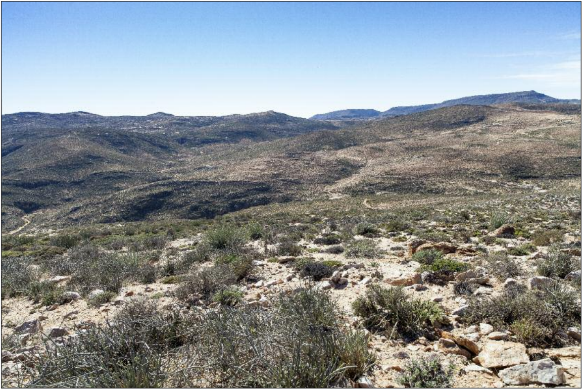
Figure 3. The general landscape where C. flavum subsp. novicium var. kosiesense was found. Other succulents present in this habitat include Adromischus alstonii , Crassula namaquensis subsp. namaquensis , Sarcostemma viminale , Pelargonium crithmifolium and Monsonia crassicaule .

formed using the Emitech K850 critical point drier (Quorum Technologies Ltd., East Grinstead). This approach preserved both cell structure and the epidermal wax coating of the highly succulent tissues of Conophytum .