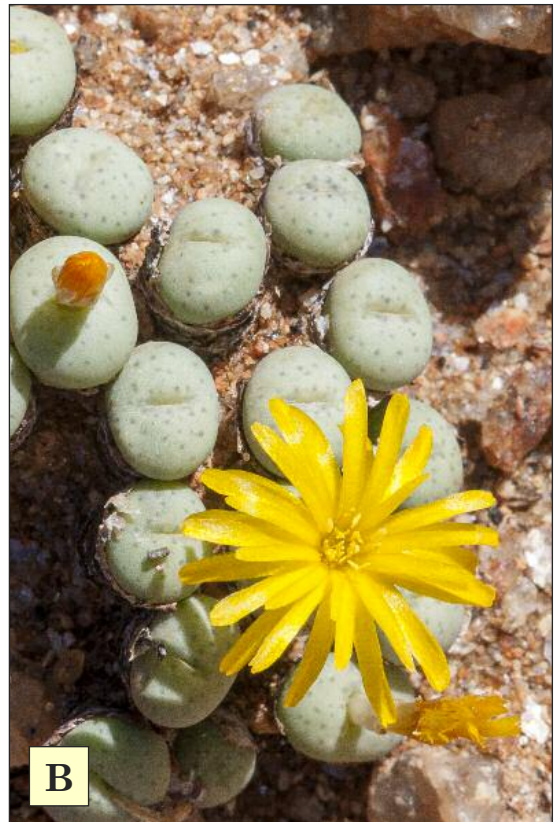
Figure 4. A comparison of the flowers of (A) C. flavum subsp. novicium var. kosiesense and (B) C. flavum subsp. novicium var. novicium (pictures taken in habitat, April 2016).

there were no signs of flower buds or flower remnants so we revisited the site the following April (when the vast majority of Conophytum species flower) to specifically compare these plants with a nearby stand of C. flavum subsp. novicium (see below and Figure 3).