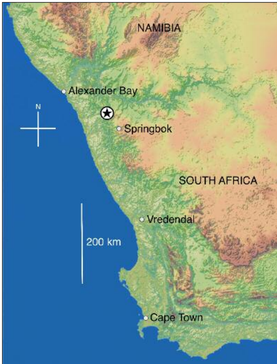
Figure 1. Map of southwestern Africa showing the location of C. flavum subsp. novicium var. kosiesense .