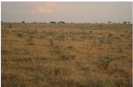
Fig. 4. Shrubs mixed with grasses in Lomejan Village in Kotido District

lands, ten plots of 5 \times 5 m<sup>2</sup> in the thicket and shrublands, and twenty plots of 1 \times 1 m<sup>2</sup> in the grasslands. Onsite identification of available grass and browse species was conducted in each of the plots. Grass and browse species that could not be readily identified were safely stored in a plant press and taken to Makerere University herbarium for further identification.