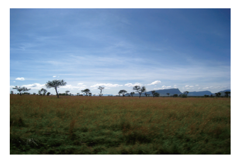
Fig. 3. Open grassland at Nakicumet Napak District