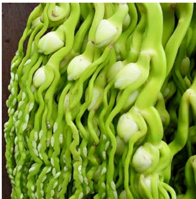
Top: Inflorescence. Bottom: New inflorescence showing both female (large) and male (small) flower buds.