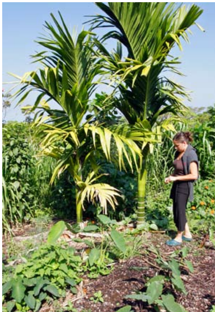
Left: Betel nut palms serving as trellis for Piper betle . Betel nut palm research center in Kerala, India. Right: Young palms growing on the border of a vegetable garden. Kona, Hawai'i.