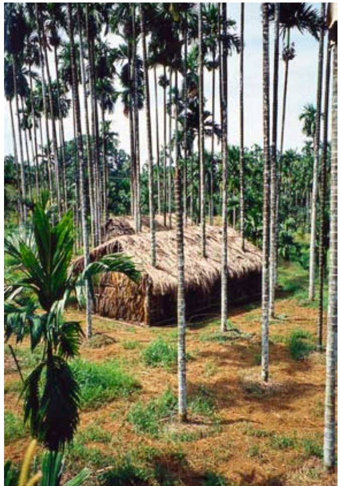
House made from betel nut palm in grove; all parts of the house are made out of betel nut palm, including trunks for posts and beams. Photo taken at a betel nut palm research center in Kerala, India.

The fresh or dried endosperm of the seed is the betel nut of commerce. The betel quid (wad of chewable ingredients) includes the fresh or dried seed of betel nut, a fresh leaf of betel pepper ( Piper betle ), a dab of slaked lime, and various flavorings (cutch, cardamom, clove, tobacco, or gambier). Eight closely related alkaloids are responsible for the stimulant effect; the alkaloid levels are highest in the unripe fruit and this may be why some cultures prefer the unripe nuts for consumption: they give a better buzz. Note that when chewed for the stimulant effect betel quid is never swallowed and the copious saliva resulting is spat out. However, when used medicinally betel nut may be taken internally. One of its effects is a powerful stimulus to intestinal peristalsis; betel nut is used to treat a long list of ailments. The Indian pan (pronounced pon) is a common