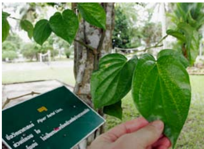
Leaves of betel vine ( Piper betle ).

Betel nut palm is ideally suited for tropical everwet climates (humid tropical lowland, maritime tropical, subtropical wet, tropical wet forest) with high rainfall that is evenly distributed throughout the year. In areas with a seasonal dry period, irrigation must be provided to assure evenly distributed moisture year-round. These palms are unable to