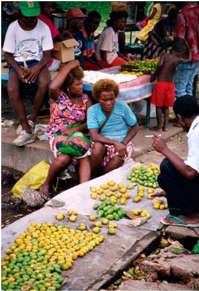
Left: Betel nut for sale in main market, Honiara, Guadalcanal, Solomon Islands. Right: Fruits for sale, Rayong, Thailand.