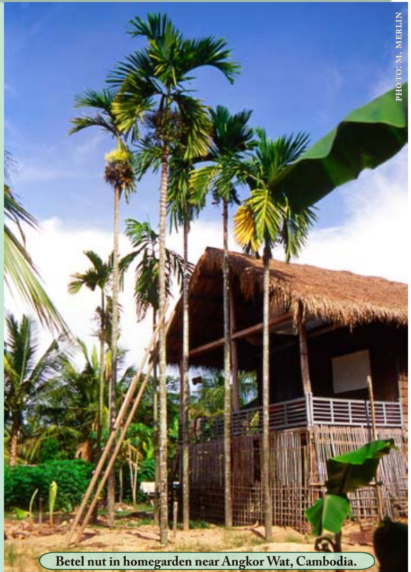
Betel nut in homegarden near Angkor Wat, Cambodia.

Invasive potential Although it can spread by seed, it is not considered to be an invasive species.