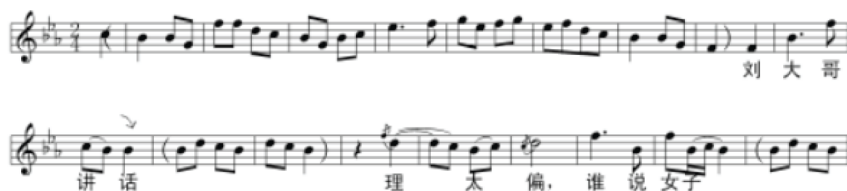
Example 1: Music score of Yu Jv Mulan

Starting with a dramatic bass, the opera presents through the singing that women are inferior to men. While performing, the singer is dressed in man’s clothes while singing in a low pitch, in total contradiction to portrayal of the feminine in ancient China.