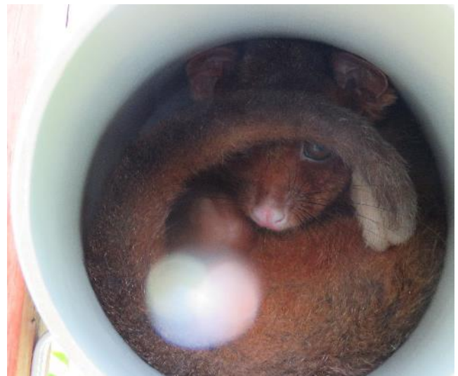
Bee Home 17 – Terry Hanson Reserve Wetland Ringtail Possum Pseudocheirus peregrinus