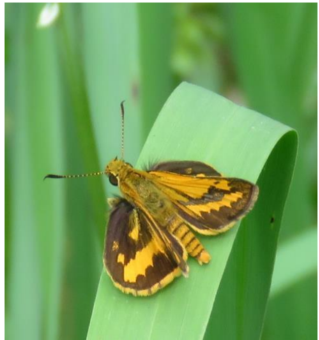
Green Grass-dart Ocybadistes walkeri Potential pollinator Terry Hanson Reserve