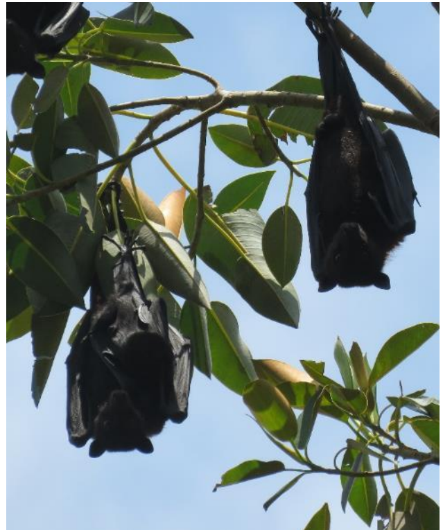
Black Flying Fox Pteropus alecto Pollinates eucalypt species Seventh Brigade Park