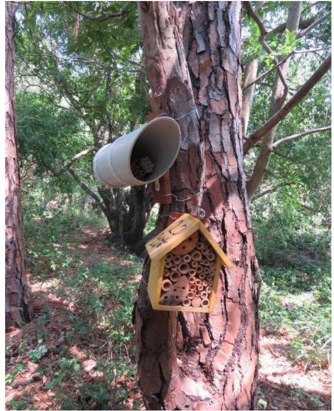
Bee Home 20 – Terry Hanson Reserve Area B