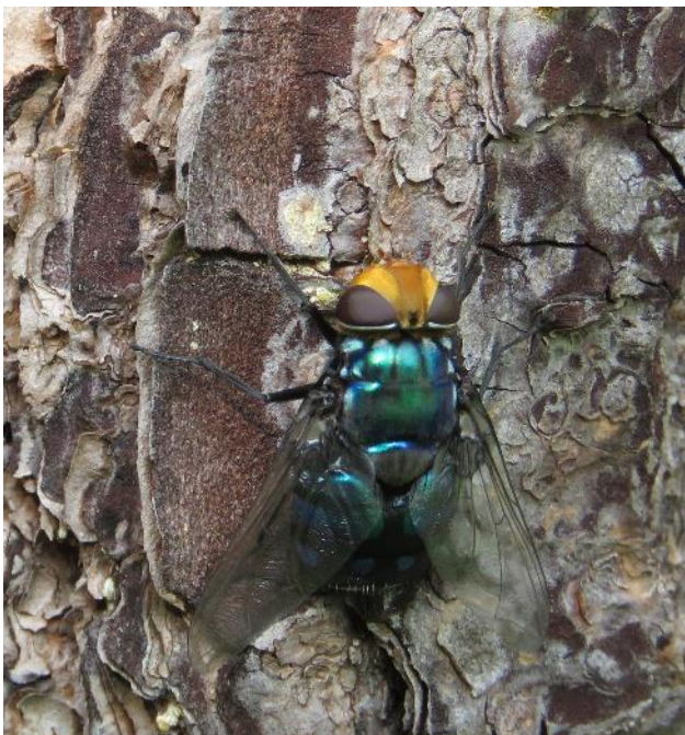
Golden Head Rutilia Fly Rutilia argentifera Potential pollinator Terry Hanson Reserve