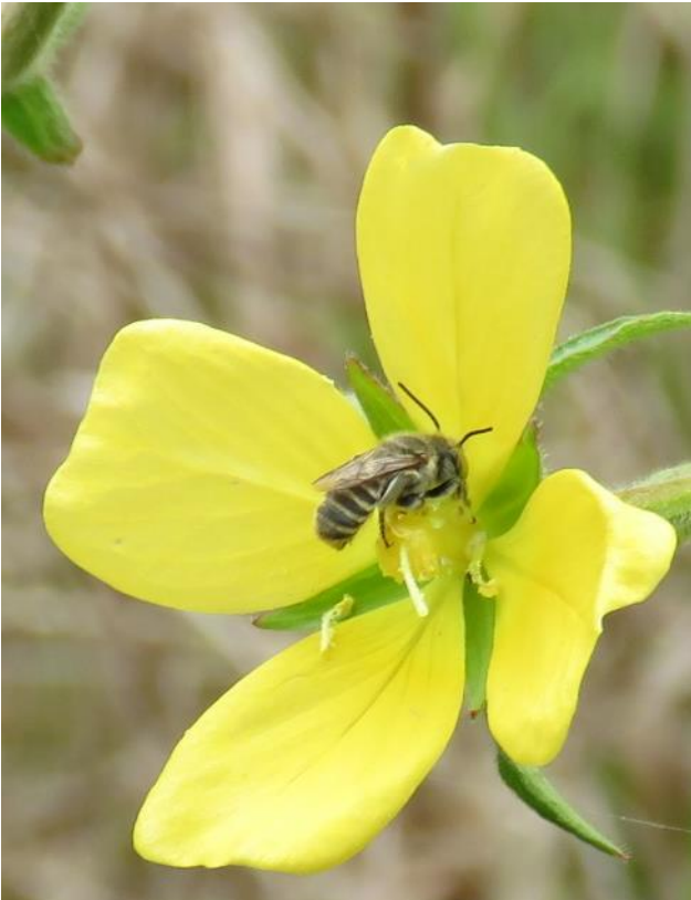
Sweat Bee Lasioglossum sp. Terry Hanson Reserve