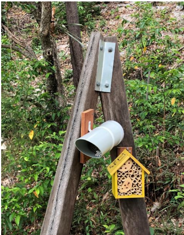
Bee Home 23 – Crosby Road Bushcare Pollinator Link® Display Area