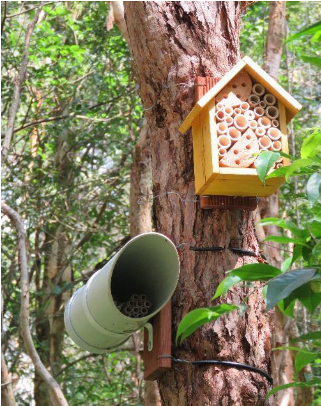
Bee Home 14 – Seventh Brigade Area B