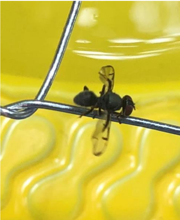
Stingless Native Bee Tetragonula sp. Colony Bees Crosby Road Bushcare