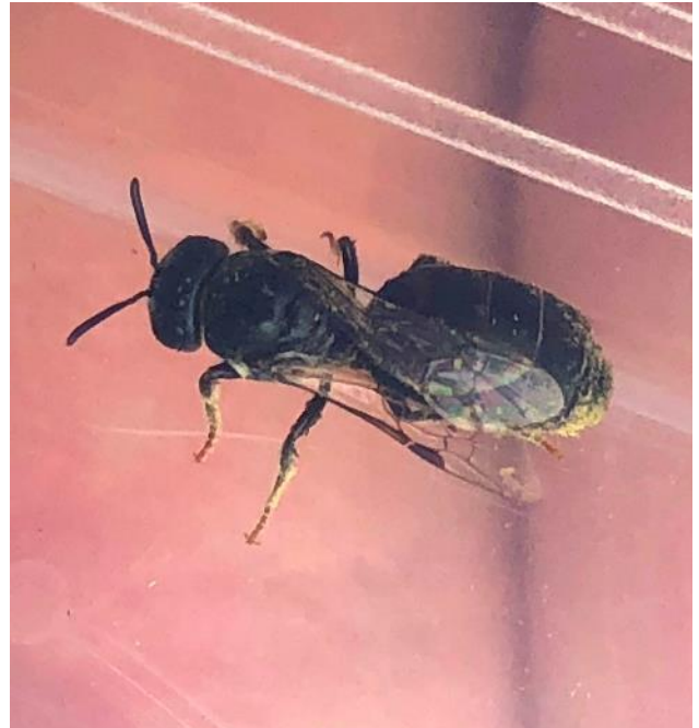
Hylaeus Bee Hylaeus sp. – covered in pollen Crosby Road Bushcare