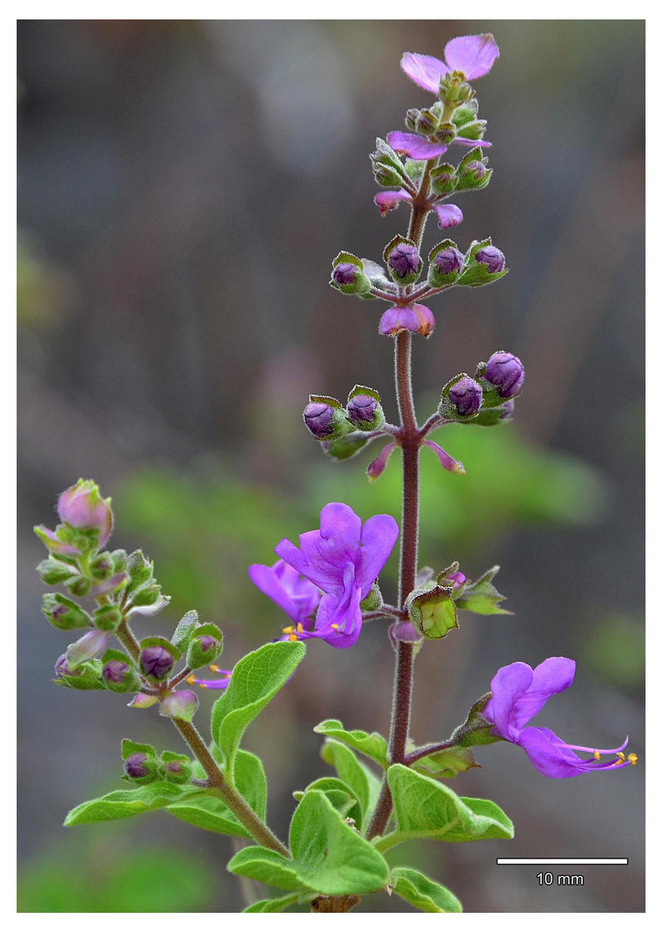
FIGURE 3. Ocimum sebrabergensis. Inflorescences.