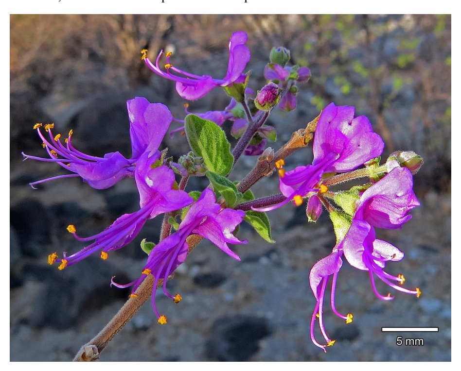
FIGURE 4. Ocimum sebrabergensis. Flowers.

Phenology: —Flowers were recorded during midsummer (November to January).