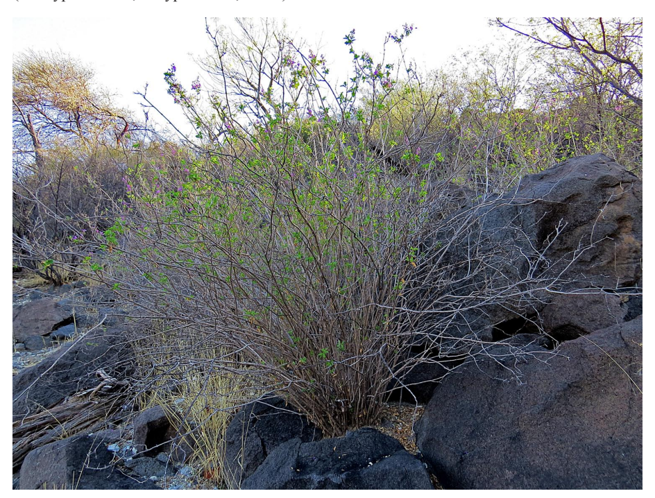
FIGURE 1. Ocimum sebrabergensis. Plant in natural habitat among greyish black boulders of anorthosite, growing as a shrub about 1.8 m tall.

Type: —NAMIBIA. Kunene Region: Zebra Mountains, hill south of Okau, between boulders, 1713BC, 980 m, 12 November 2014, Swanepoel 339 (holotype WIND!; isotypes PRE!, PRU!).